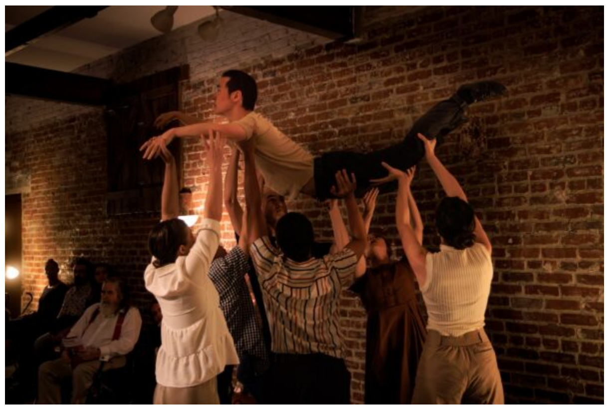
Re:born Dance Interactive.

In November, New Zealand hosts the International Peace Research Association (IPRA) biennial conference and SoCal-based Re:born Dance Interactive has been invited to attend and perform. Under the banner, Dance for Peace , the company hosts a gala to help fund getting to the conference, with a performance, silent auction, and refreshments. Academy of Dance, 2431 N. Tustin Ave., #Q, Santa Ana; Sat., July 12, 7 pm, $75. Events | Reborn Arts.