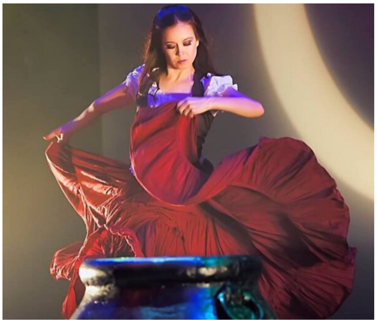
Leigh Purtill Ballet Company.

Set in an imagined 1885, the Circus of Worldly Wonders, a Steampunk Ballet from Leigh Purtill Ballet Company is populated with mechanically enhanced swans, magicians, and other family-friendly circus acts. Landerman, Auditorium, 4491 Cornishon Ave., La Canada-Flintridge; Sat., July 12, 7 pm, Sun., July 13, 4 pm, $33.85-$44.52. Eventbrite.