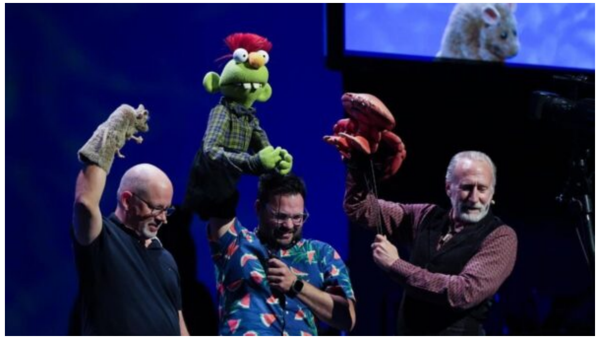
Brian Henson Presents - Puppet Up! Uncensored.