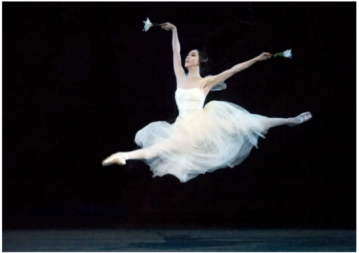
Hee Seo from American Ballet Theatre.

Pasión Flamenco & Tango at Electric Lodge, 1416 electric Ave., Venice; Sun., July 20, 3 pm, $30. Eventbrite.