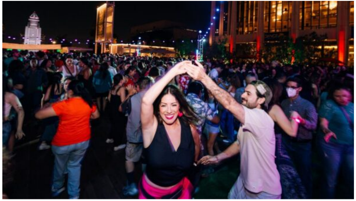
Dance DTLA.