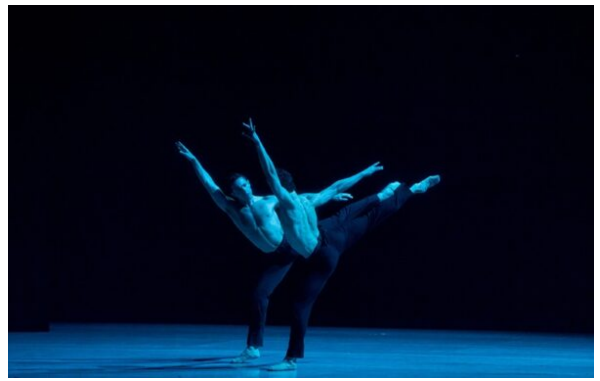
Los Angeles Ballet.