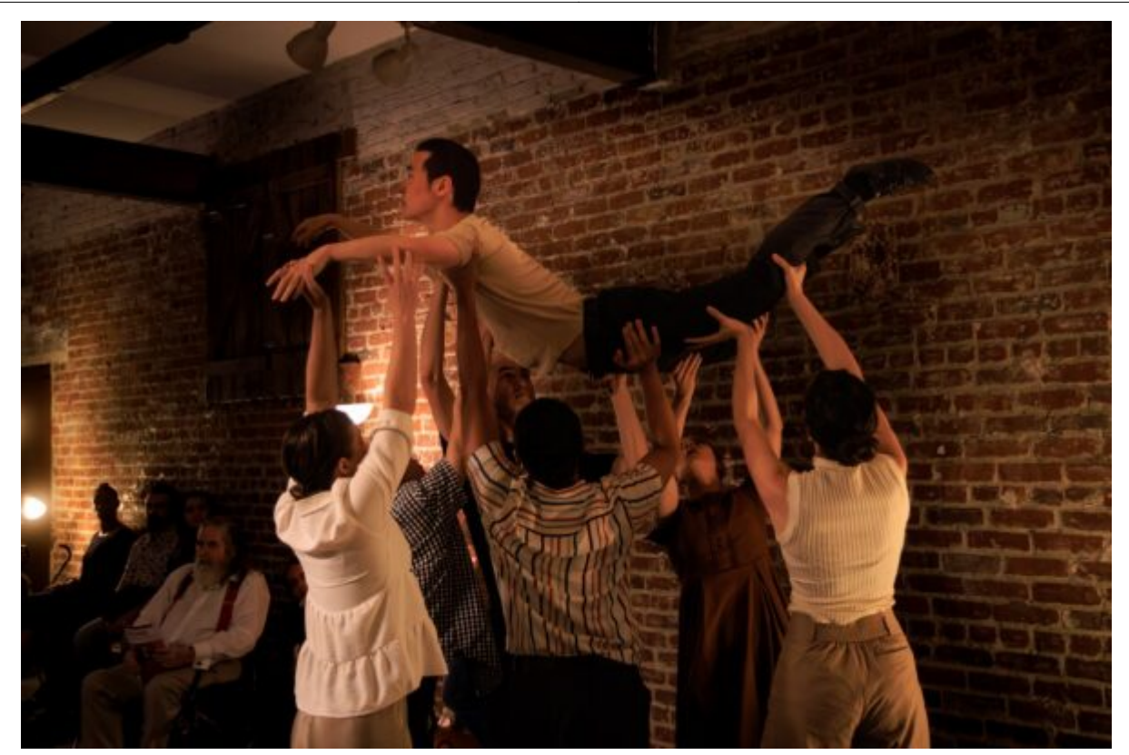
Re:born Dance Interactive.

Re:born Dance Interactive — Home at the Odyssey Theatre, 2955 S. Sepulveda Blvd., WLA; Fri.-Sat., Jan. 31-Feb. 1, 8 pm, Sun., Feb. 2, 2 pm, $25. Odyssey Theatre.