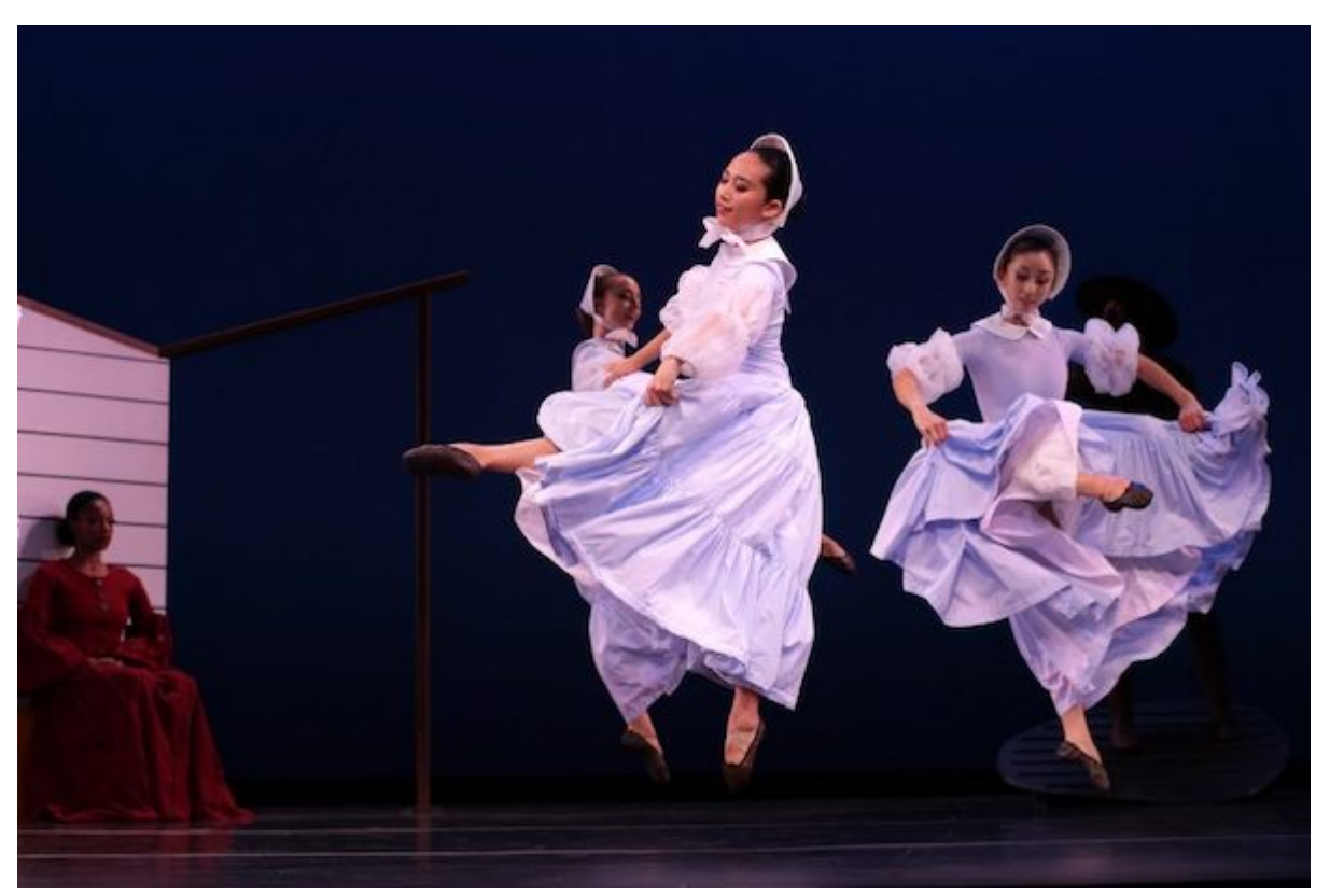
The Martha Graham Dance Company.

collaboration with a dancer and a musician. A fitting prelude to this years's Laguna Beach Dance Festival. Laguna Art Museum, 307 Cliff Dr., Laguna Beach; Sun., Jan 26, 4 pm, $30, $10 students. Laguna Beach Dance Festival.