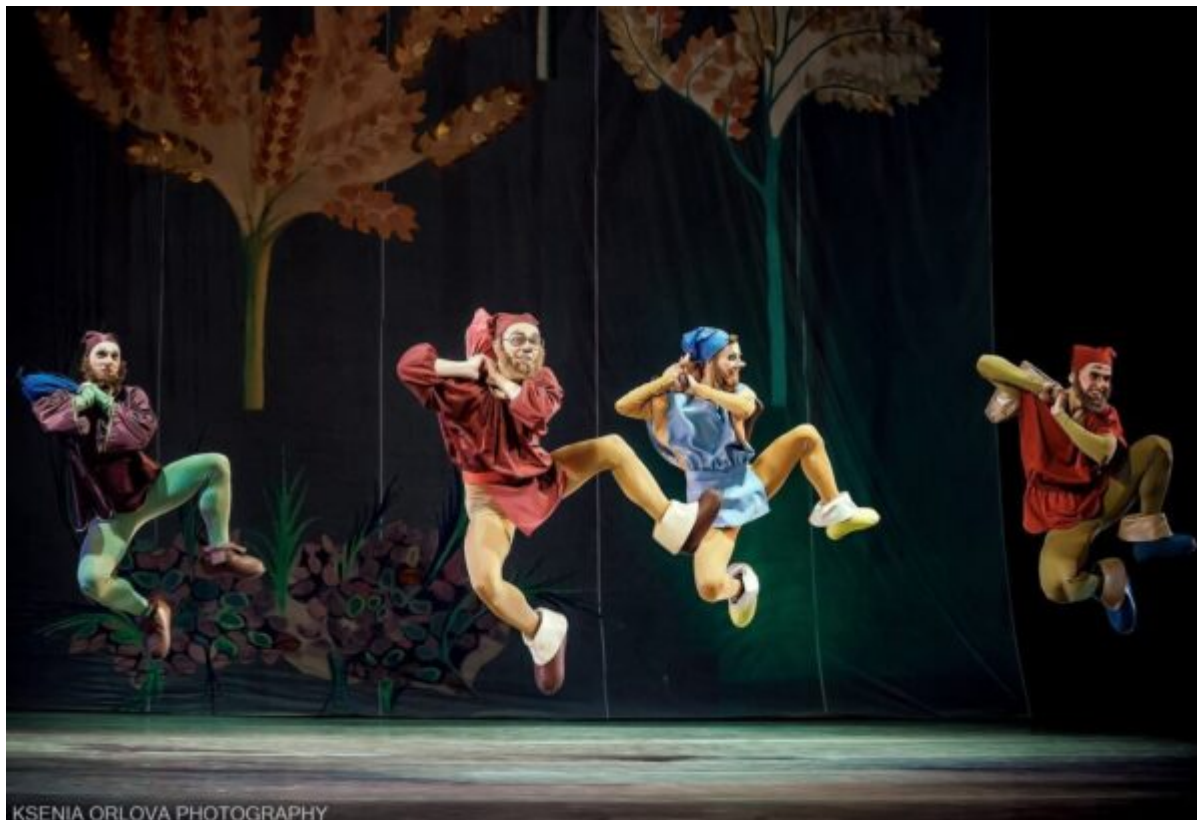
Grand Kyiv Ballet in Snow White.