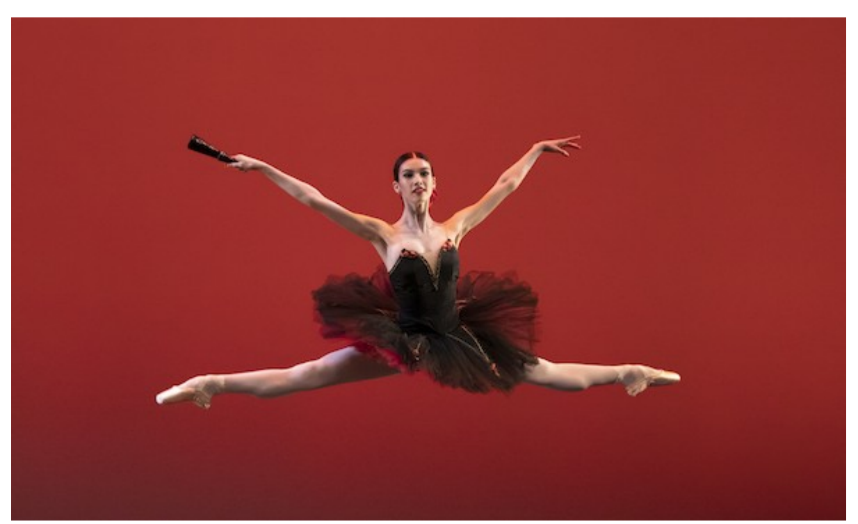
American Ballet Theatre Studio Company.