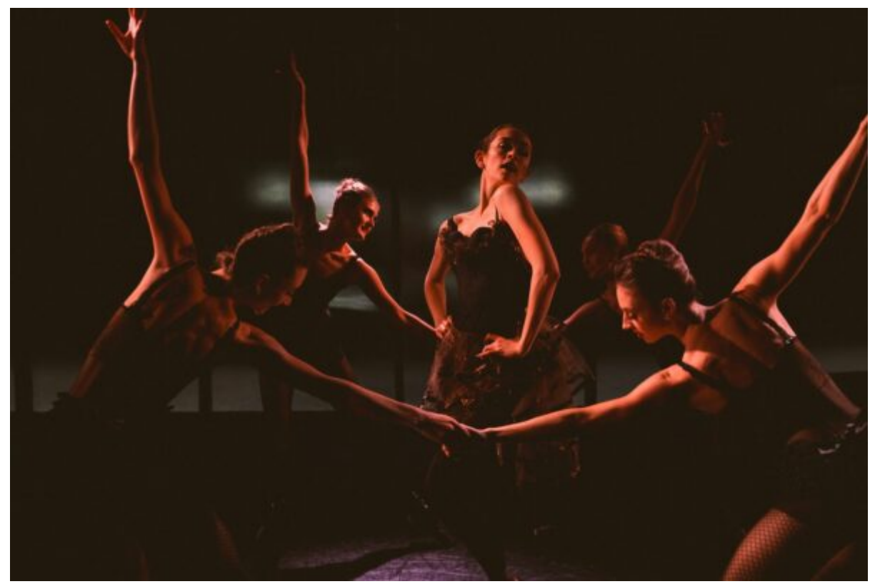
American Contemporary Ballet.