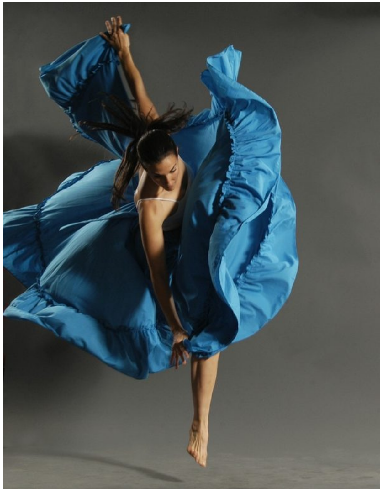
Contra-Tiempo Dance.

We Call it Ballet at Nocturne Theater, 324 N. Orange St., Glendale; Sat., March 29, 4 pm, $39. Tickets.