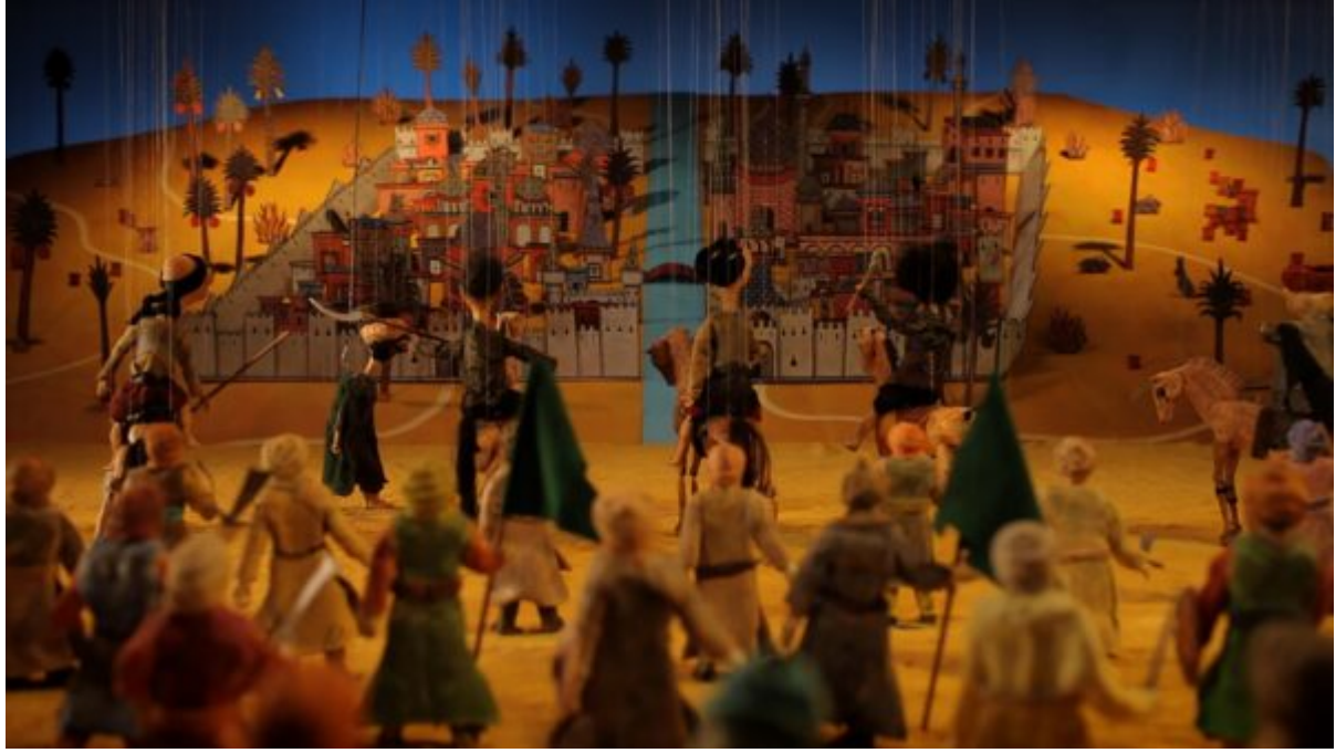
Wael Shawky.