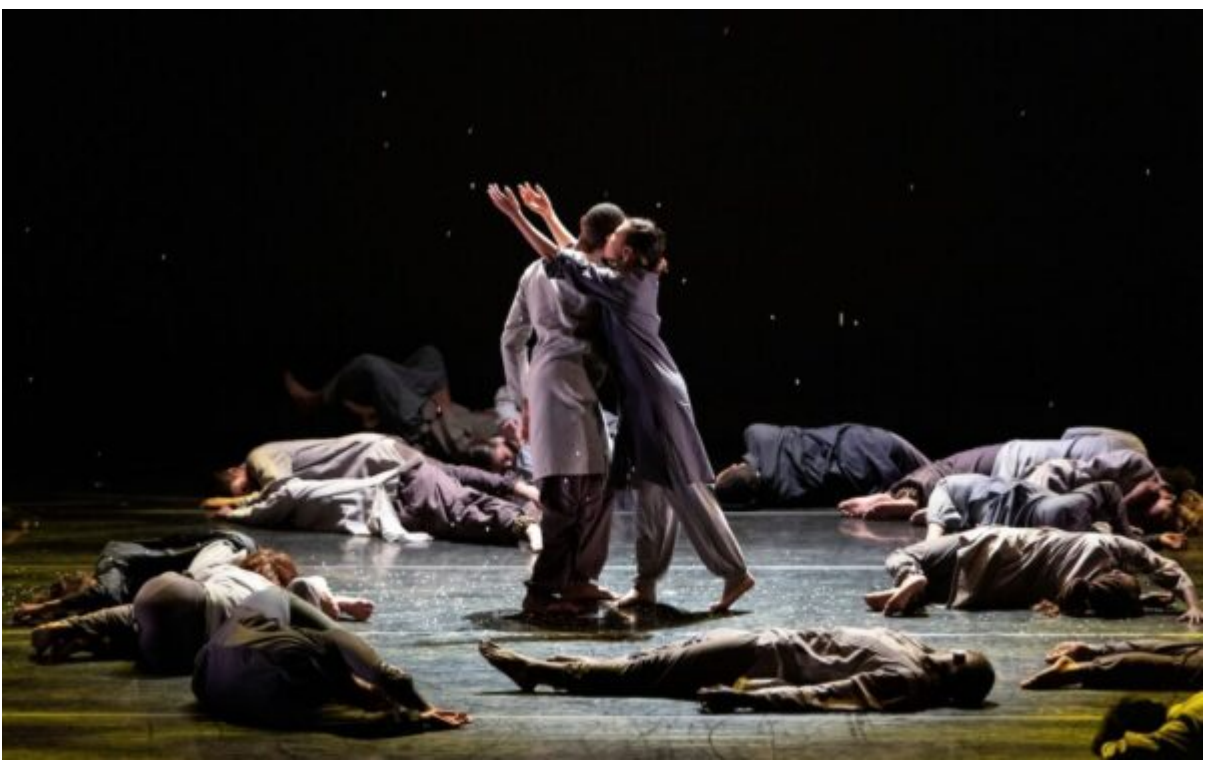
Blue13 Dance Company.

In the latest event affirming this venue's affinity for presenting LA dance, Blue 13 Dance Company shares Bollywood is Gay! . For two decades, the LA-based company has polished its blend of contemporary and Hindi film-inspired Bollywood dance. LA LGBT Center, 1118 McCadden Pl., Hollywood; Sat., March 15, 8 pm, $29-$60. Tickets.