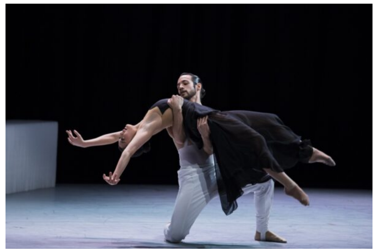
Ballet Hispánico.