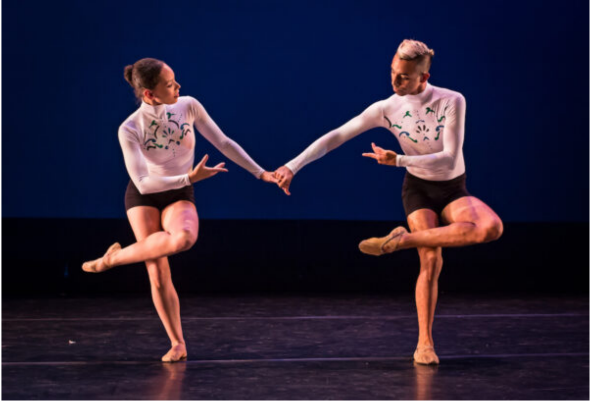
Kenneth Walker Dance Project.

Mojácar Flamenco — Cantan Los Fuegos at El Portal Theatre, 5269 Lankershim Blvd., North Hollywood; Fri.-Sat., Sept. 2-3, 8pm, Mojácar Flamenco , El Portal Theatre .