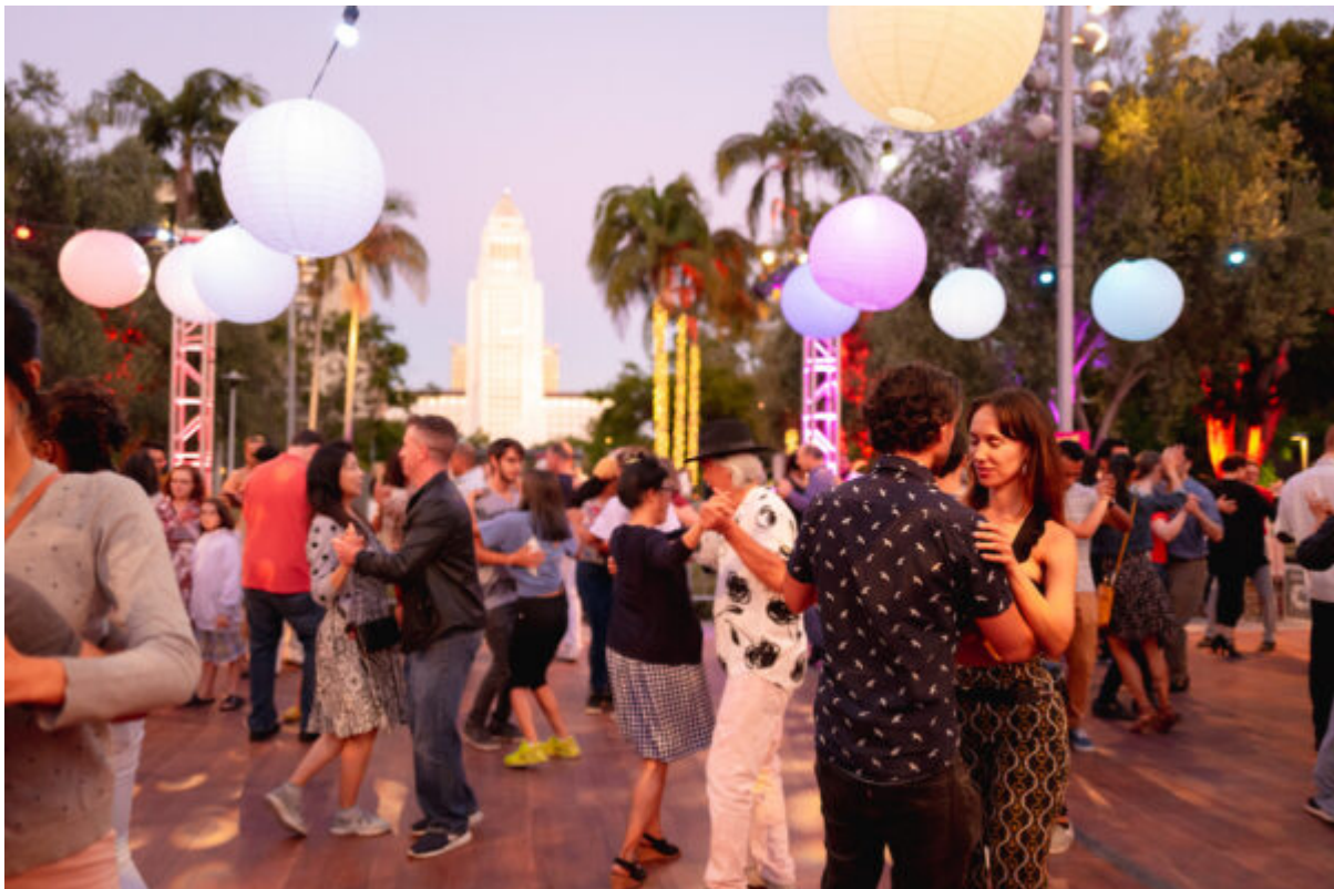
Dance DTLA.

The popular summer series continues with Dance DTLA Bachata . A free lesson is followed by open dancing. Come to dance or to enjoy the music and free show. Music Center, Jerry Moss Plaza, 135 N. Grand Ave., downtown; Fri., Aug. 26, 7-11pm, free. Music Center .