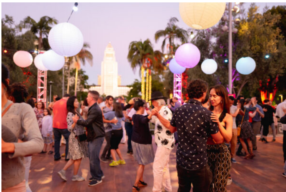
Dance DTLA.

The popular summer series continues with Dance DTLA Bachata . A free lesson is followed by open dancing. Come to dance or to enjoy the music and free show. Music Center, Jerry Moss Plaza, 135 N. Grand Ave., downtown; Fri., Aug. 26, 7-11pm, free. Music Center .