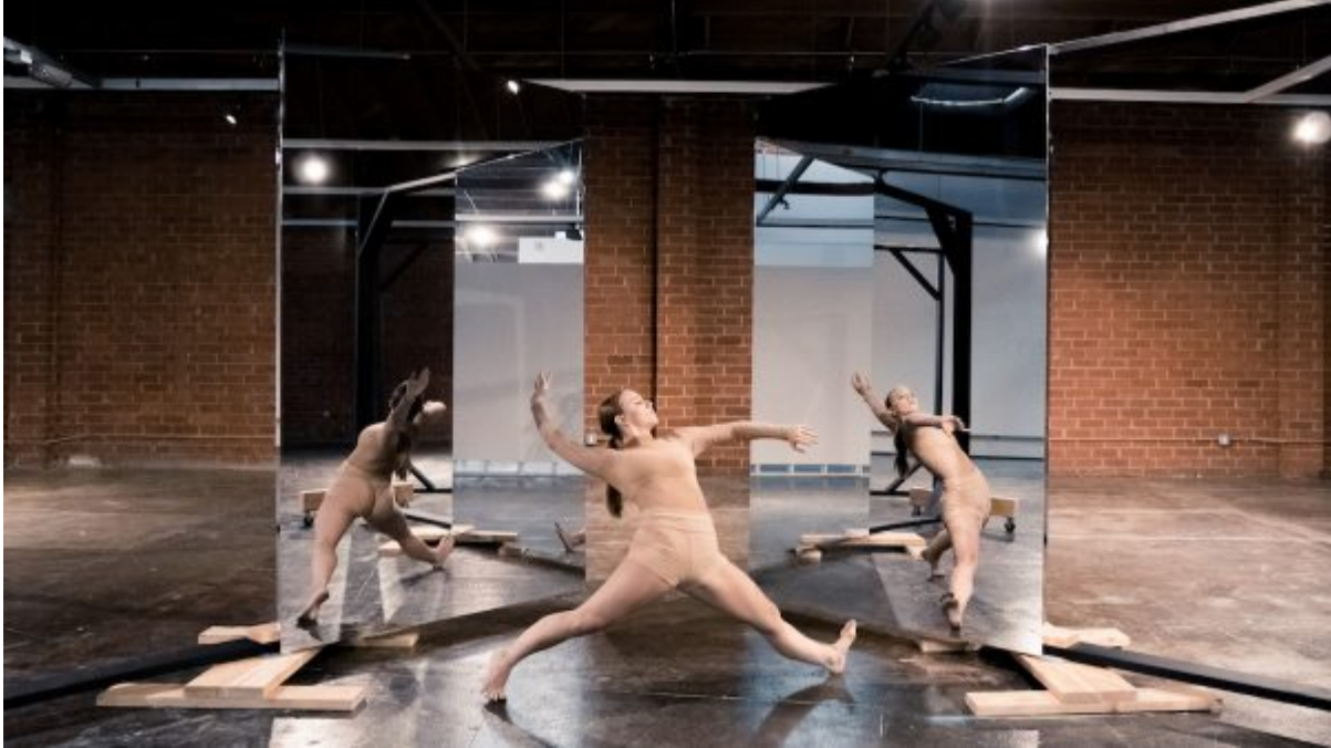
MashUp Dance Company.