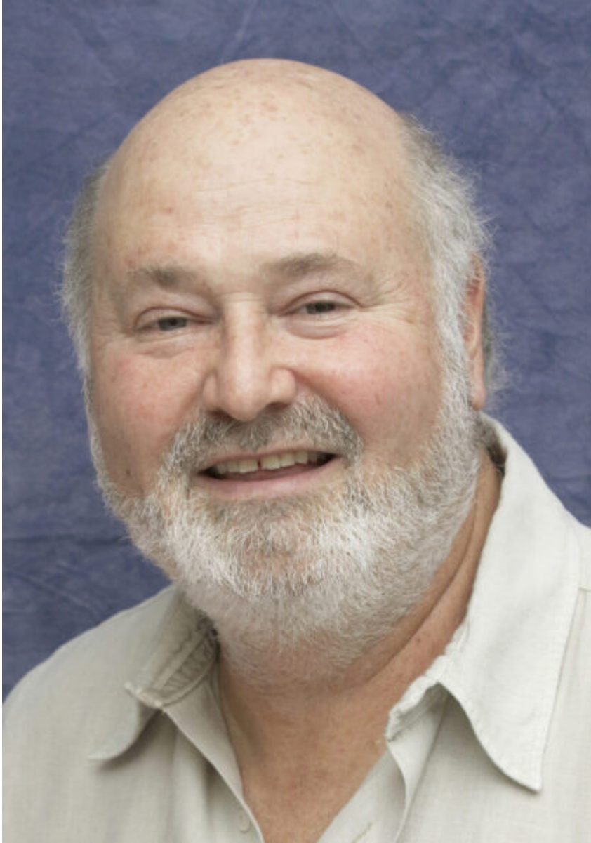
Rob Reiner

As to what can be done to elect a Democratic majority in the House, he stated: