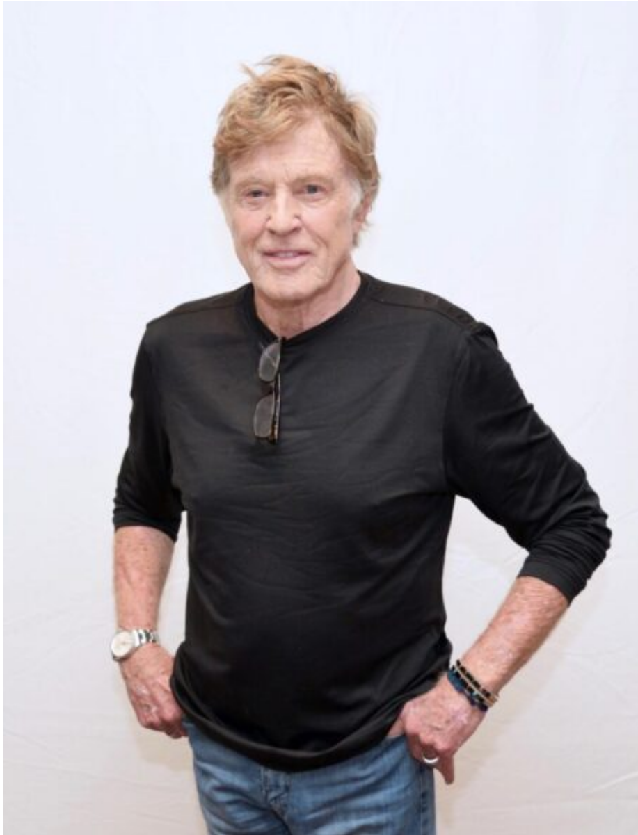
Robert Redford

“It’s a sad thing to have to say, but you all know it, that we’re living in rather dark times politically, we’re at a time now (2018) in our cultural environment that’s very dark. The polarization that exists with the two parties not agreeing to cross the aisle to work together is depressing, and we, the public, are the losers.”