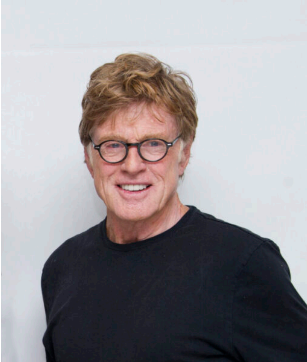
Robert Redford

On March 24, 2002, as he accepted an Honorary Academy Award, Robert Redford said : “As we all struggle to make sense out of the chaos, the destruction and the tragedy (9/11), one word that emerges is freedom. It’s going to be important in the years to come to make sure that the freedom of artistic expression is nurtured and kept alive.”