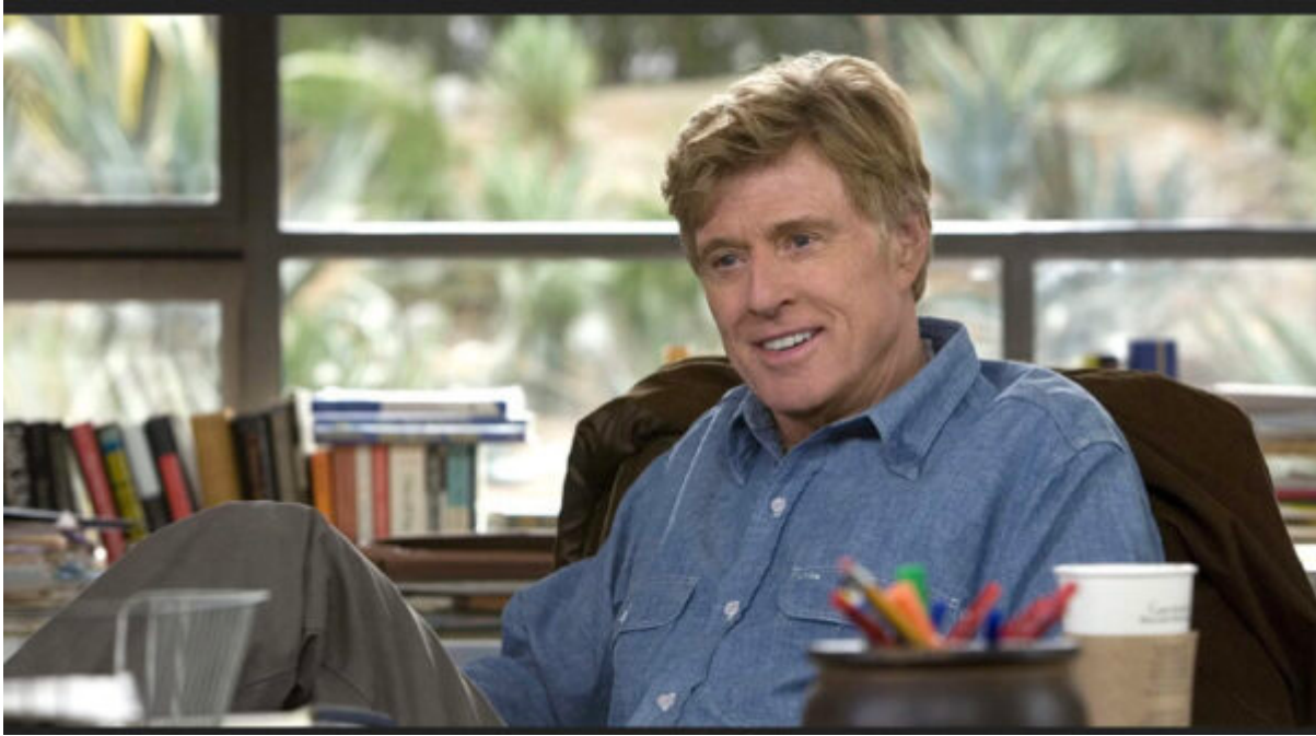
Robert Redford-Lions for Lambs

“My research on the press to prepare Lion for Lambs (2007) goes back to All the President's Men (1976), which I made in a very different time in our country. That was a high point for journalism's ability to protect our First Amendment rights. Washington Post reporters Bob Woodward and Carl Bernstein got most of the attention, but other people demanded the truth and literally behaved like detectives, investigating what the government was doing and saying, until they finally caught them. But journalism at that time had a very strong ethic and a rigid principle that, before you could print anything, you had to get two people to go on record and verify it. Also, the Congress and the Supreme Court were more bipartisan, they weren't in the hands of one party. Now, in the time since Watergate and in the last six years (since George Bush became President in 2001), a lot of changes have occurred and that ethic no longer stands. Newspapers go for market share, are run by business affairs, so you have publications, like Rupert Murdoch's empire and new channels like Fox, that are all about entertainment, not necessarily out to get accurate information and uncover the truth.”