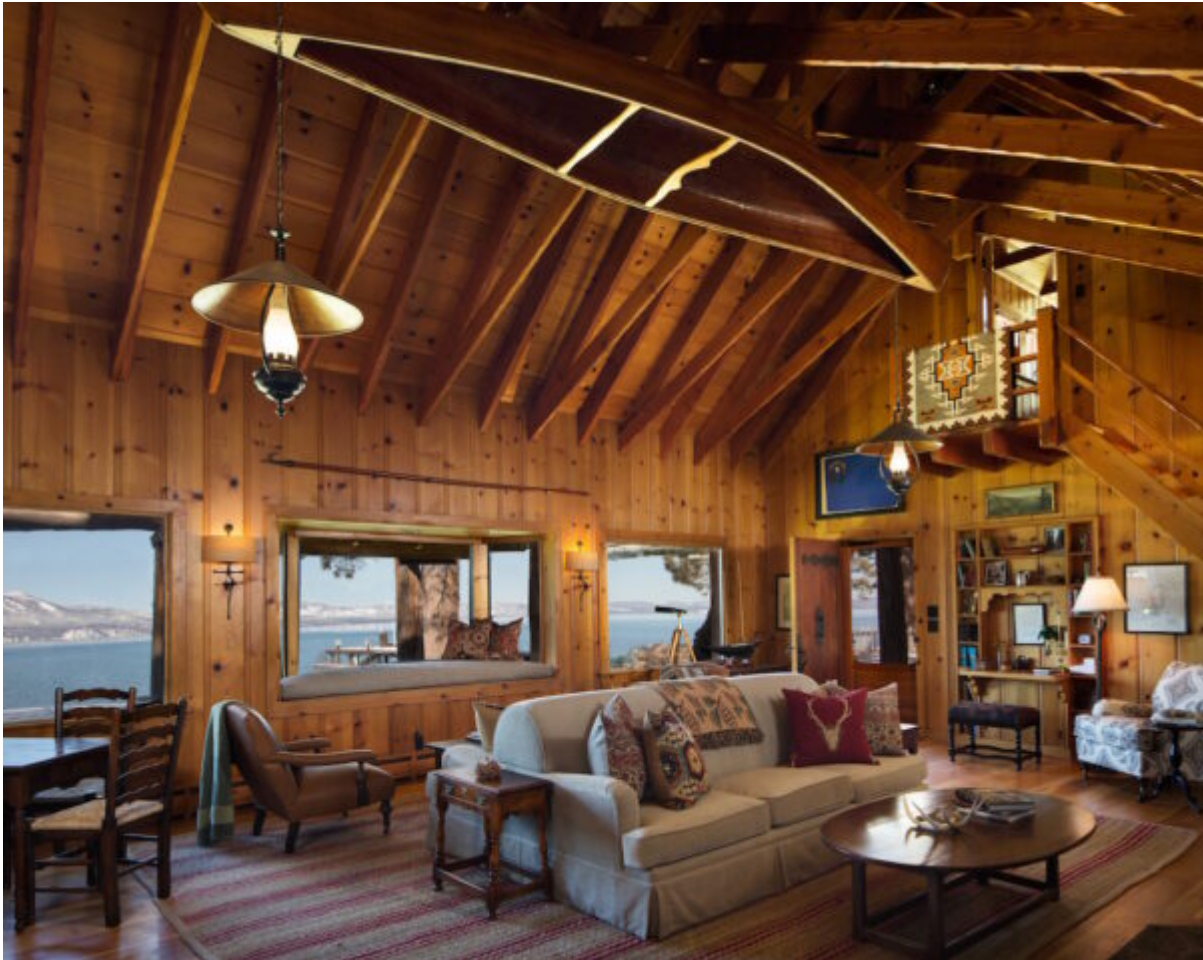
The Twin Pines living room.

Morgan's 2,702 square-foot Twin Pines cabin, set along 180 feet of private shoreline, originally had three bedrooms. The master bedroom has since been converted into a library with shelves stocked with bygone treasures. They include first editions of Mark Twain's books and film scripts from the TV show, Bonanza . Clear Creek Tahoe occupies the approximate land where the show's fictional Ponderosa Ranch existed (according to the burning map of the area featured in the show's opening credits).