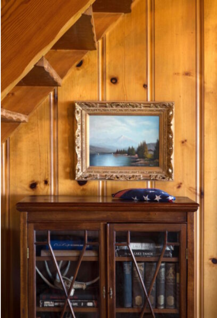
A nook beneath a stairway at Twin Pines cabin.