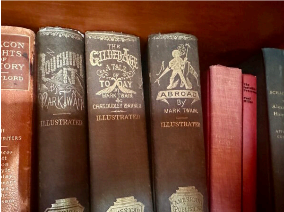
The library's collection of Mark Twain's first edition books.