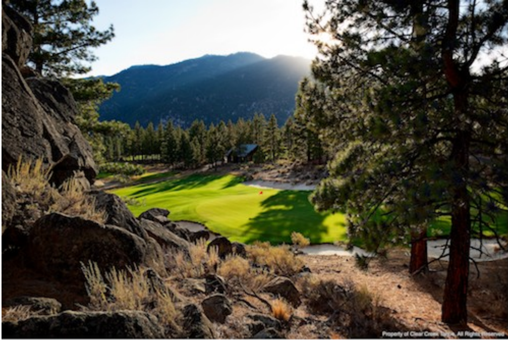
The second hole at Clear Creek Tahoe.

Posted in Travel , Leisure , Lifestyle | No Comments »