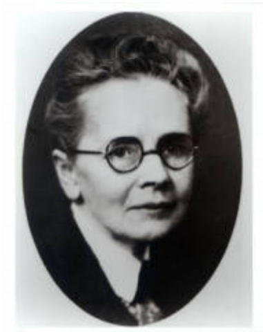
Architect Julia Morgan.

Built in 1928, the Arts & Crafts cabin harbors well-preserved details: original door hardware, hand-forged wrought iron vents, pine tree andirons, and cedar, pine, and granite construction. It was purchased in 2016 by nearby Clear Creek Tahoe , a private residential golf club community. Clear Creek is set on the eastern slope of the Carson Range in the Sierra Nevada Mountains.