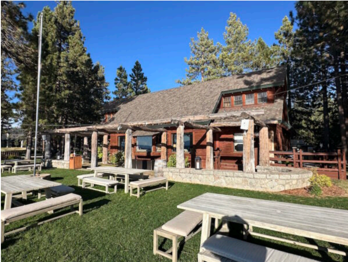
Twin Pines Lake & Ski House.

Members of Clear Creek Tahoe use the facility as a beach and ski house—it's near Heavenly Ski Resort's gondola. Many stop in for a glass of wine, a meal, a good book from the library, or a chat with the affable staff. The lodge is one of Clear Creek's standout amenities, a rare hangout place given its historical roots.