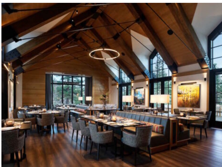
Clear Creek Tahoe's dining room.

The golf course is edged by Jeffrey pine and winding trails; an abiding sense of history surrounds the land. The course's Swift's Station pavilion was named for the wagon train stop that served miners and cattlemen. It's just below the eastern summit of the Sierra Nevada Mountains. The surrounding mountainside was once threaded with timber fumes that conveyed logs from a summit to the western Nevada mines.