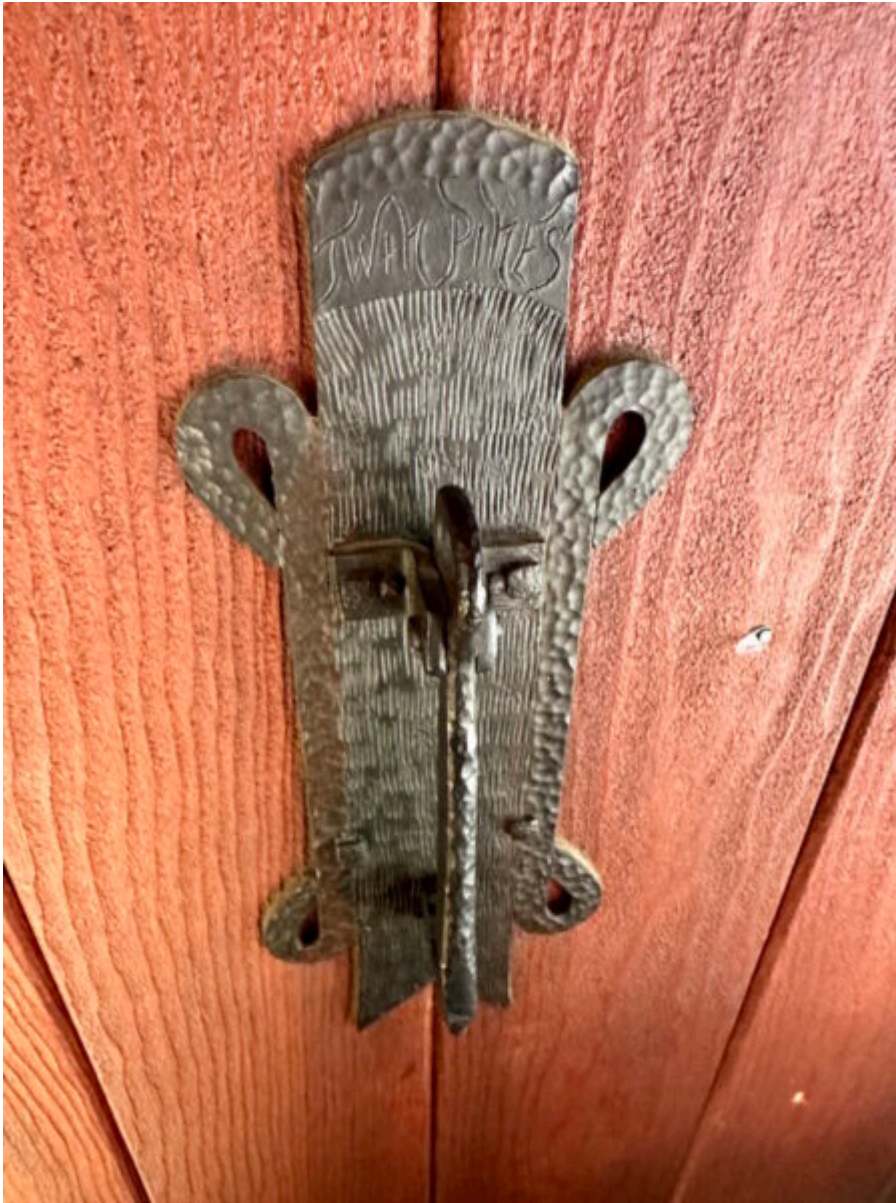
Original hardware on Twin Pine cabin's front door.