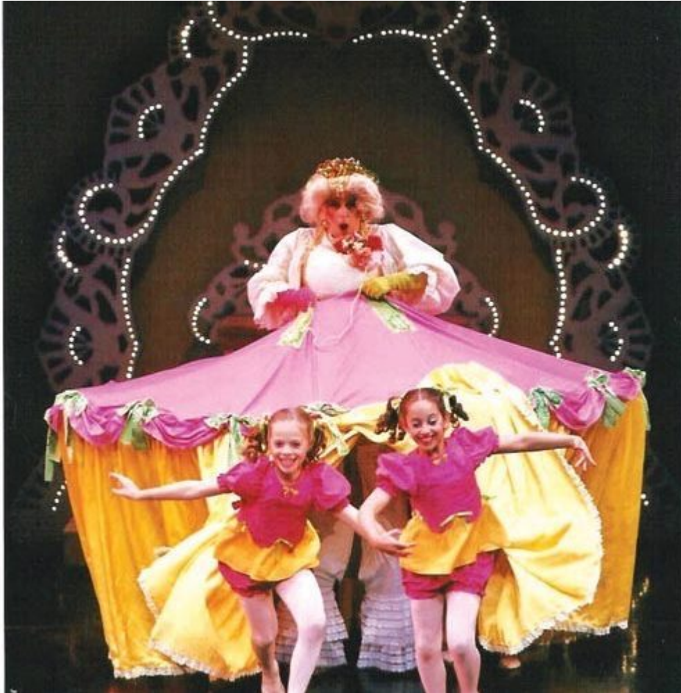
Westside Ballet.

Westside Ballet – The Broad Stage, 1310 11th St., Santa Monica; Sat., Nov. 27 & Dec. 4, 1 & 5 pm, Sun., Nov. 28 & Dec. 5, 1 pm, $50. Details, tickets & Covid protocols at Tix .