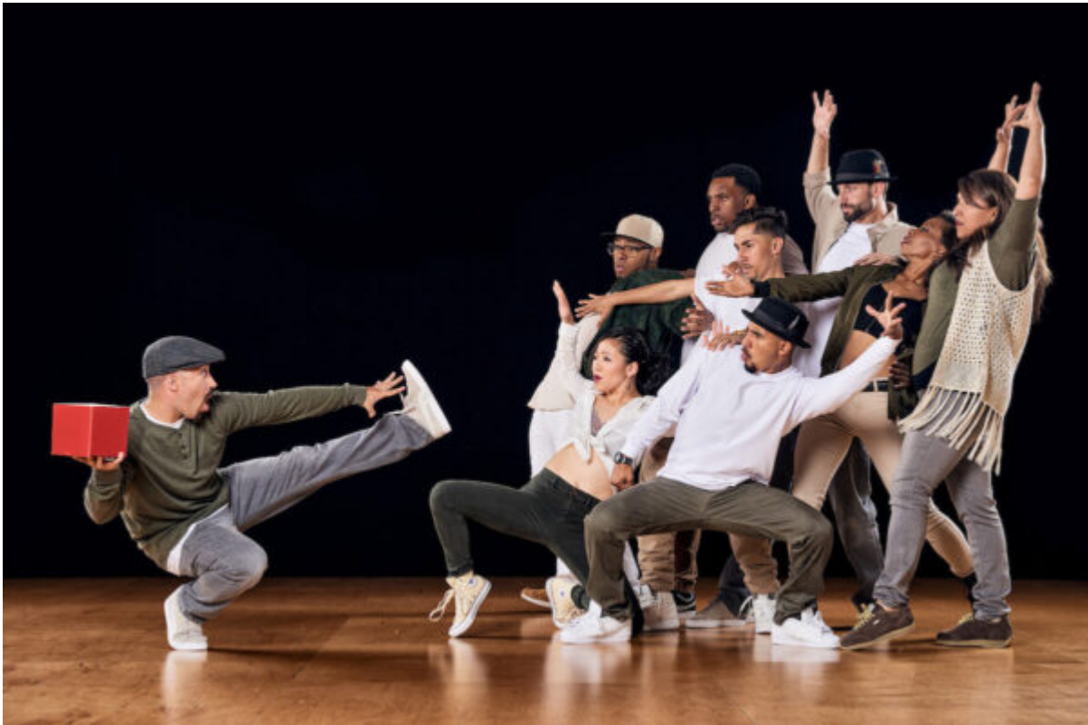
Versa Style Dance Company.

Versa-Style Dance Company Next Generation – The Mob HQ, 1126 San Fernando Rd., San Fernando; Sun. Dec. 5, 1:30 pm, free, Versa Style Dance .