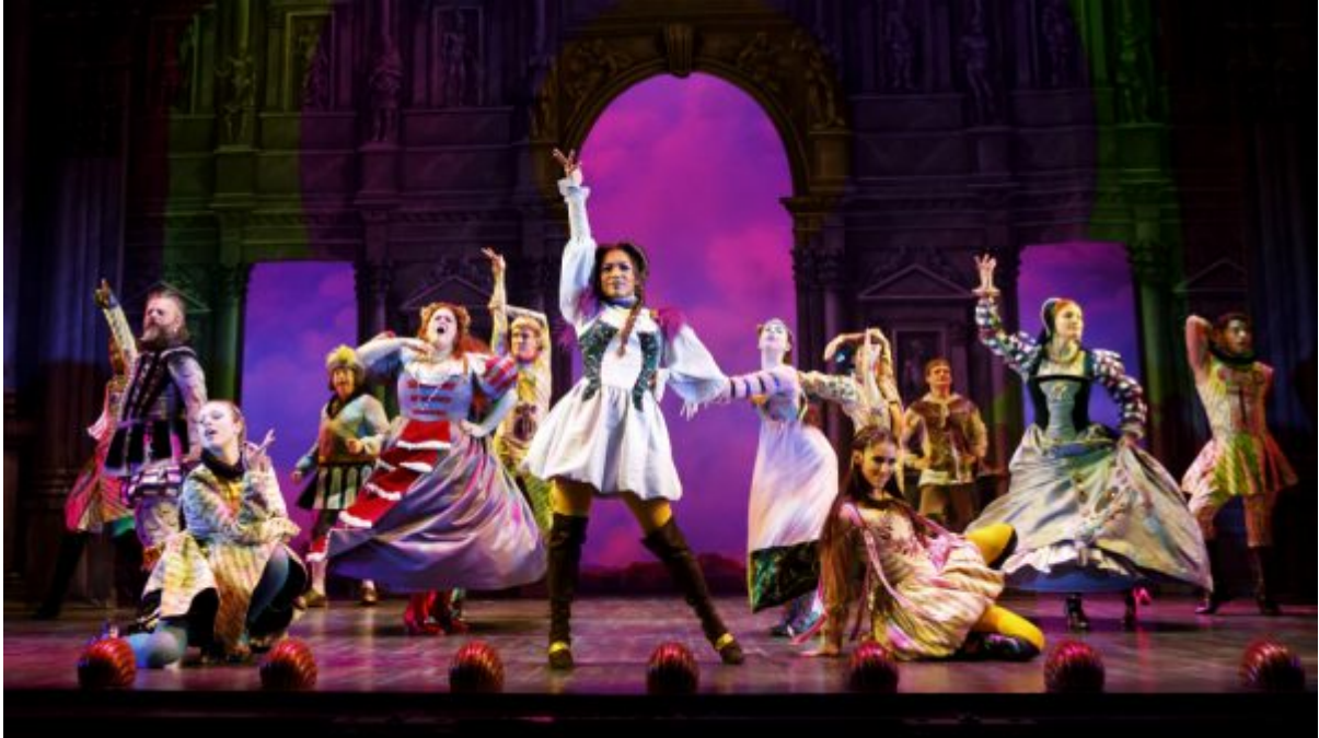
Head Over Heels.