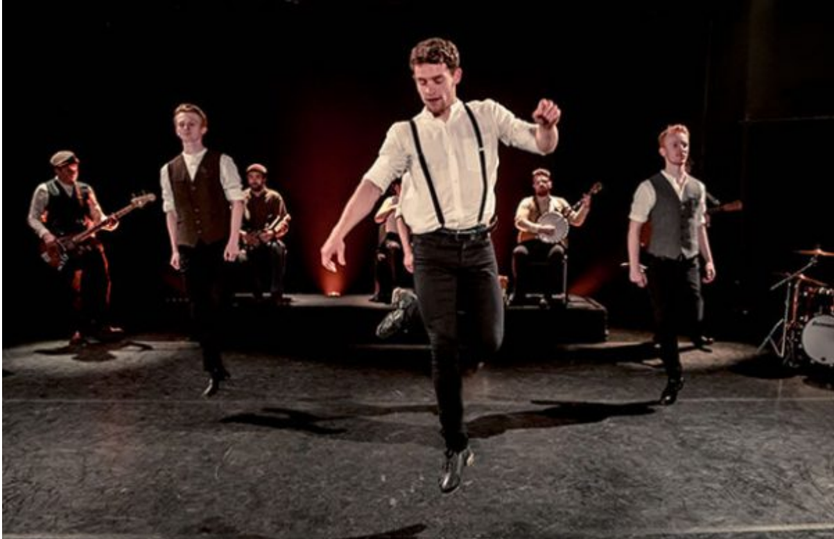
“Christmas from a Celtic Table.”

Irish dancers, singers, musicians, and a storyteller evoke Irish Christmas traditions in Christmas from a Celtic Table at Irvine Barclay Theatre, 4242 Campus Dr., Irvine; Mon., Nov. 29, 8 pm, $30-$80. Info, tickets, and Covid protocols at OvationTix .