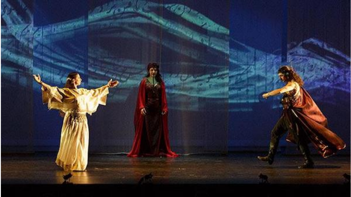
The Scarlet Stone.