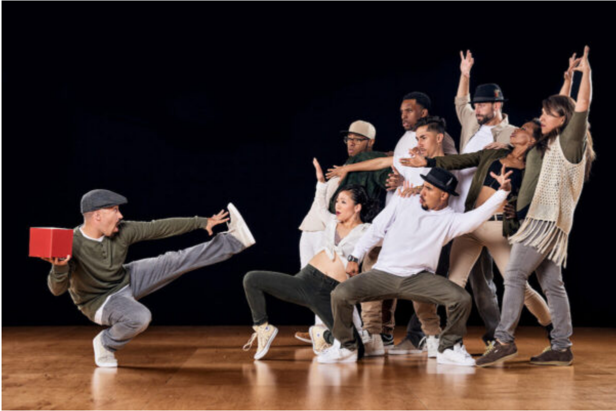
Versa Style Dance Company.

Versa-Style Dance Company Next Generation – The Mob HQ, 1126 San Fernando Rd., San Fernando; Sun. Dec. 5, 1:30 pm, free, Versa Style Dance .