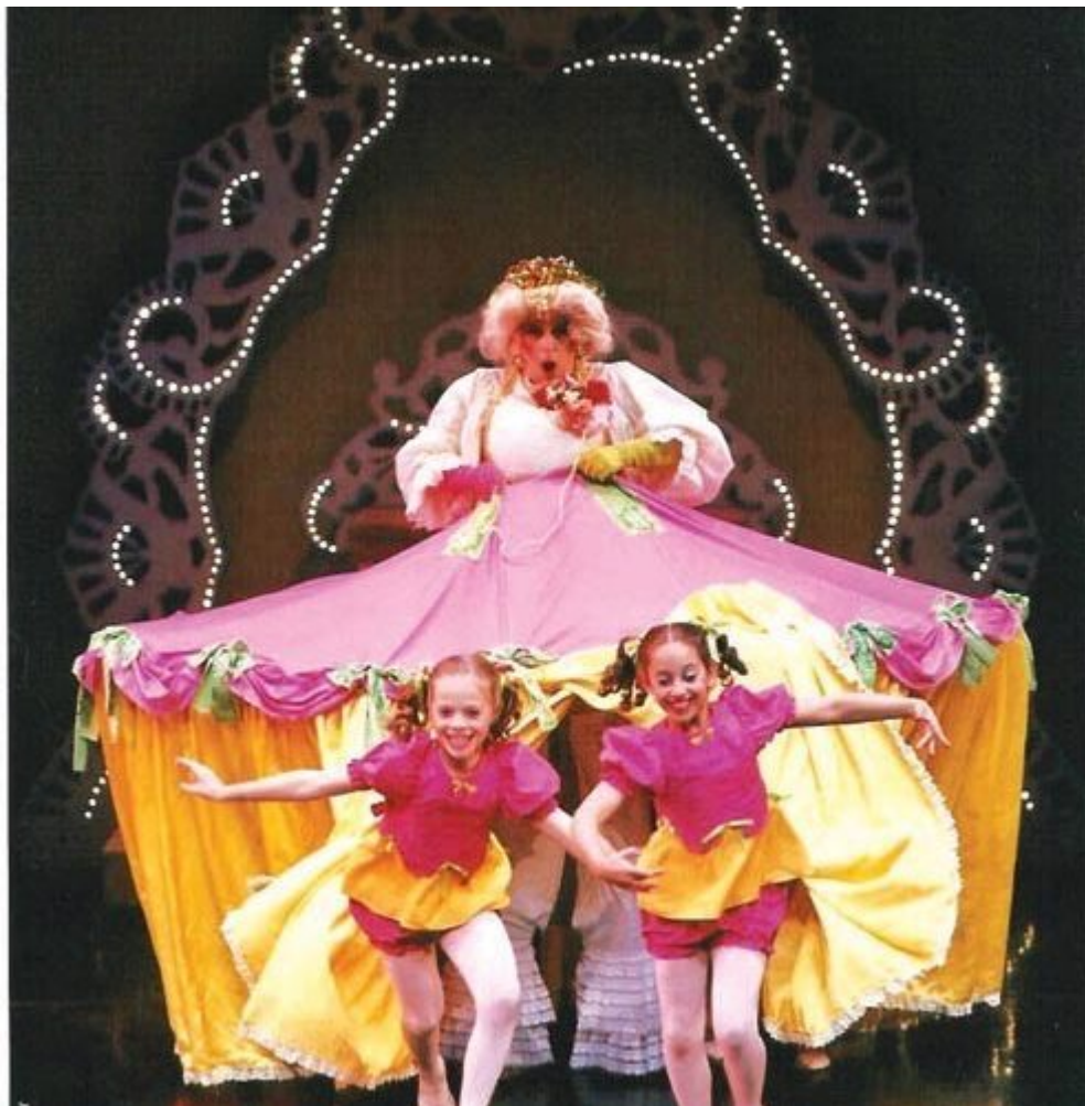
Westside Ballet.

Westside Ballet – The Broad Stage, 1310 11th St., Santa Monica; Sat., Nov. 27 & Dec. 4, 1 & 5 pm, Sun., Nov. 28 & Dec. 5, 1 pm, $50. Details, tickets & Covid protocols at Tix .