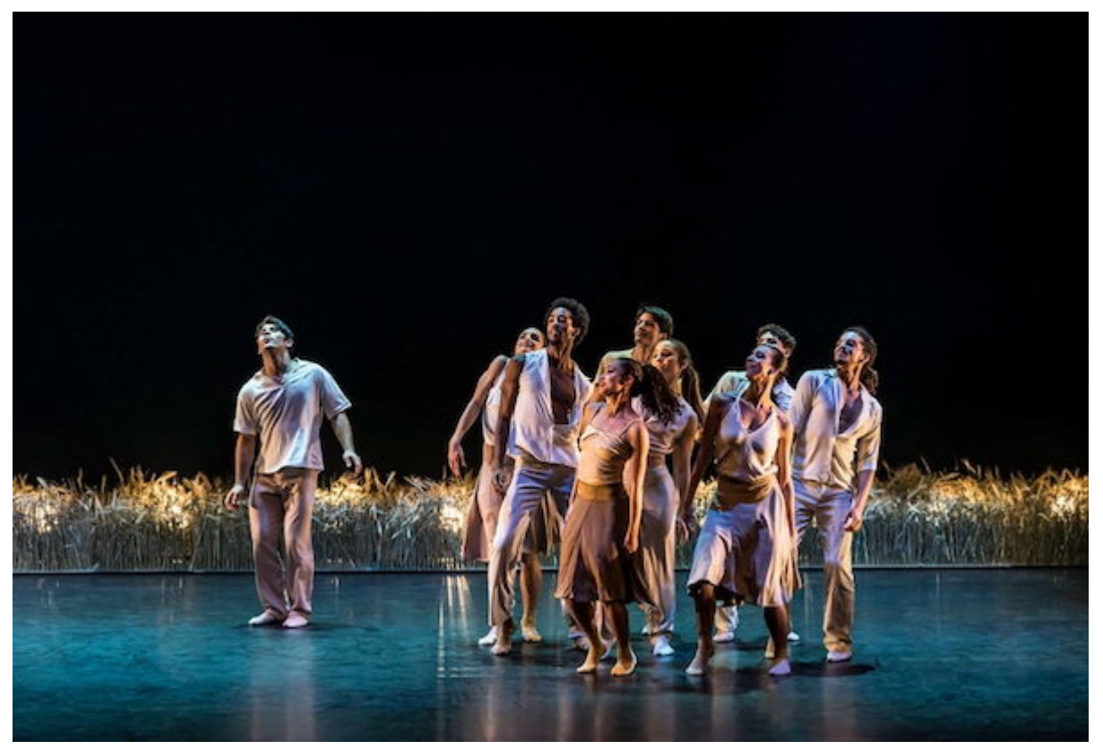
Acosta Danza.

Acosta Danza – Cuban Landscape at The Ford Theater, 2850 Cahuenga Blvd. East, Hollywood; Sat., Oct. 8 10, 8pm, $29-$44. The Ford Theater.