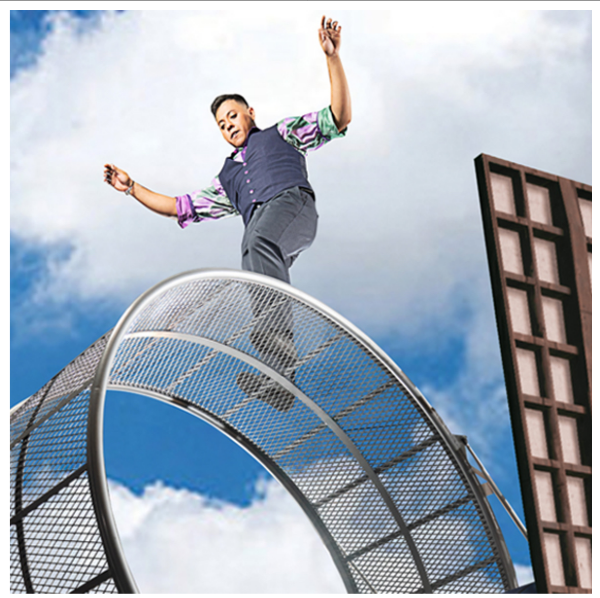
Cirque Mechanics.