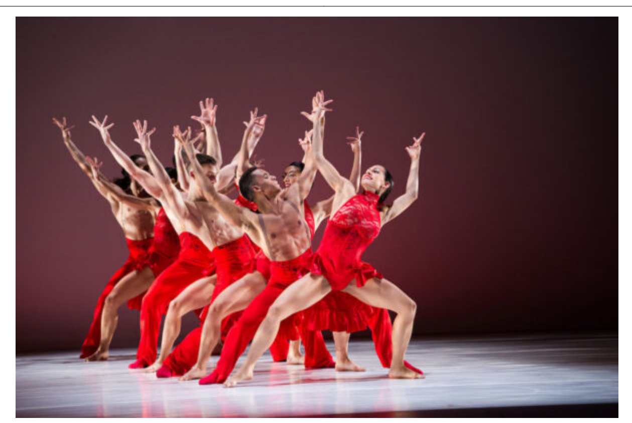
Ballet Hispanico.

Cassils – Human Measure at REDCAT, Disney Hall, 631 W. 2<sup>nd</sup> St., downtown; Thurs.-Sat., Oct. 13-15, 8:30pm, $25. REDCAT.