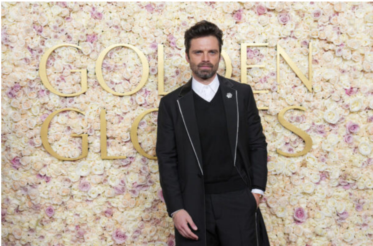
Sebastian Stan

Sebastian Stan was nominated to two Golden Globes for his critically praised performances in the drama The Apprentice and the dark comedy A Different Man . This is what he said in his acceptance speech, after winning as Best Actor for A Different Man , where he plays an actor affected by neurofibromatosis.