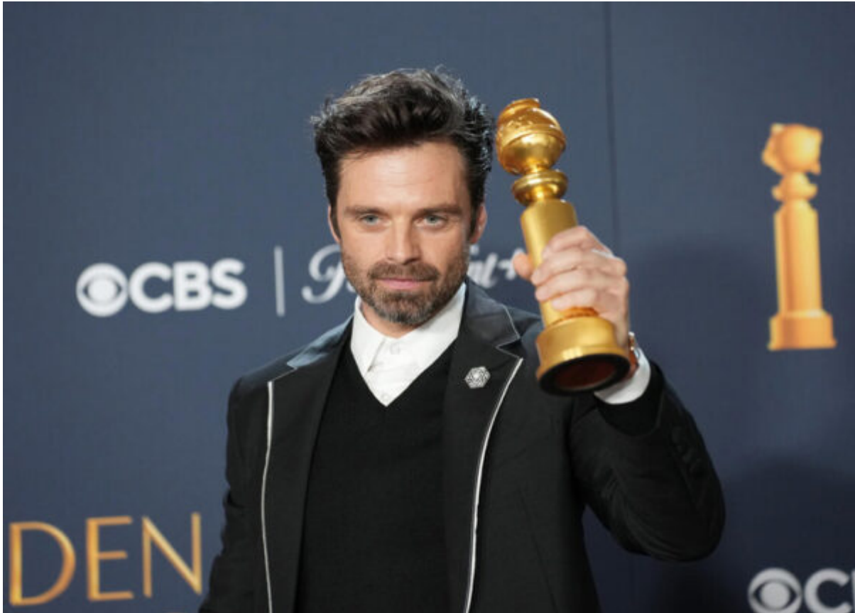
Sebastian Stan