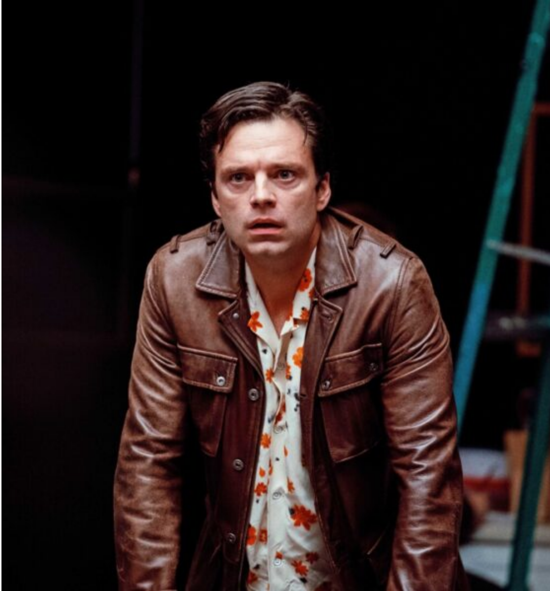
Sebastian Stan — A Different Man

He added backstage: “It so seldom ever happens to be nominated anyway, and both of these films really had a hard journey. Apprentice , no studio, no money, no marketing, no billboard on Sunset, wanting to be buried and censored. A Different Man as well, is a very unique film, that now is finally going to get some eyes on it, and that’s what matters.