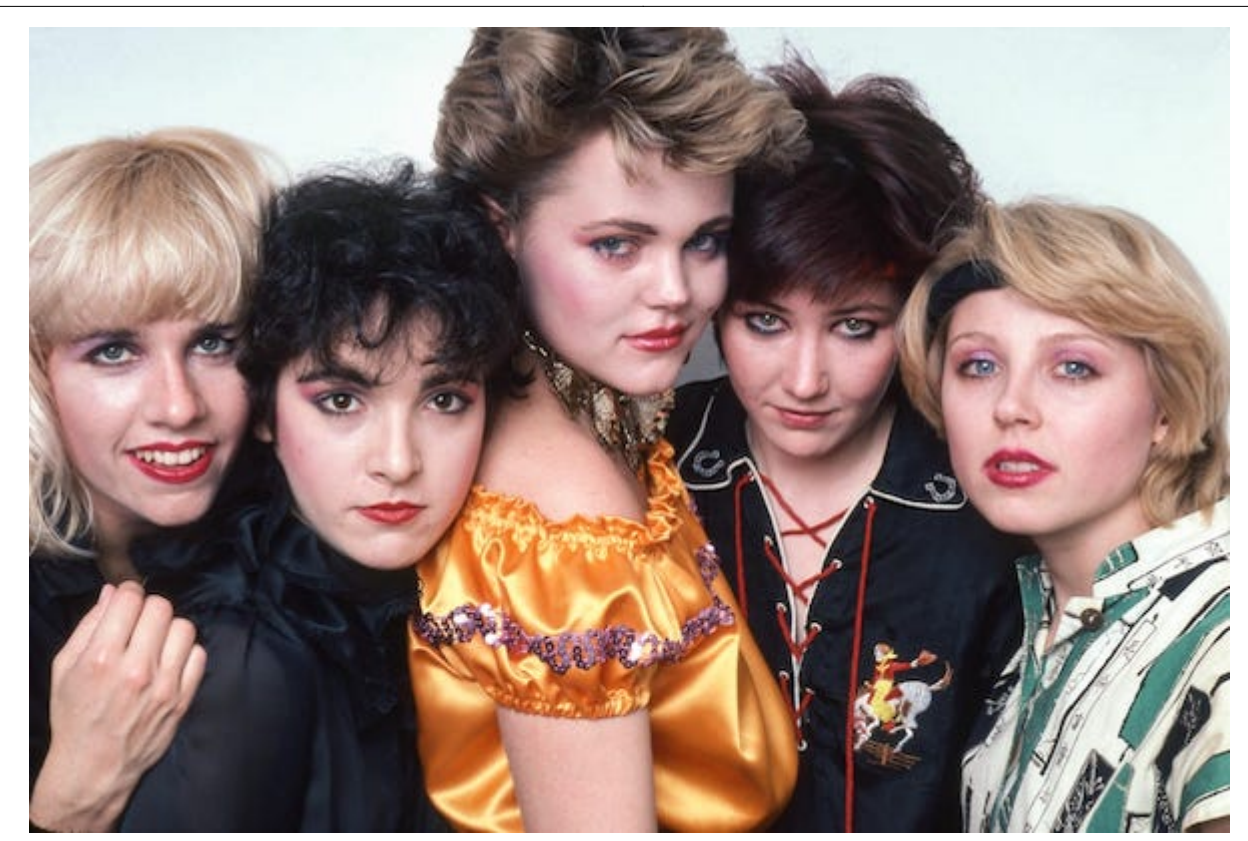
The Go-Gos.