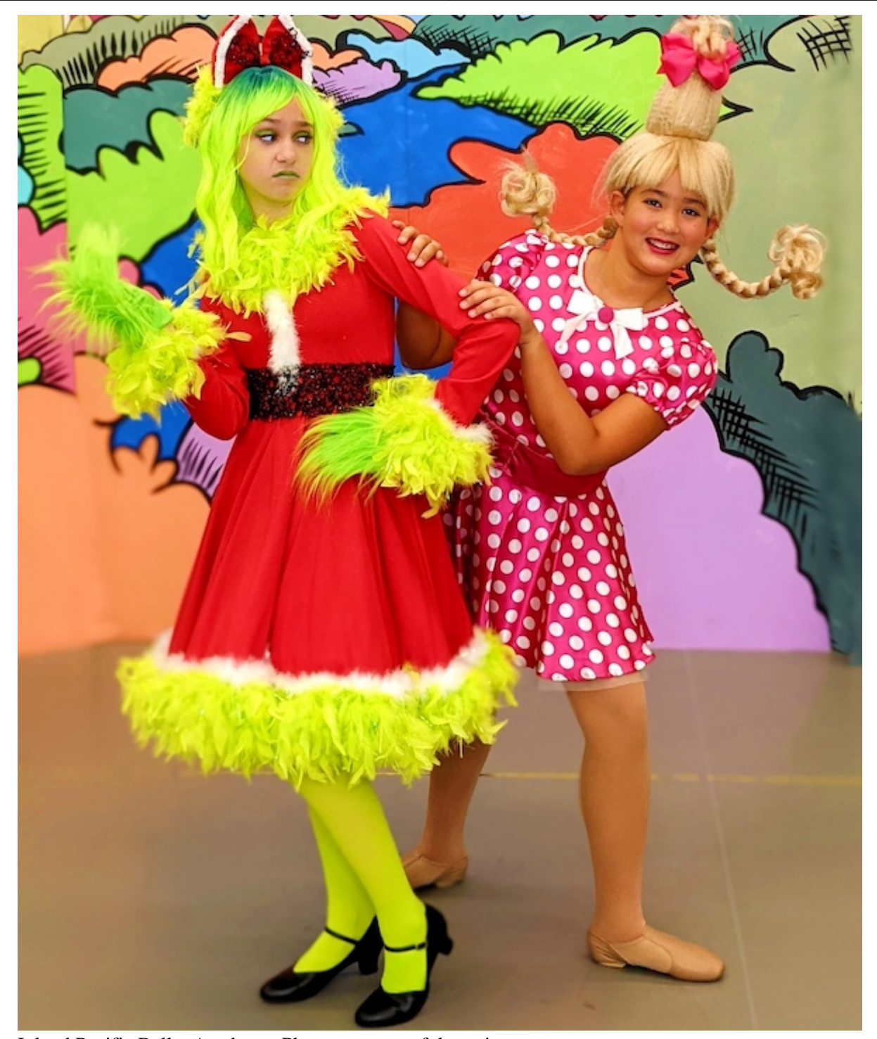
Inland Pacific Ballet Academy.