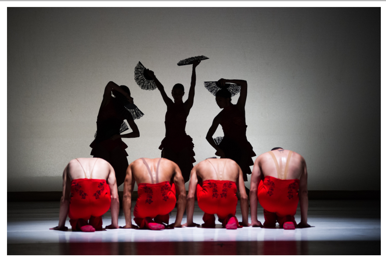
Ballet Hispanico.