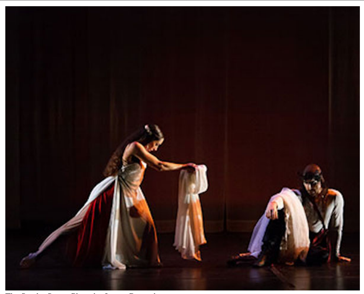
The Scarlet Stone.