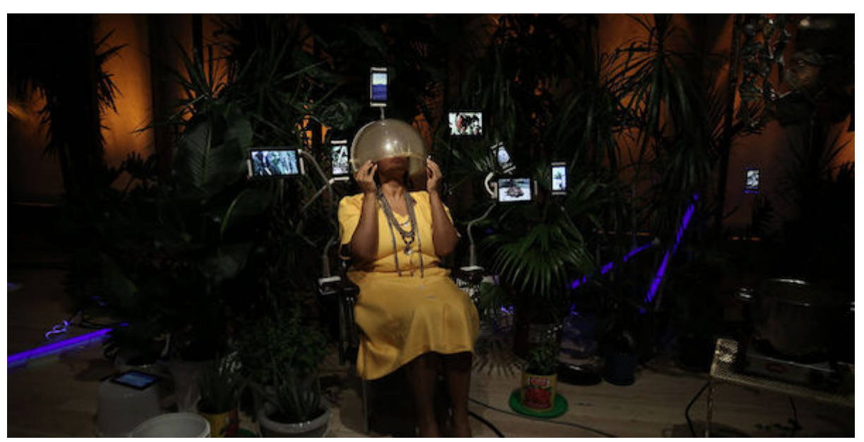
Hammer Museum's "No Humans Involved."