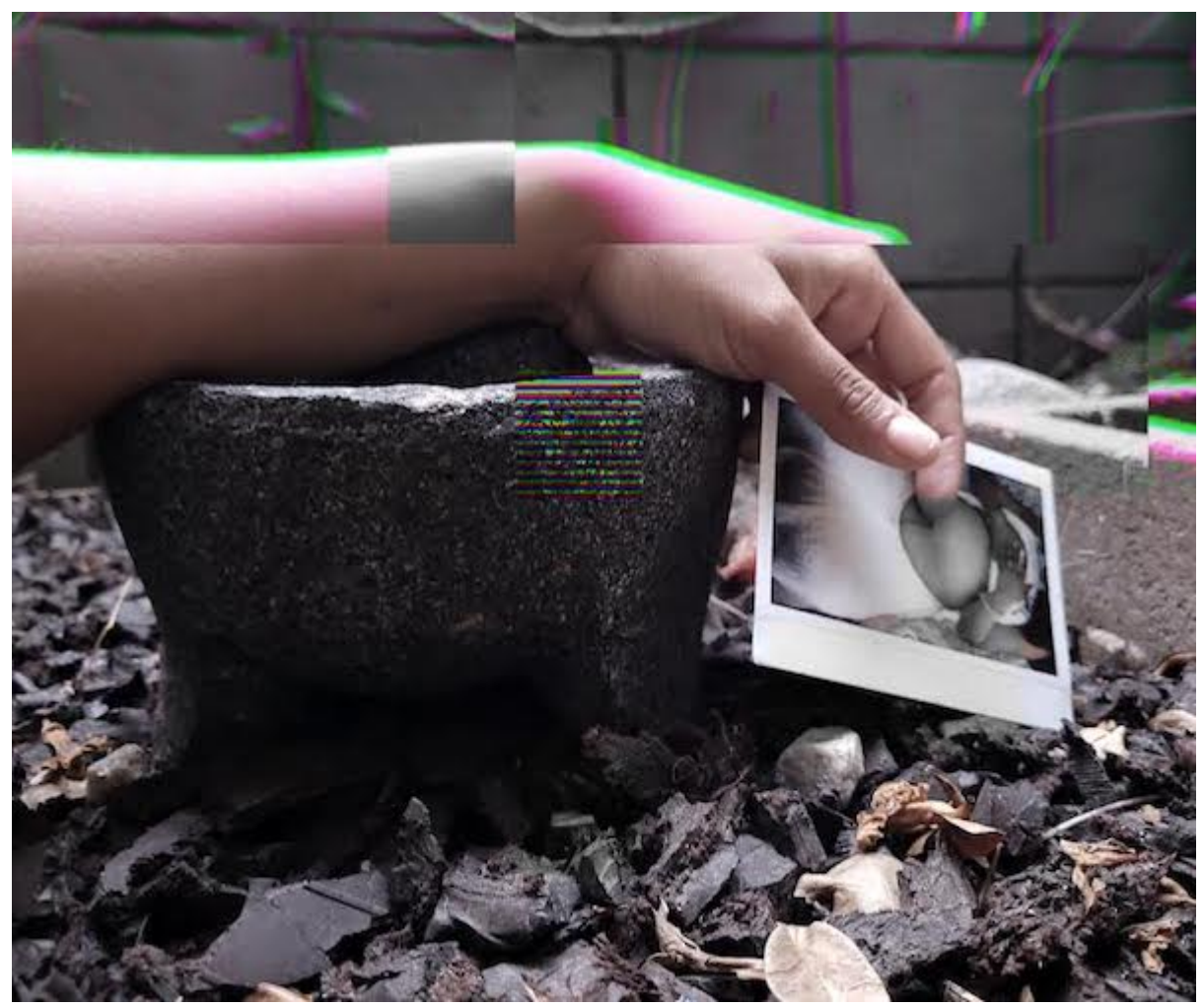
Showbox LA.