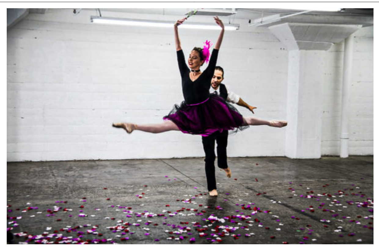
Freaks With Lines.