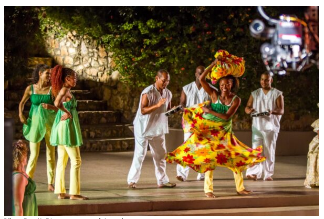
Viver Brasil.

Continuing its roll out of encore videos from past performances, Viver Brasil adds Intersections/Ajê to the examples of the rich repertoire reflecting efforts to preserve Brasil's African culture in dance and music. Free at Viver Brasil. The ensemble also is part of KCET's Southland Sessions streaming at KCET.