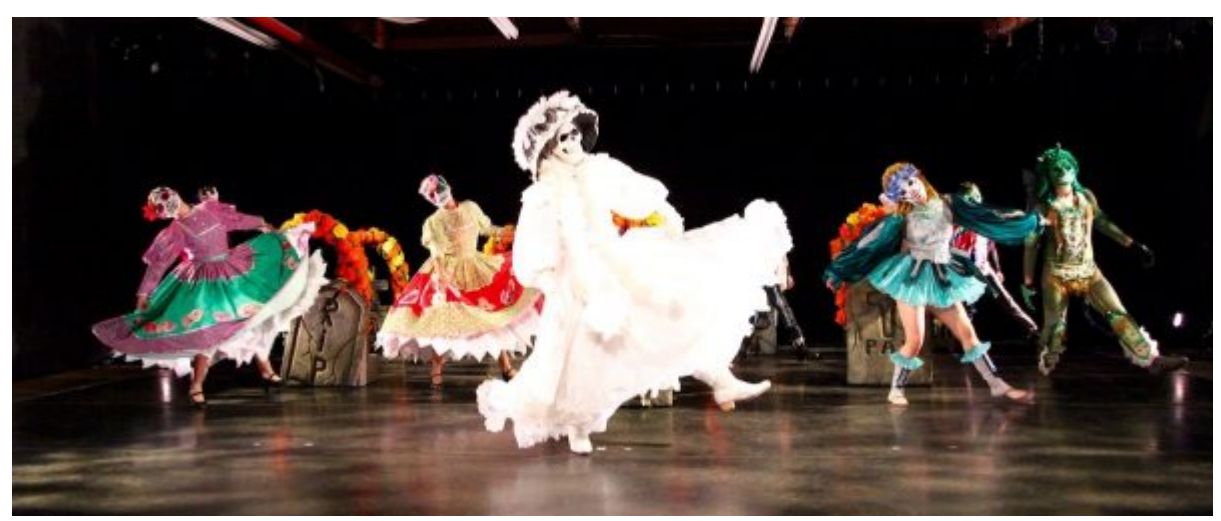
Danza Floricanto/USA's "Dia de Los Muertos (Day of the Dead)".

The long-running, family friendly Fiesta del Día de los Muertos~Day of the Dead Celebration hosted by Danza Floricanto/USA returns as a live performance. At Casa Del Mexicano, Floricanto Center for the Performing Arts, 2900 Calle Pedro Infante, East LA; Sat., Nov. 6, 8 pm, Sun., Nov. 7, 6 pm, $20 at door, $15 pre-sale; $10 seniors & $5 children under 10 at door only. Tickets and Covid protocols at Danza Floricanto.