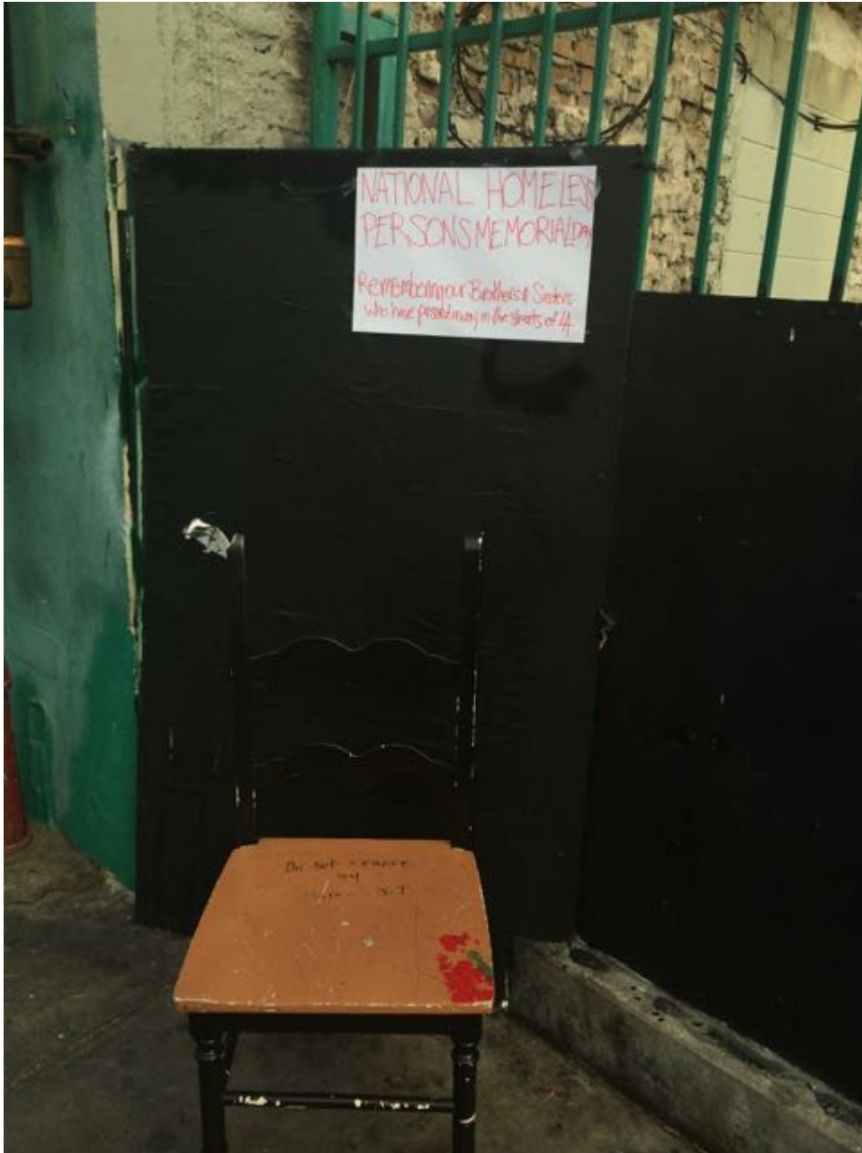
“National Homeless Persons Memorial Day”