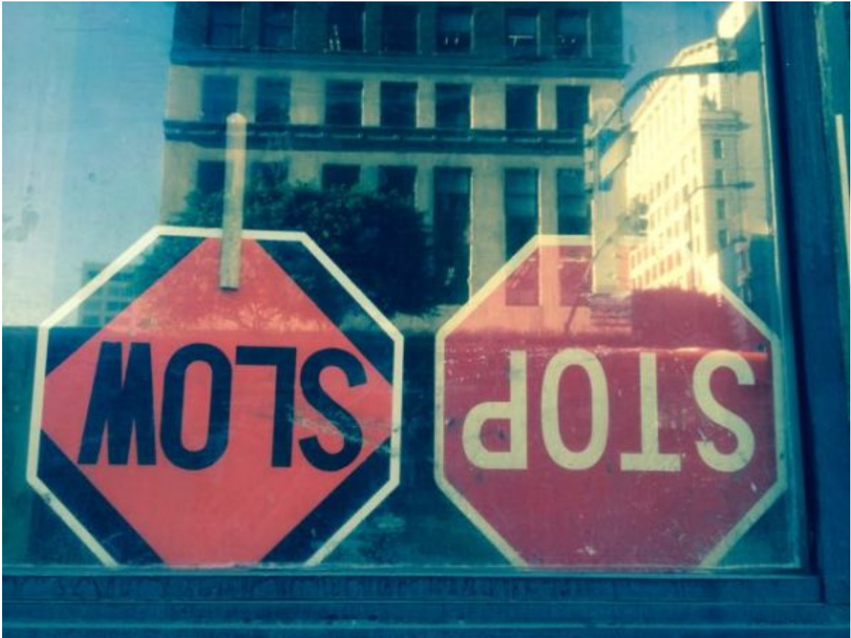
Upside Down Signs In The Window