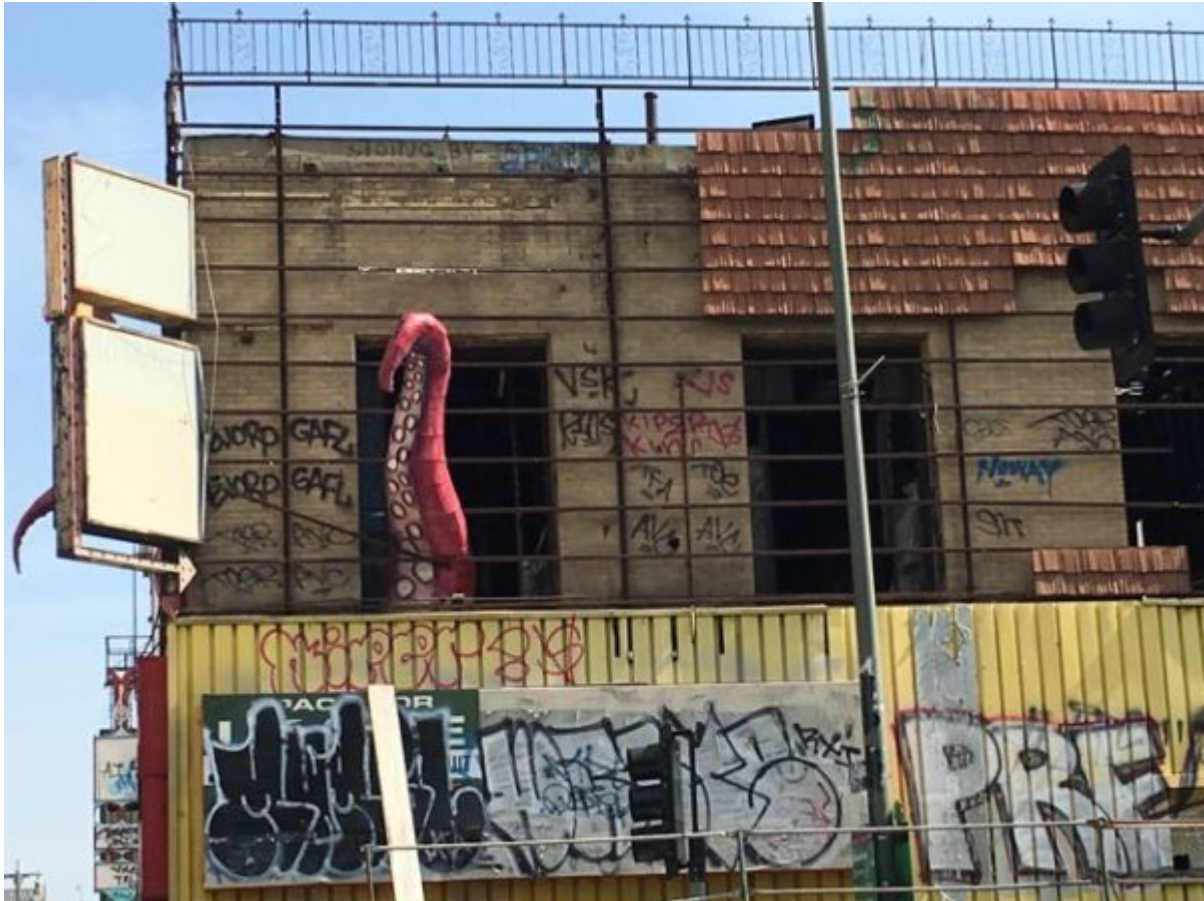
I Hope That Is Trompe L'oeil