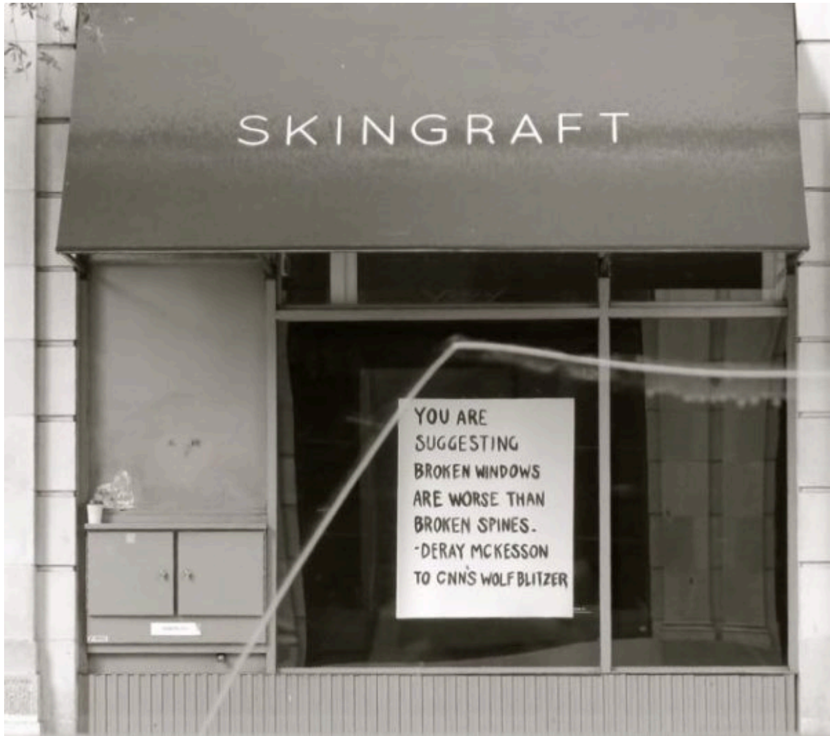
In Solidarity With Ferguson