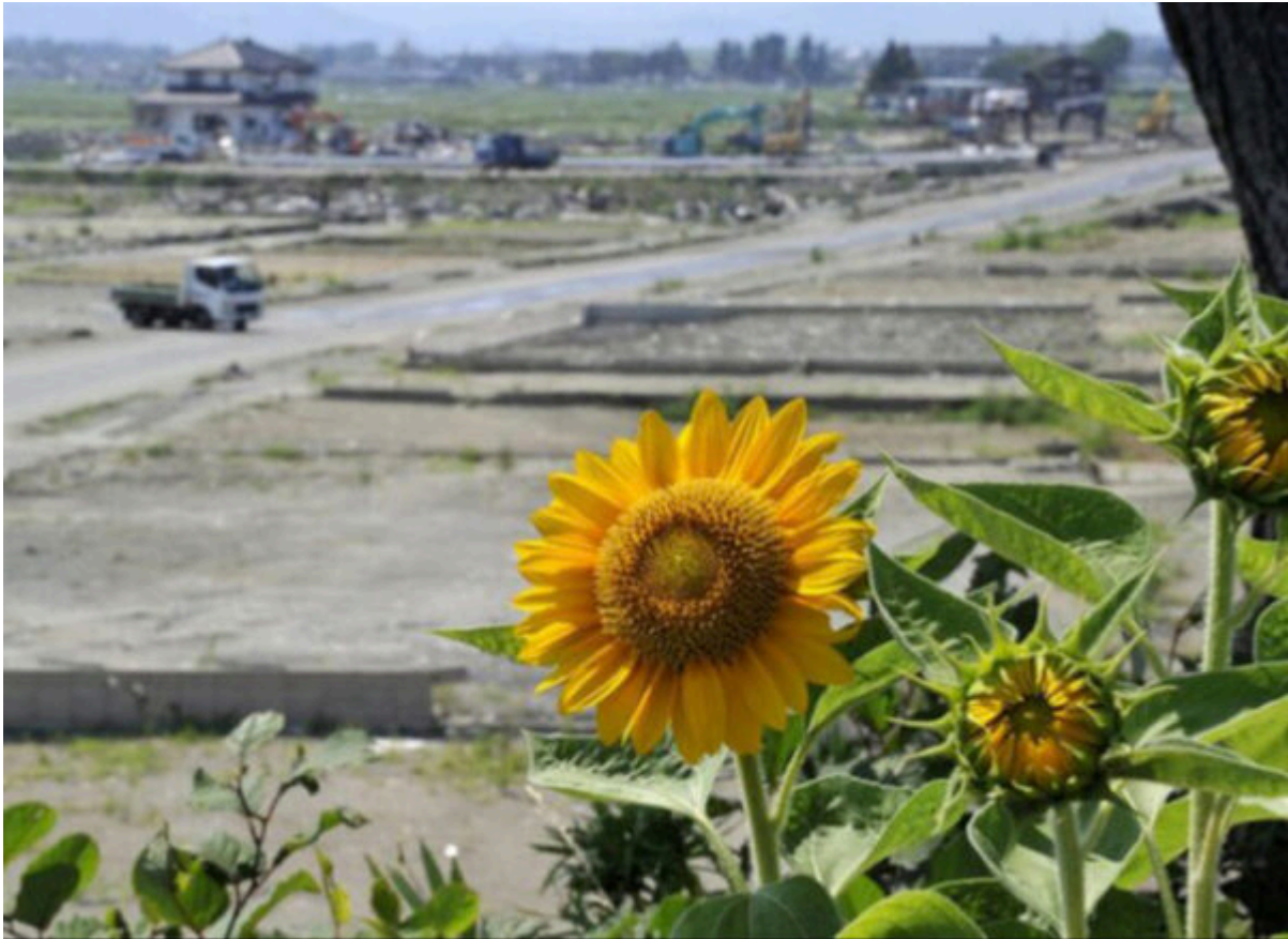
Sunflower remediation at Fukushima, Japan

Fresh air is our ultimate negative space... shared air. It will be exhilarating to robustly breathe together again. A greater context will become blazingly clear—we live under one sky, immersed in one atmosphere. We share air. With this, the post pandemic landscape begins to feel navigable as we locate where sky touches ground. And on that horizon is the Green New Deal.