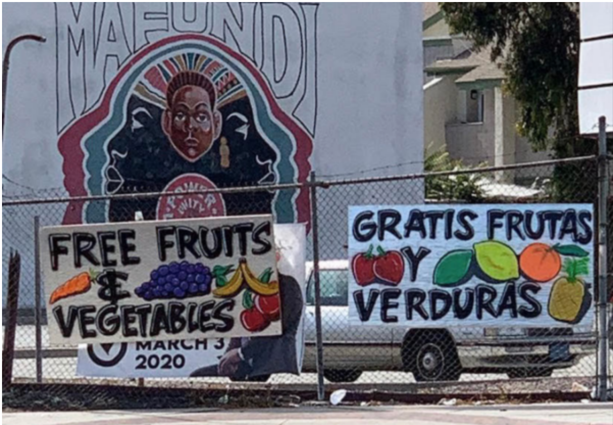
Lauren Halsey's Summaeverythang

Culture is regenerative. Art delivers supreme creativity with maximum velocity to the most precise target, generating the greatest possible impact. New value arises from negative space—the space between us. This is the territory of the Green New Deal.