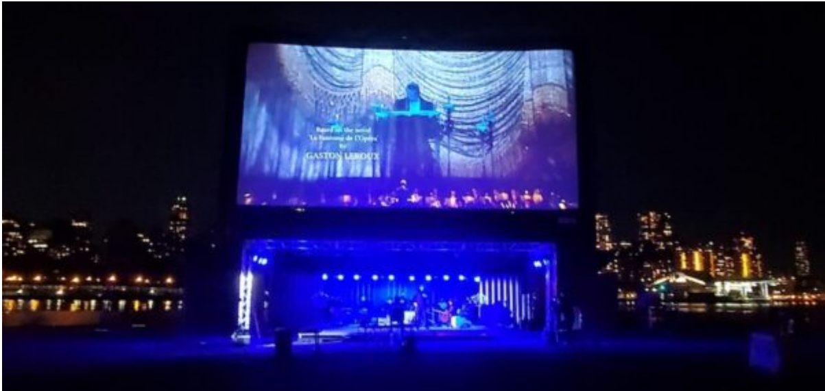
Radial Park, the pop-up Broadway drive-in theater at Hallett's Point in NYC

New York City had already planted a million trees and started seeding a billion oysters in the wake of Hurricane Sandy, and the massive BIG-U coastal infrastructure project was launched and underway. When Covid overran the city and theatres went dark, the Broadway spirit reawakened on the East River, democratized as a drive-in. Fifty thousand square feet of Astoria waterfront at Halletts Point became Radial Park—a hybrid drive-in movie theatre and performance stage realized by the magic of container architecture. Broadway films and live performers made for a new style of a night on Broadway. Thousands of New Yorkers could safely share air and art thanks to this re-visioned, regenerated, re-contextualized open space.