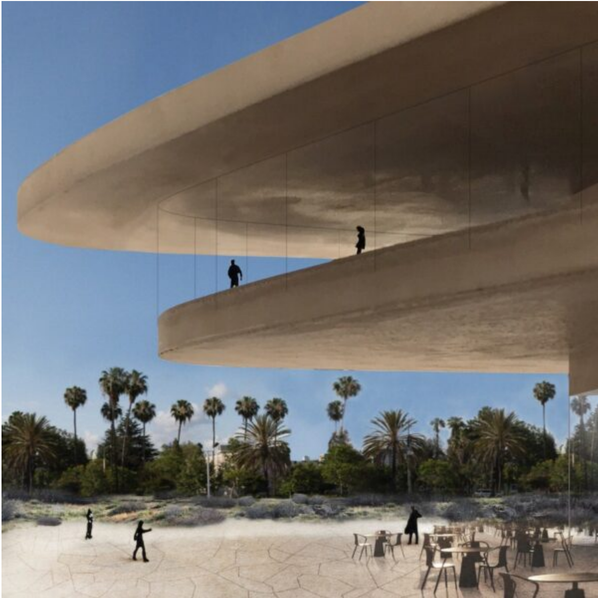
Peter Zumthor's LACMA (detail)

Zumthor's vision has proven to be prophetic. Elevating and stretching the building redraws the civic grid. By doing so, it maximizes outdoor space and redefines the contextual landscape. A single, greater park is created. The buildings become sited within a whole landscape, standing within a single and omnipresent atmosphere. Hancock Park becomes an arts and science park spanning multiple city blocks, from Fairfax to Curson, Sixth Street to Wilshire and across to embrace the soon to be historic Perreira tower and plazas. The new LACMA erases edges, becoming not just content but context. It reaches out and across. From within it we can see the horizon.