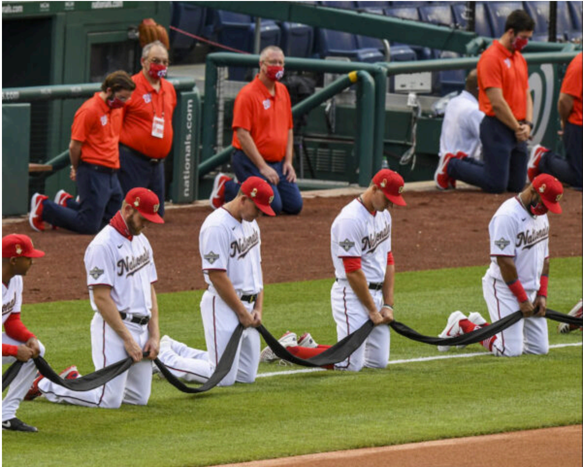
Washington Nationals, BLM Tribute

The pandemic closed major league baseball to the public. In Washington DC, the home of the reigning 2019 World Champions was in danger of becoming a quarantined behemoth on the DC waterfront. The Washington Nationals executed a beautiful civic flip, and the stadium became a community center, hosting Chef Andre's community food kitchen, free flu shots, voting booths, and vaccines. Now the area is under a major public redevelopment. The construction of the new Frederick Douglas Bridge will carve acres of new public space and greenswards. Home to two major league stadiums (baseball and soccer), what new possibility for the waterfront community can be gained by these now redefined civic icons? The Coliseum in Rome after all was more than a sports arena—it was a cultural center, a theatre of spectacle and public square. Who can forget the George Floyd/BLM tributes staged by our athletes at the openings of the 2020 NBA, NFL, and MLB seasons?