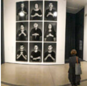
Shirin Neshat at The Broad