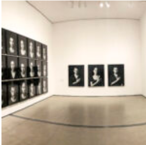
Shirin Neshat at The Broad