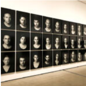
Shirin Neshat at The Broad