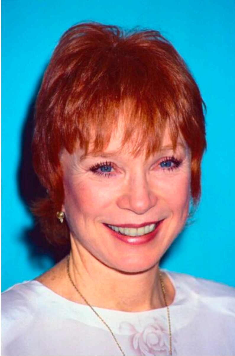
Shirley MacLaine

In 2014, I featured Shirley MacLaine among the classic profiles of 15 legendary movie stars that I wrote for the Golden Globes website, read it here , and included, of course, Jack Lemmon .