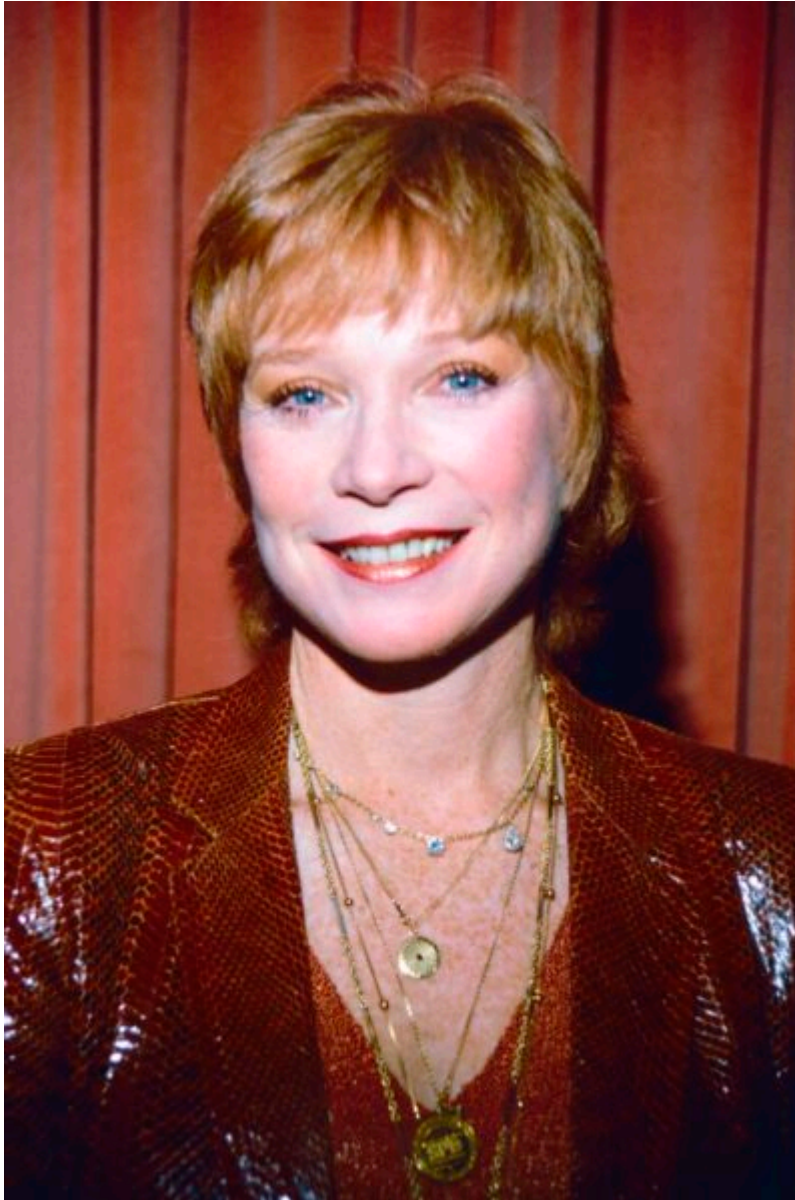
Shirley MacLaine

The first time I interviewed Shirley MacLaine was in 1983, about Terms of Endearment by James Brooks, and I also photographed her.