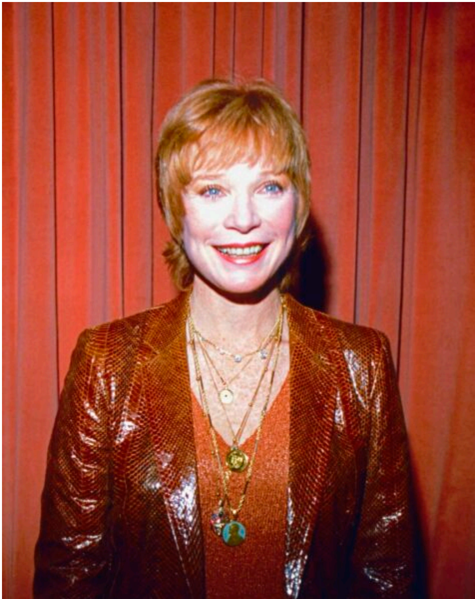
Shirley MacLaine

Shirley MacLaine celebrated her 90th birthday in 2024 by publishing a book: The Wall of Life . 150 photographs about her “wonderful life” that were grouped as montages on a wall of her Malibu home.