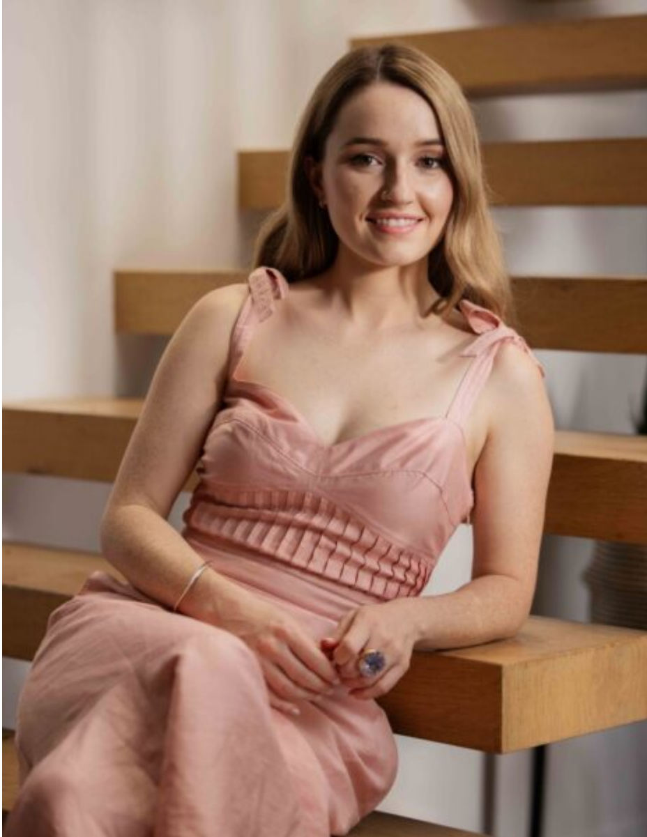
Kaitlyn Dever as Belle

Kaitlyn Dever plays Belle Gibson , an Australian social media influencer who falsely claimed to have cured a malignant brain tumor through a regimen of healthy recipes detailed in her app The Whole Pantry launched in 2013 and a cookbook published in 2014.