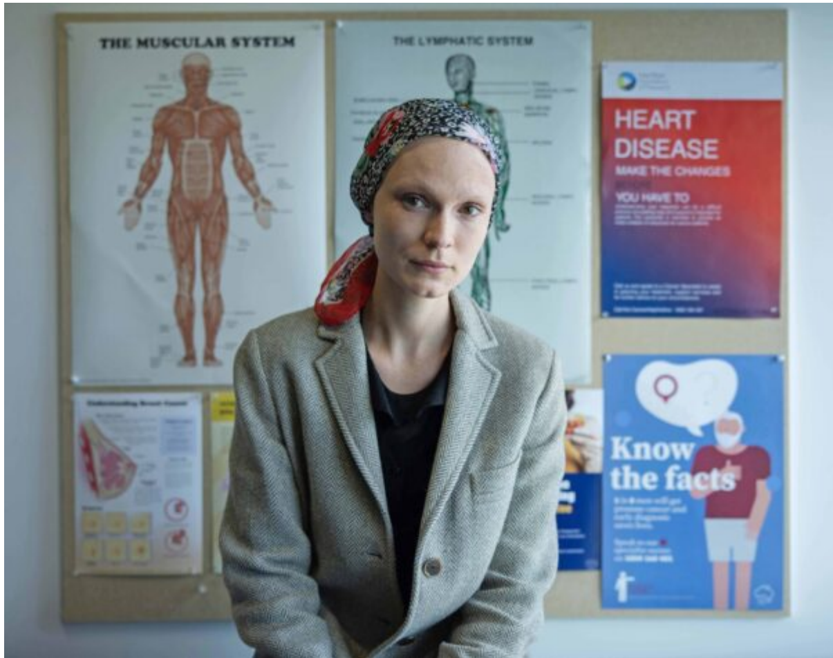
Tilda Cobham-Hervey as Lucy