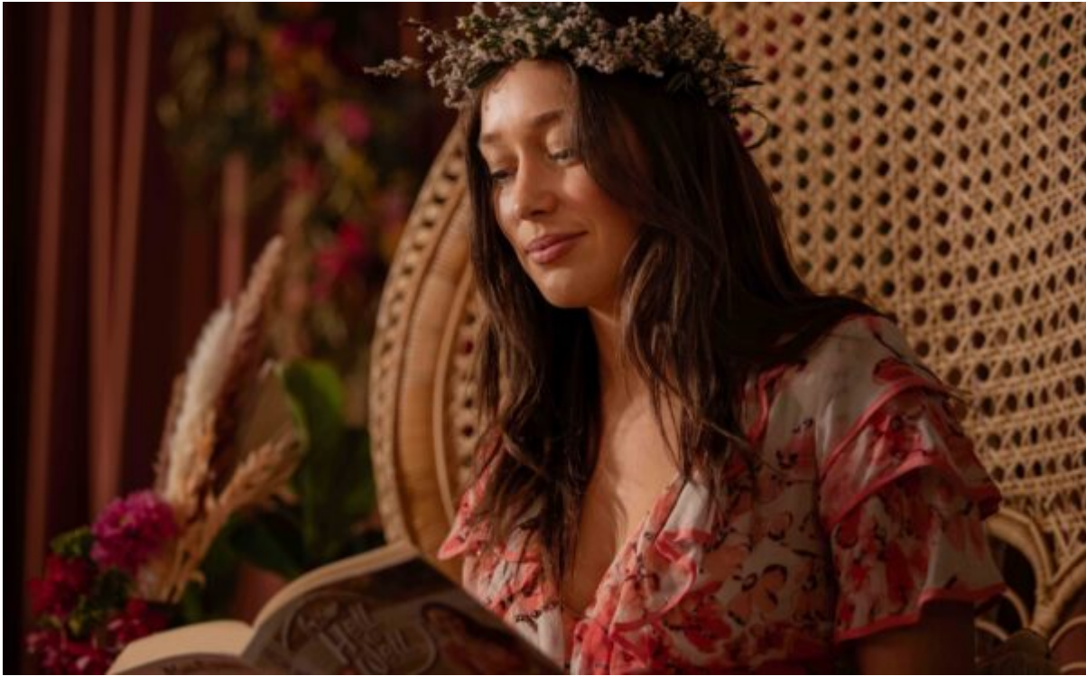
Alycia Debnam-Carey as Milla