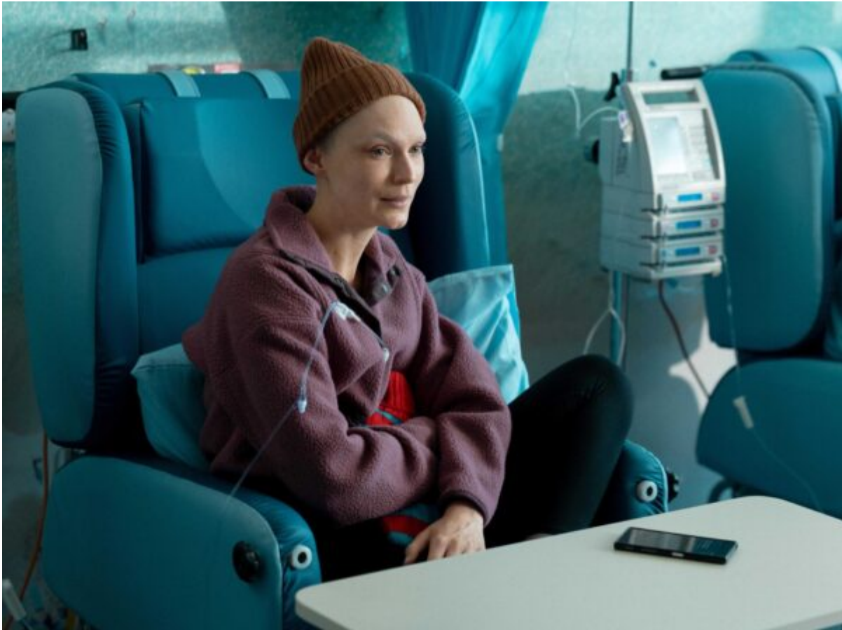
Tilda Cobham-Hervey as Lucy

There is no doubt that eating a diet rich of fruits, vegetables and whole grains, limiting sugar intake, and exercising are beneficial to your health, as are spiritual practices like yoga and meditation. Unfortunately none of these methods appear to get rid of cancerous cells, and we are stuck with the conventional medical treatments of surgery, chemotherapy, radiation and immunotherapy. See here a list of unproven and disproven cancer treatments.