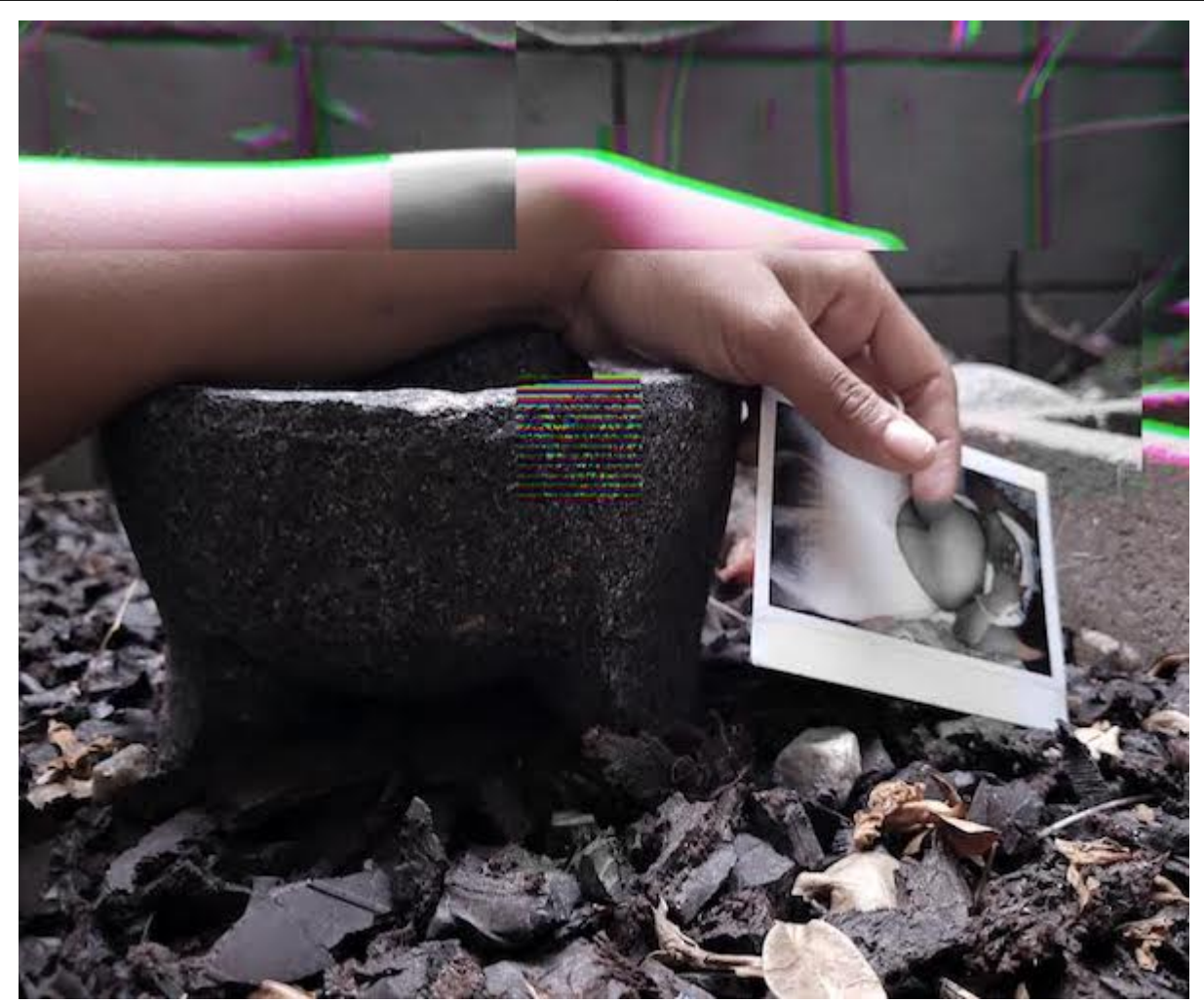
Showbox LA.