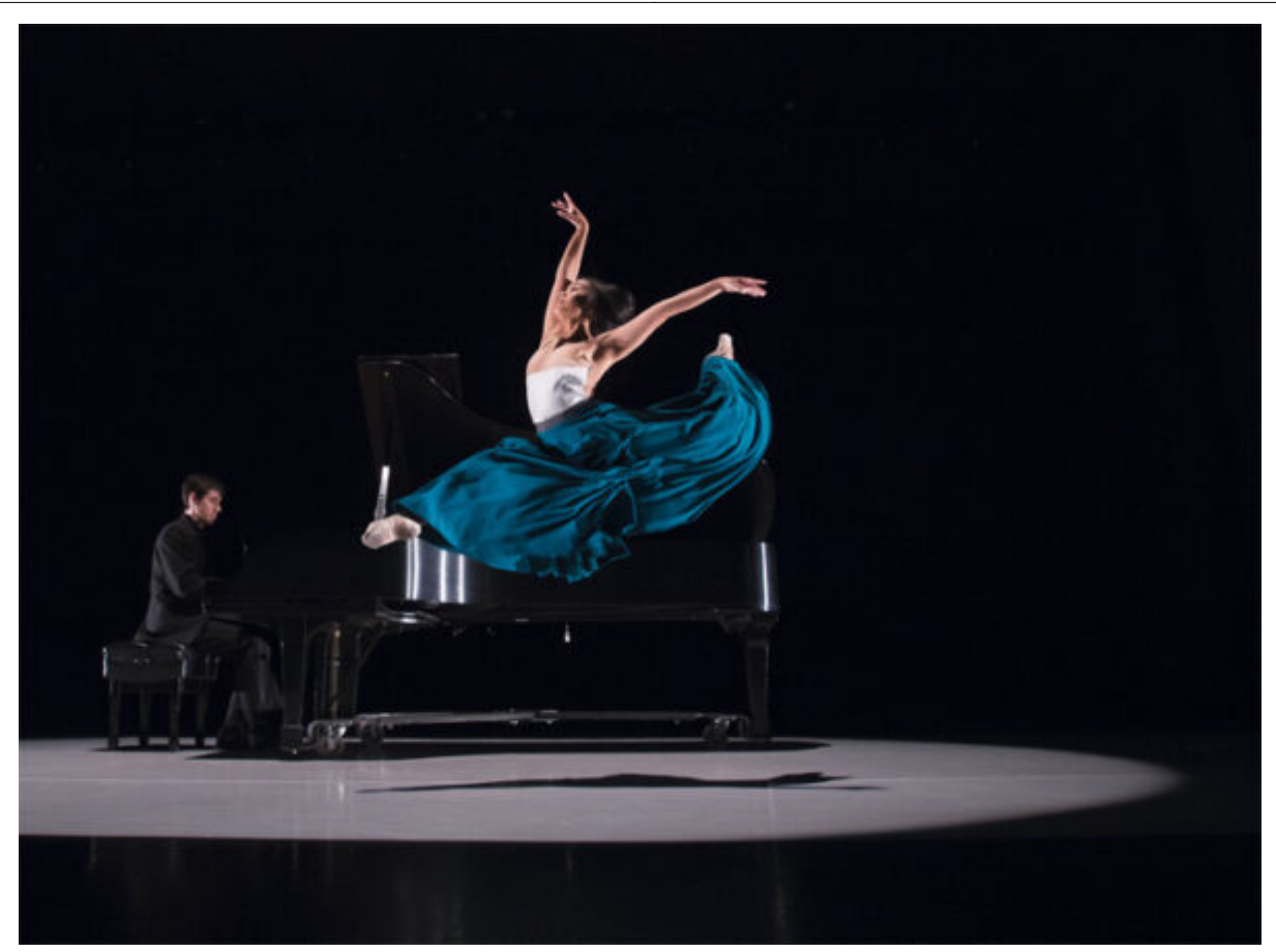
CSULB Dance.