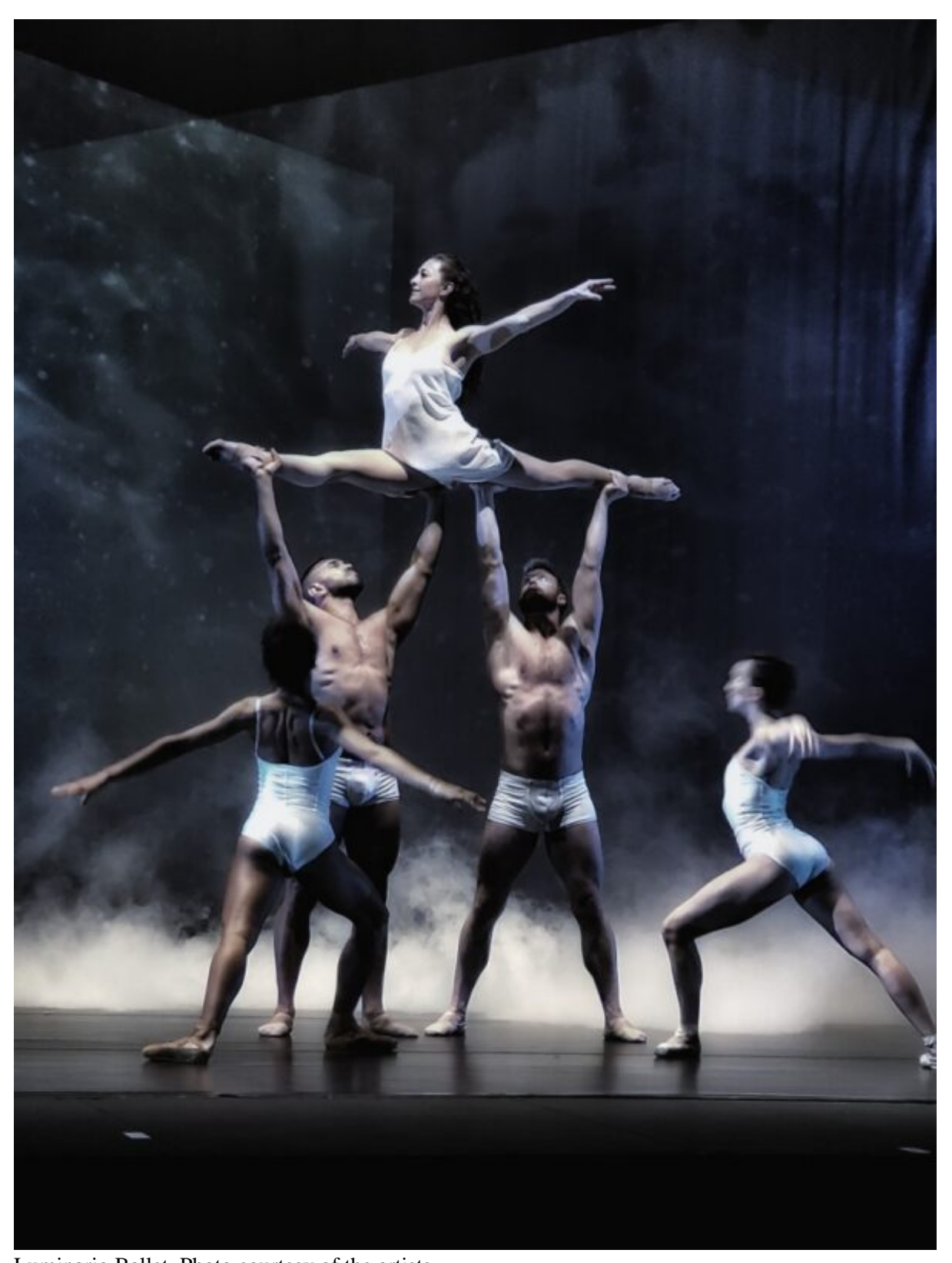
Luminario Ballet.

• Luminario Ballet at the Avalon, Hollywood; Sun., Nov. 21, $35 + Luminario Ballet.