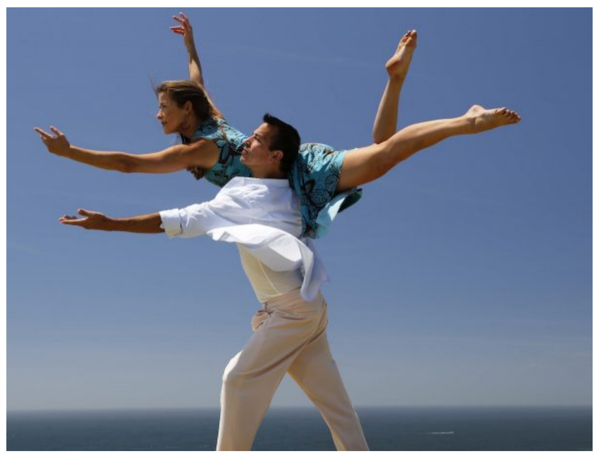
Nannette Brodie Dance Theatre.