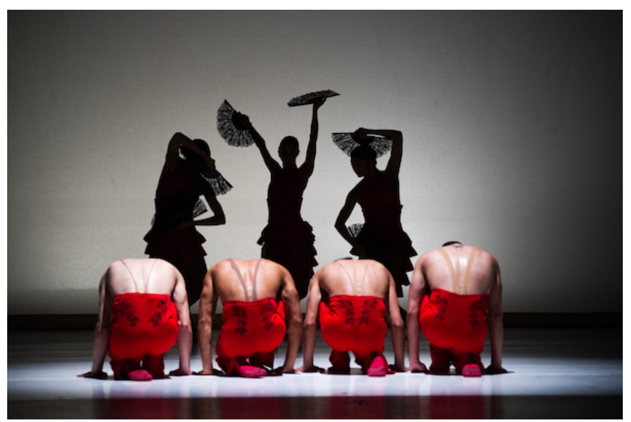
Ballet Hispánico.