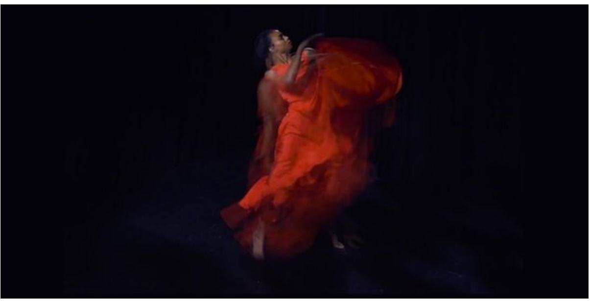
Zoe Rappaport's "Unspoken Words."

The 5<sup>th</sup> annual Los Angeles Dance Shorts Film Festival presents 16 films. The evening includes a pop-up performance before the screening. Live or online at Mimoda Studio, 5774 W. Pico Blvd., Pico-Robertson; Sat., Nov. 13, 7:30 pm, $20; Online Sat., Nov. 13, 7:30 p.m., $12. Details, tickets, & Covid protocols at Los Angeles Dance Shorts Film Festival.