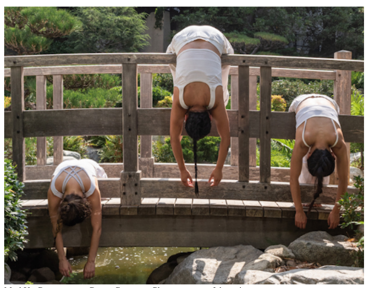
MashUp Contemporary Dance Company.

The film of bound / less , the October 23rd performance from MashUp Contemporary Dance Company celebrating Women's Equality Day now is online, viewable through Nov. 30, free. MashUp Contemporary Dance Company.