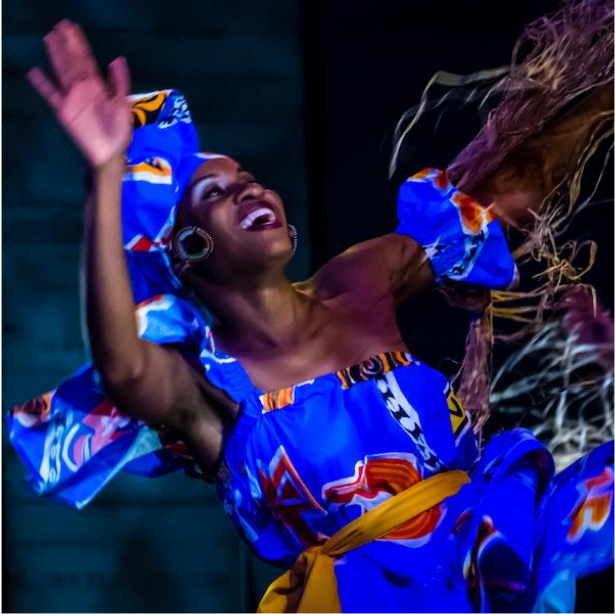
Viver Brasil.