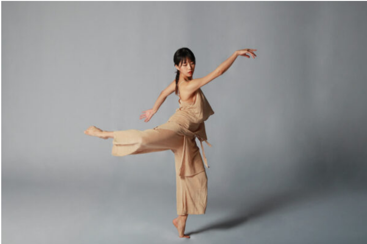
Films.Dance.