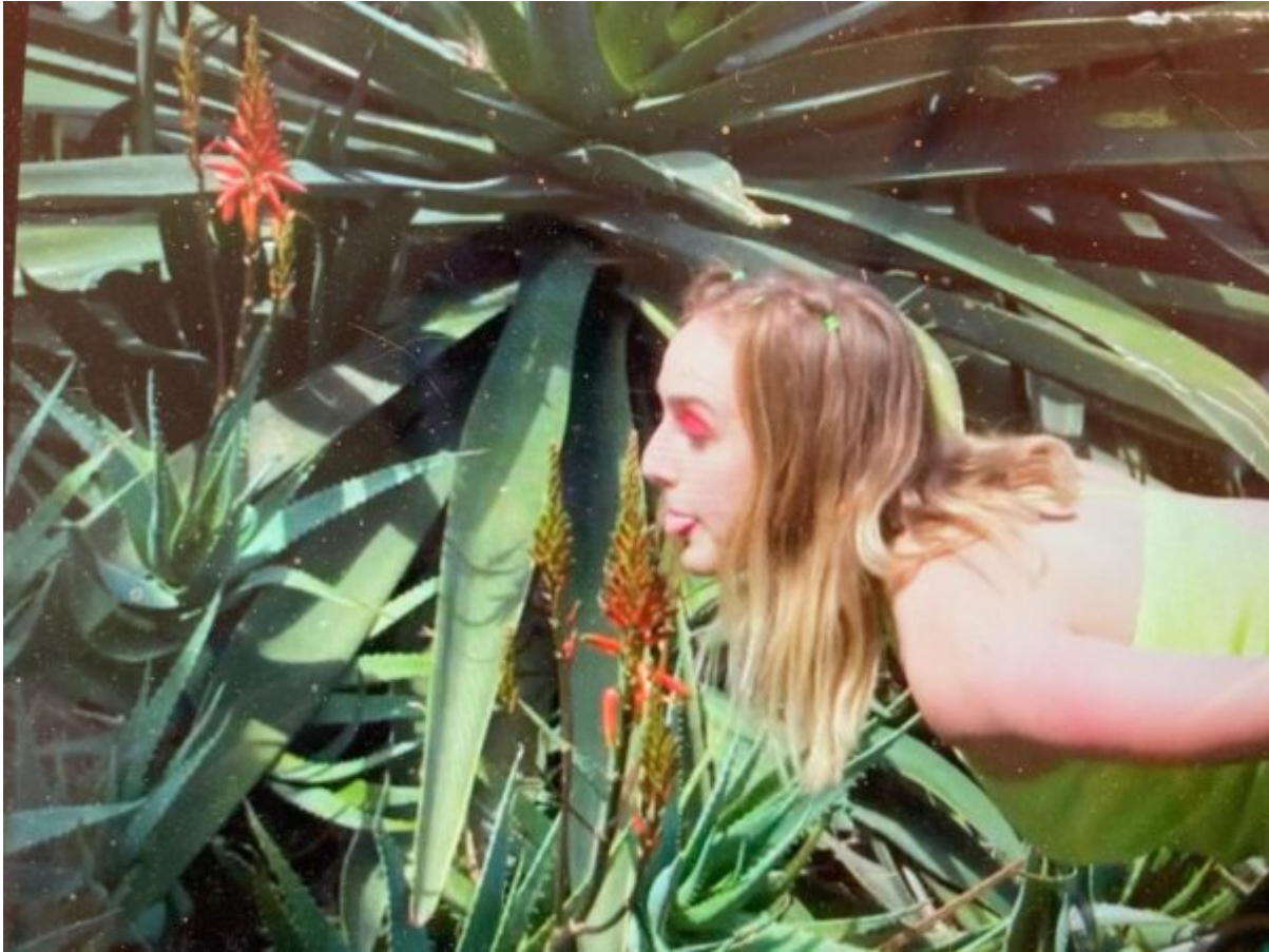
Rosanna Gamson/WorldWide.

the tales of the ten travelers unfold one at a time, Gamson's The Decameron Project rolls out ten films, each made by a different artist. All ten episodes are now live and viewable for free on RGWW and on Instagram .