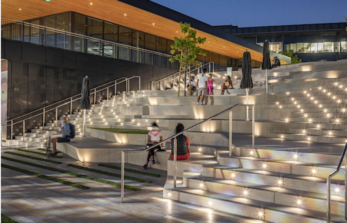
Heidi Duckler Dance.