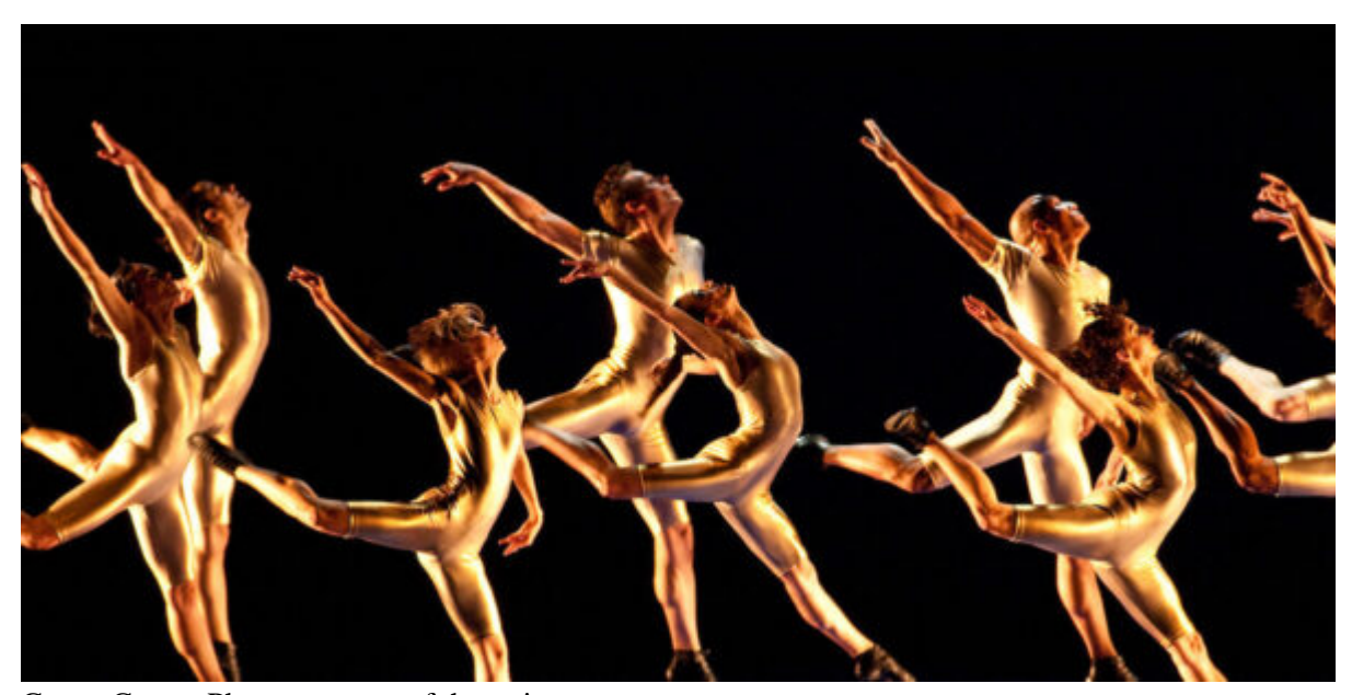
Grupo Corpo.

Last seen here in 2011, the Brazilian contemporary company Grupo Corpo is known for combining contemporary ballet with cultural elements for a distinctive take on dance. The company name loosely translates from the Portuguese as "body group" and has been known for its distinctive use of classical music along with Brazilian composers. For the three-part ballet, 21, the choreography to music by Marco Antônio Guimarães combines the energy of Brazilian folk dances with the formality of classical ballet as the company's 22 dancers explore rhythmic and timbral combinations around the number 21. Afro-Brazilian religious rituals fuel the second work, Gira , as choreographer Rodrigo Pederneiras reconstructs the gestures of Umbanda and Candomblé ceremonies set to 11 musical themes by the Brazilian fusion group Metá Metá. Music Center, Ahmanson Theatre, 135 N. Grand Ave., downtown; Fri.-Sat., May 2-3, 7:30 pm, Sun., May 4, 2 pm, $27-$78. Music Center.