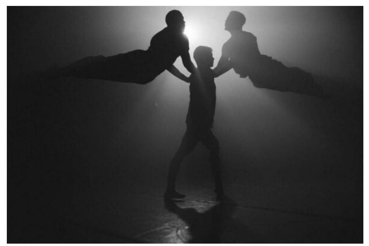
LA Dance Project.