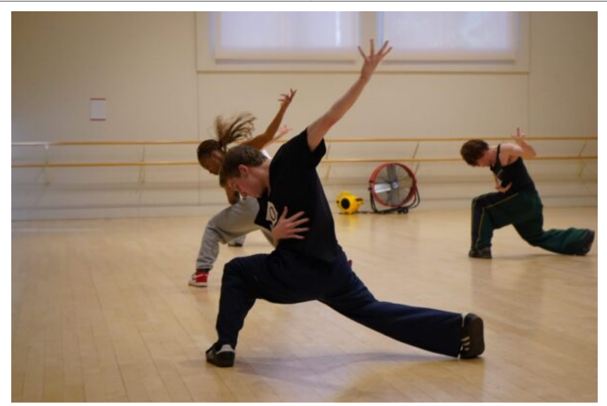
USC Kaufman students rehearsing.