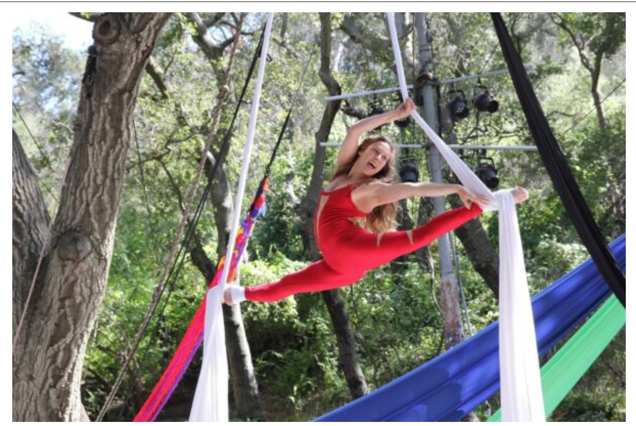
MOMentum Place.