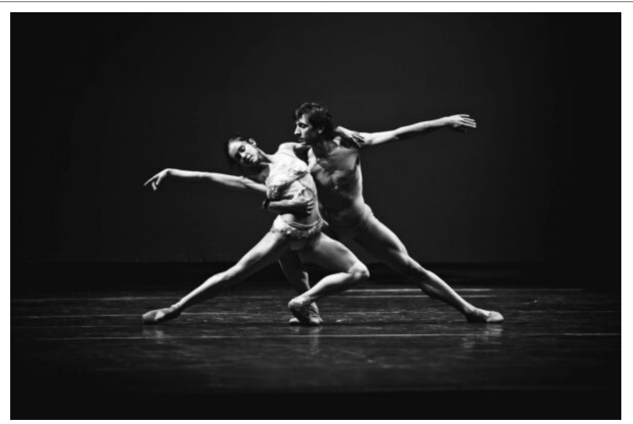
Hollywood Ballet.