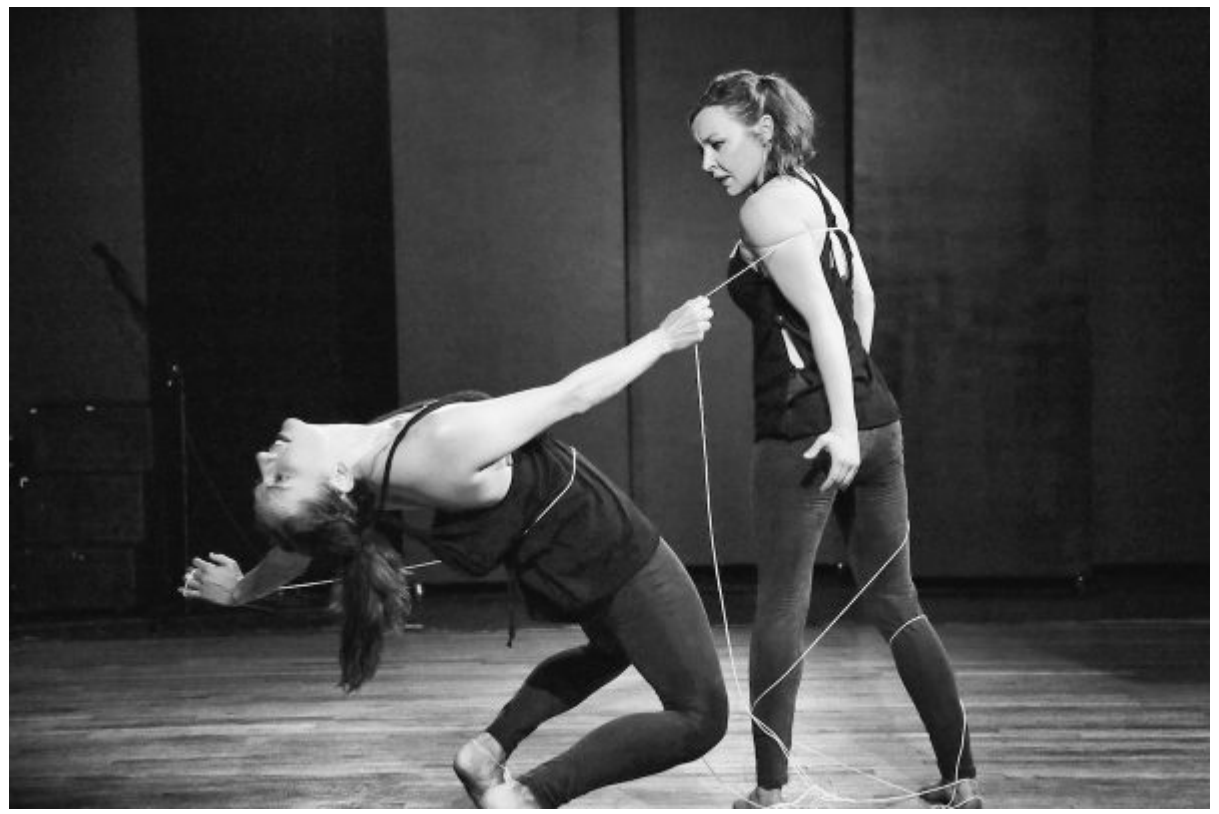
Lineage Dance.

This entry was posted on Thursday, July 14th, 2022 at 8:00 am and is filed under Theatre, Music, Dance