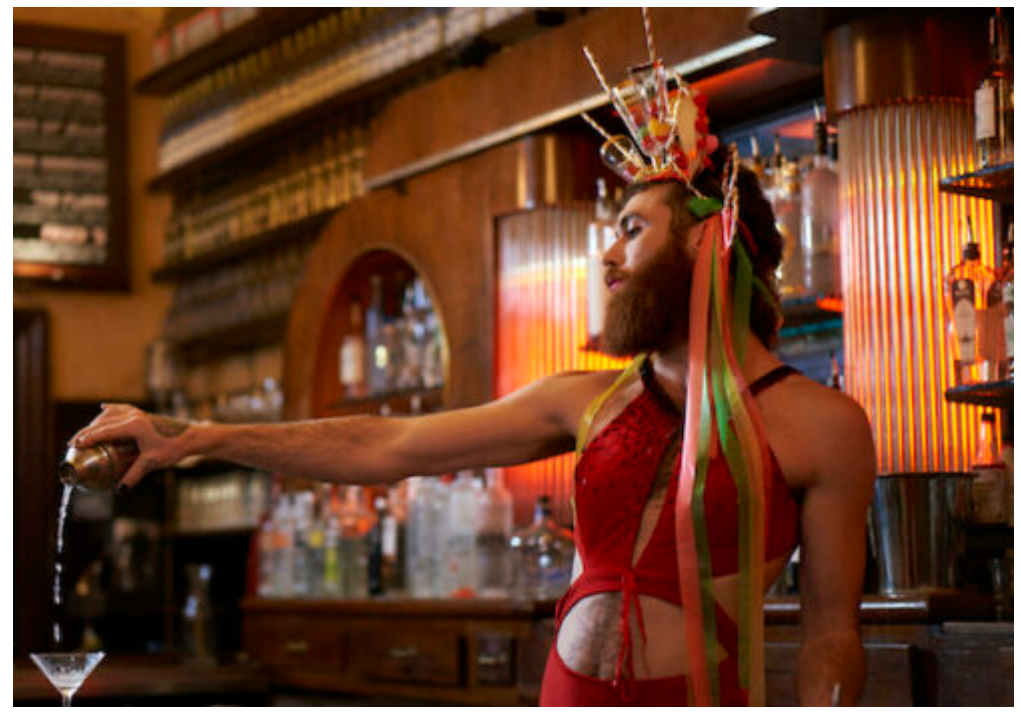
Heidi Duckler Dance.