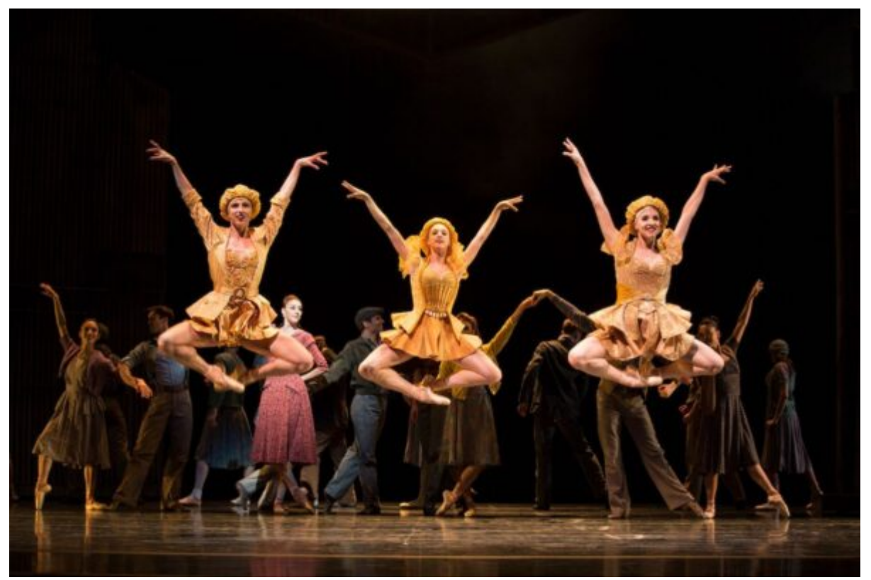
Pacific Northwest Ballet.