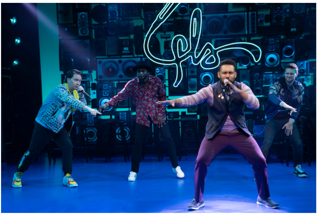
"Freestyle Love Supreme."

Veneziale, creating the street dance infused Freestyle Love Supreme . That early effort gets a full stage production at Pasadena Playhouse, 39 S. El Molino Ave., Pasadena; Tues.-Fri., 8pm, Sat., 2 & 8pm, Sun., 2 & 7 pm, thru Sun., Aug. 7, $34-$106. Pasadena Playhouse.