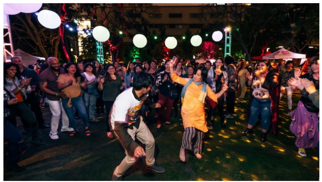
Dance DTLA Bollywood.