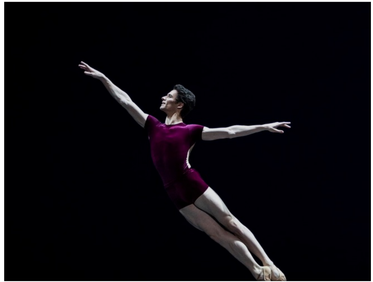
Paris Opera Ballet. Photo courtesy of the artists