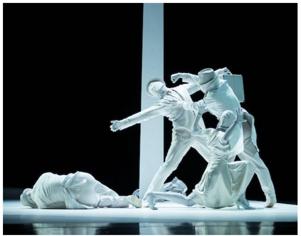
Pacific Northwest Ballet. Photo by Angela Sterling