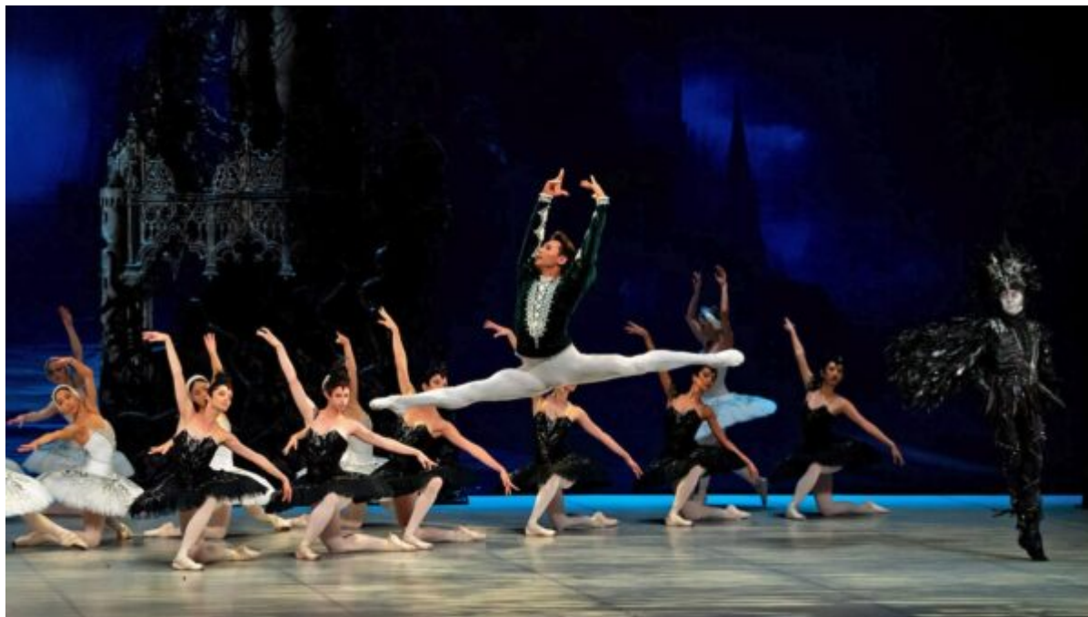
World Ballet.