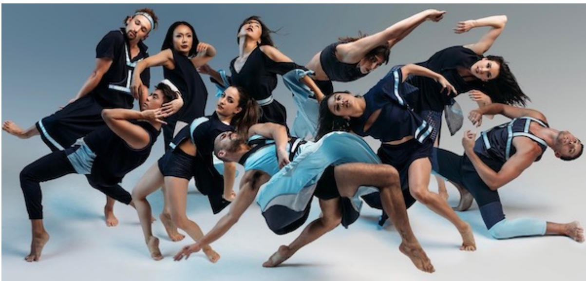
Entity Contemporary Dance.