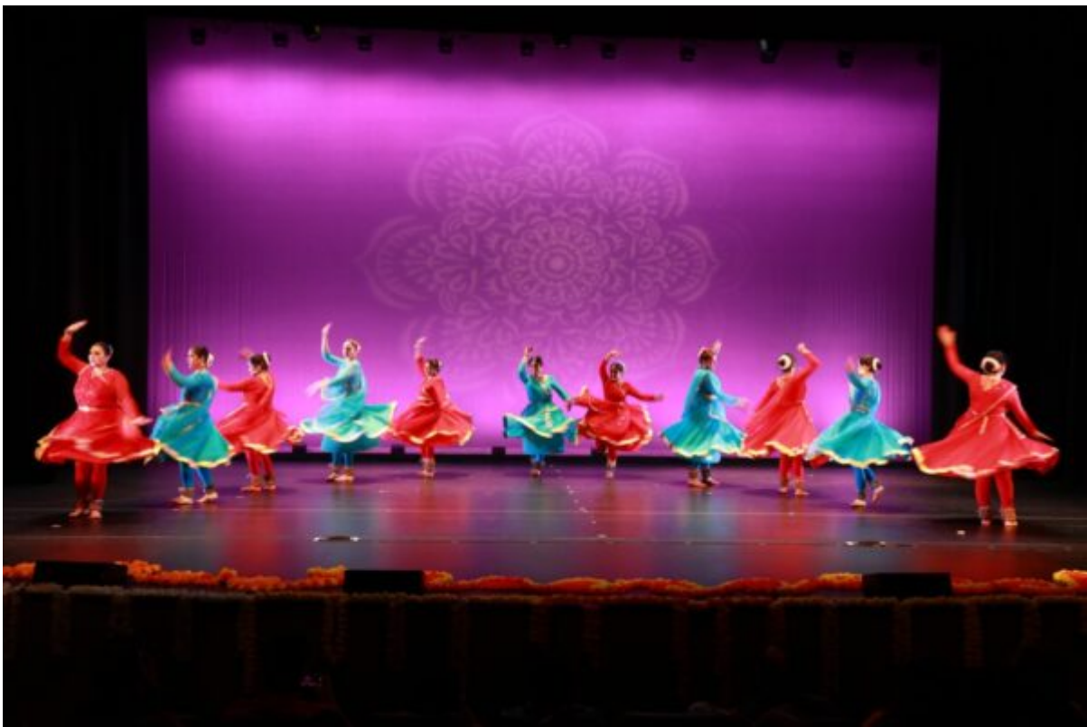
Kathak Kala Kendra Academy.