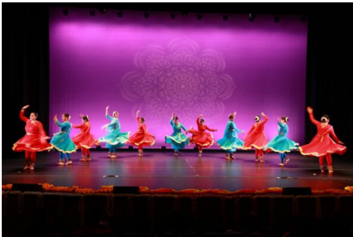
Kathak Kala Kendra Academy.