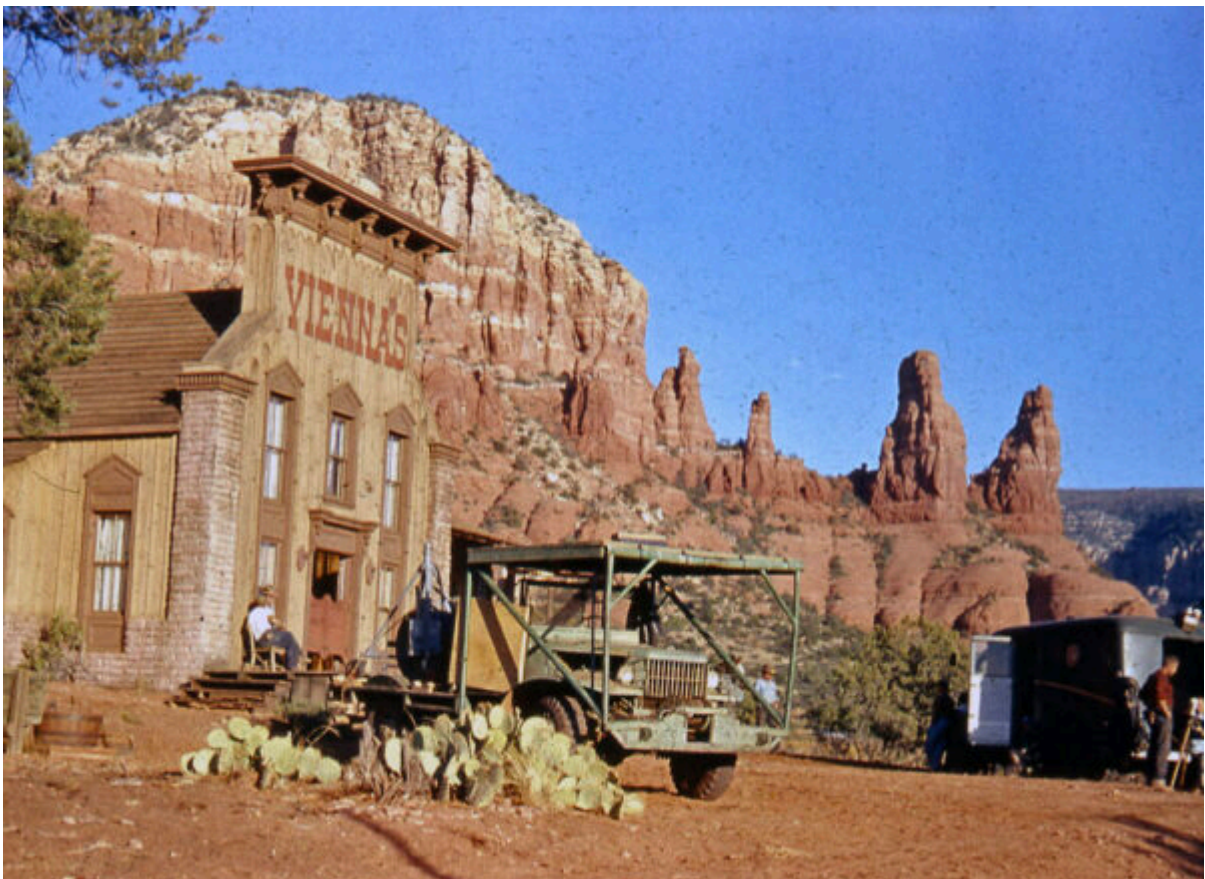
Johnny Guitar set

On Tuesday afternoon we were treated to a leisurely ride in a renovated vintage train of the Verde Canyon Railroad.