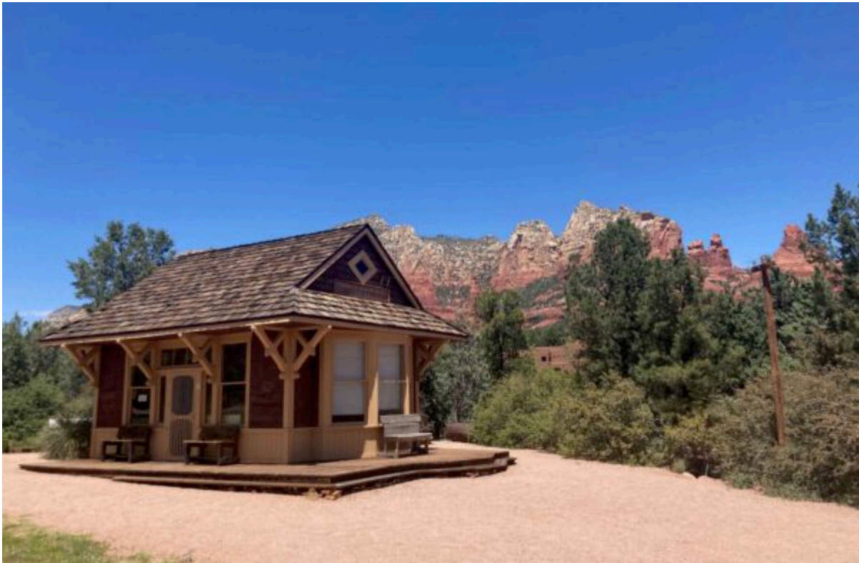
Telegraph Office. Sedona Heritage Museum