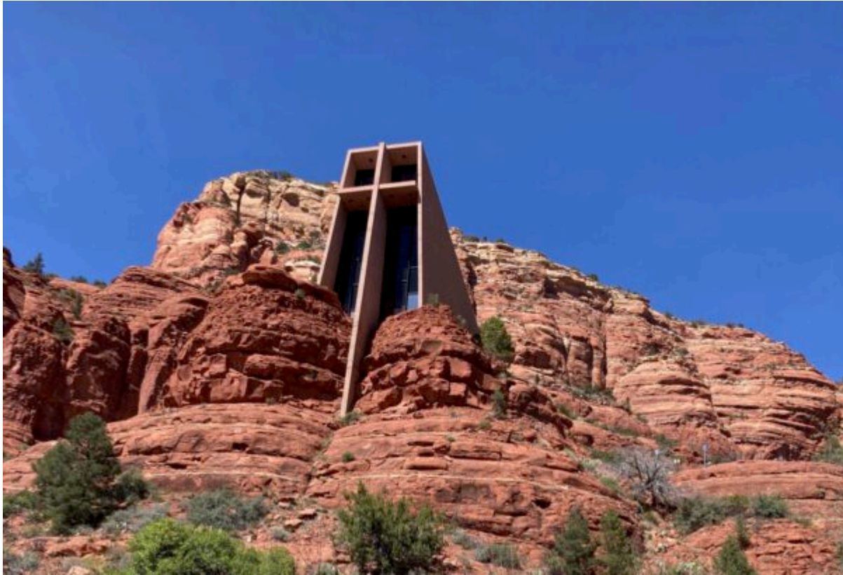
Chapel of Holy Cross