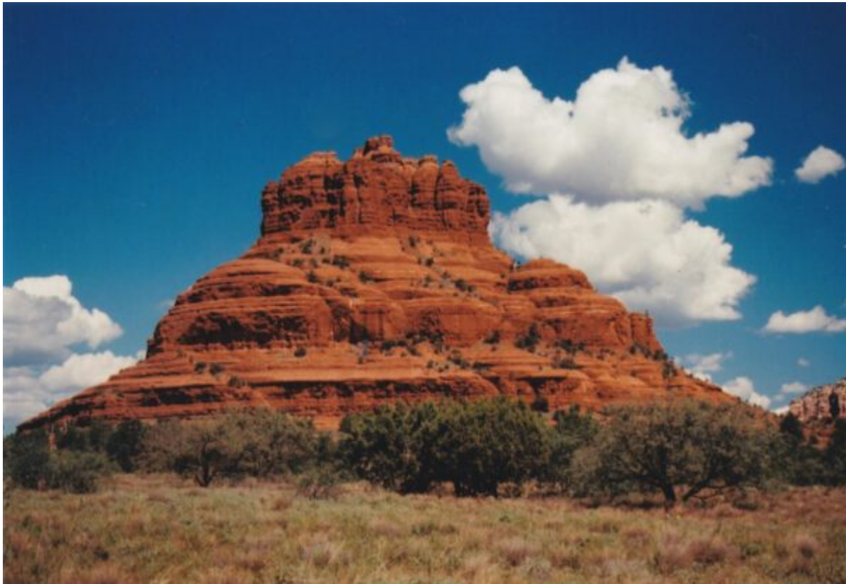
Bell Rock