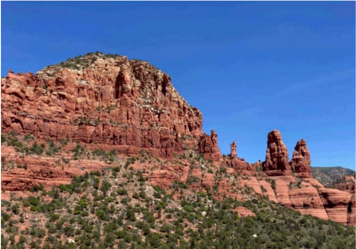
Red Rocks. Twin Sisters

On Tuesday afternoon we were treated to a leisurely ride in a renovated vintage train of the Verde Canyon Railroad.