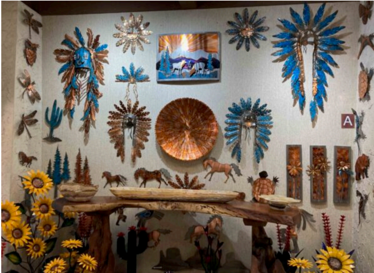
Shop. Uptown Sedona

If you are interested in exploring that aspect of Sedona, Road Scholar offers this program: " Sedona's Healing Arts for Women: Yoga, Qi Gong, Ayurveda and More."