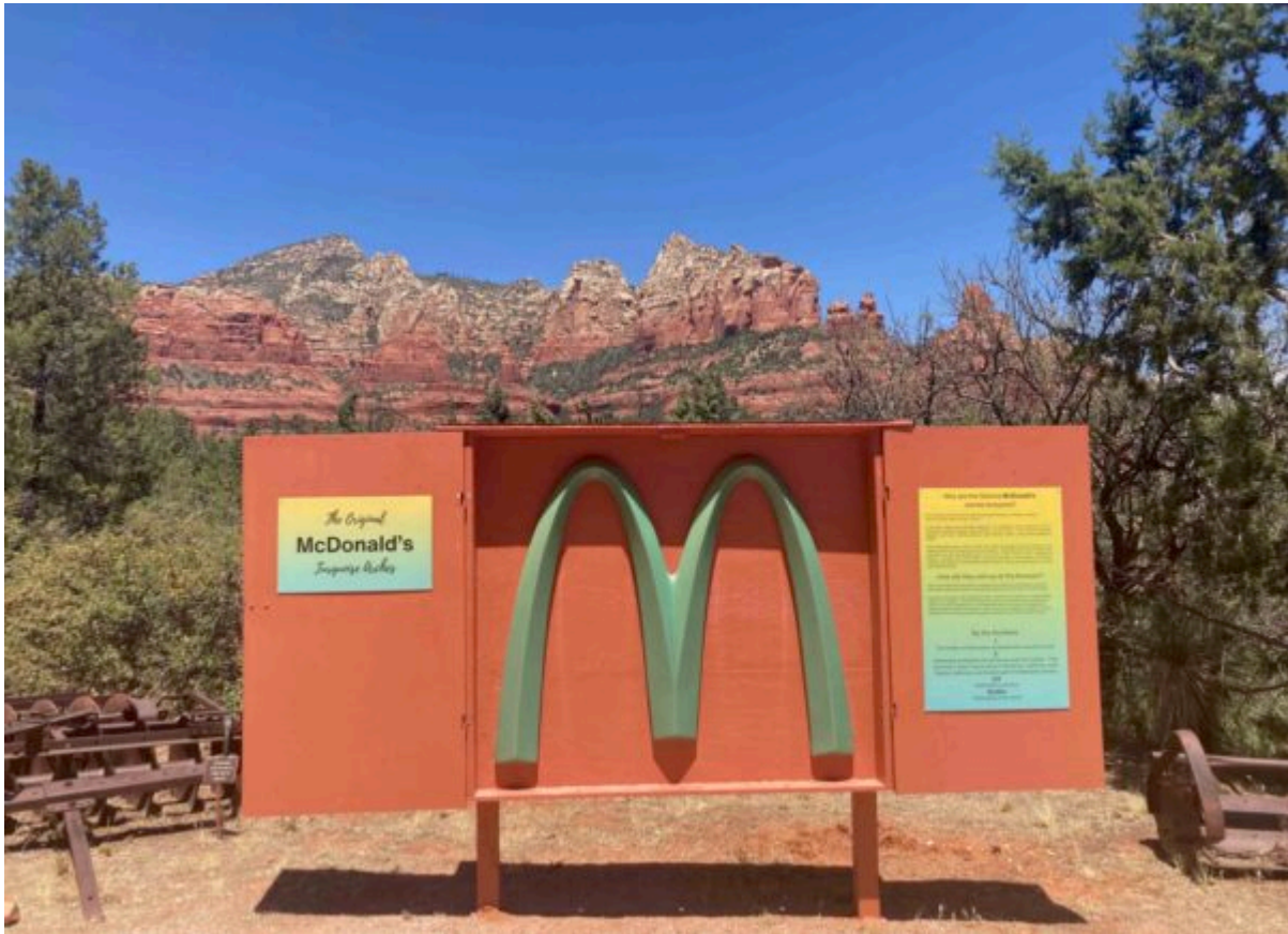
McDonald's turquoise arches. Sedona Heritage Museum

The museum has a partnership with the Sedona Film Festival , and they jointly show movies, such as The Rounders (1965) with Henry Fonda and Glenn Ford.