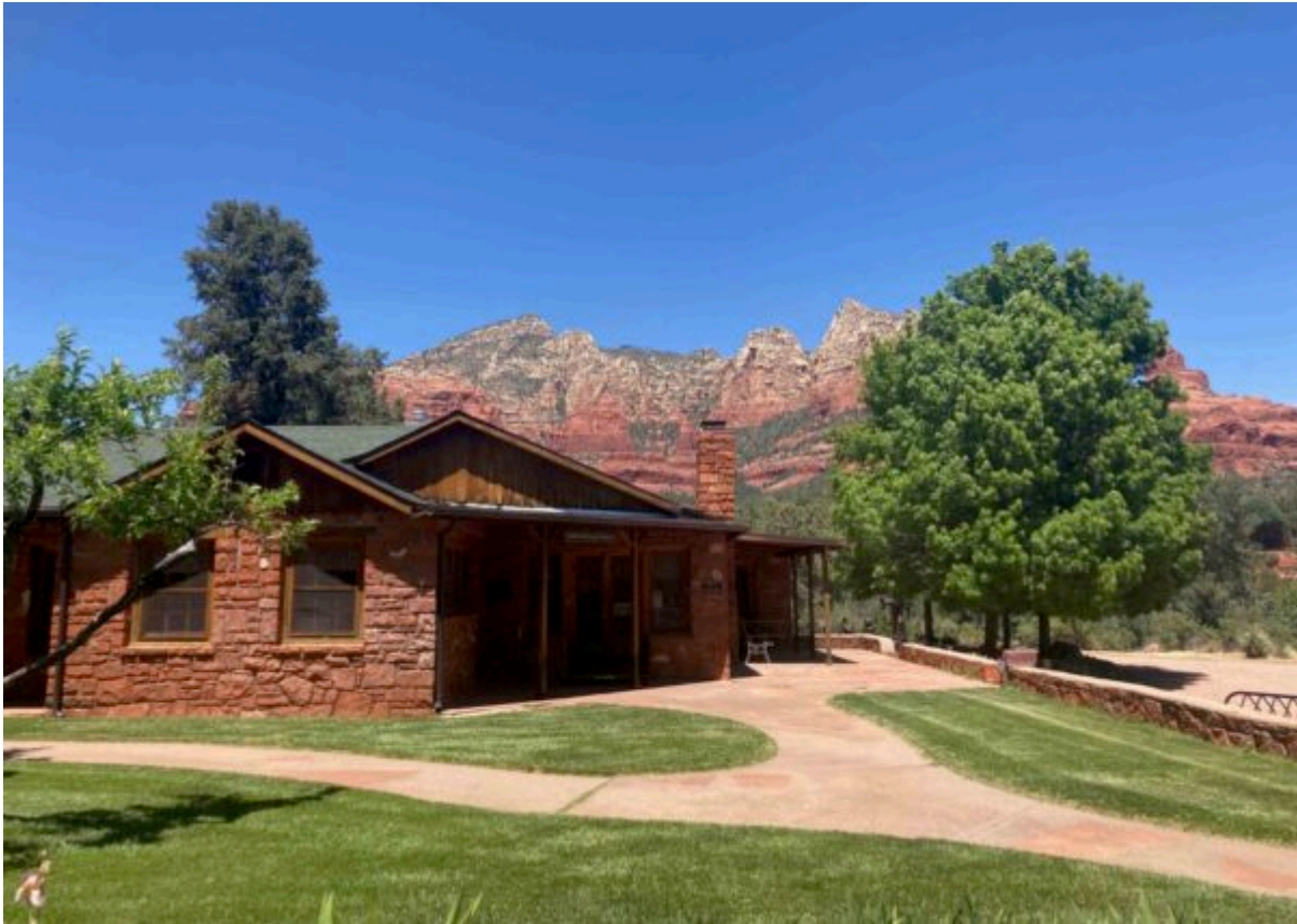
Sedona Heritage Museum