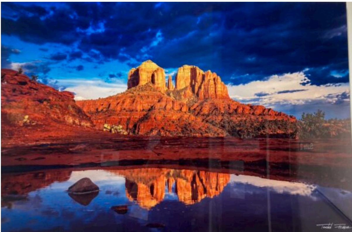
Cathedral Rock painting by Todd Frame

I took a walk in Downtown Sedona, which they call Uptown. I watched people of all ages working on clay art pieces at Sedona Arts Center . I walked into souvenir shops and art galleries, I discovered a Mexican restaurant with an enticing menu of food and drinks, 89 Agave Cantina , I enjoyed a sparkling rosé at the Art of Wine .