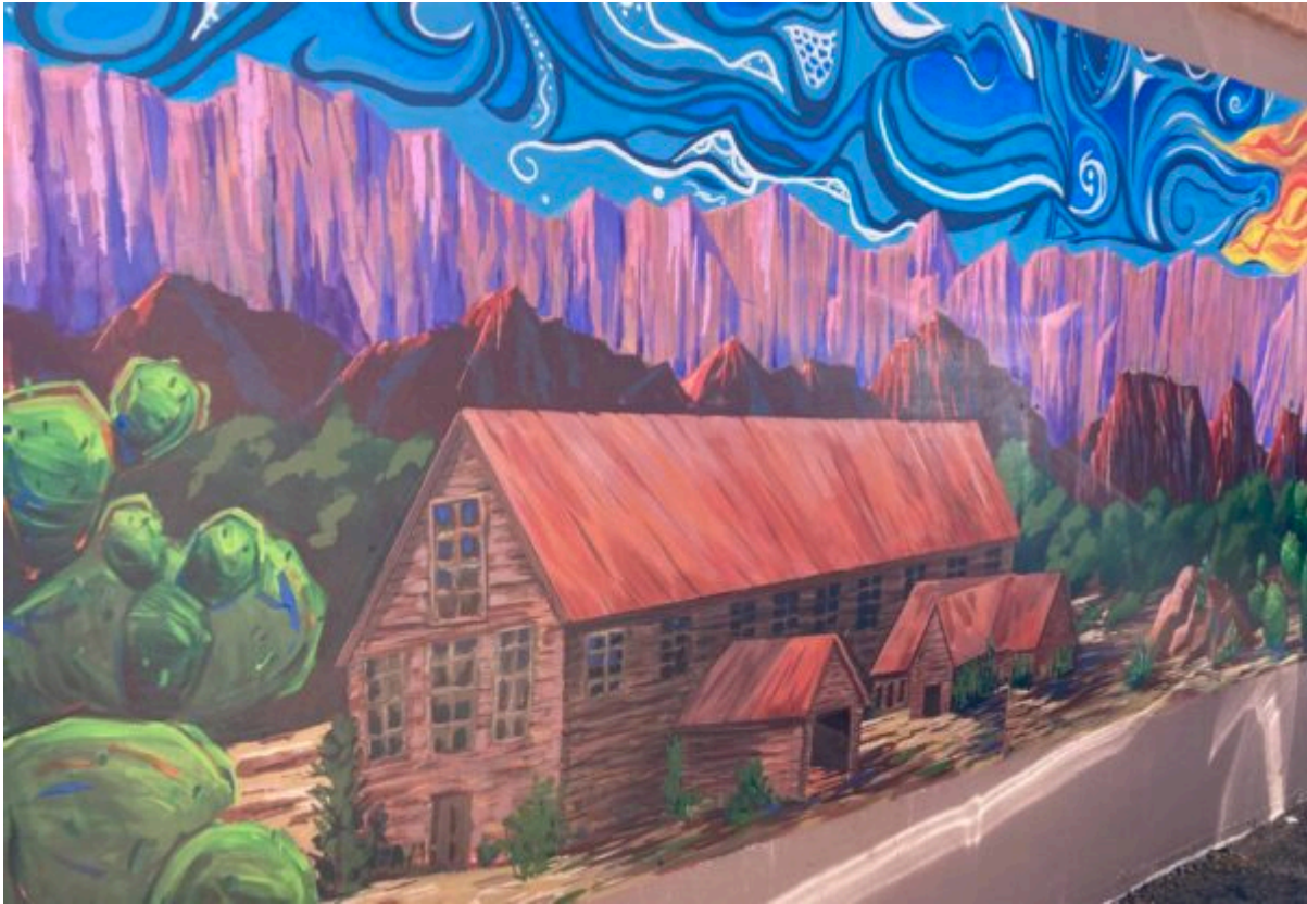
Barn mural. Sedona Art Center

I took a walk in Downtown Sedona, which they call Uptown. I watched people of all ages working on clay art pieces at Sedona Arts Center . I walked into souvenir shops and art galleries, I discovered a Mexican restaurant with an enticing menu of food and drinks, 89 Agave Cantina , I enjoyed a sparkling rosé at the Art of Wine .