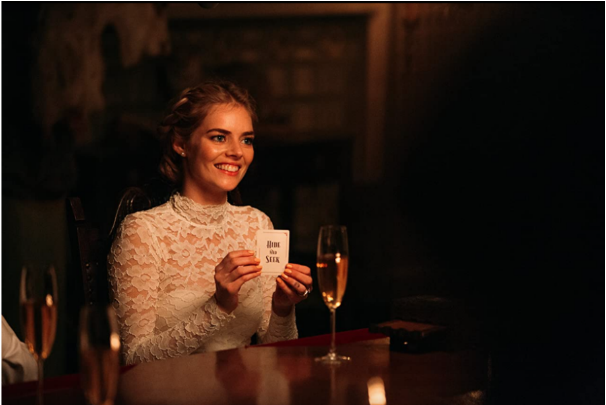
Samara Weaving in Ready or Not (2019)

Grace marries into a rather eccentric family, and goes straight from the wedding to their estate. Their wealth comes from a game-making ancestor, and family tradition has the new bride playing games with them at the dead of night. Unfortunately, Grace pulls 'hide-and-seek' out of the hat, and has to fight to survive the night.