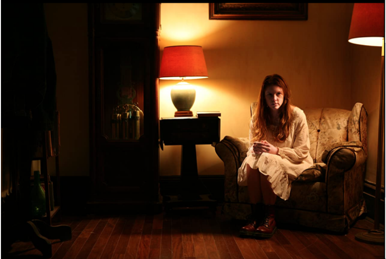
Ashley Bell in The Last Exorcism (2010)

Pastor Marcus feels guilty for his years of profiting off the faithful, especially when performing sham exorcisms. He decides to make a documentary exposing the tricks of the trade, making his way to Louisiana to perform the titular last exorcism. Of course, the one exorcism he decides to record turns out to be the real deal!