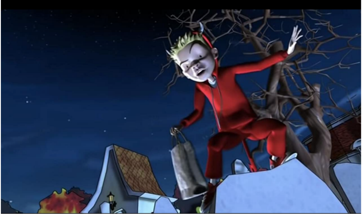
Scary Godmother: Halloween Spooktacular (2003)

Hannah Marie is taken Trick-or-Treating by her jerk cousin, Jimmy. Jimmy and his pals scare her so badly that she runs away in tears and is found by a weird woman in a witch costume. Her new Scary Godmother takes her to a Halloween party filled with vampires, skeletons, and werewolves, and Hannah Marie learns that she's braver than she had ever thought.