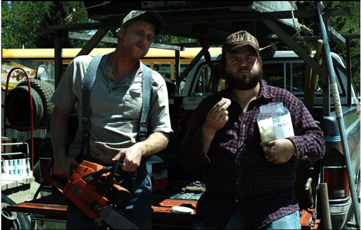
Alan Tudyk and Tyler Labine in Tucker and Dale vs. Evil (2010)

Best buds Tucker and Dale are excited to take a vacation out in the woods. Things get complicated when a group of high schoolers have the same idea, and mistake the duo for murderous hillbillies.