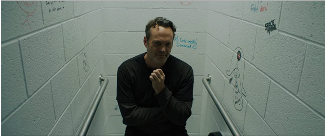
Vince Vaughn in Freaky (2020)

Millie is just your average, unpopular high school girl. Sure, her town is haunted by the legend of The Butcher, but who doesn't love a bit of hometown folklore? In a bizarre twist of fate, she wakes up in the body of the very real serial killer, and only has 24 hours to get her body back.