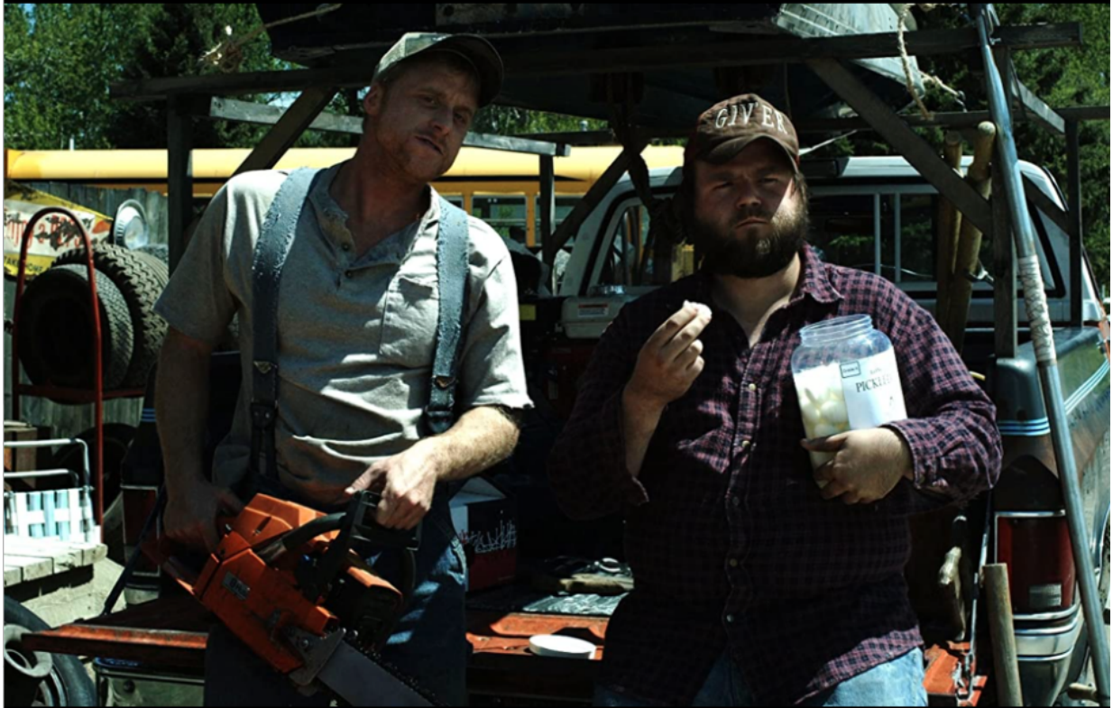
Alan Tudyk and Tyler Labine in Tucker and Dale vs. Evil (2010)

Best buds Tucker and Dale are excited to take a vacation out in the woods. Things get complicated when a group of high schoolers have the same idea, and mistake the duo for murderous hillbillies.