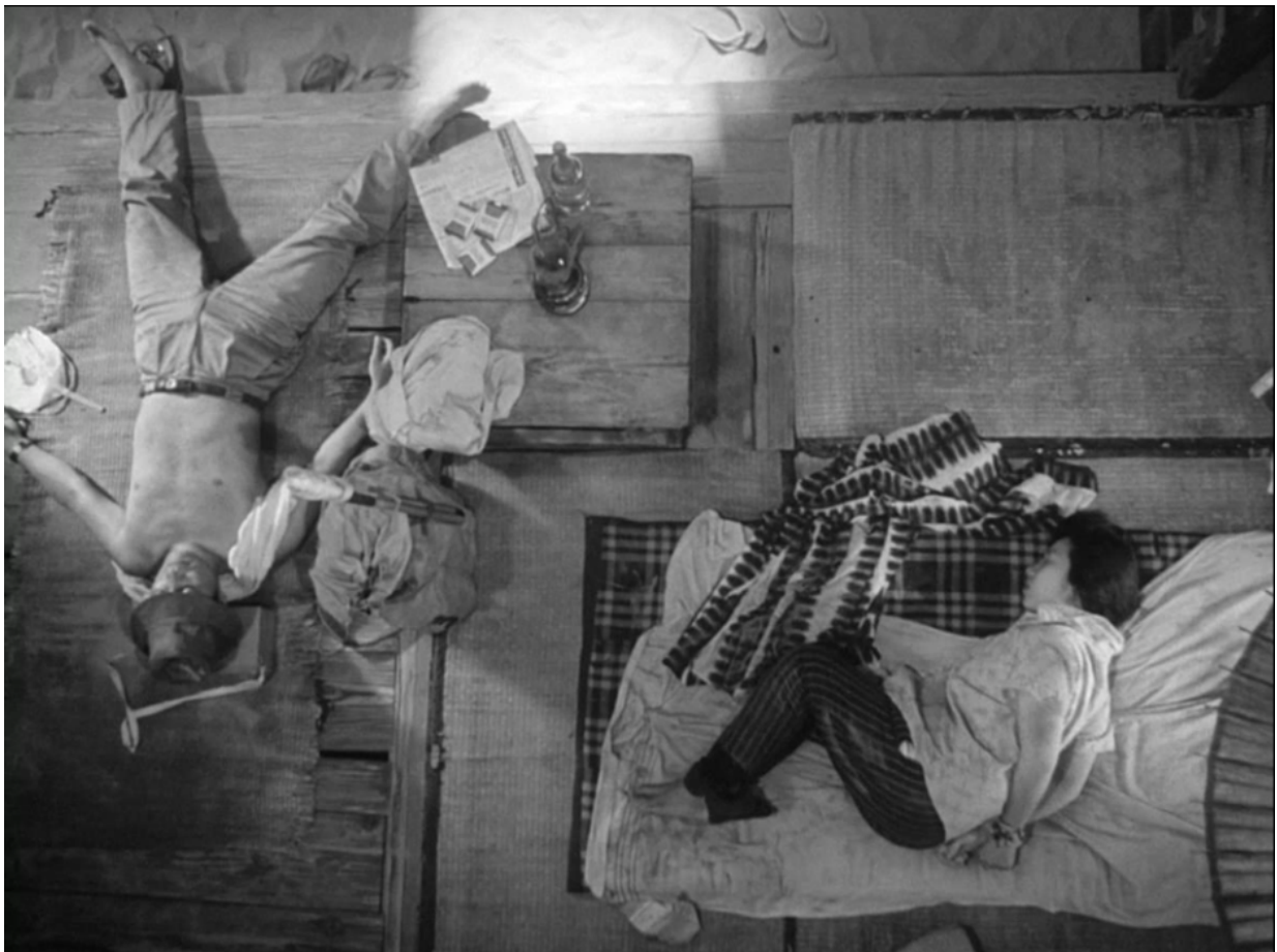
Kyôko Kishida and Eiji Okada in Suna no onna (1964)

Woman in the Dunes (1964) – Dir. Hiroshi Teshigahara