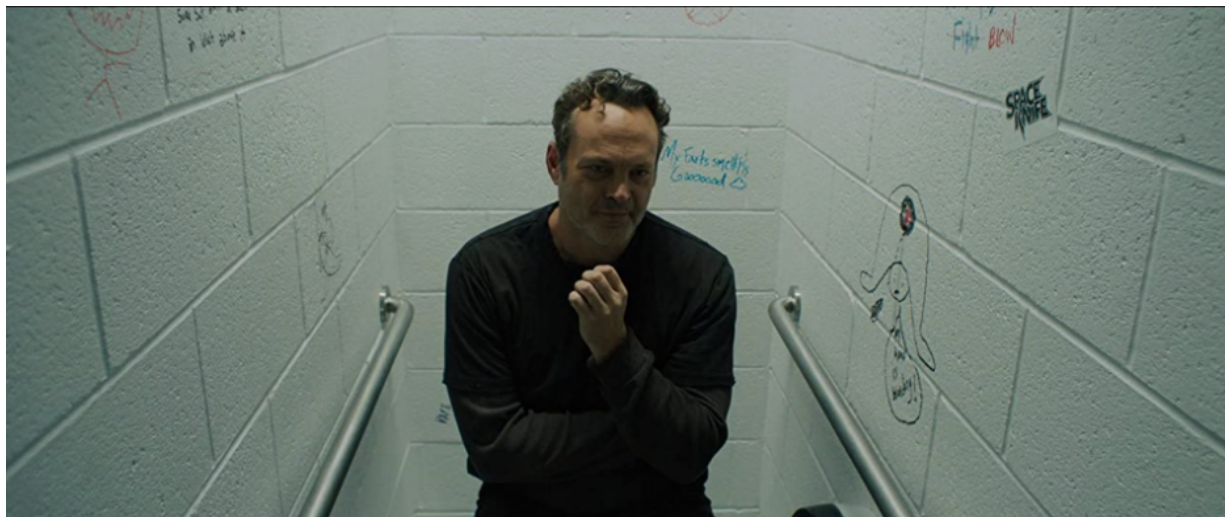
Vince Vaughn in Freaky (2020)

Millie is just your average, unpopular high school girl. Sure, her town is haunted by the legend of The Butcher, but who doesn't love a bit of hometown folklore? In a bizarre twist of fate, she wakes up in the body of the very real serial killer, and only has 24 hours to get her body back.