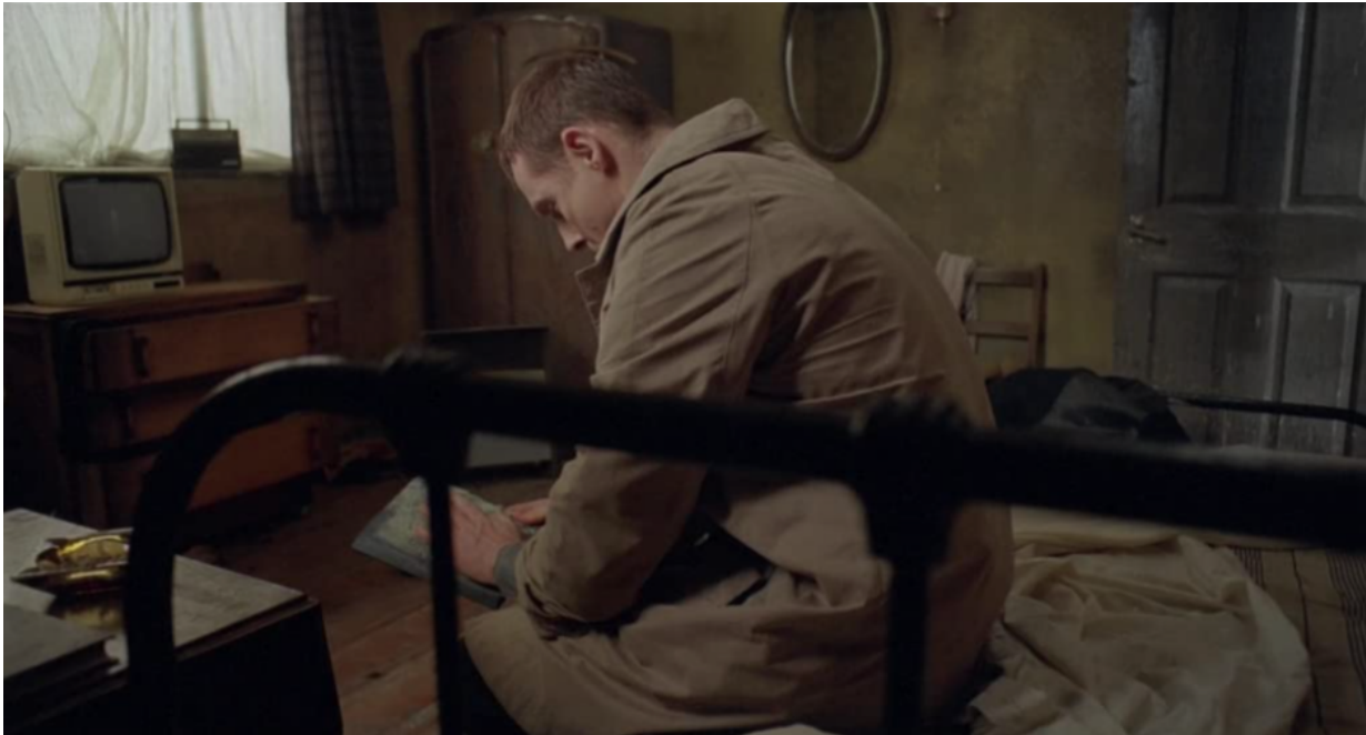
Sean Harris in Possum (2018)

A children's puppeteer returns to his boyhood home in England, following an unnamed scandal that has sent him into hiding. He travels with a puppet named Possum, who he is attempting to destroy. This task isn't as easy as he would have expected, and he is forced to confront his stepfather and traumatic past.