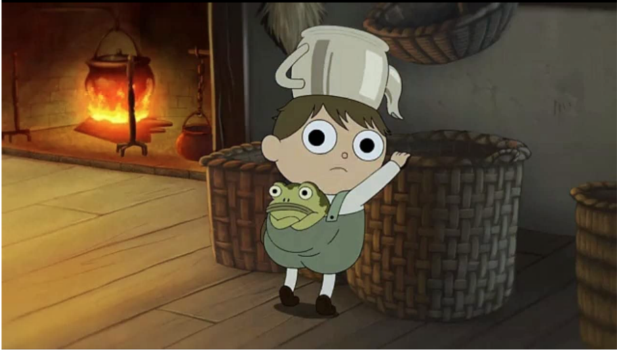
Over the Garden Wall (2014)

While adventuring on an Autumn afternoon, half-brothers Greg and Wirt find themselves lost in a strange forest called the Unknown, which seems to fluctuate through time and space. Hopefully some of the wacky characters they meet can help them find their way home!