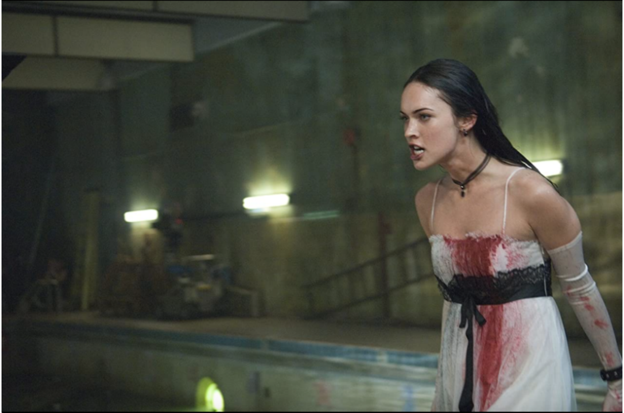
Megan Fox in Jennifer's Body (2009)

After a concert gone wrong, Jennifer, resident hot girl of her high school, begins feasting on young men to stay alive and immortal.