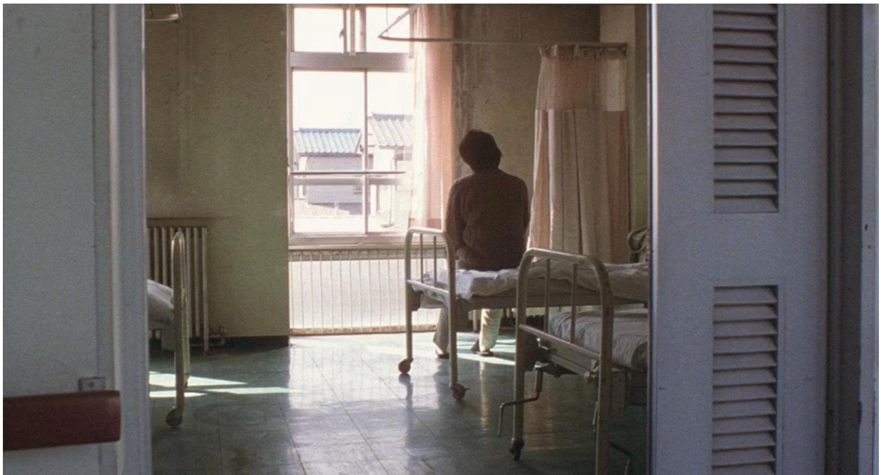
Masato Hagiwara in Cure (1997)