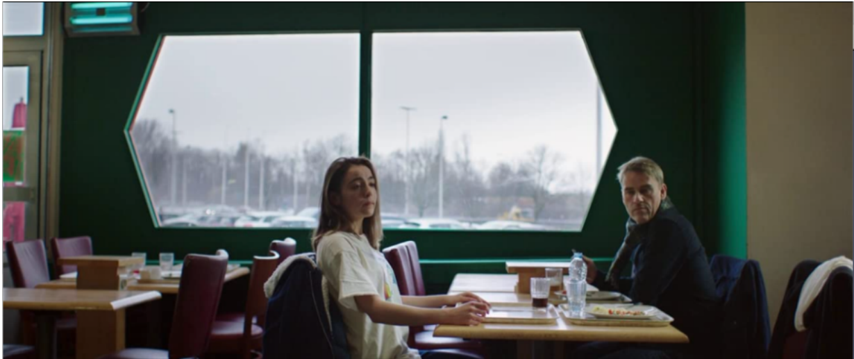
Laurent Lucas and Garance Marillier in Raw (2016)

After eating meat for the first time in her life, Justine finds herself with cravings that can only be satisfied by human flesh.