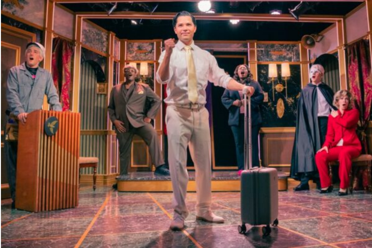
The company of Ghost of John McCain .