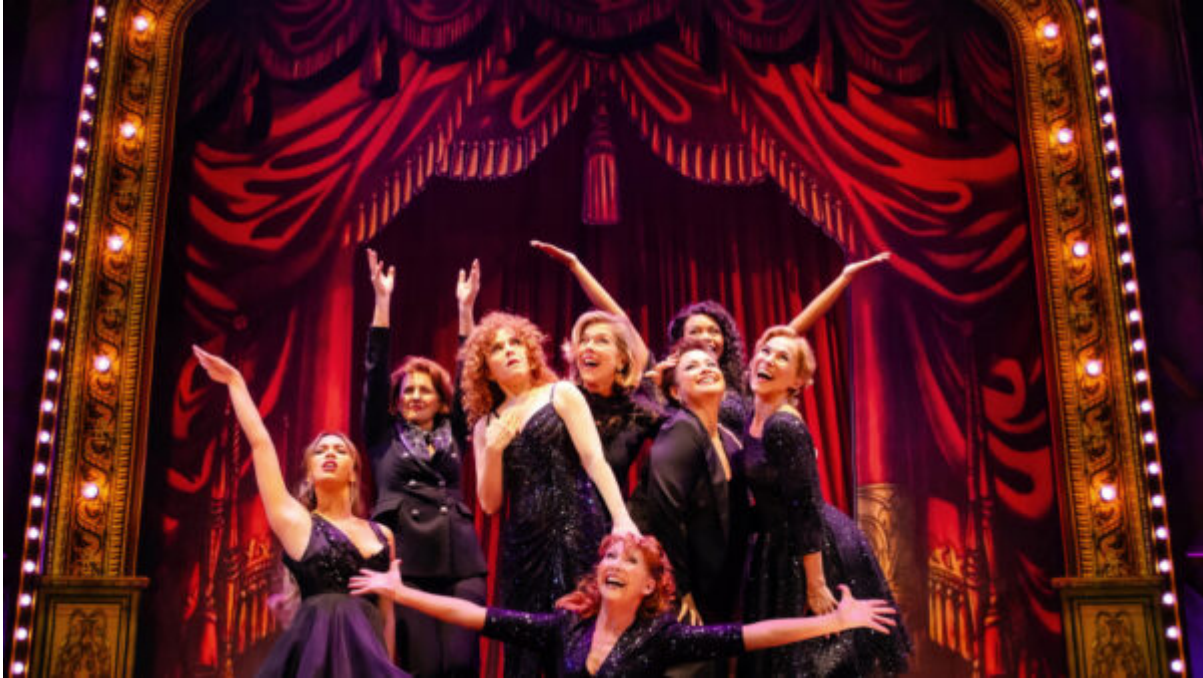
Bernadette Peters, Lea Salonga and cast of “Old Friends.”