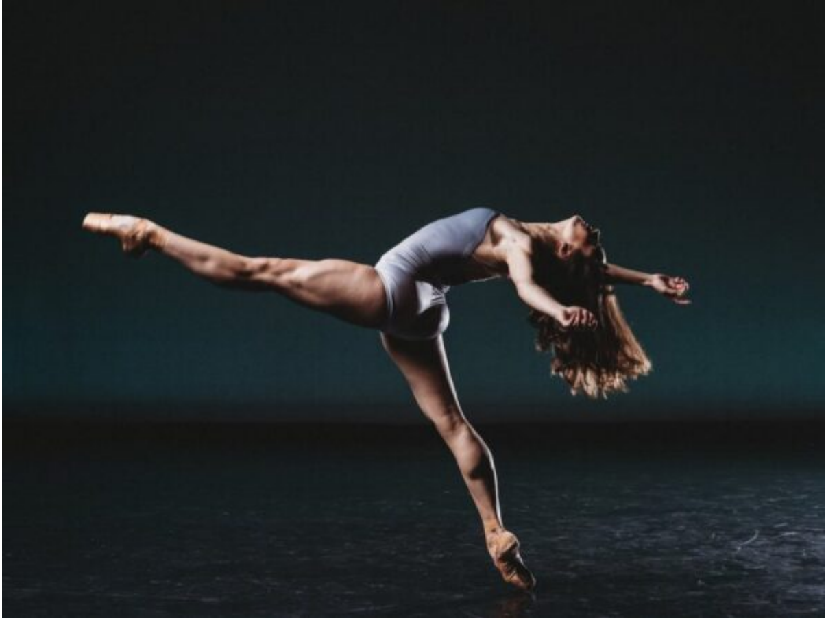
Ballet X.