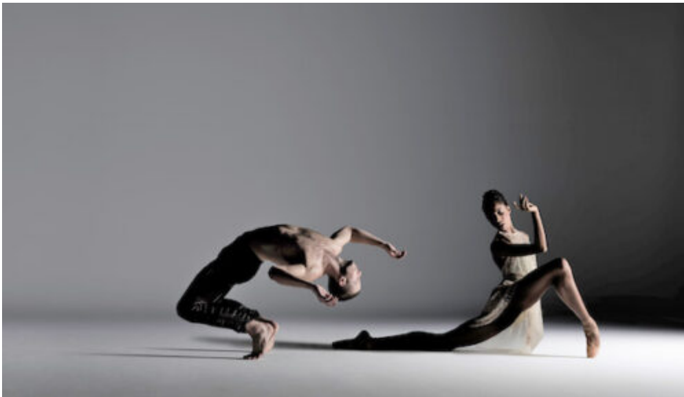
Alonzo King LINES Ballet.

A retelling of Ma mère l'Oye (Mother Goose) pairs with a tribute to jazz great Alice Coltrane in this visit from Alonzo King LINES Ballet . The dancers embody the movement and they traverse King's choreography which makes the getting to a position as fascinating as the destination. As of this writing, the show is nearly sold out. Segerstrom Center for the Arts, 600 Town Center Dr., Costa Mesa; Fri., Feb. 7, 7:30 pm, $44.07-$134.47 SCFTA .