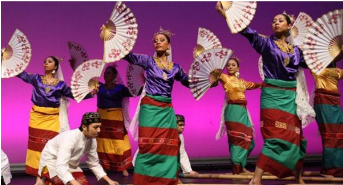
Kayamanan Ng Lahi Philippine Folk Arts.

The dancers of Kayamanan Ng Lahi Philippine Folk Arts welcome the Year of the Snake with Pagdiriwang – A Celebration of Philippine Culture . The family-friendly show is the company's first of two performances this season at this new venue for dance. Sierra Madre Playhouse, 87 West Sierra Madre Blvd., Sierra Madre; Sat., Feb. 8, 11 am, $12. Sierra Madre Playhouse .