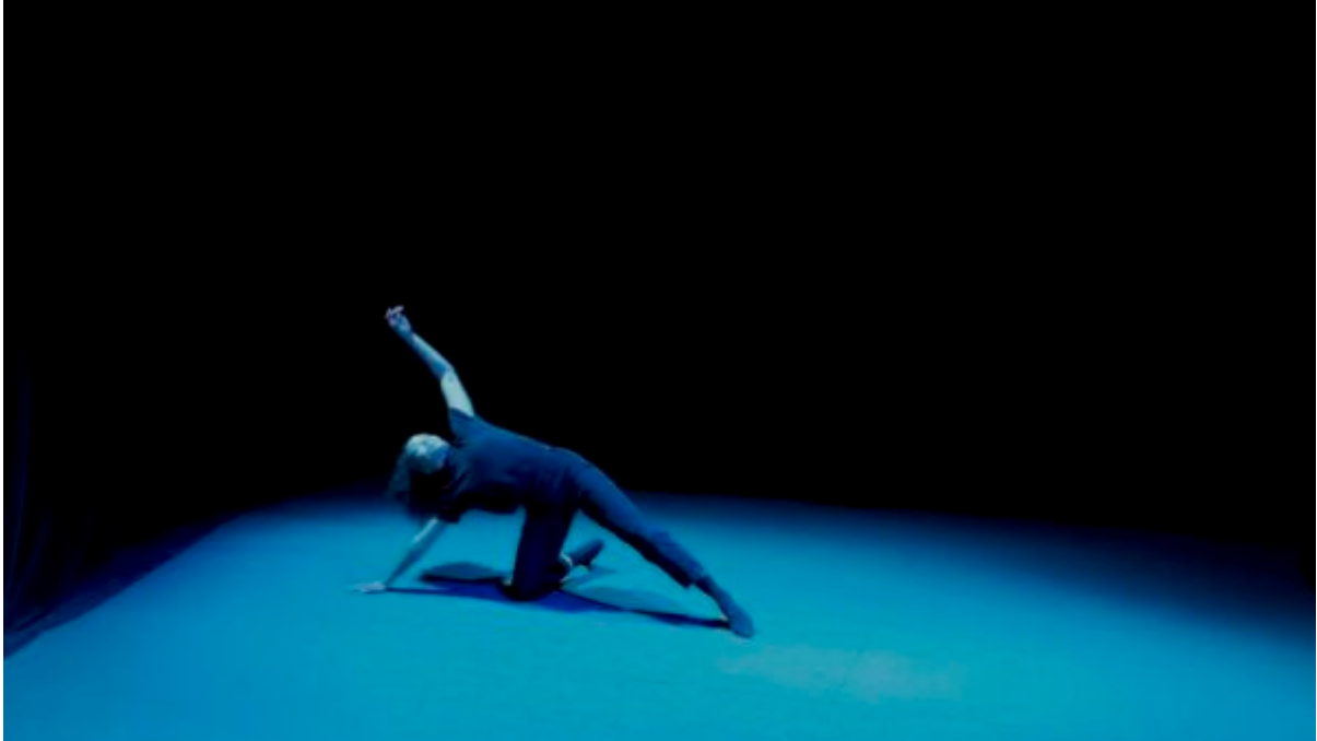
Cayla Mae Simpson.