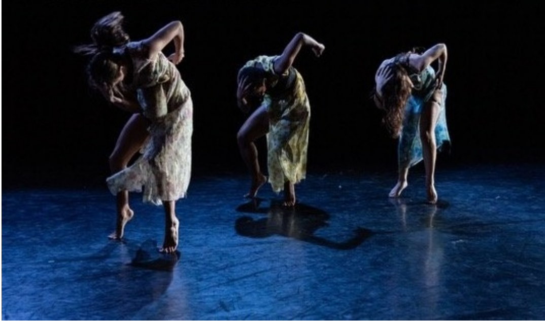
MashUp Contemporary Dance Company.