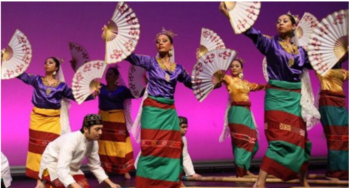
Kayamanan Ng Lahi Philippine Folk Arts.

The dancers of Kayamanan Ng Lahi Philippine Folk Arts welcome the Year of the Snake with Pagdiriwang – A Celebration of Philippine Culture . The family-friendly show is the company's first of two performances this season at this new venue for dance. Sierra Madre Playhouse, 87 West Sierra Madre Blvd., Sierra Madre; Sat., Feb. 8, 11 am, $12. Sierra Madre Playhouse .