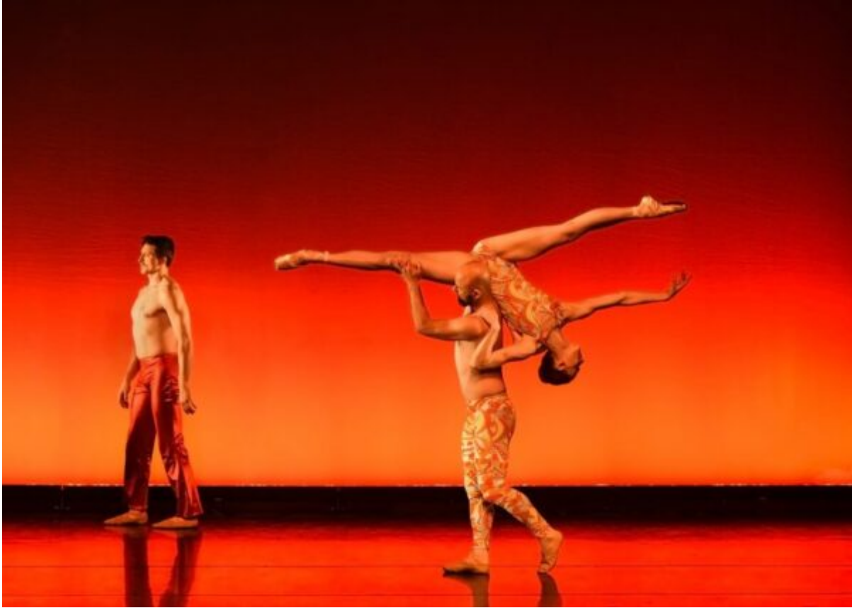
Palm Springs Dance Project.