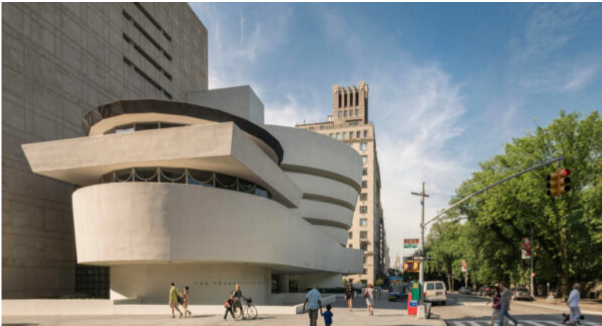
Guggenheim website photo