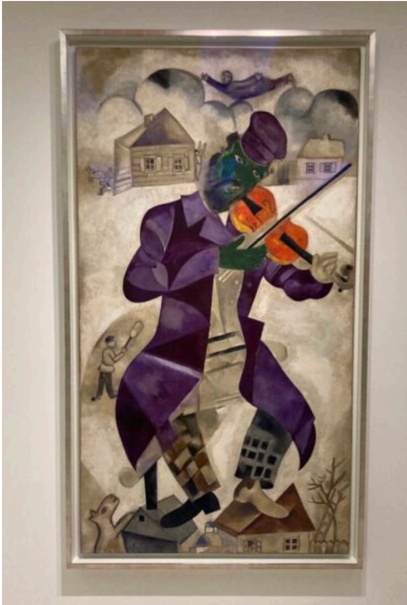
Green Violinist by Marc Chagall, 1923

“Green Violinist” by Marc Chagall, 1923.