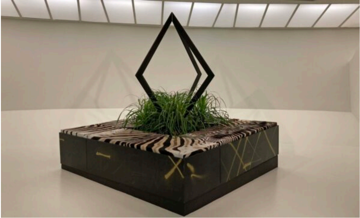
Four for the Talking Cure by Rashid Johnson, 2012

On another floor is on display a 2012 work by Johnson: “Four for the Talking Cure.”