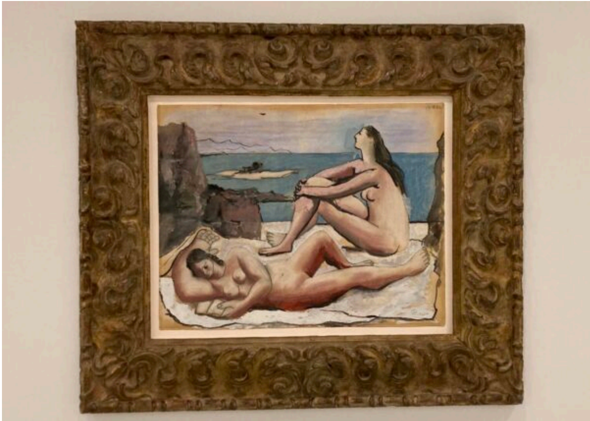
Three Bathers by Pablo Picasso 1920

In the gift shop I noticed a stylized poster for the Guggenheim.