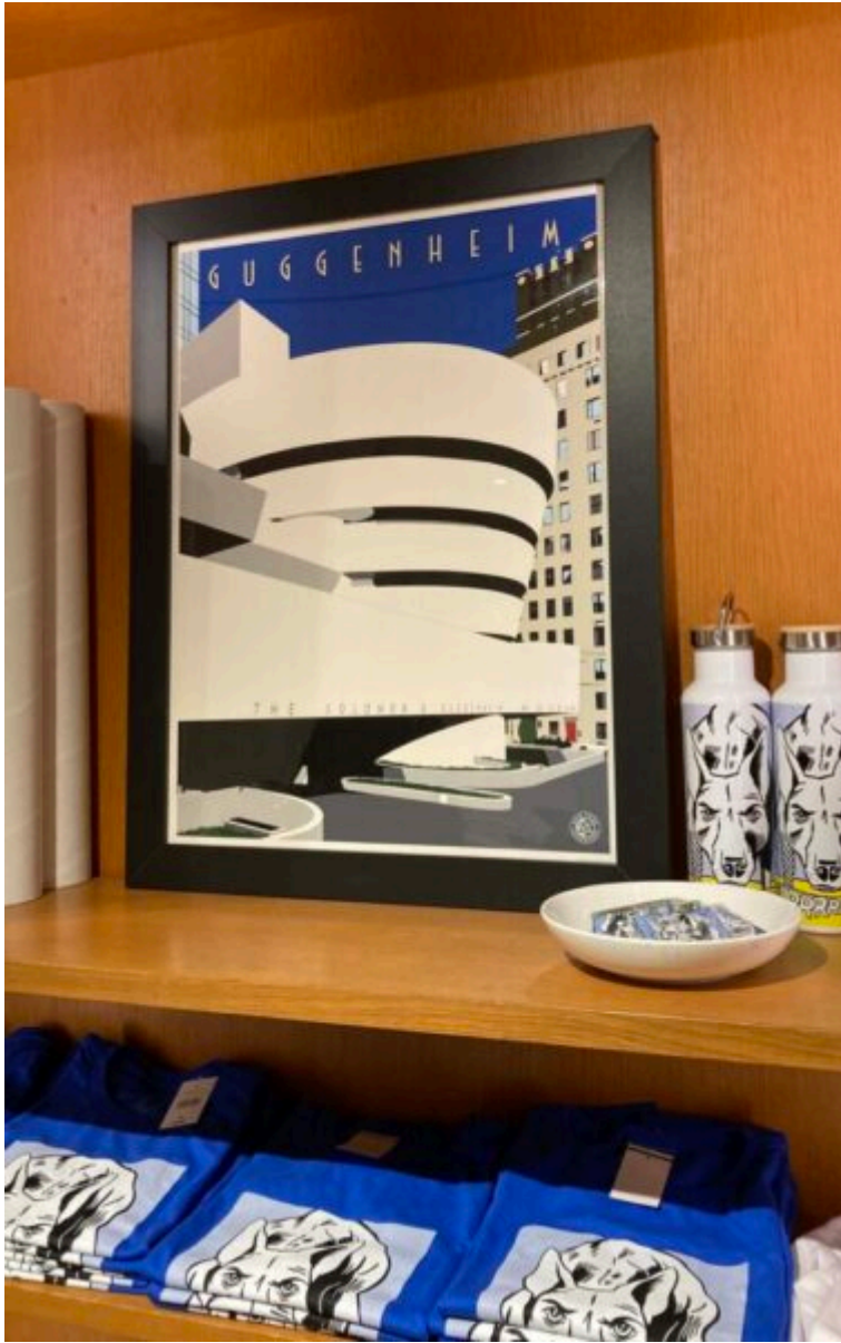
Gift shop. Guggenheim

As I walked out of this amazing display of art and ideas, I wanted to take a walk in the upper section of Central Park from 88th Street down to 60th, but it started to rain so I ducked into another museum, the Metropolitan at 82nd Street. It was crowded with people of all ages and too vast to take it all in, but I discovered an exhibit dear to my heart: “The New Art: American Photography 1839-1910.” I took a couple of photos for my musician friends.