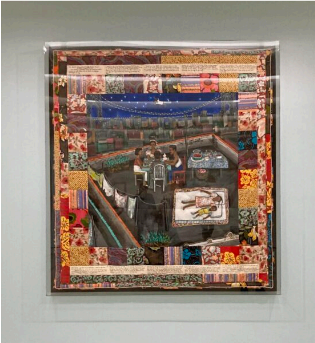
Tar Beach, quilt painting by Faith Ringgold, 1988

Faith Ringgold is featured with copies of her 1991 children's book Tar Beach , and the original quilt painting.