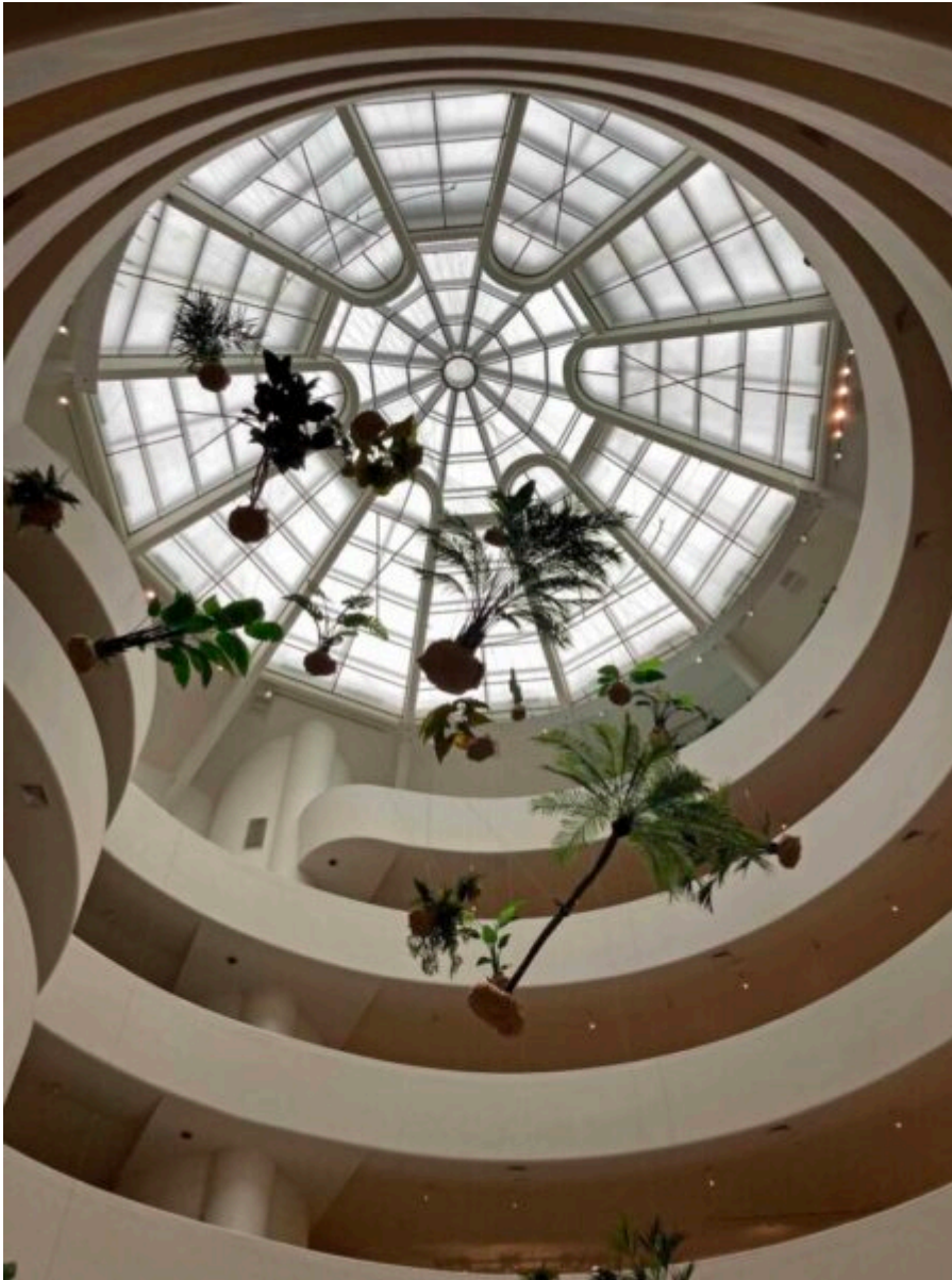
Guggenheim- hanging garden

On the outside the cylindrical building on five levels is wider at the top than at the bottom, on the inside a rotunda bottom floor winds upwards on a spiraling ramp, topped by a large round skylight.