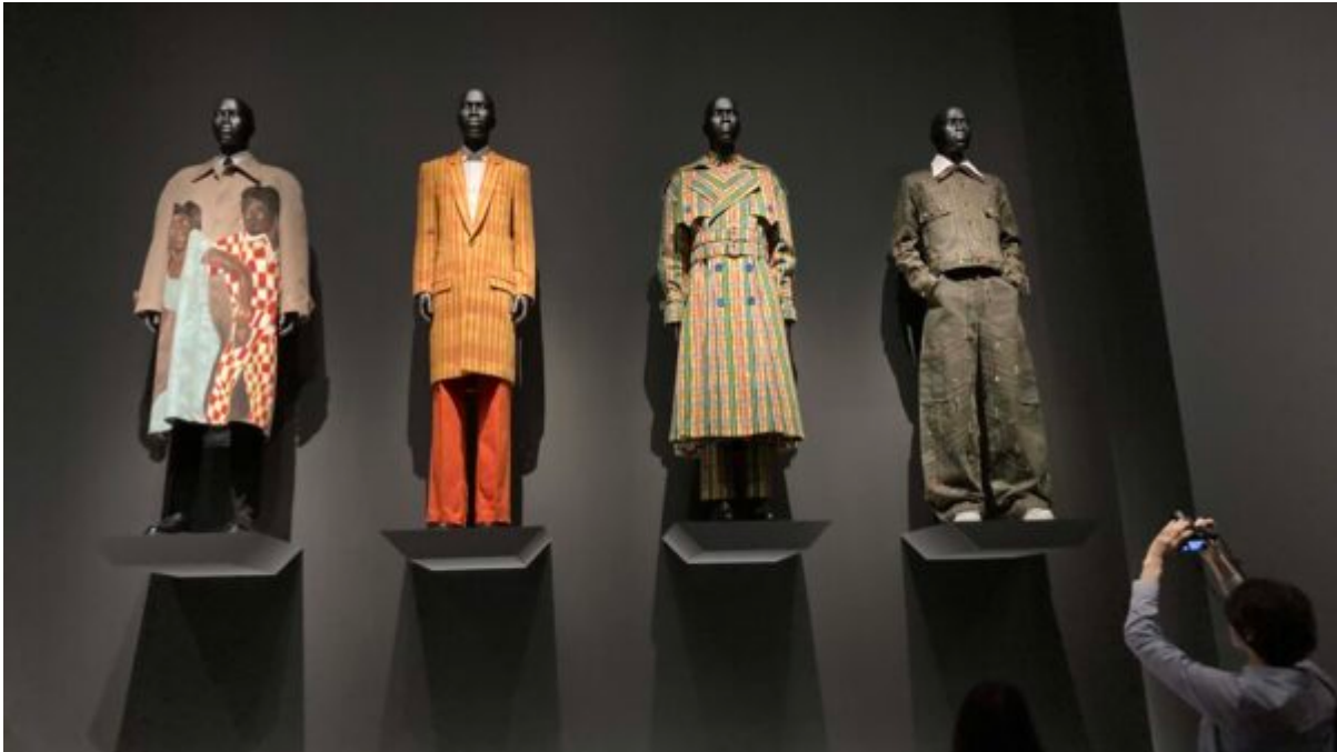
Tailoring Black Style. Metropolitan Museum

I only glanced at the exhibit “ Superfine: Tailoring Black Style .”