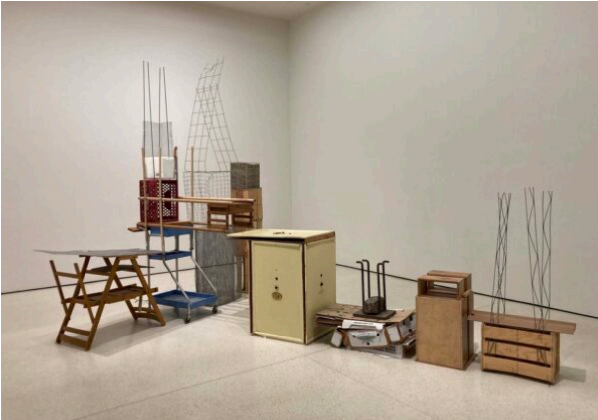
Self-Construction by Abraham Cruzvillegas, 2007

In the exhibition titled “ By Way Of: Material and Motion ” (March 15, 2024-June 8, 2025) we noticed the collection of objects titled “Self-Construction” by Mexican artist Abraham Cruzvillegas .