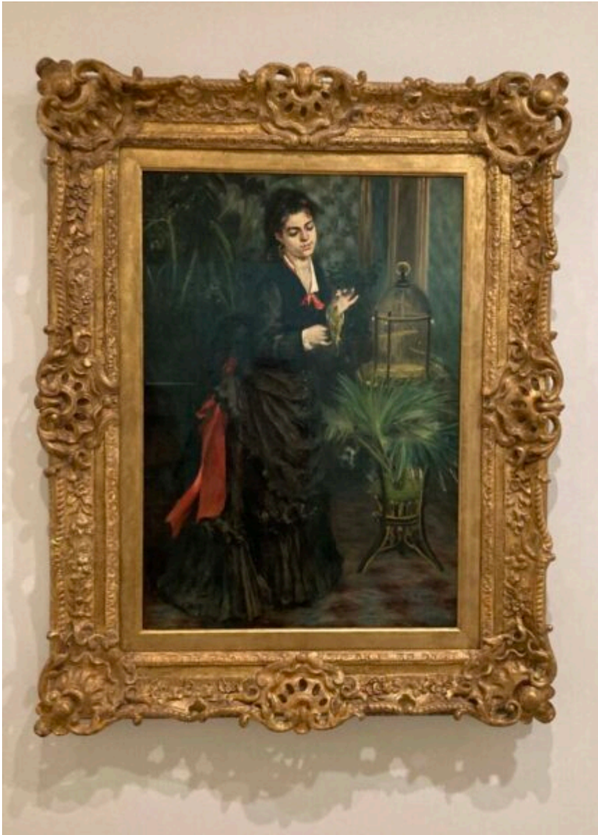
Woman with Parakeet by Pierre-August Renoir, 1871

Traditional paintings from the permanent collection are also on display at the various levels of the Guggenheim, such as “ Woman with Parakeet ” by Pierre-August Renoir, 1871.