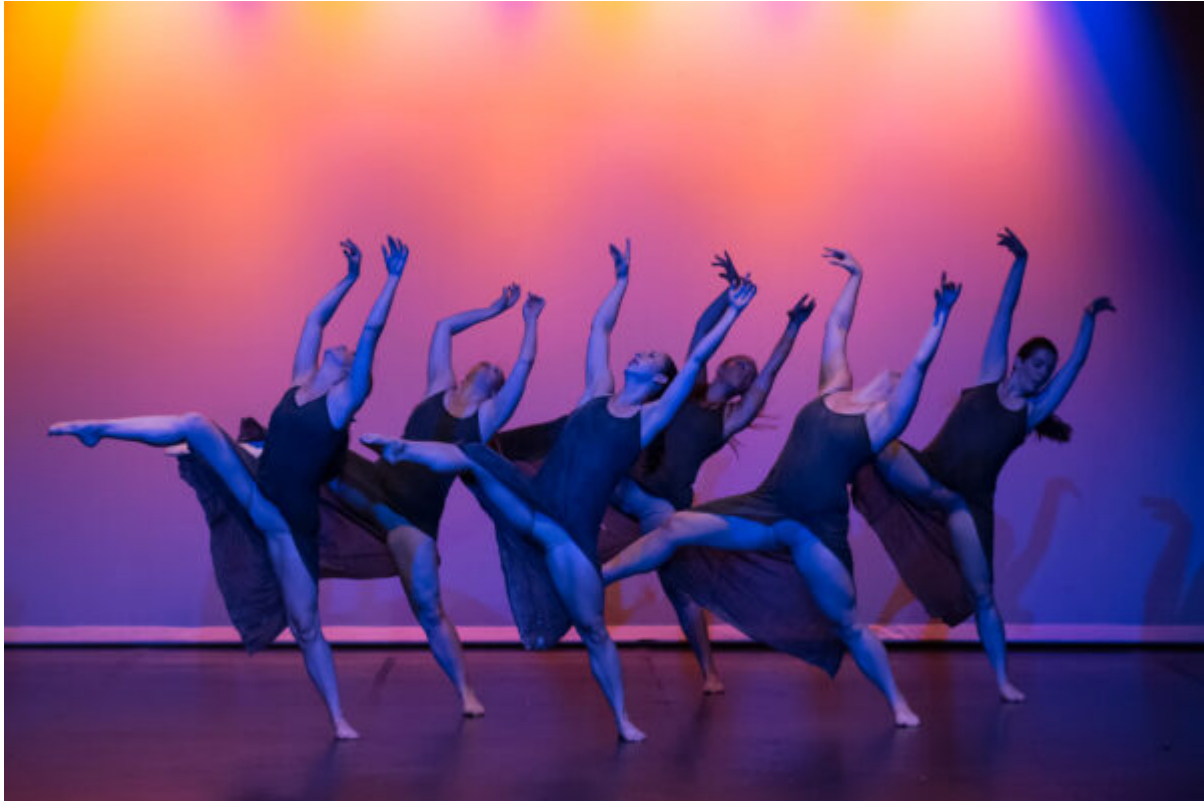
MixMatch Dance Festival.