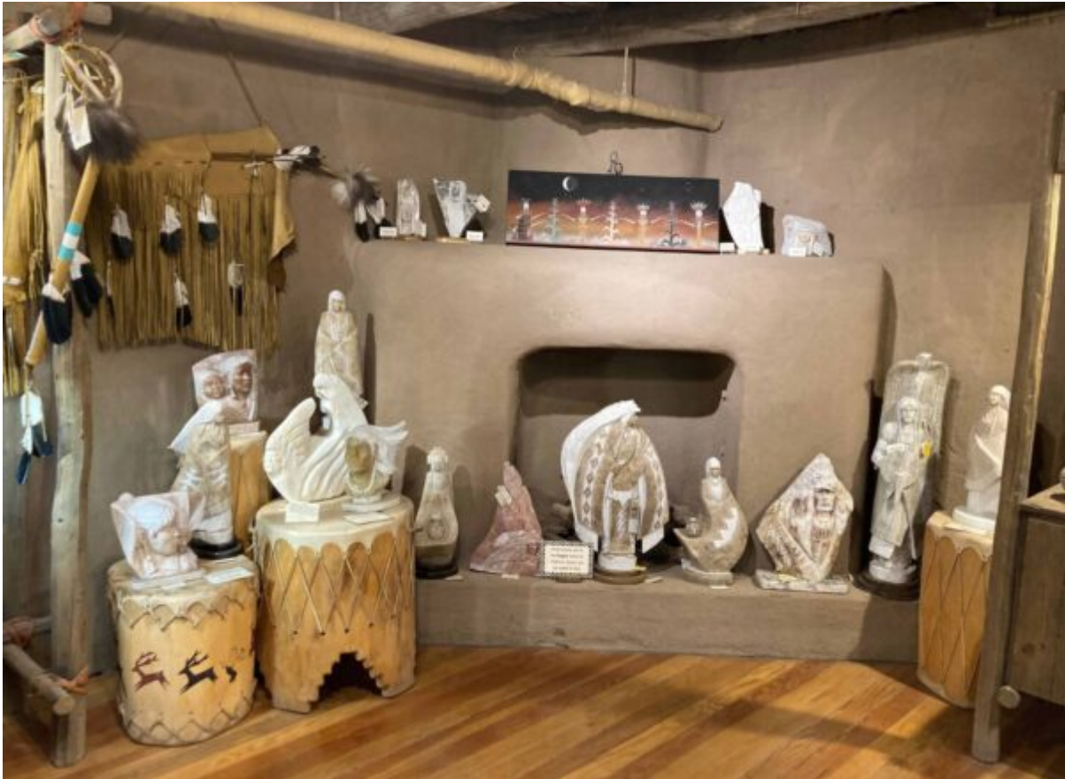
Hopi House. Alabaster statues.

I also studied the documentary Incident at Oglala (1992) directed by Michael Apted and narrated by Redford. Sadly Leonard Peltier was not granted parole on July 2, after spending nearly 50 years in prison, unjustly convicted in 1977 of murdering two FBI agents on the Pine Ridge Reservation. The only hope at this point is that President Joe Biden will grant him clemency