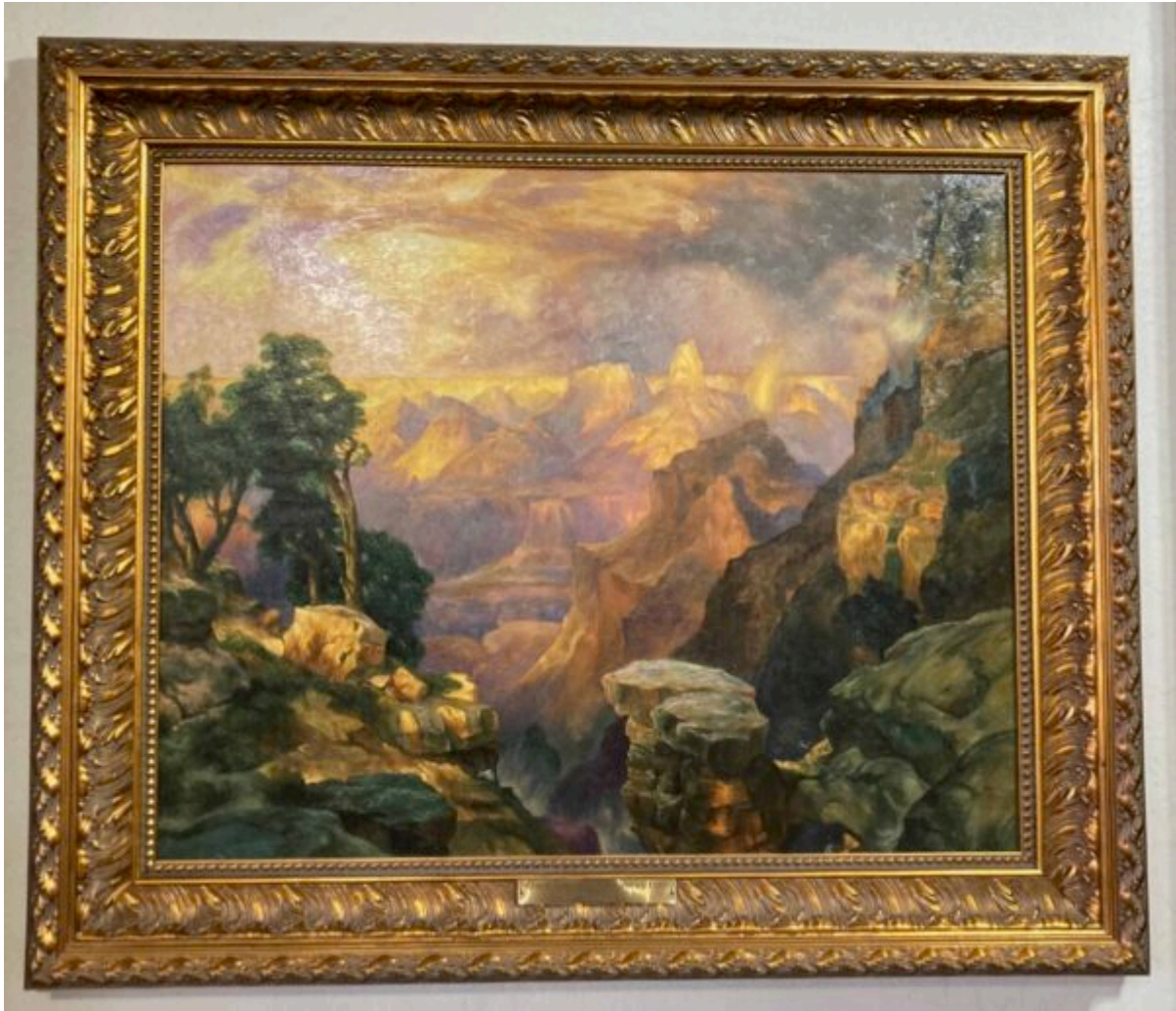
Painting of Grand Canyon. Cameron Trading Post

On a lighter note we later stopped at Cameron's Trading Post , where, while others shopped, I admired the Navajo rugs hanging on the wood paneled walls and the late 19th century paintings of the Grand Canyon. I enjoyed the guilty pleasure of eating Navajo fry bread . I had never forgotten when I first tasted it at a rodeo during my 1975 trip to Monument Valley. It reminded me of gnocco , a traditional fried bread of my hometown of Modena.