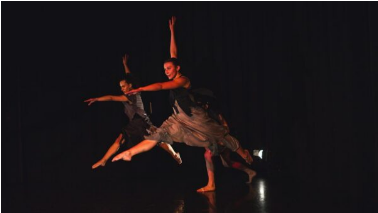
TORRENT.