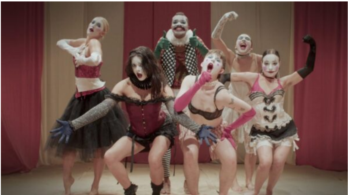
TRIN Dance Theatre.

After opening last week, the second week of the Dance at the Odyssey festival brings clowning to the stage as TRIN Dance Theatre draws on drag and clowning for a hero's journey in The Greatest Show on Earth . Odyssey Theatre Ensemble, 2055 S. Sepulveda Blvd., West LA; Thurs., June 26, 8 pm, $25, $60 festival pass. Odyssey Theatre .