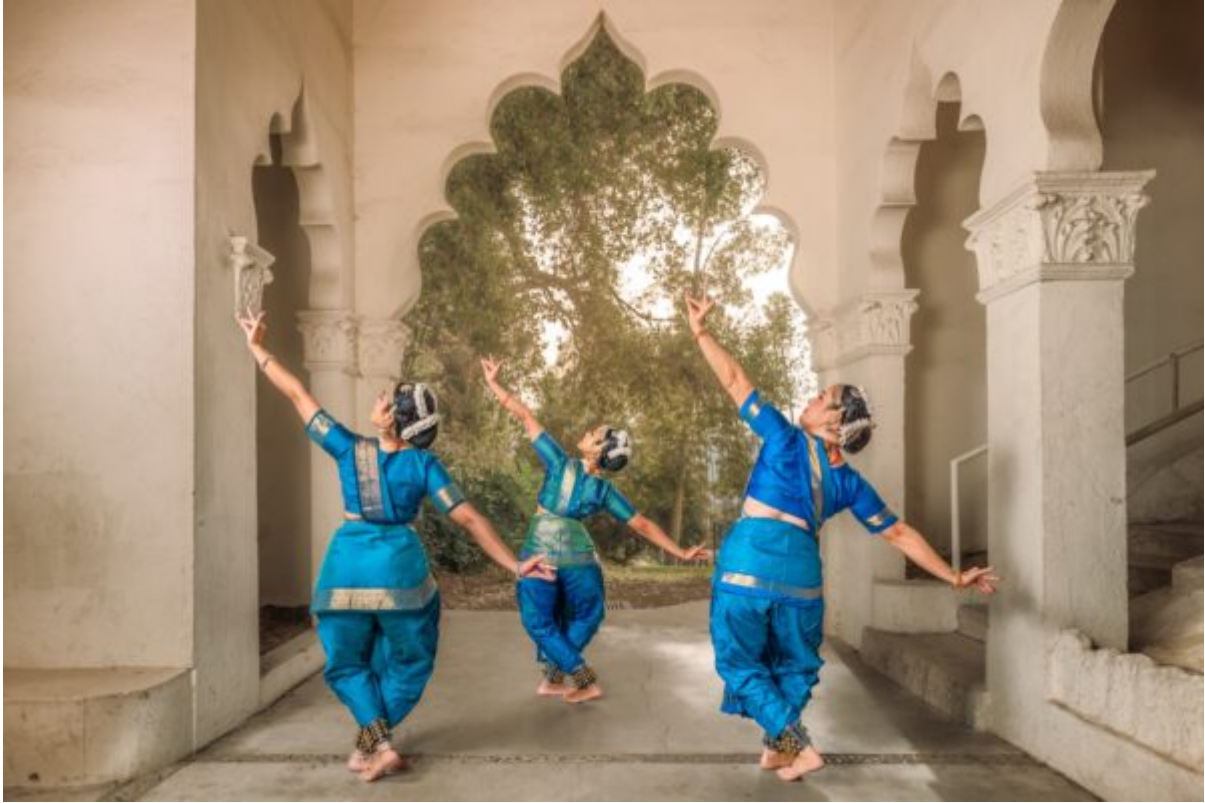
Rangoli Dance Company.