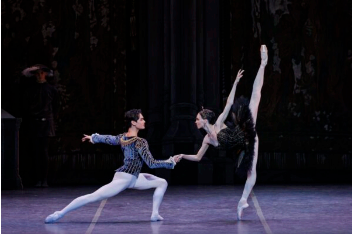
Boston Ballet “Swan Lake.”