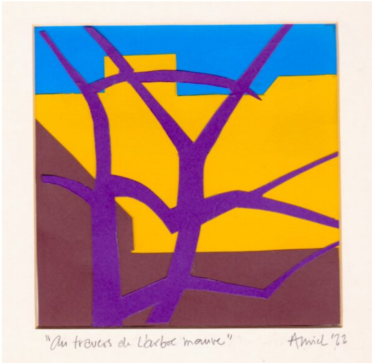
Spring sap rising

The summer vigor is marked by the appearance of green foliage engulfing the tree and blocking the view of the street.