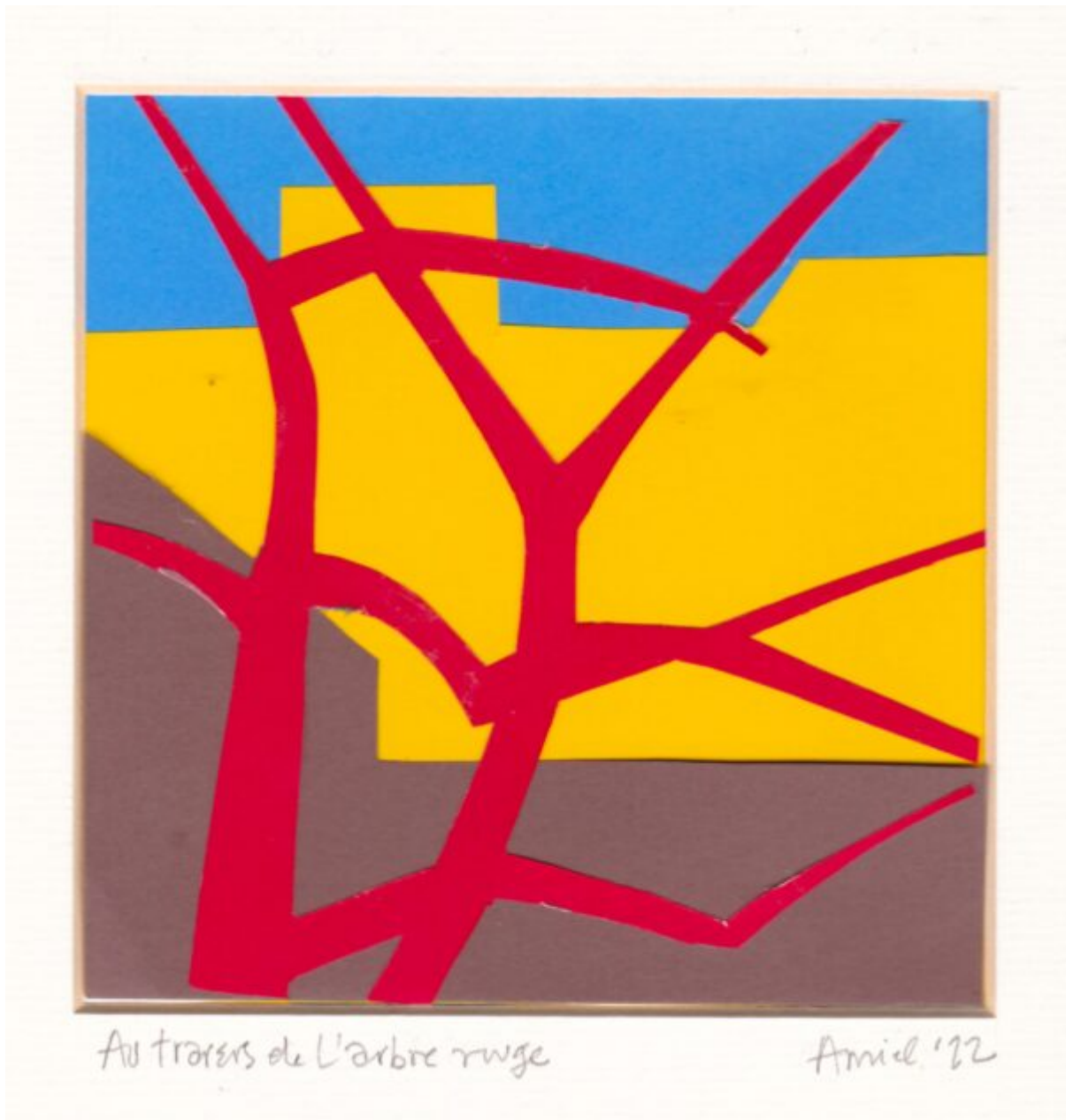
Fall foliage arrival

The winter bareness of the tree shows its essential structure and strength , which I expressed by choosing the perceptually dominant black.