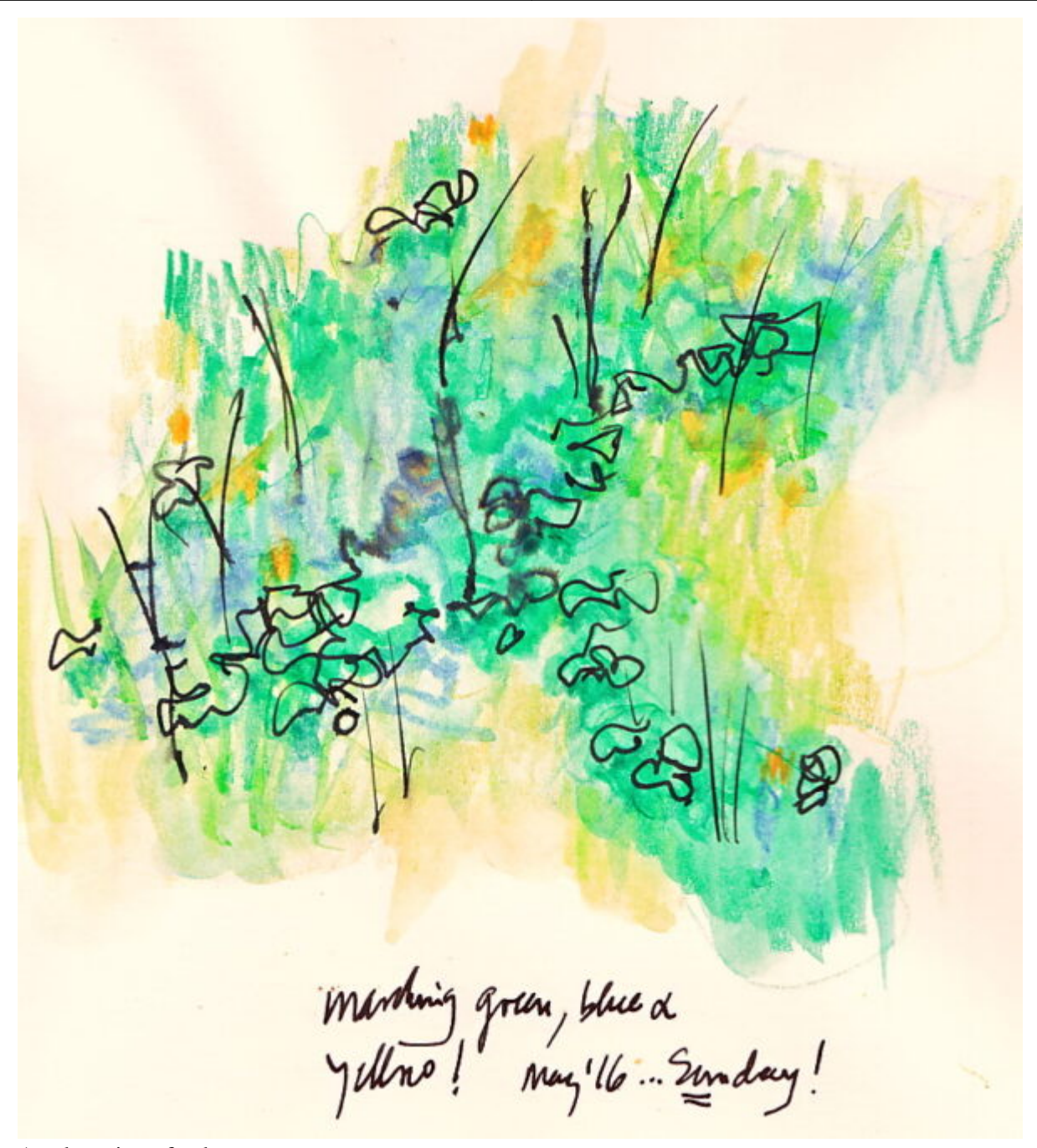
A spluttering of colors