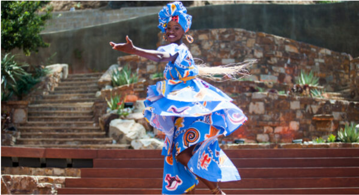
Viver Brasil.