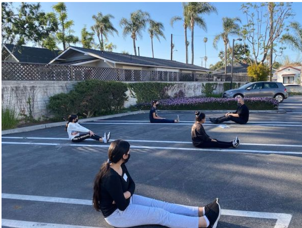
The Wooden Floor.

the dancers. The result premieres at the organization's 38 th Annual Concert performances. The Wooden Floor Main Street Location, 1810 N. Main St., Santa Ana; Thurs., July 15, 7 p.m., Fri.-Sat., July 16-17 & 23-24, 6 & 8:30 p.m., $20, $10 students & children under 13. The Wooden Floor