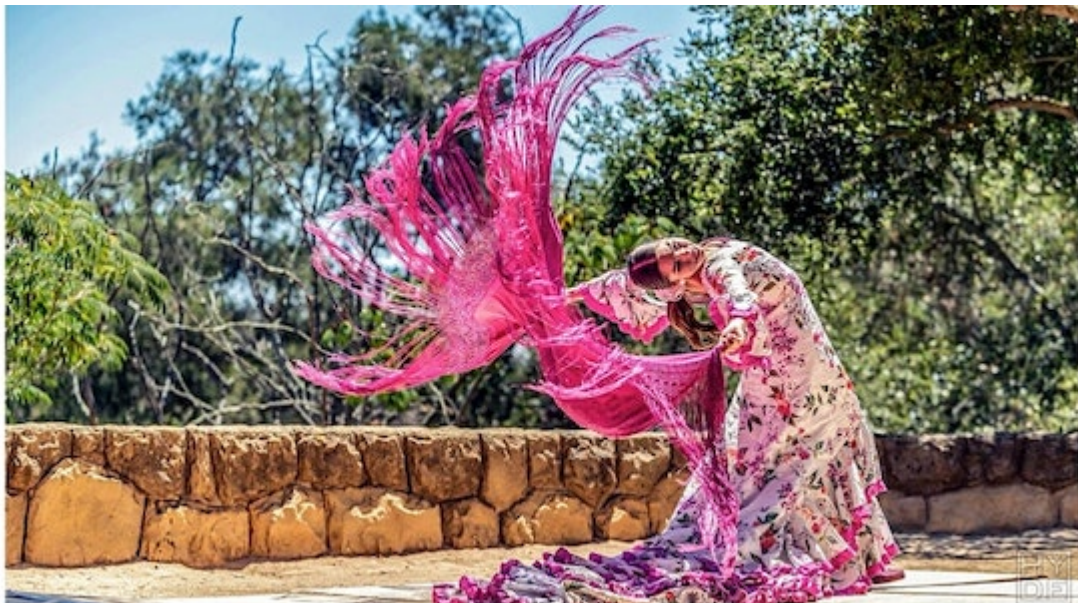
Zermeño Dance Academy.