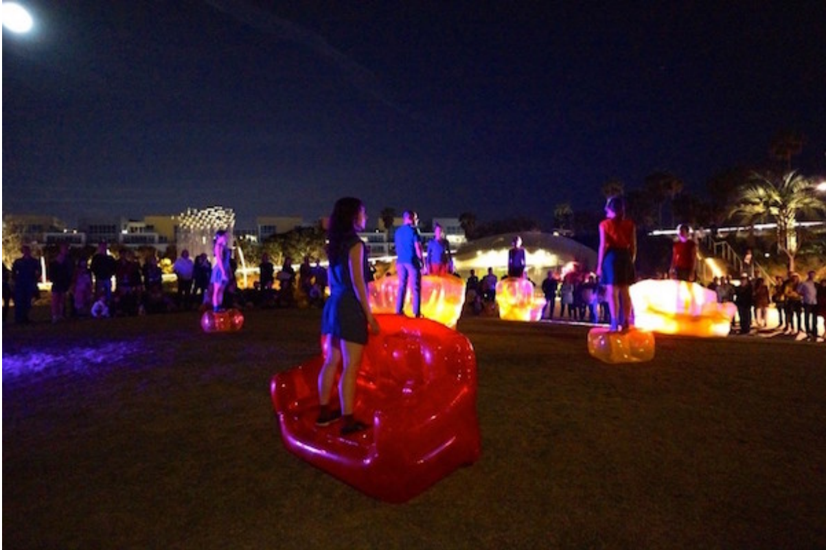
Lionel Popkin.