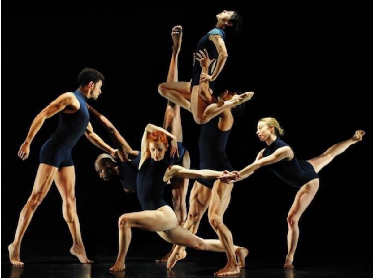
Kybele Dance Theater.