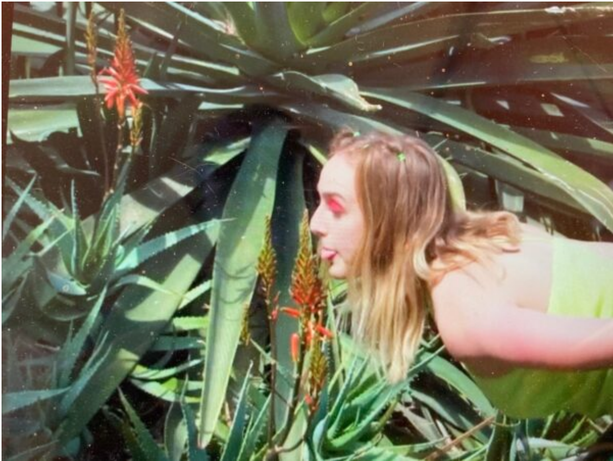
Rosanna Gamson/WorldWide. Photo courtesy of the artists.

the tales of the ten travelers unfold one at a time, Gamson's The Decameron Project rolls out ten films, each made by a different artist. All ten episodes are now live and viewable for free on RGWW and on Instagram .