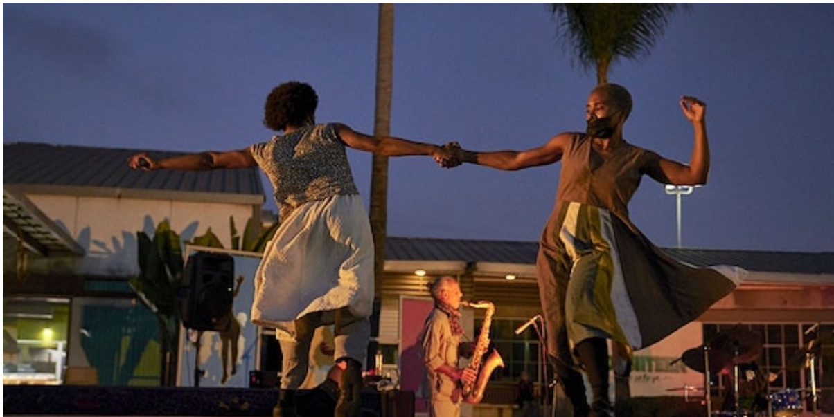
Heidi Duckler Dance.