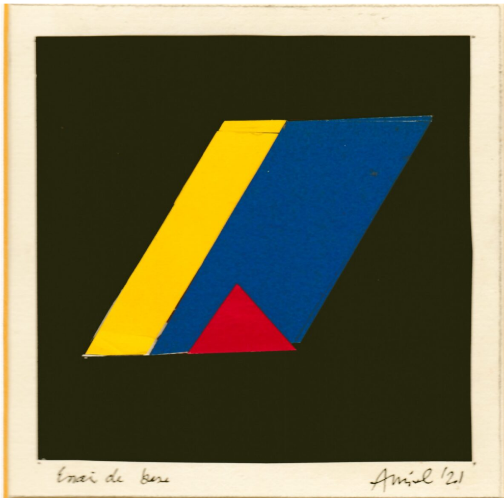
Basic try keyed on the red triangle

In the feature image, reprised below, I show my first attempt at creating a three parts collage, to be followed with similar ones varying in geometric pattern and colour combination, but all based on Forbes' "Rule of odds."