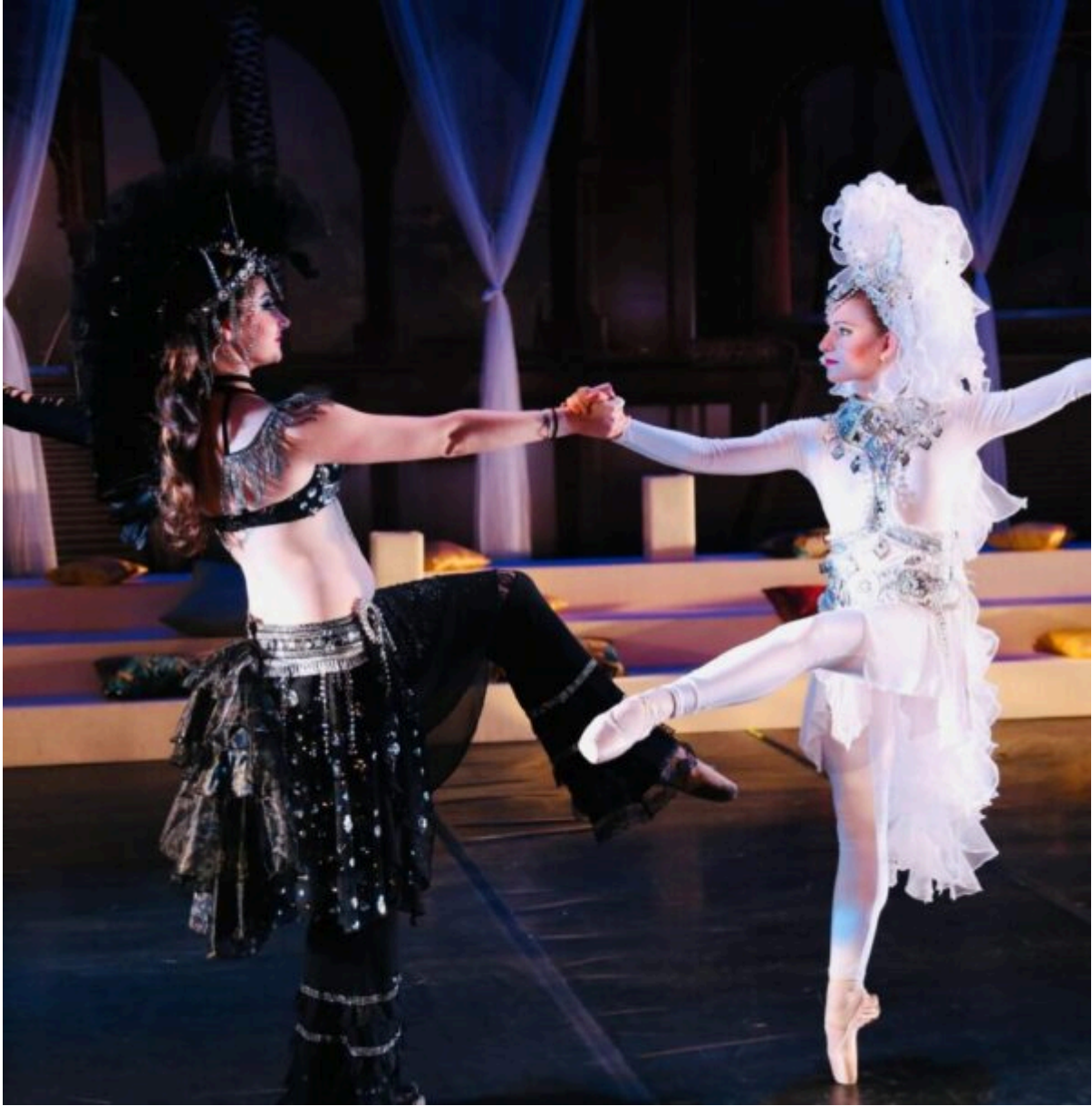
Bellydance Evolution's "Swan Lake."