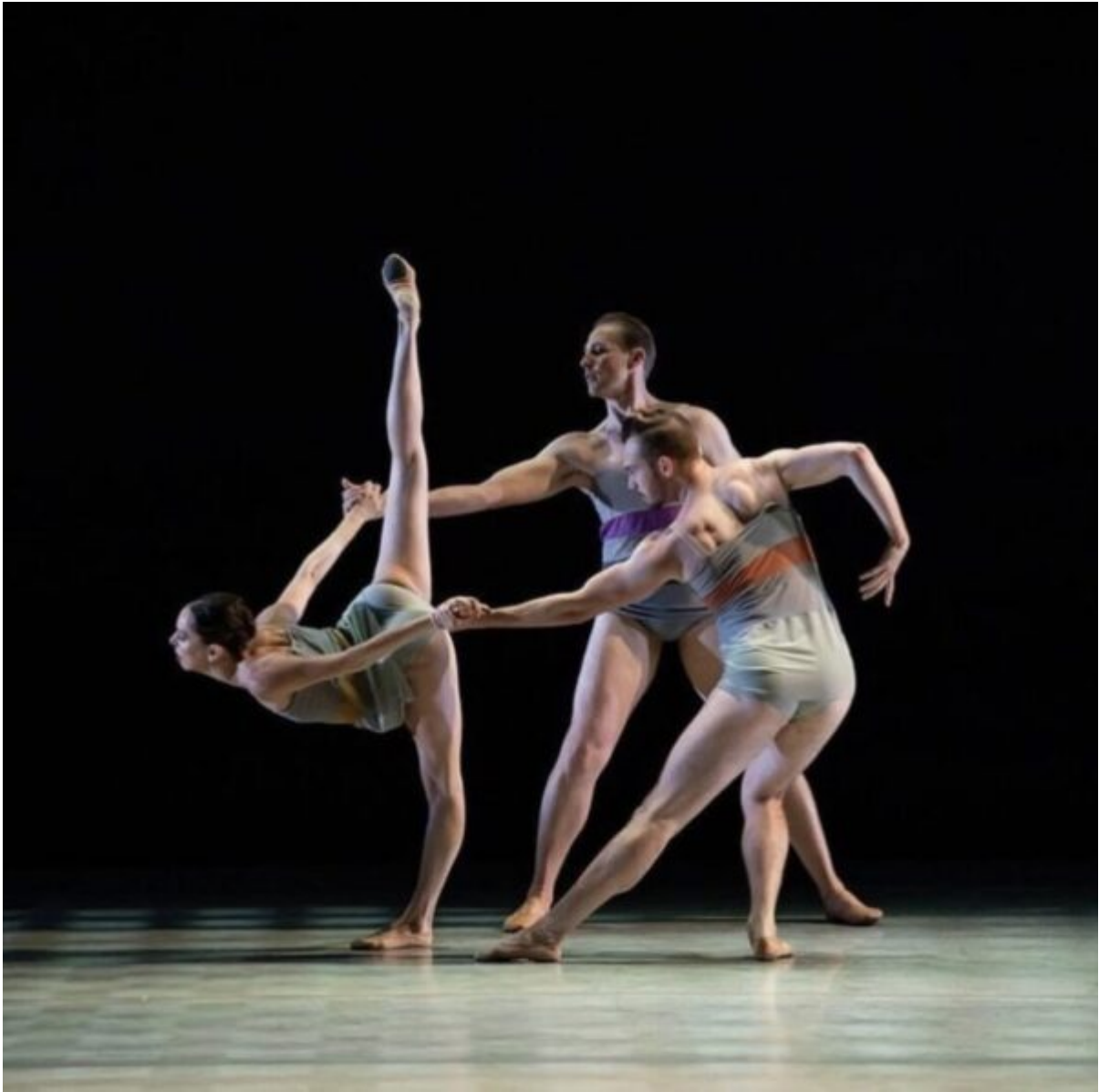
Sadie Black Co.