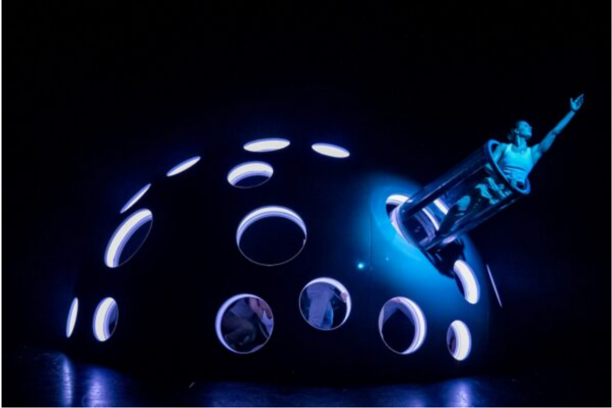
Diavolo's "Escape."