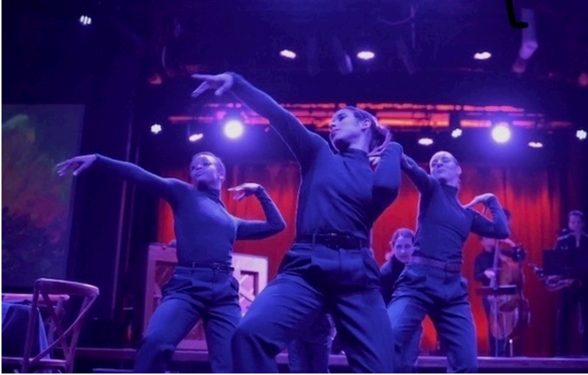
Jack Cole Dancers.