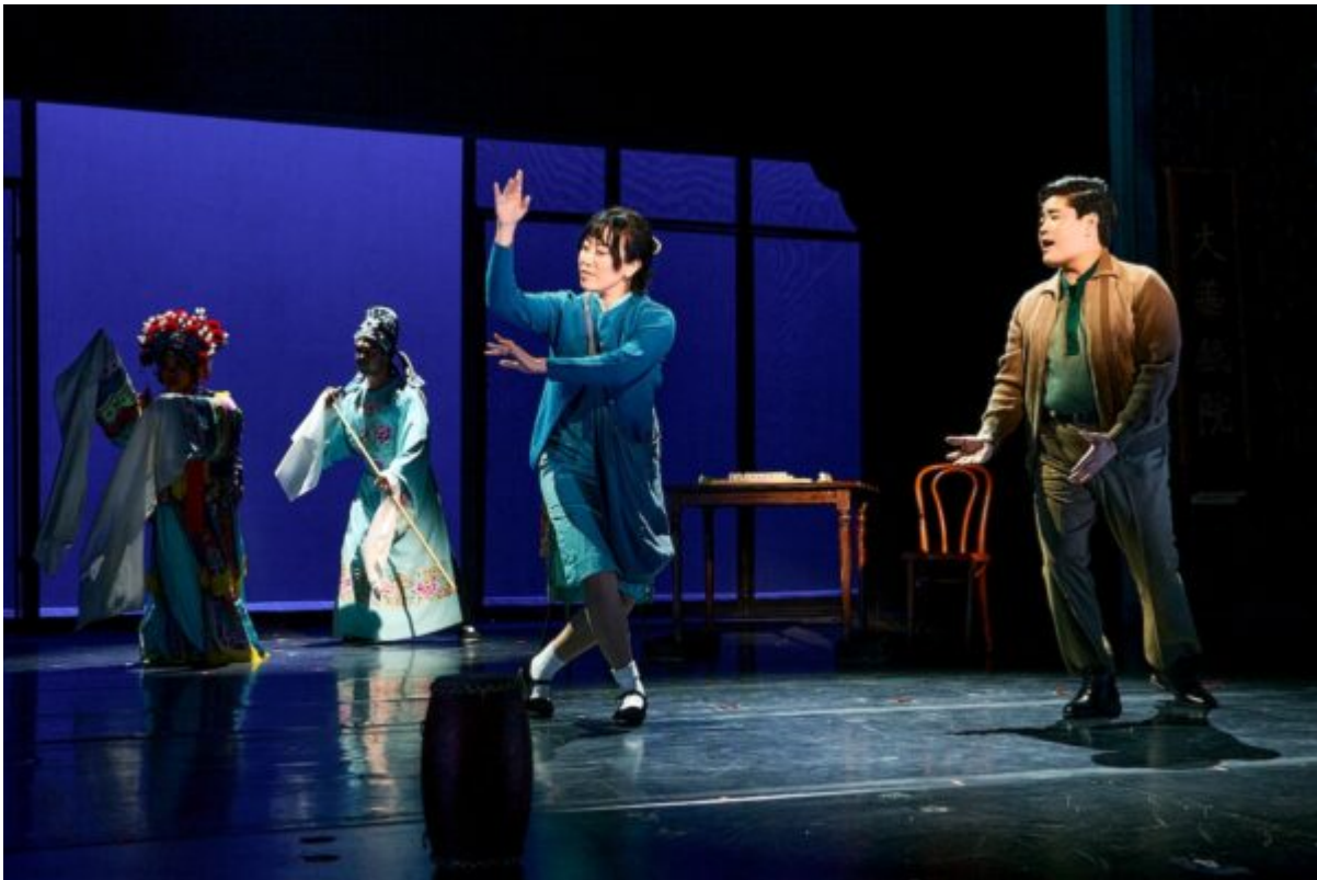
East West Players' "Flower Drum Song."