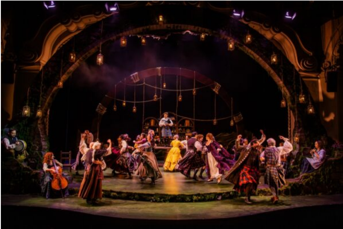
Pasadena Playhouse's "Brigadoon."

Playhouse, 39 S. El Molina Ave., Pasadena, Tues.-Wed. & Fri., 8 pm, Thurs., 7 pm, Sat., 2 & 8 pm, Sun., 2 pm, thru Sun., June 14, 7:30 pm, $63-$152. Pasadena Playhouse-Brigadoon.