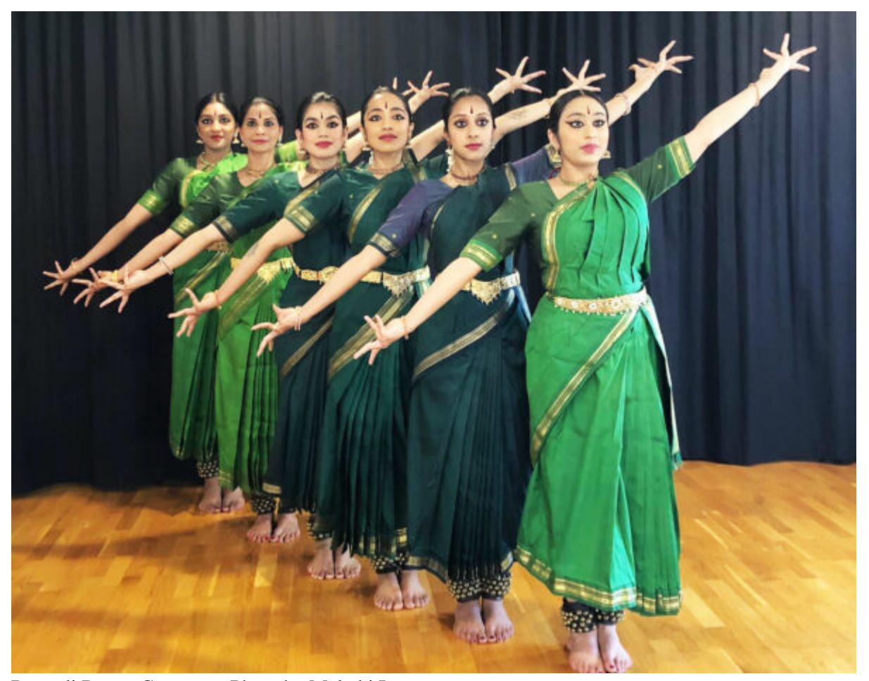
Rangoli Dance Company.

Rangoli Dance Company at at Electric Lodge, 1416 Electric Ave., Venice; Sat., June 3, 5 pm, $25-$50. Eventbrite.