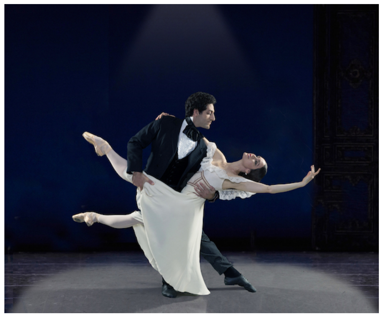
Los Angeles Ballet in "Lady of the Camellias."