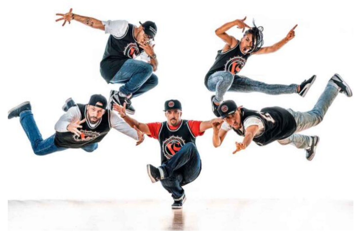
Versa-Style Dance.