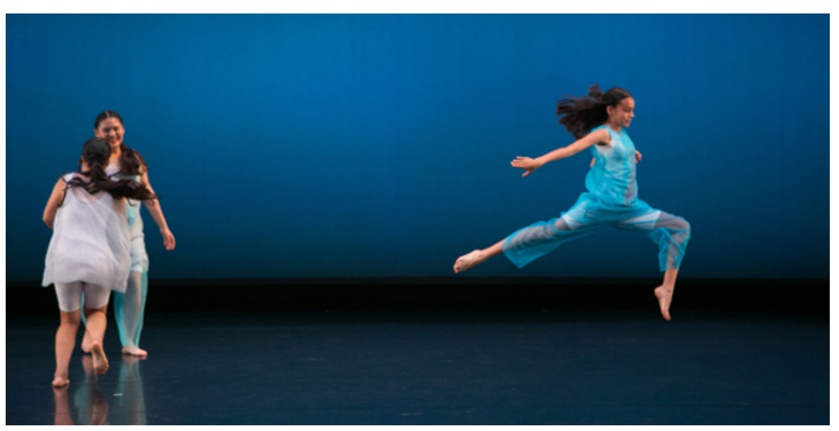
The Wooden Floor.