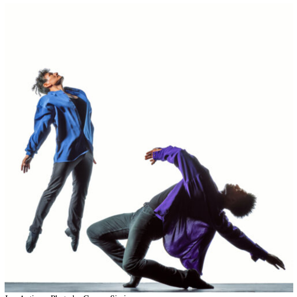
JazzAntiqua. Photo by George Simian