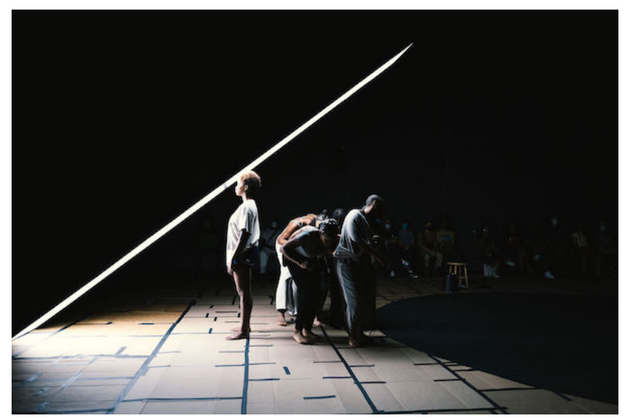
Okwui Oklpokwasili.