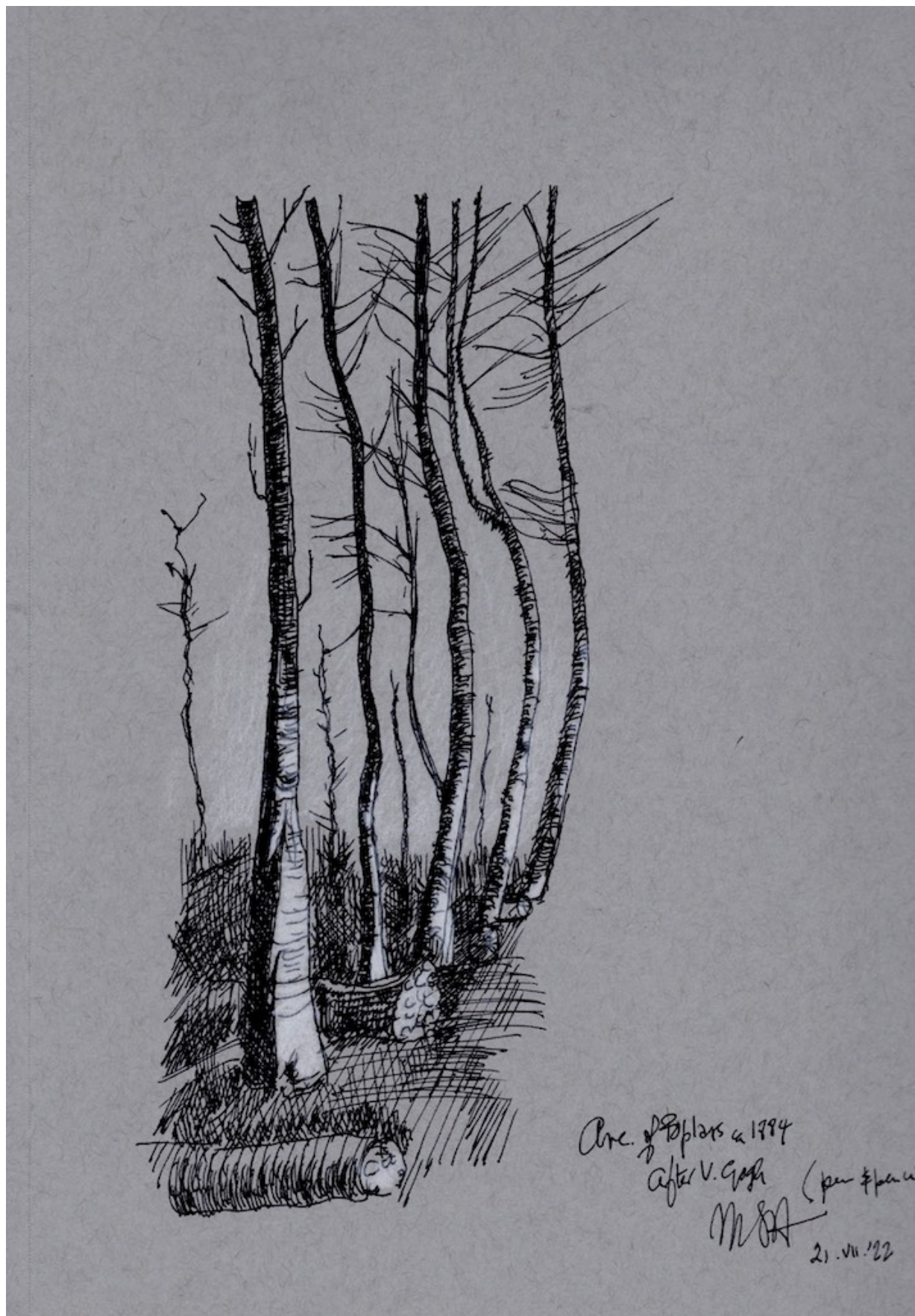
based on Avenue of Poplars, 1884

The original drawing is of two rows of poplars, one on each side of a country road. Check the dead branches bundles at the foot of each tree; ready to be picked up by the women of the village to heat their stoves and their modest shacks ... a humanizing detail of the trees own destiny, Vincent would not miss , and that is why I chose to keep them in my drawing.