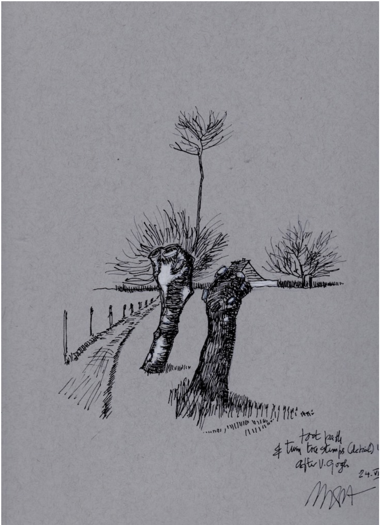
Based on the footpath – March 1888

Can you imagine a more desolate image than these two beheaded tree stumps in the middle of a harvested field belonging, most likely, to the farm house shown on the far side of the field? Let us call them, brothers in misfortune , seemingly leaning for help and rebirth, as a way to shared destiny .