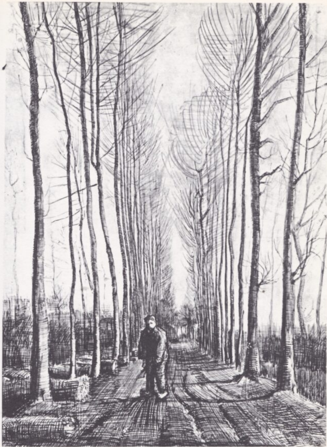
AVENUE OF POPLARS. MARCH 1884.