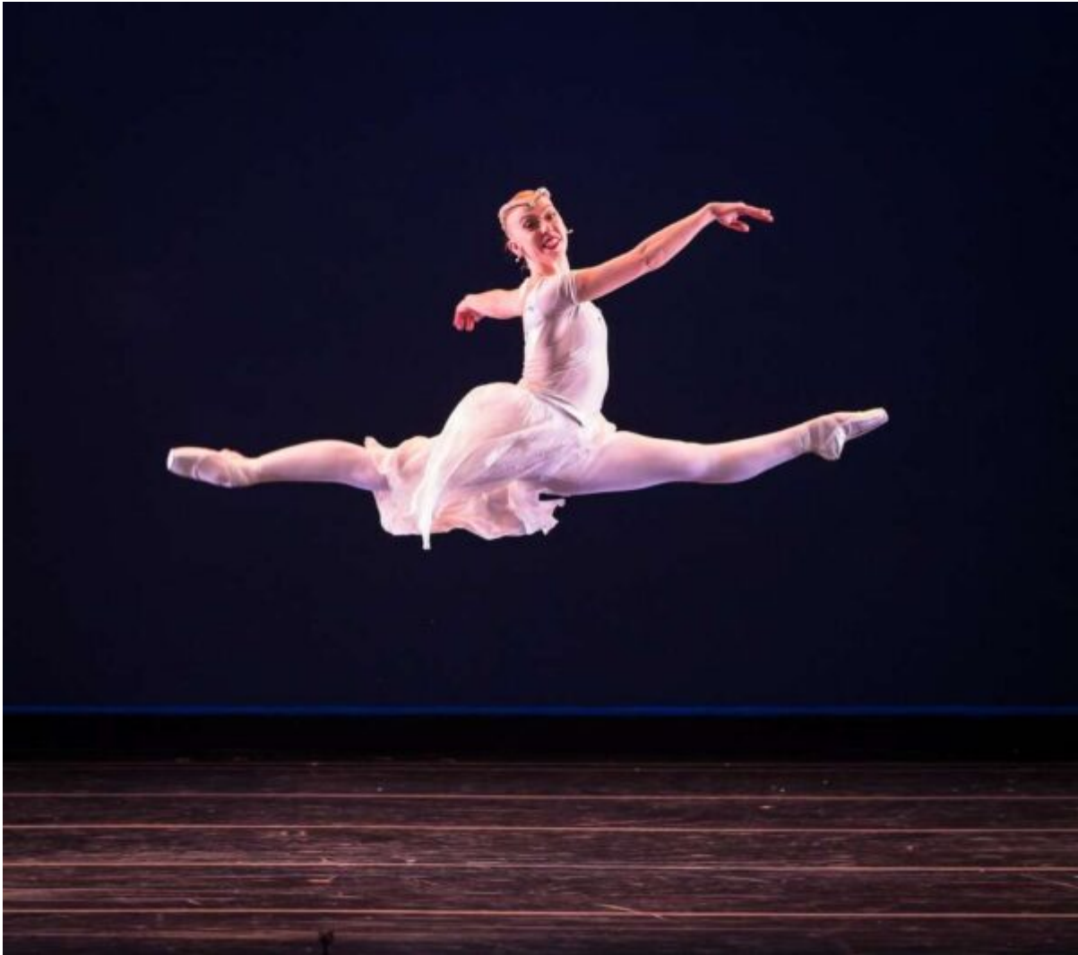
Westside Ballet.