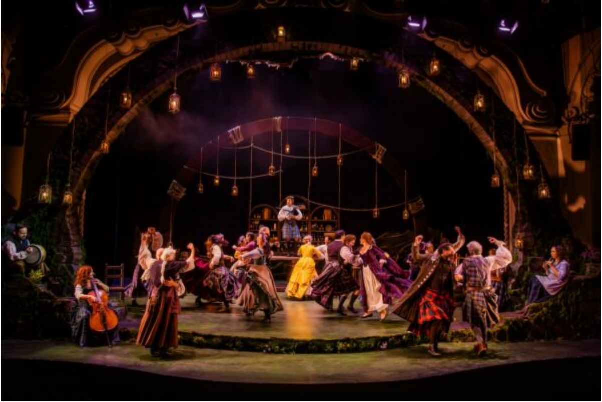
Pasadena Playhouse's "Brigadoon."