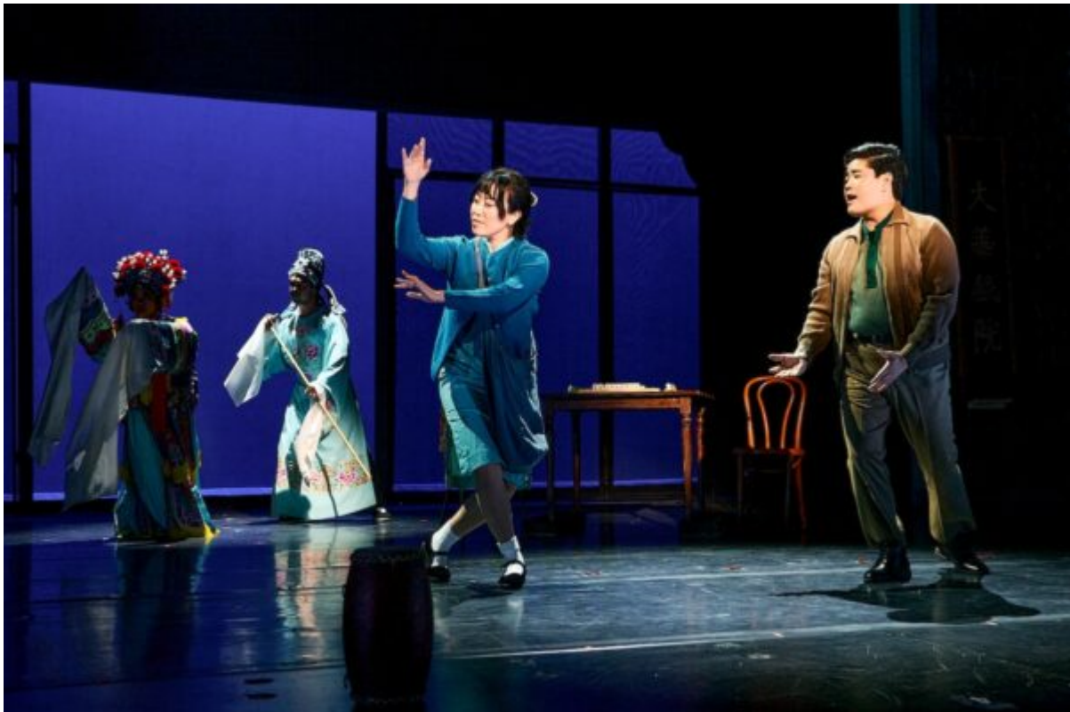
East West Players' "Flower Drum Song."

striking chords that echo contemporary conundrums. Not to slight the leads or the direction, but theater reviewers' raves have given those elements most of their words, with scant nod to the dancers. Since this space is about dance, it's rightly the spot to give a shout out to the show's triple threat dancer/singers' quicksilver acting shifts among multiple characters, and especially their instantaneous shapeshifting from Communist intimidators to desperate refugees to sexy chorines. Bonus applause for dancers and leads who segue from sizzling jazz moves to the elegant serenity of the classical Chinese dance that requires artful manipulation of diaphanous 'water sleeves' extending several feet beyond the hands. Hopefully, Hwang and everyone who brought Flower Drum Song and these dancers to the stage will continue the show beyond this run. At the JACCC Aratani Theatre, 244 S. San Pedro St., Little Tokyo; Thurs.-Fri., 7:30 pm, Sat., 2 & 8 pm, Sun., 1 & 7 pm, thru Sun., May 31, $25-$119. East West Players-Flower Drum Song .