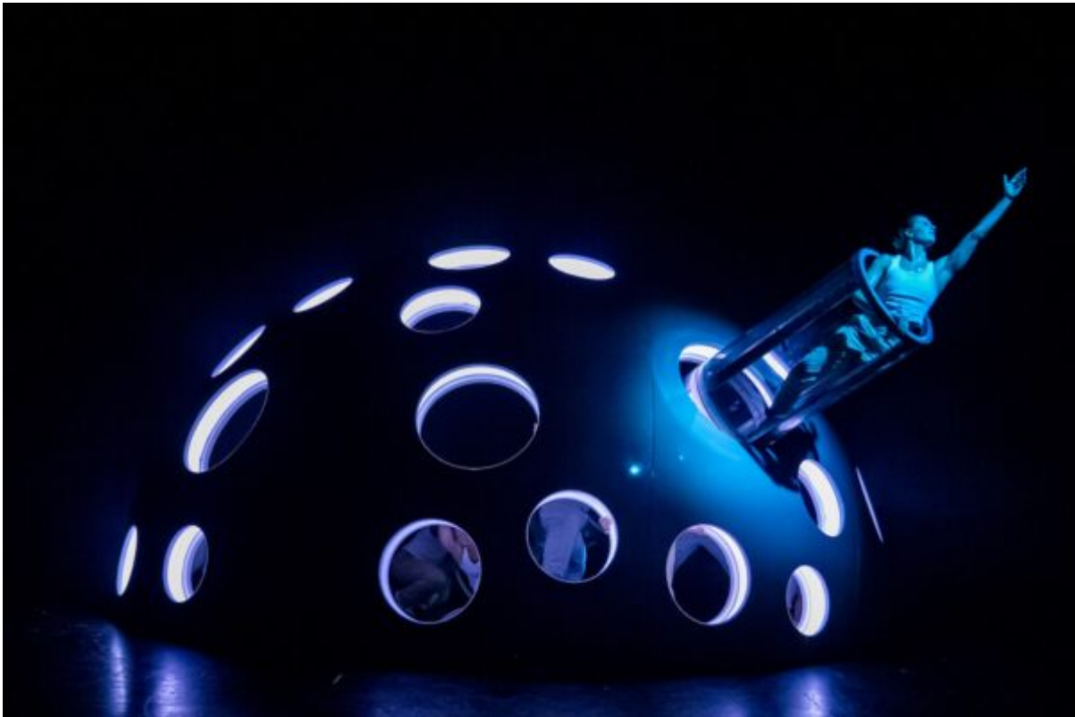
Diavolo's "Escape."