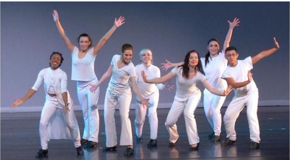
Tap Dance Widows Club.