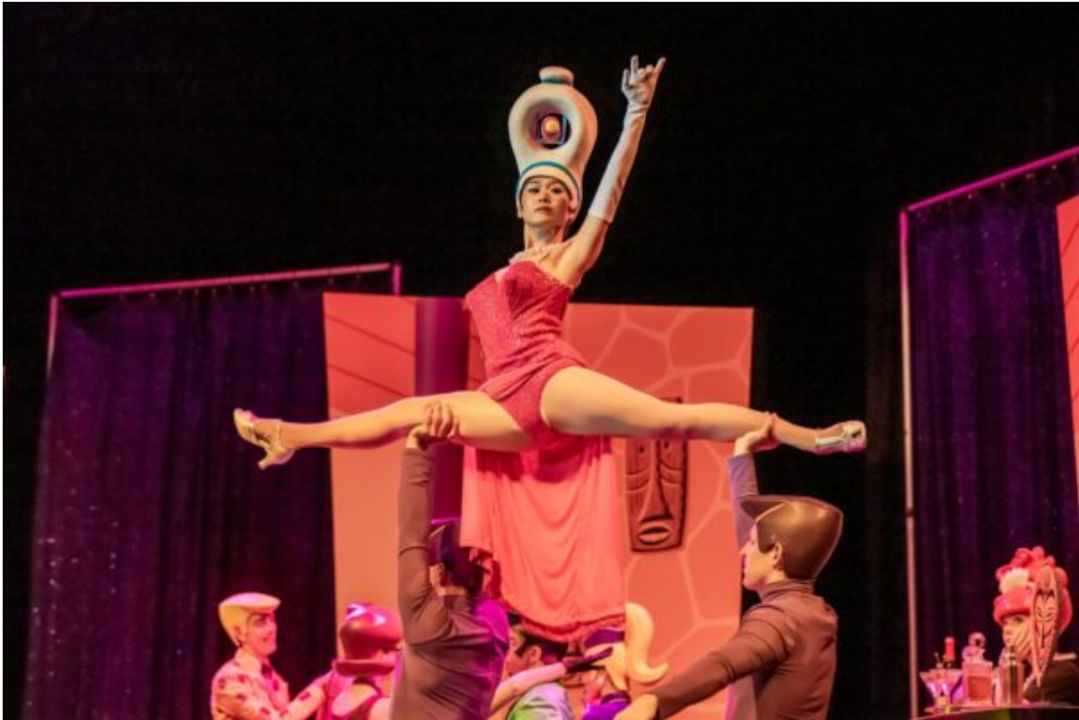
Shag With a Twist.