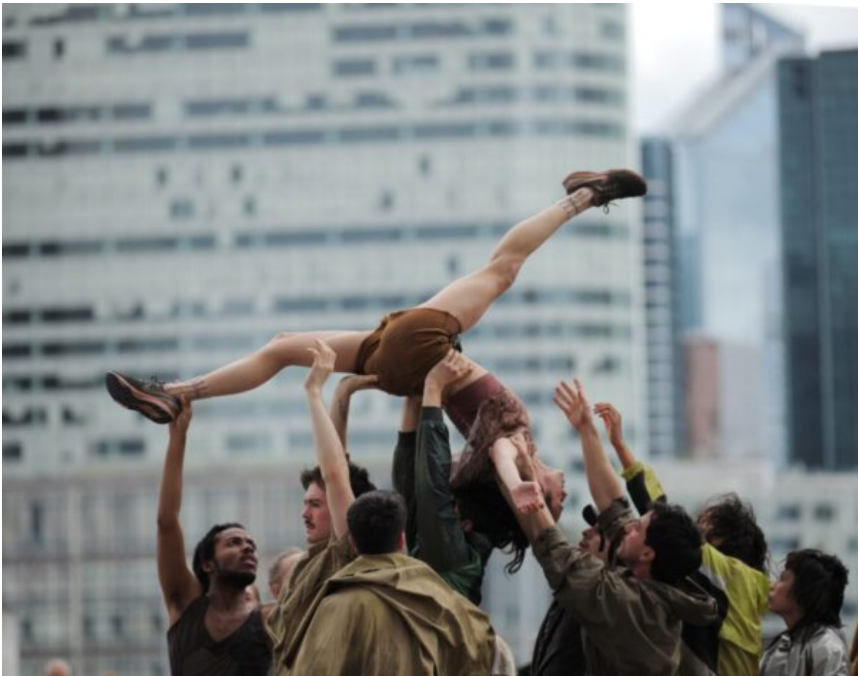
Los Angeles Dance Project "City of Dance.