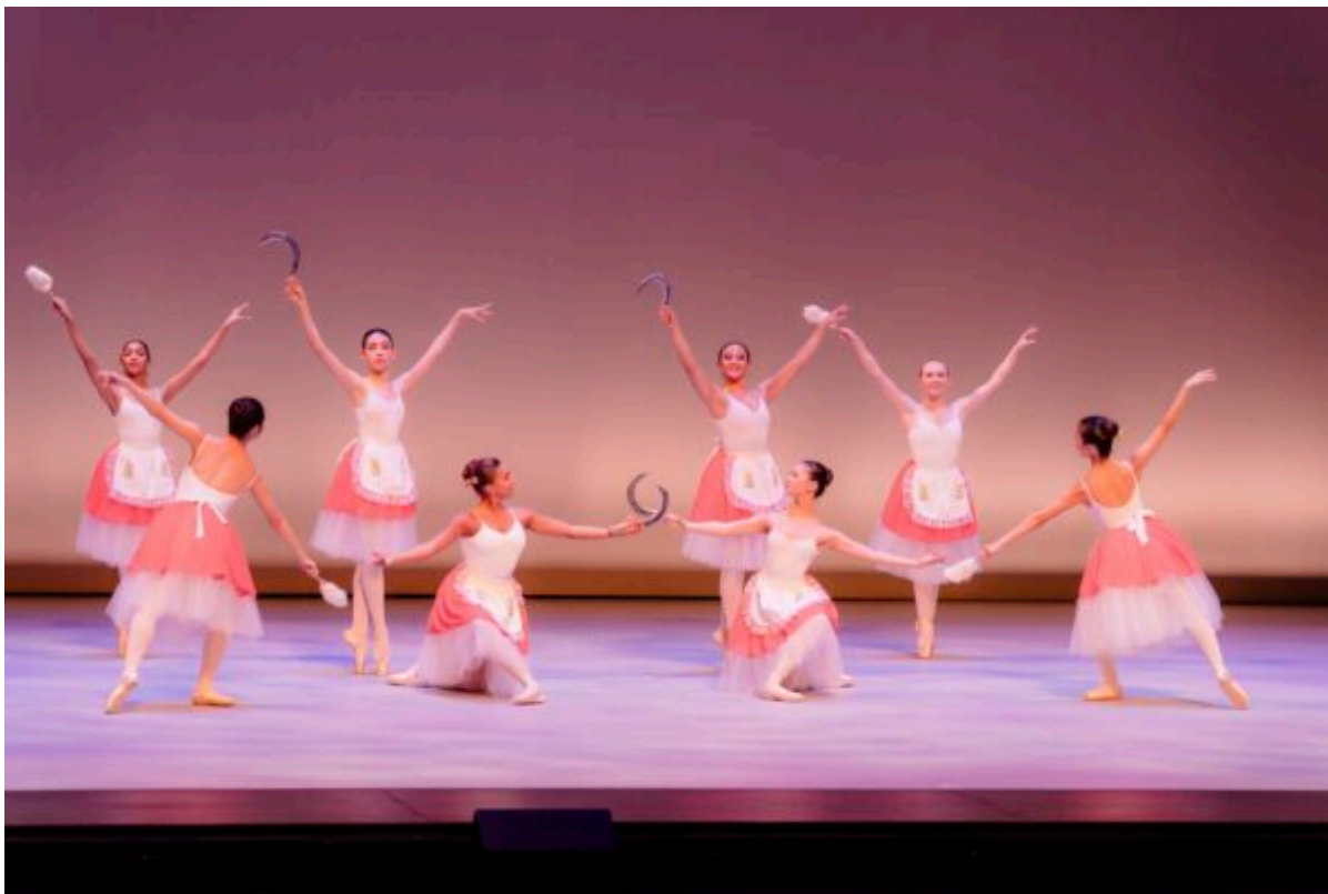
The American Ballet Theatre William J Gillespie School.