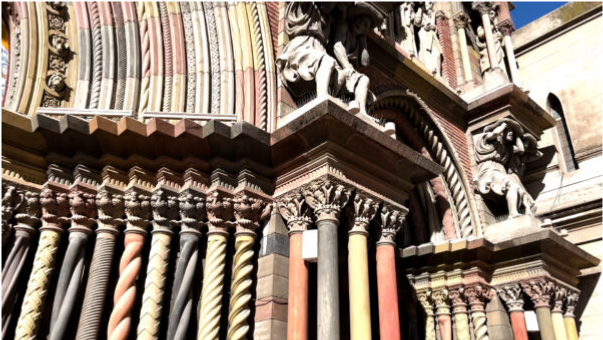
Detail of Capuchines Church in Cordoba.