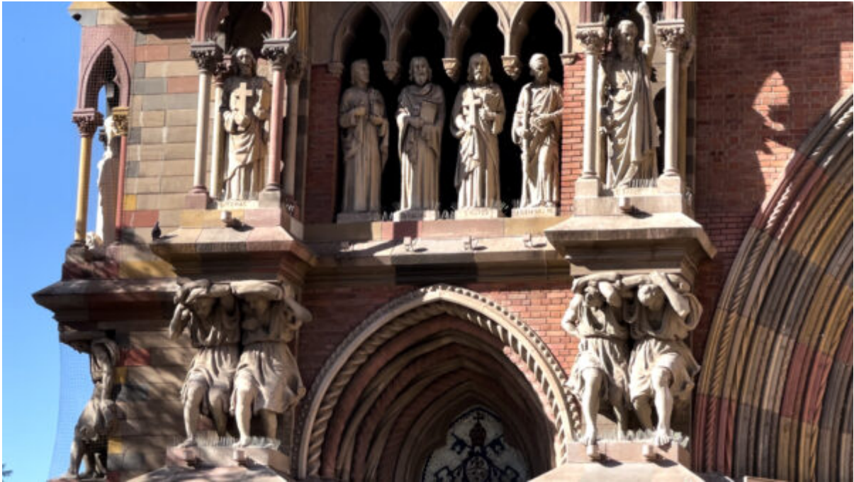
Detail of Capuchines Church in Cordoba.