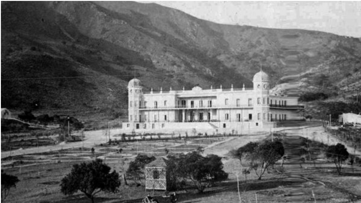
View of Hotel Eden in 1897