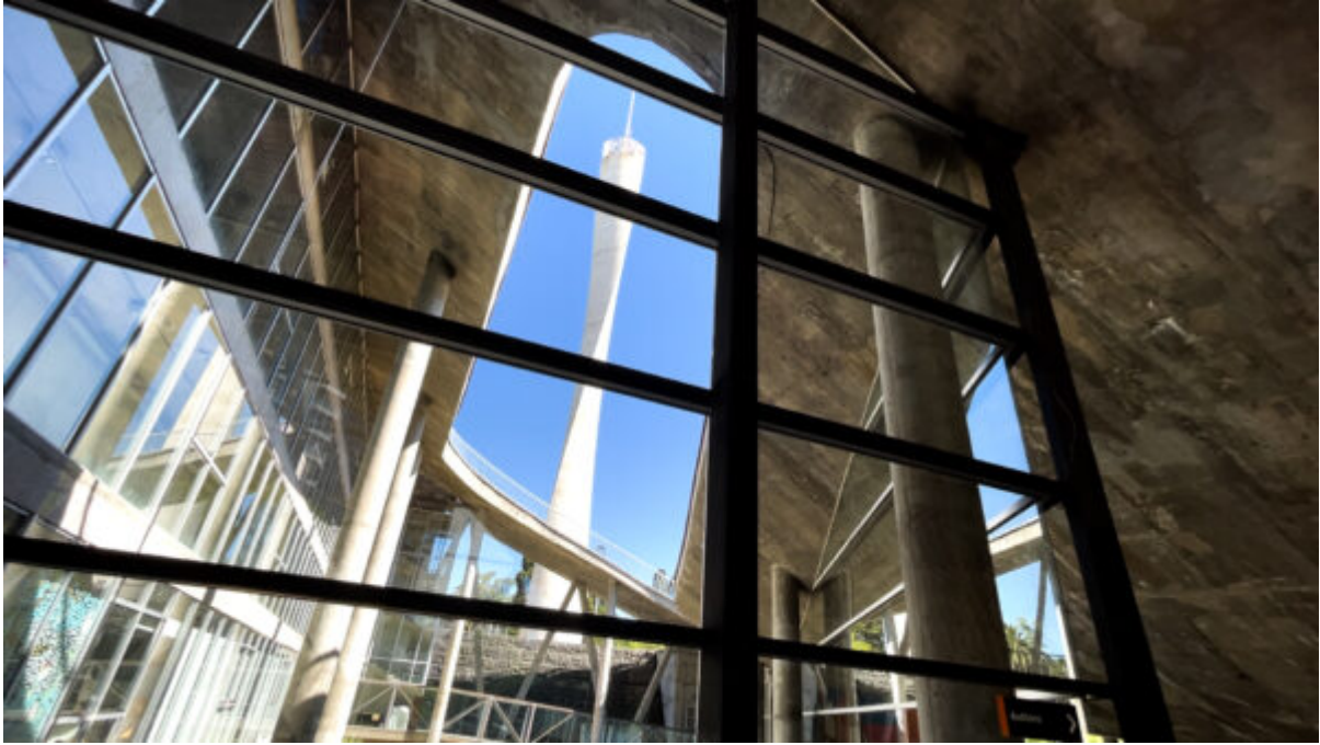
Cultural Center in Cordoba.