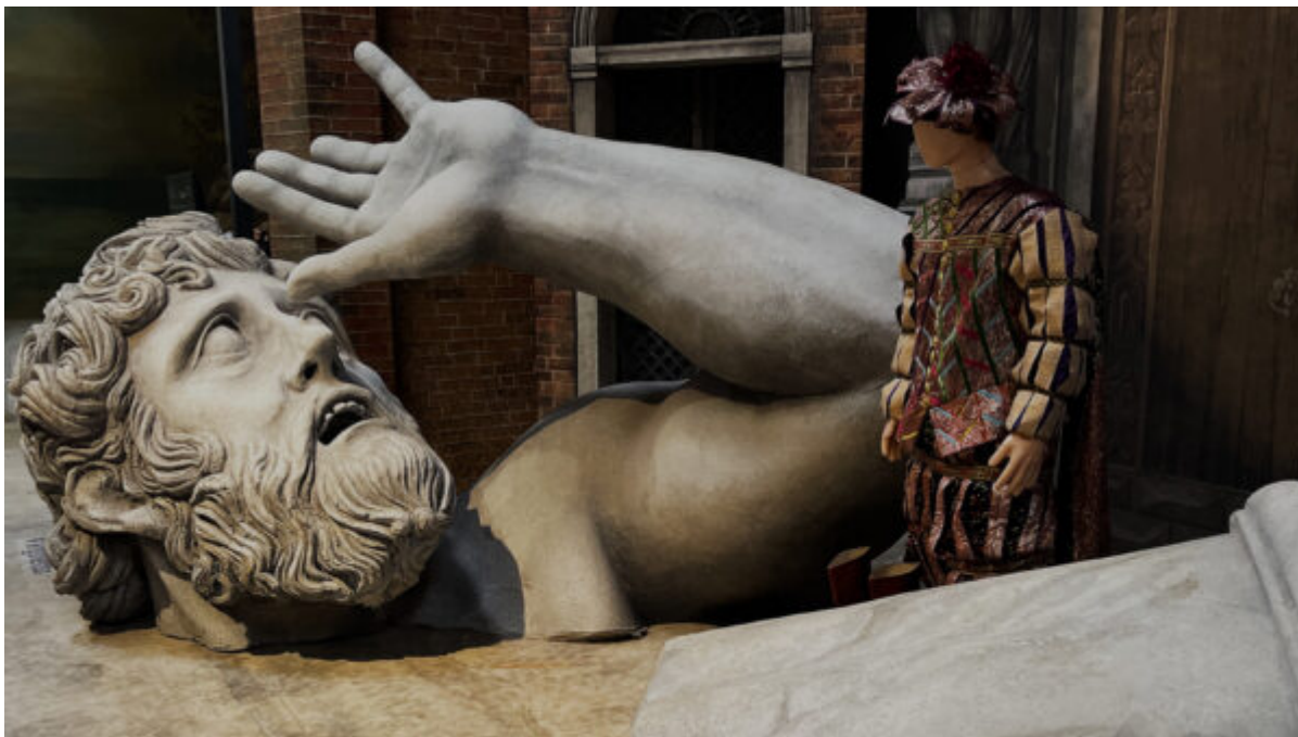
Stage design at Colon Fabrica.