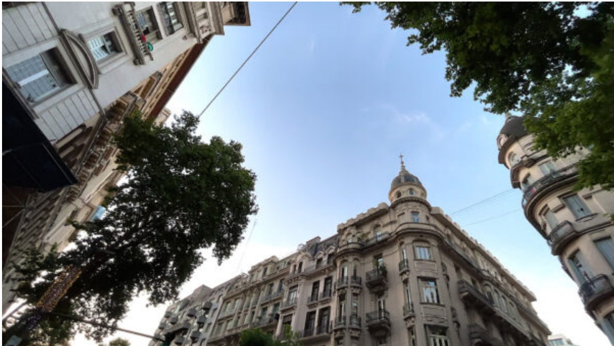
View of Avenida de Mayo in Buenos Aires.