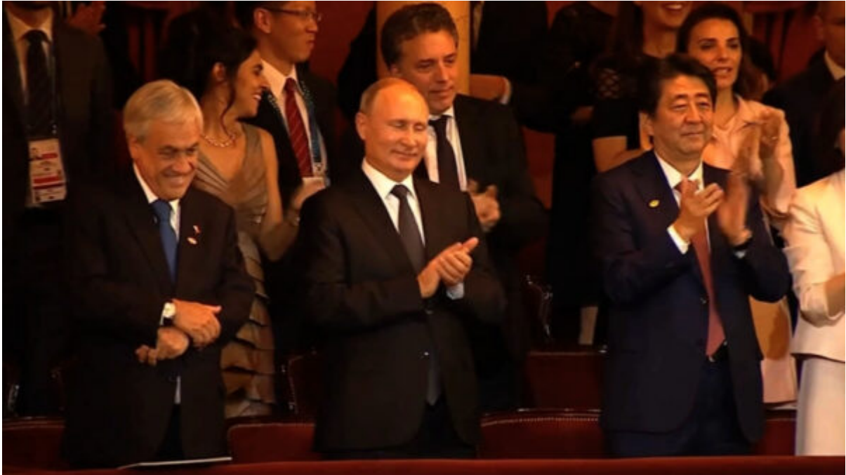
G20 leaders applauding