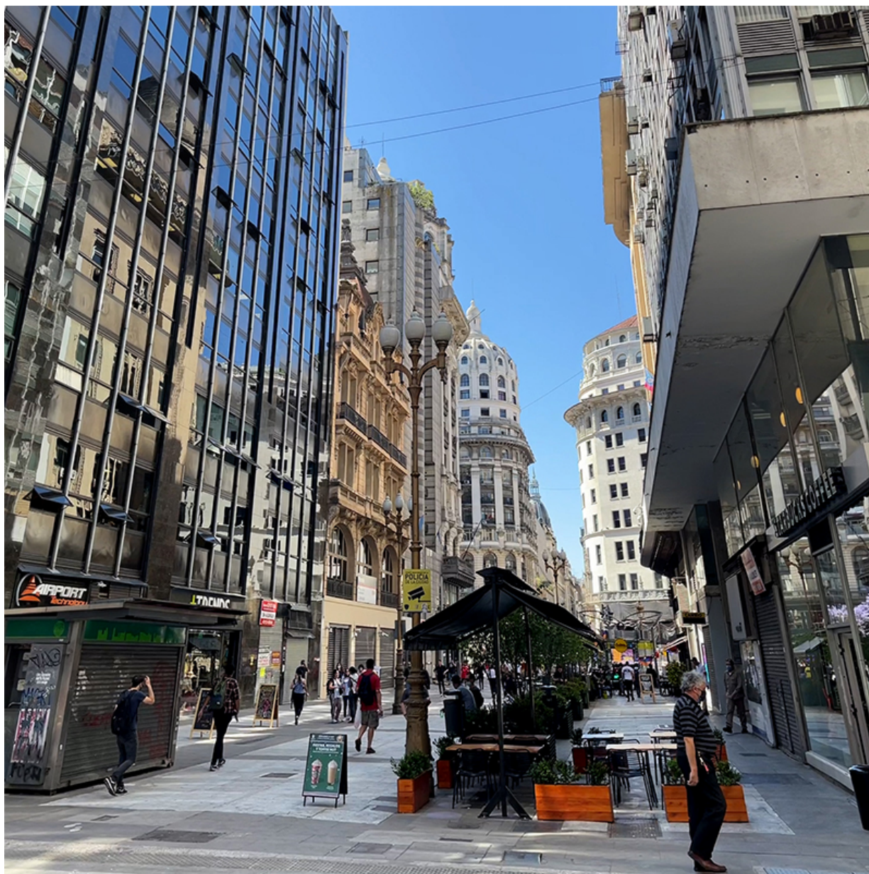
Calle Florida in Buenos Aires

“TO ARGENTINA: Another Look” brings a different perspective of Buenos Aires and Cordoba, as observed during three weeks in late 2021. Rather than being “a three-act story,” this feature documentary, partially autobiographical, is a sort of “quilt,” bits and pieces stitched together as a unity. It will take you to places, people, and events rarely noticed by visitors or even by residents.