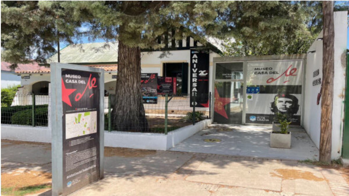
Che Guevara's house in Alta Gracia, Córdoba.