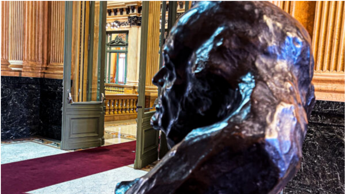
Partial view of Teatro Colón's Halls.