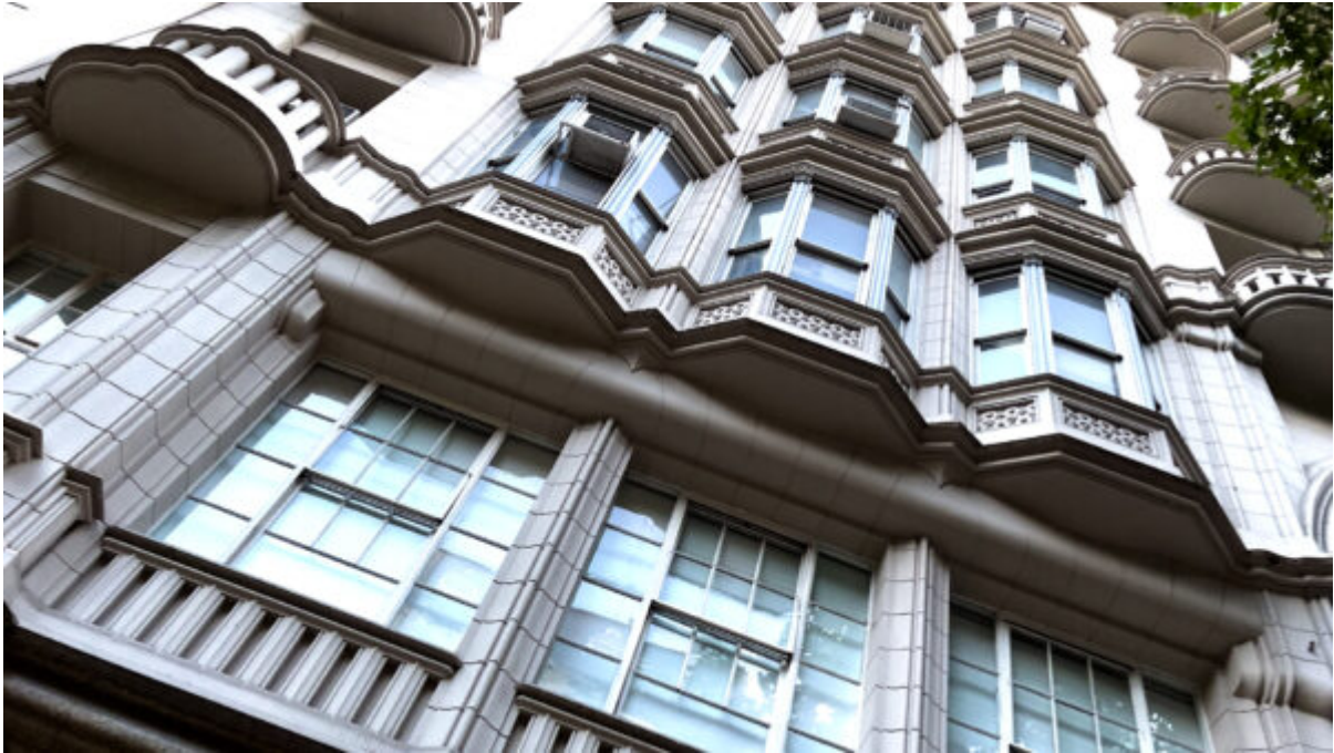
View of Avenida de Mayo in Buenos Aires