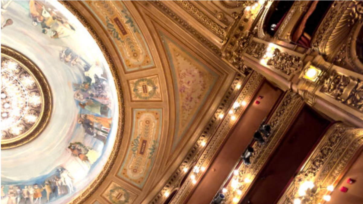
Teatro Colon – Ceiling.