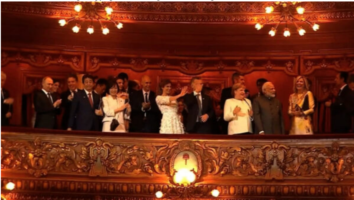
G20 Leaders at Teatro Colon, 2018