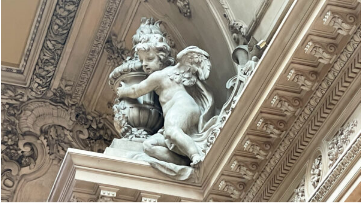
Detail of Angel at Teatro Colon.