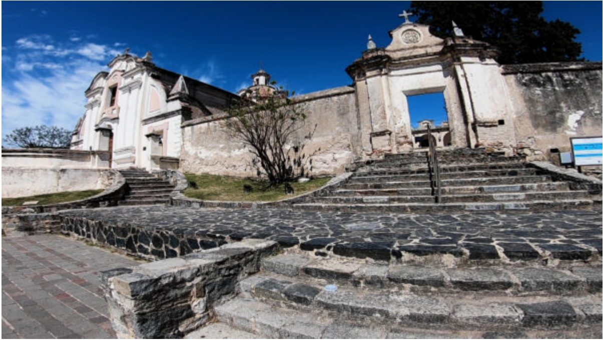
Jesuit Ranch in Alta Gracia.