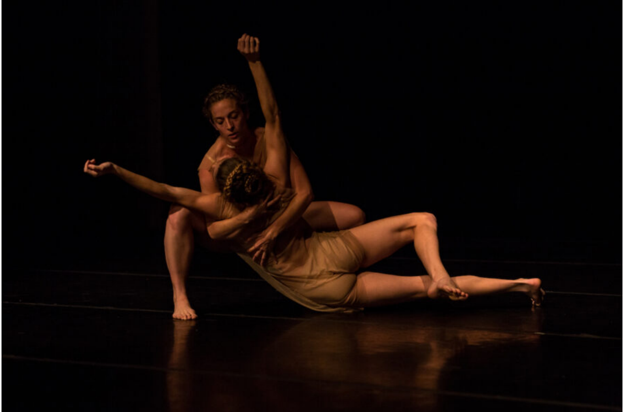
Szalt Dance Company.