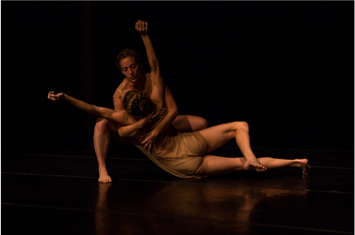
Szalt Dance Company.