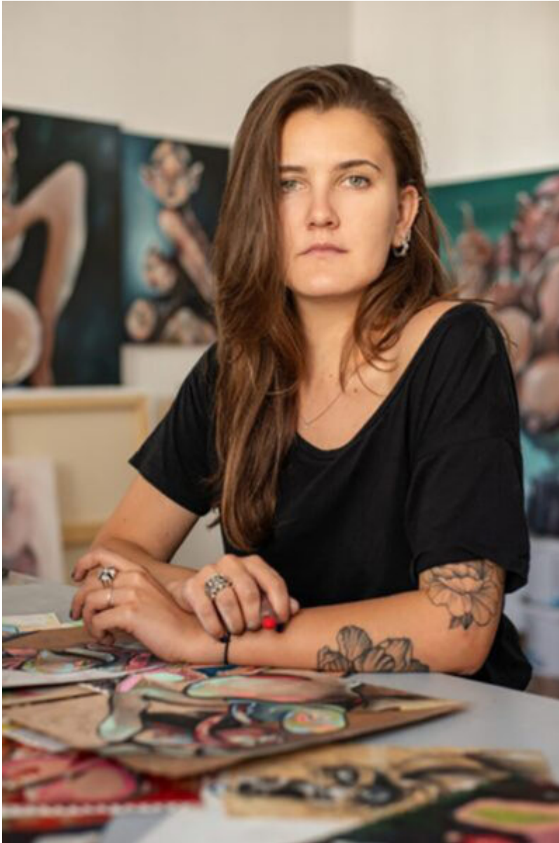
Artist Alina Samanova

With the war in Ukraine entering most people's lives worldwide, Ukrainian Bullets shows creative alternatives from life before the beginning of the war. In delineating a short documentary, I focused on contemporary young artists at the forefront of art, music, and architecture.