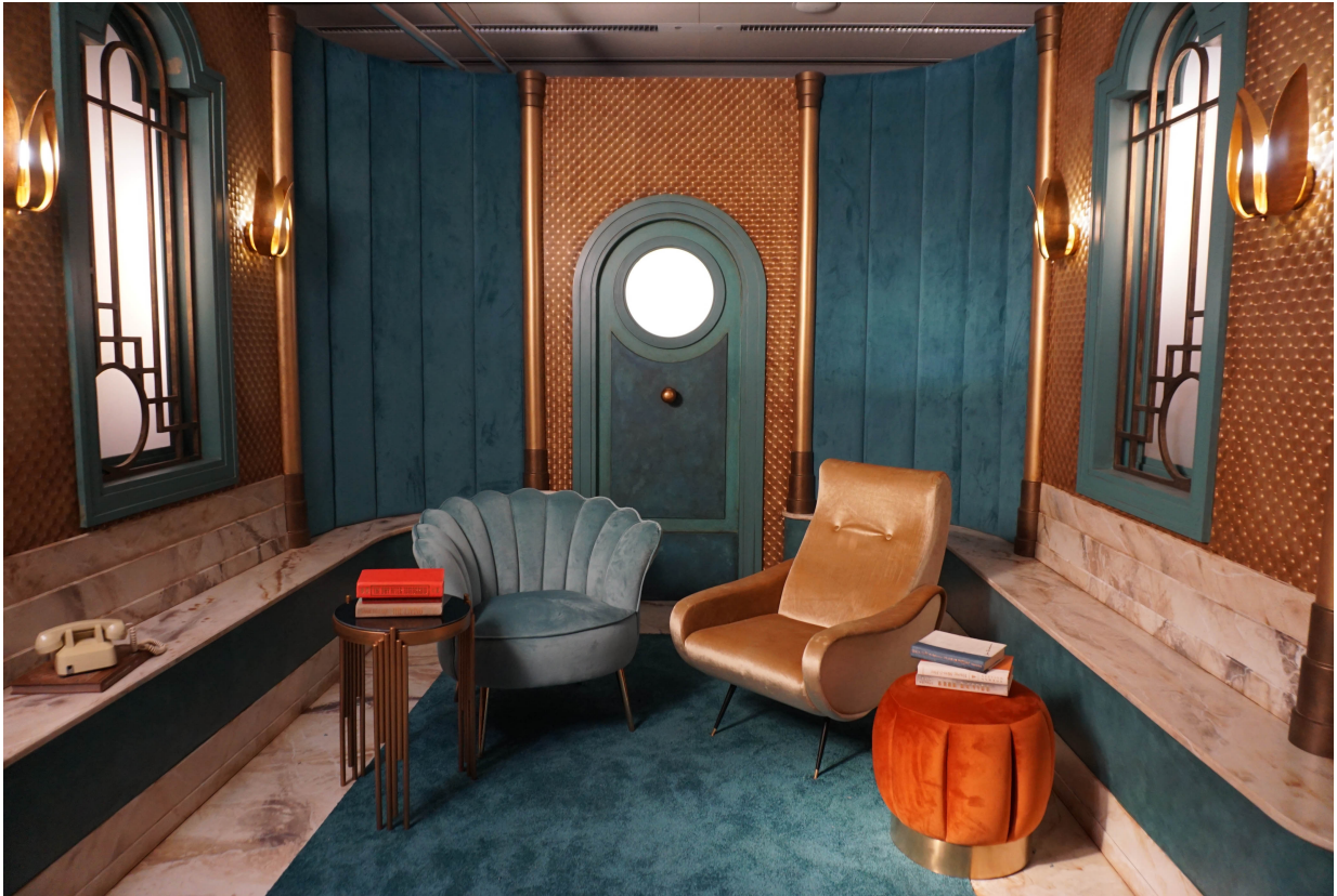
Oscar party set

Vanity Fair-Hollywood Calling runs through July 26, 2020.