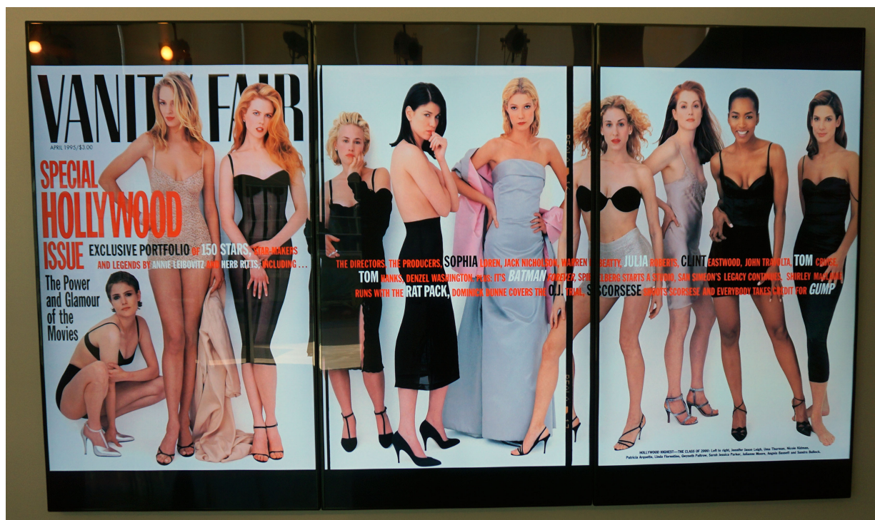
Vanity Fair 1995

Banderas and Dafoe are interviewed in the video, as is Jennifer Hudson, who says, “This almost feels like making a movie.”