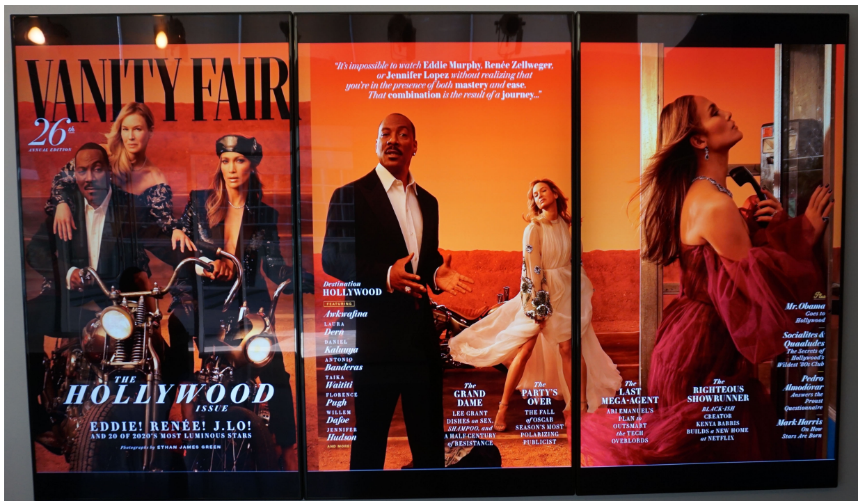
Vanity Fair 2020

Vintage prints in Color and Black and White are not the only attraction at the Annenberg, the most interesting part of each show is the video that illustrates how the photographers work. In this case we are guided behind the scenes of the big production of shooting Vanity Fair's Hollywood issue 2020 . The complex task is entrusted to a young photographer, Ethan James Green , 30, who used to be a fashion model. He says that photographing actors is different than working with models, because they know how to play characters. The setting is a surreal road trip along Route 66.