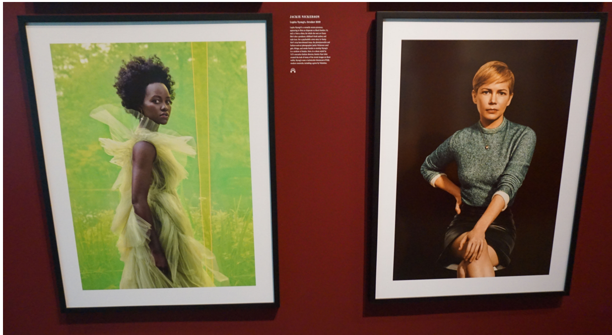
Vanity Fair- Hollywood Calling