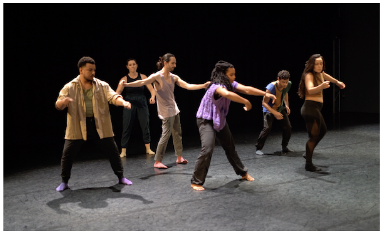
Bodies in Play.

Bodies at Play – A Dancer's Project at LA Dance Project, 2235 E. Washington Blvd., Arts District; Fri.-Sat., April 12-13, 7 pm, $35-$45, $25 students & seniors. Flipcause.