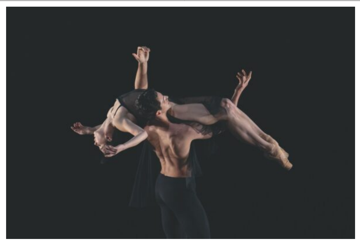
American Ballet Theatre in Woolf Works.