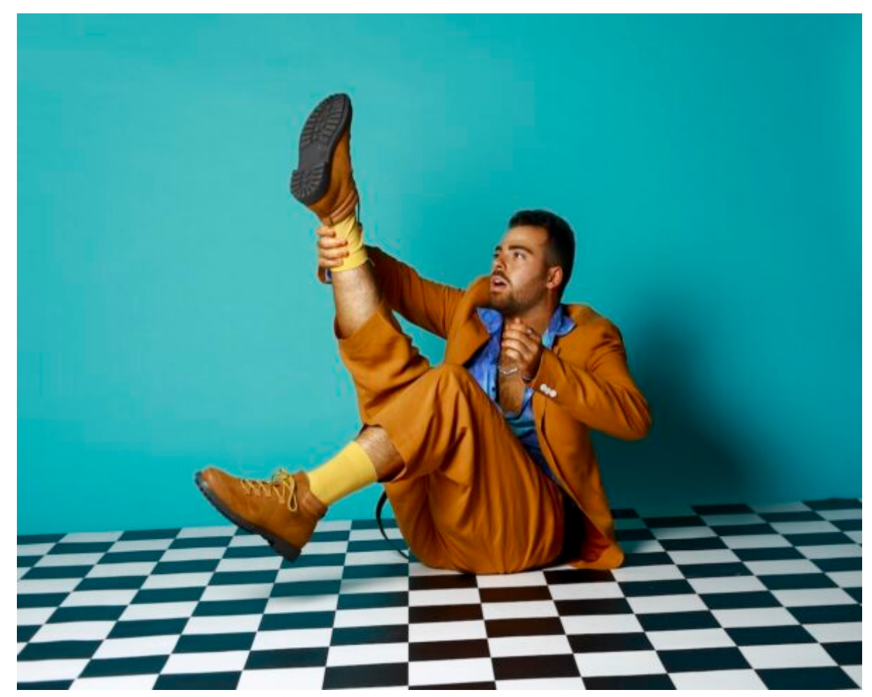
Brian Golden. Photo courtesy of the artist