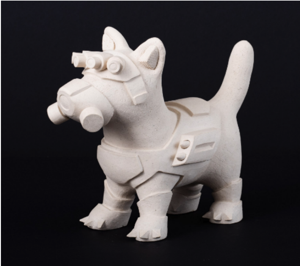
Puppy – Ben Jackel