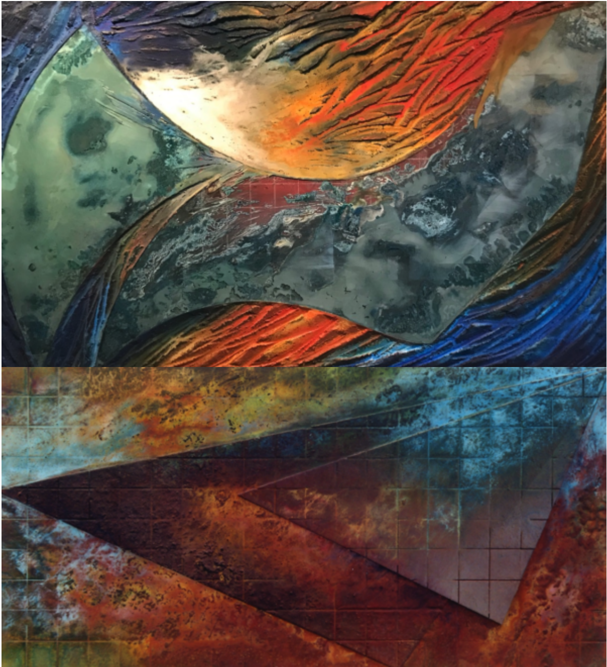
Untitled, 2000 – Laddie Dill