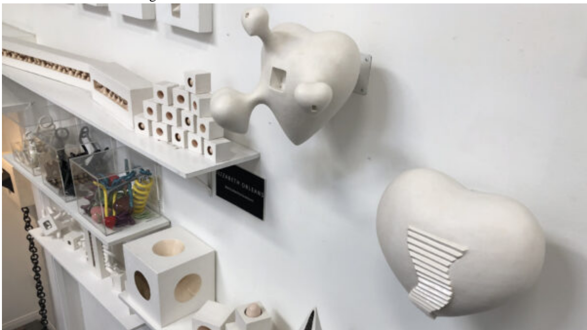
Sculptures – Elisabeth Orleans