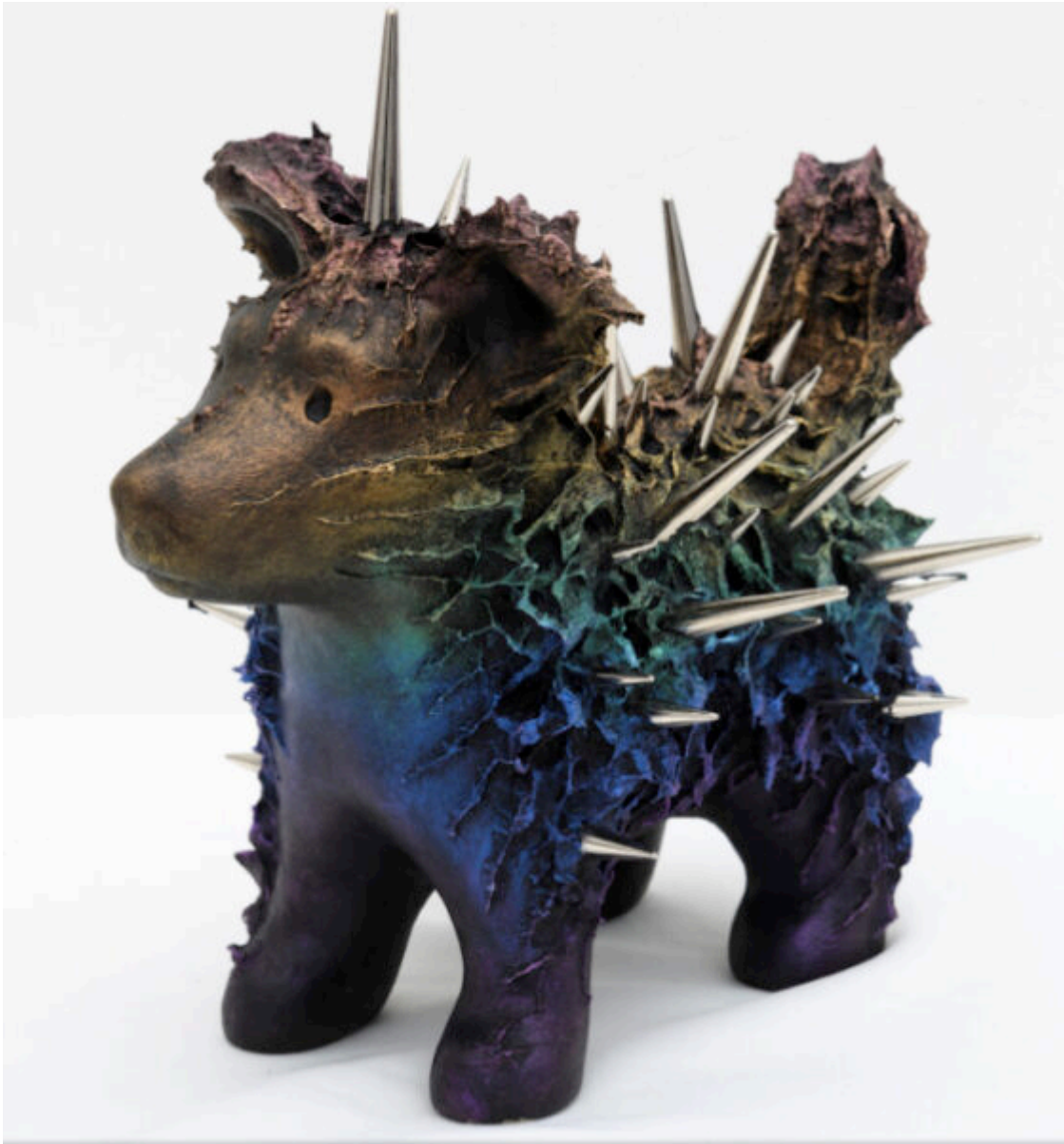
Puppy – Kelly Berg