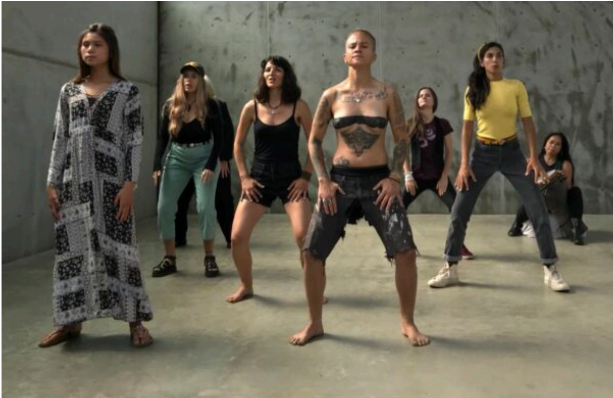
Standing Ground, 2018 – Tanja Skasla