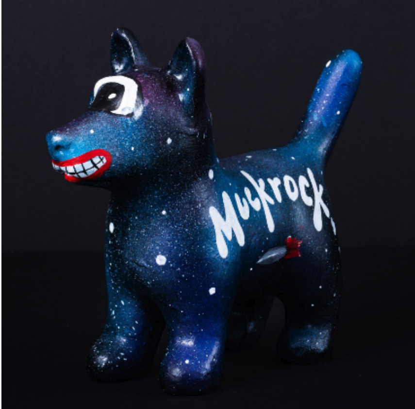
Puppy – Jules Muck