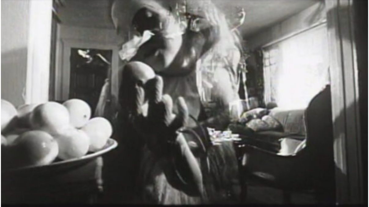
Orang Orange 0 Natasha maidoff