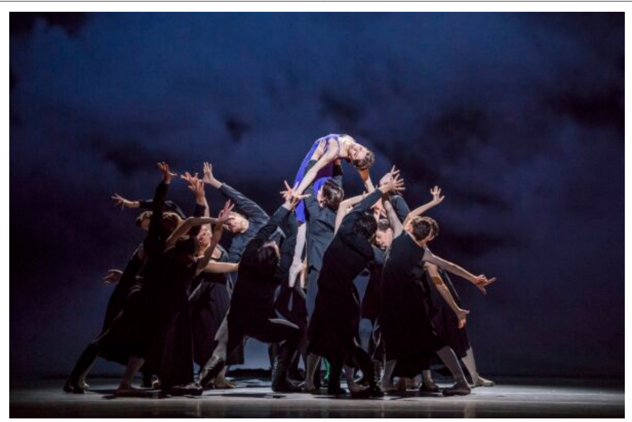
American Ballet Theatre in "A Winter's Tale."