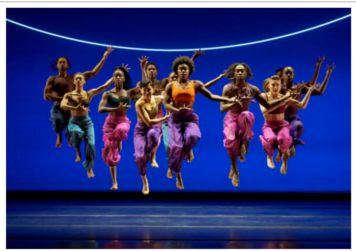
Alvin Ailey American Dance Theater.