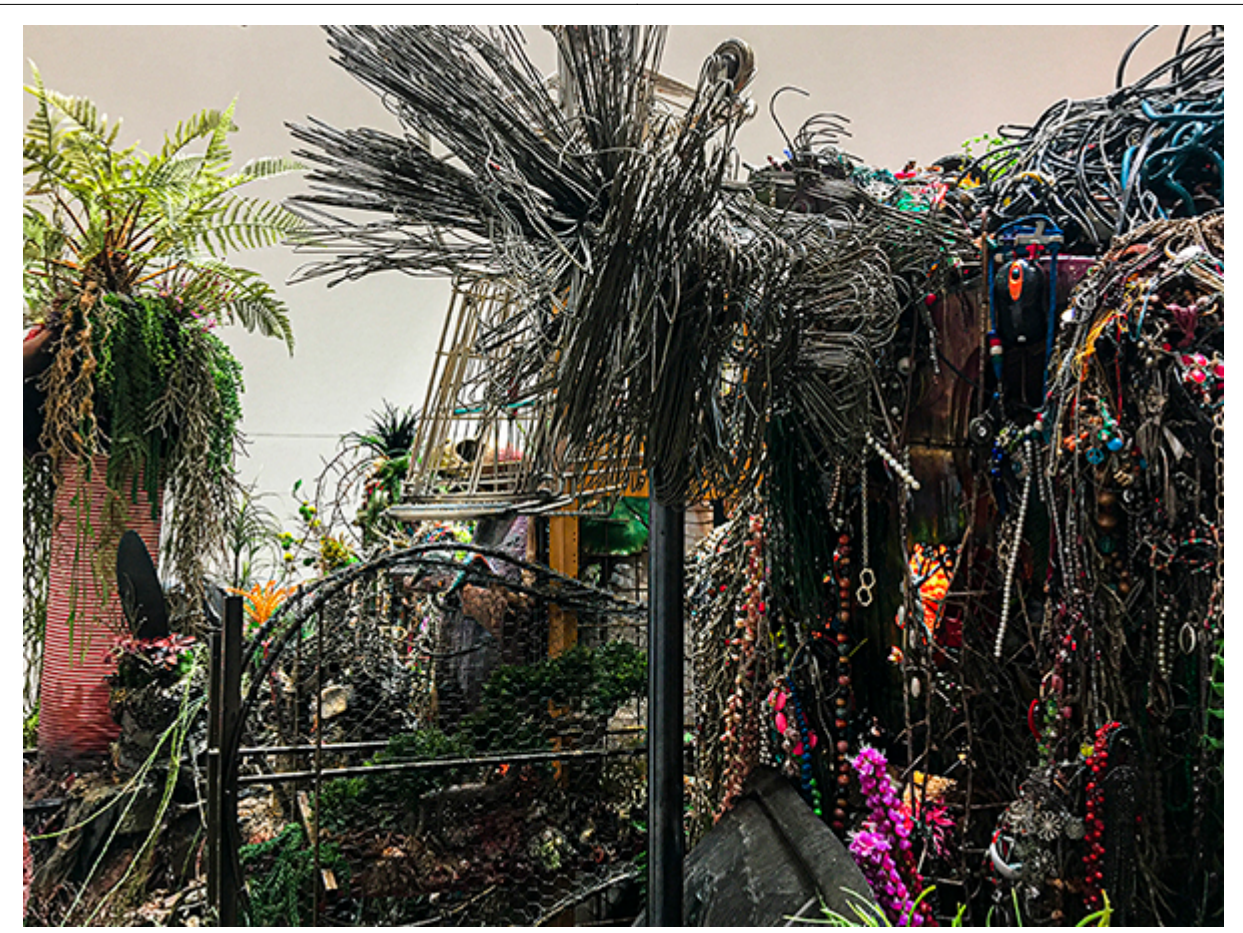
Max Hooper Schneider's installation, detail