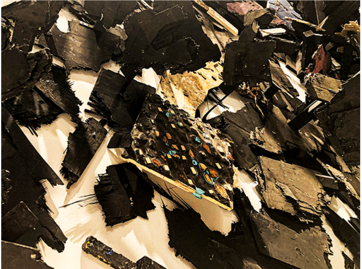
Leonardo Drew's installation, detail

Leonardo Drew's installation at the Hammer Museum's lobby