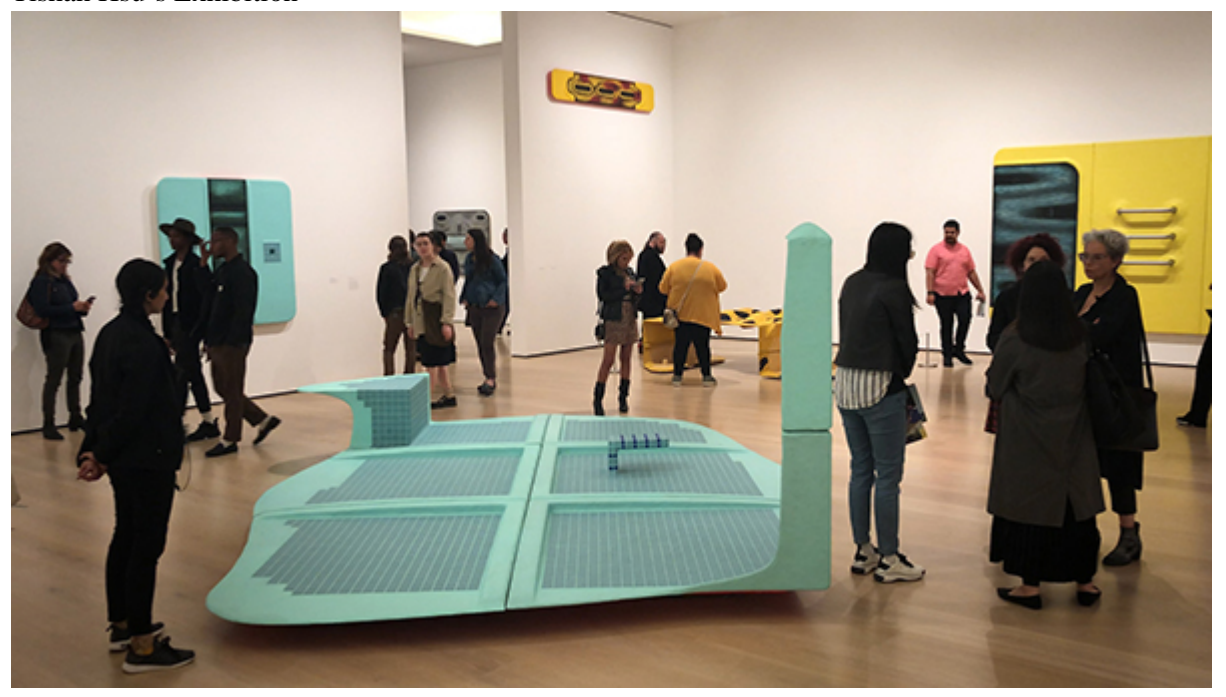
Tishan Hsu's Exhibition