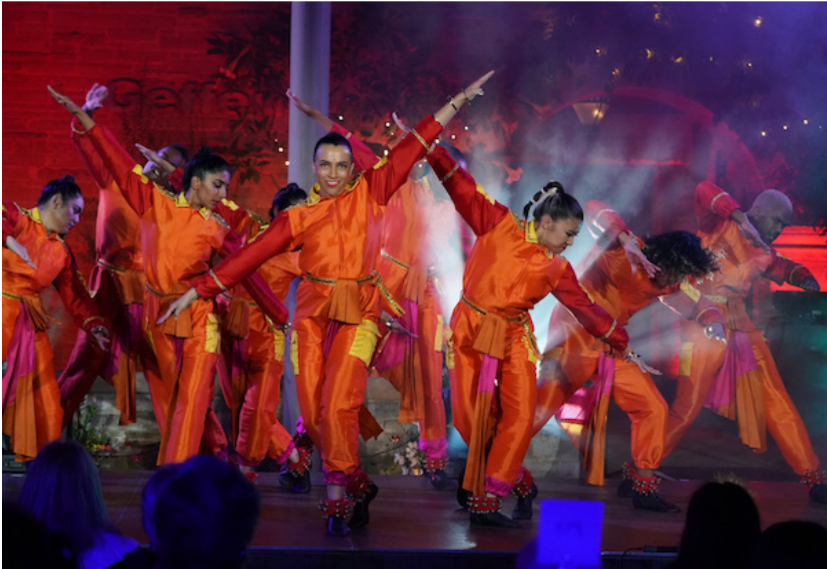
Blue13 Dance Company.

Viver Brasil at Sierra Madre Playhouse, 87 West Sierra Madre Blvd., Sierra Madre; Sat., Sept. 28, 11 am, $12. Sierra Madre Playhouse .