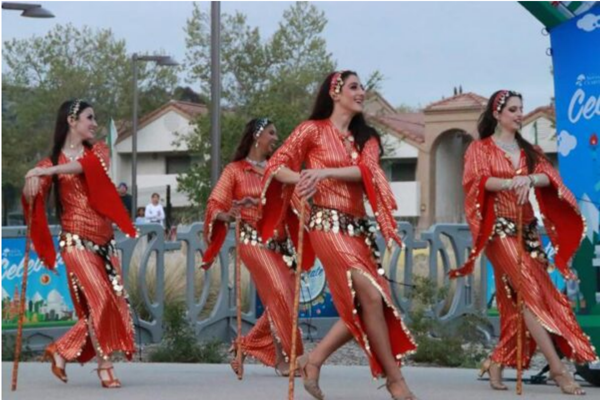
San Pedro ? Festival of the Arts.