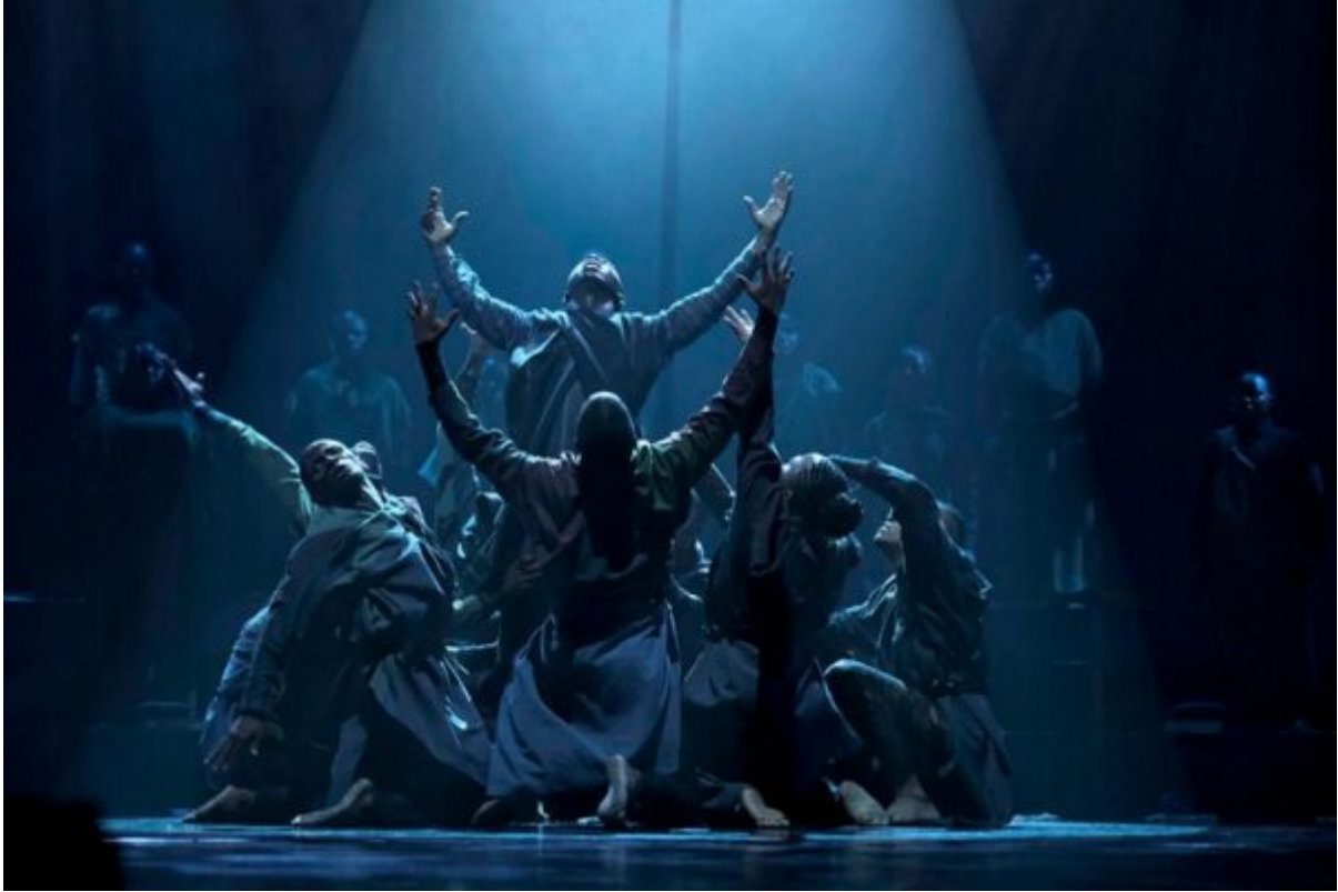
Vuyani Dance Theatre in Gregory Maqoma's "Cion."