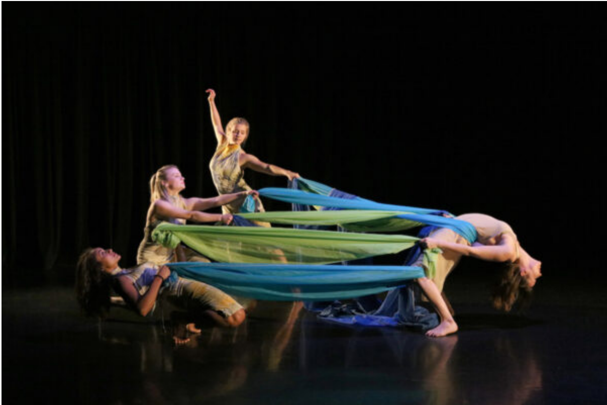
Lineage Dance.