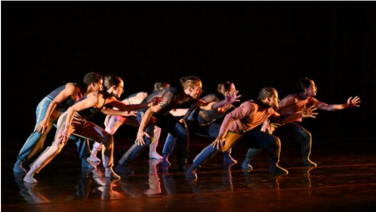
BODYTRAFFIC in “Snap.”