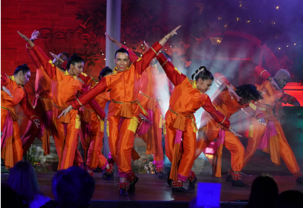
Blue13 Dance Company.

Viver Brasil at Sierra Madre Playhouse, 87 West Sierra Madre Blvd., Sierra Madre; Sat., Sept. 28, 11 am, $12. Sierra Madre Playhouse .