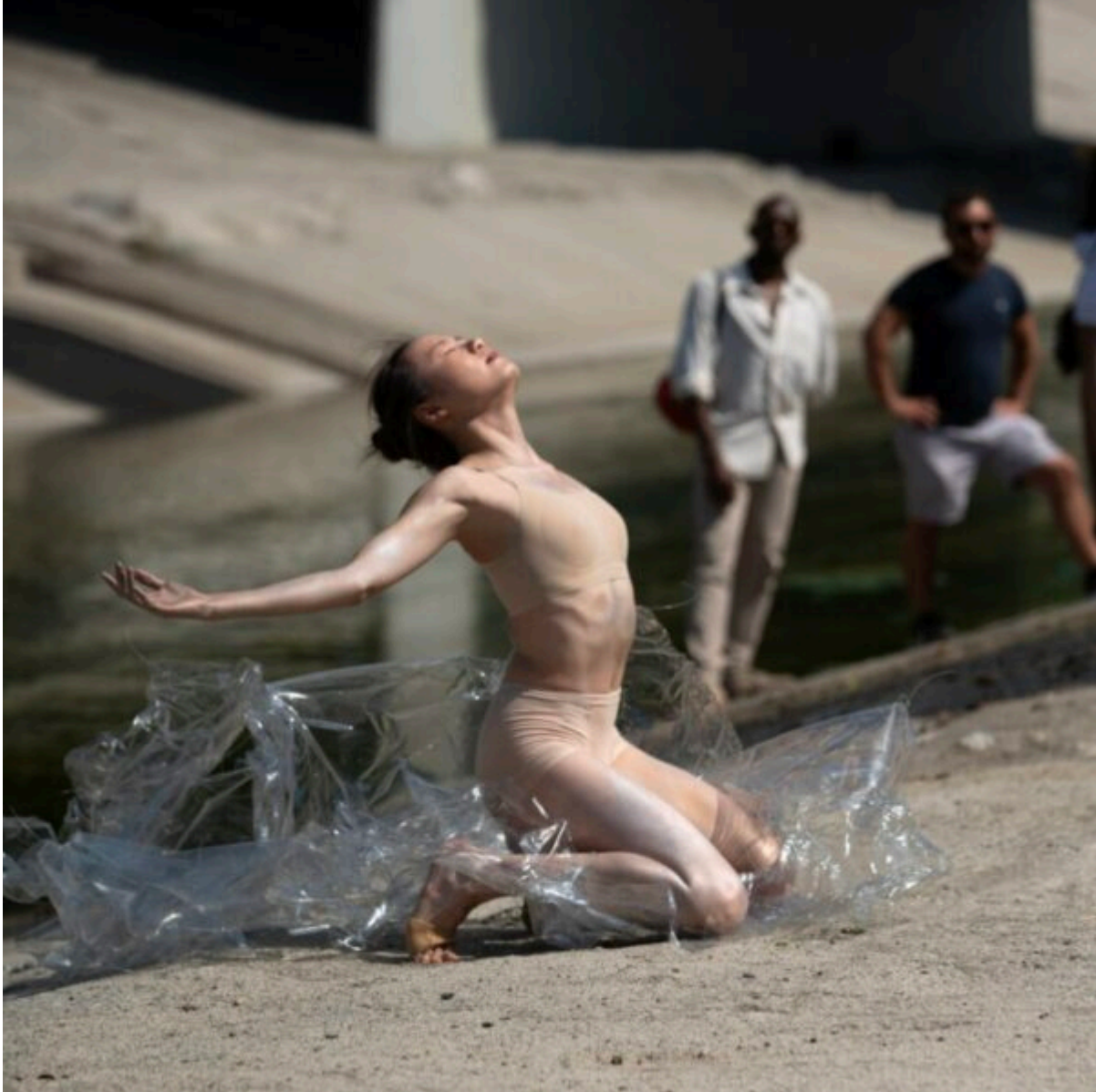
Heidi Duckler Dance.