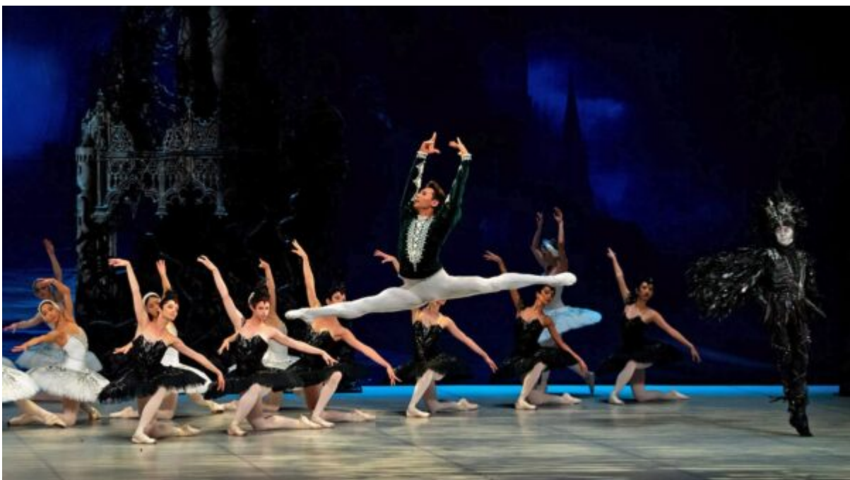
World Ballet.

The touring ensemble World Ballet Company , flies into SoCal, alighting at four venues in the next week with a full-length Swan Lake . Irvine Barclay Theatre, UC Irvine, 4242 Campus Dr., Irvine; Thurs.-Fri., Sept. 19-20, 7 pm, $64-$110. Irvine Barclay ; Also at the Alex Theatre, 216 N. Brand Ave., Glendale; Sat., Sept. 21, 7 pm, $58-$123. Ticketmaster . Also at Granada Theatre, 1214 State St., Santa Barbara; Sun., Sept. 22, 7 pm, $57-$132. Granada Theatre . Also at Fred Kavli Theatre, Bank of America Performing Arts Center, 2100 Thousand Oaks Blvd., Thousand Oaks; Sun., Sept. 25, 7 pm, $58-$143. Ticketmaster .