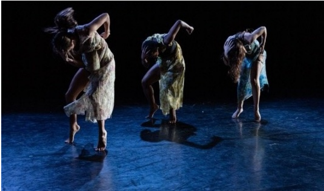
MashUp Contemporary Dance Company.

As part of the Frogtown Artwalk, MashUp Contemporary Dance Company offers live performance and dance films. Sponsored by the Elysian Valley Arts Collective, the biennial event offers a self-guided tour of studios, workshops, and pop-up galleries, plus dance performance at MashUp Studios at the Pickle Factory, 2828 Gilroy, Frogtown; Sat., Sept. 21, 4-6 pm, free. MashUp Contemporary Dance Company . Artwalk info at 2024 Frogtown Artwalk .