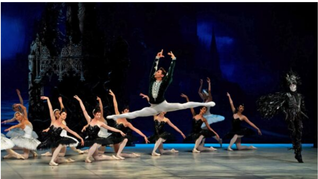
World Ballet.

The touring ensemble World Ballet Company , flies into SoCal, alighting at four venues in the next week with a full-length Swan Lake . Irvine Barclay Theatre, UC Irvine, 4242 Campus Dr., Irvine; Thurs.-Fri., Sept. 19-20, 7 pm, $64-$110. Irvine Barclay ; Also at the Alex Theatre, 216 N. Brand Ave., Glendale; Sat., Sept. 21, 7 pm, $58-$123. Ticketmaster . Also at Granada Theatre, 1214 State St., Santa Barbara; Sun., Sept. 22, 7 pm, $57-$132. Granada Theatre . Also at Fred Kavli Theatre, Bank of America Performing Arts Center, 2100 Thousand Oaks Blvd., Thousand Oaks; Sun., Sept. 25, 7 pm, $58-$143. Ticketmaster .