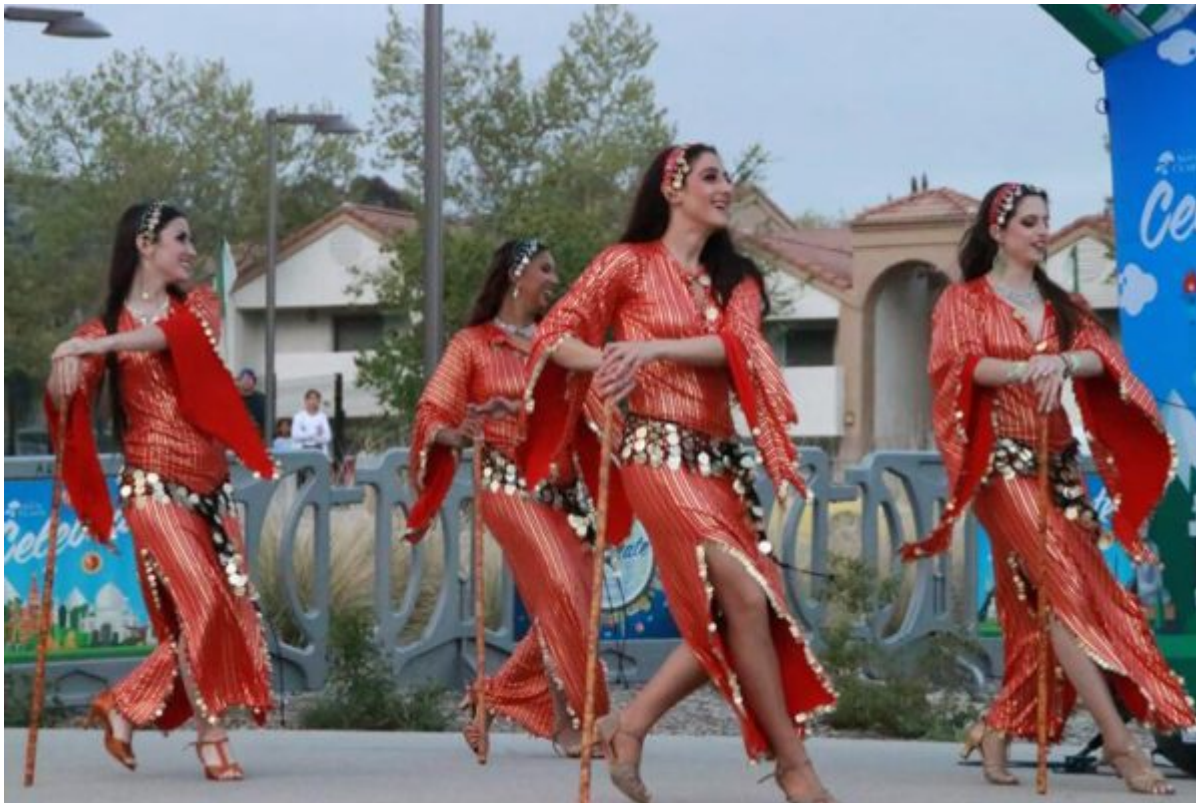
San Pedro ? Festival of the Arts.