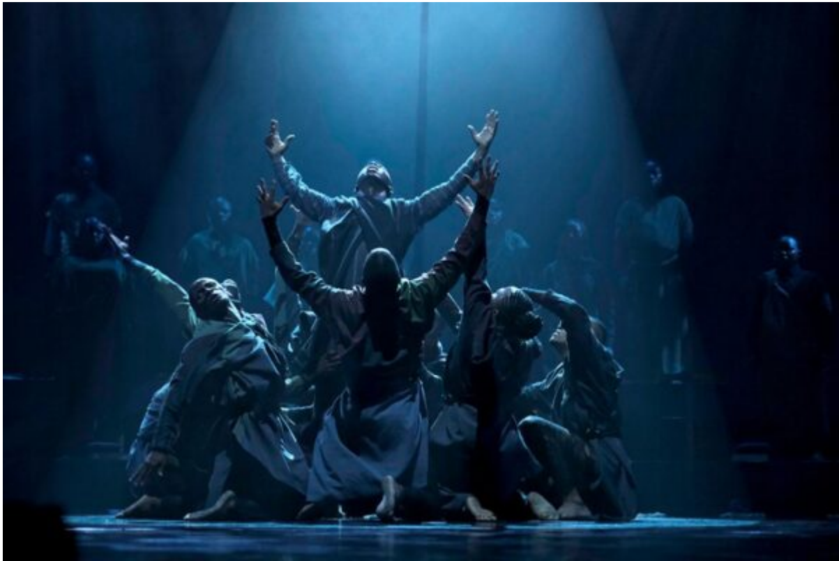
Vuyani Dance Theatre in Gregory Maqoma's "Cion."

D.C. drew rave reviews for Maqoma's concept and his capture of individual and collective grief and resilience. Also, reviews heaped praise on the powerful dancers of Vuyani Dance Theatre , seamlessly shifting from traditional African dance to contemporary moves. Sadly there's only one show on a very busy dance weekend. UCLA Royce Hall, 10745 Dickson Ct., Westwood; Sat., Sept. 21, 8 pm, $42.08 – $63.37. CAP UCLA .