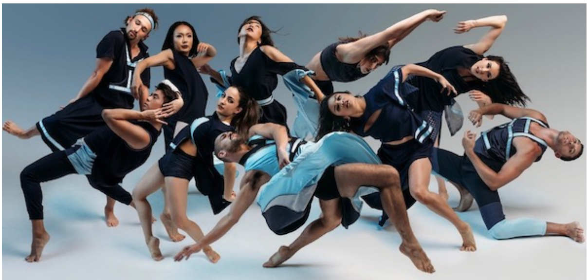
Entity Dance.