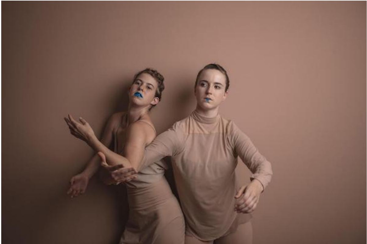
ate9 dANCE cOMPANY in “Pierrot Lunaire.”

Hollywood; Sat.-Sun., 8 p.m., $49-$90. The Ford