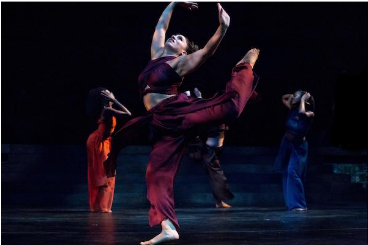
Viver Brasil.