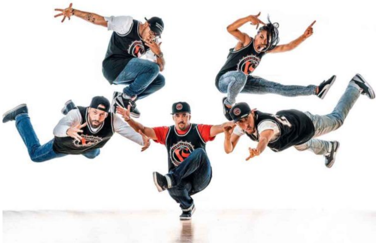
Versa Style Dance Company.

An al fresco stage and music from the Motor City fuel Box of Hope , the high-energy hip-hop dance theater production from Versa-Style Dance Company . The aplomb and enthusiasm of these accomplished dancers bring new life to familiar Motown hits and at the same time deftly underscore issues of economic and racial oppression that Motown artists often included as subtext, and sadly remain topical. Kudos to the Wallis as it continues to present important LA dance troupes in this major venue. Outdoor Stage at the Wallis Annenberg Center for the Performing Arts, 9390 N. Santa Monica Blvd., Beverly Hills; Thurs.-Sat., Aug. 19-21, 8 p.m., $35. Details on Covid-19 safety protocols and tickets at The Wallis .