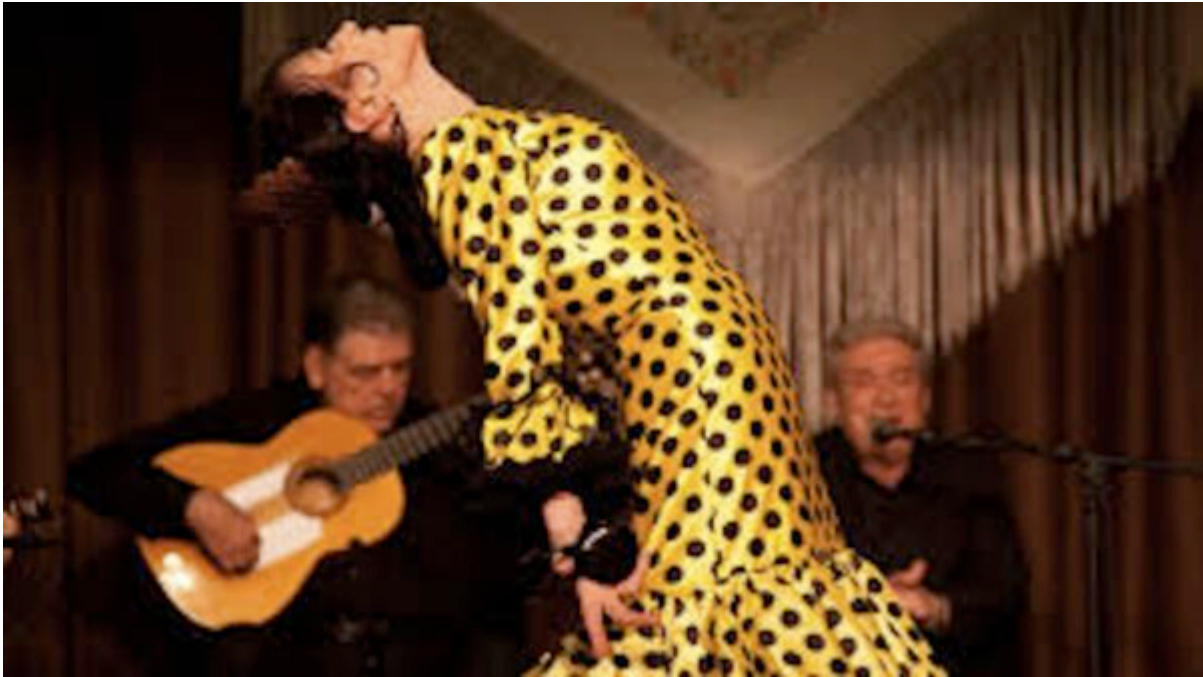
Flamenco Alhambra.