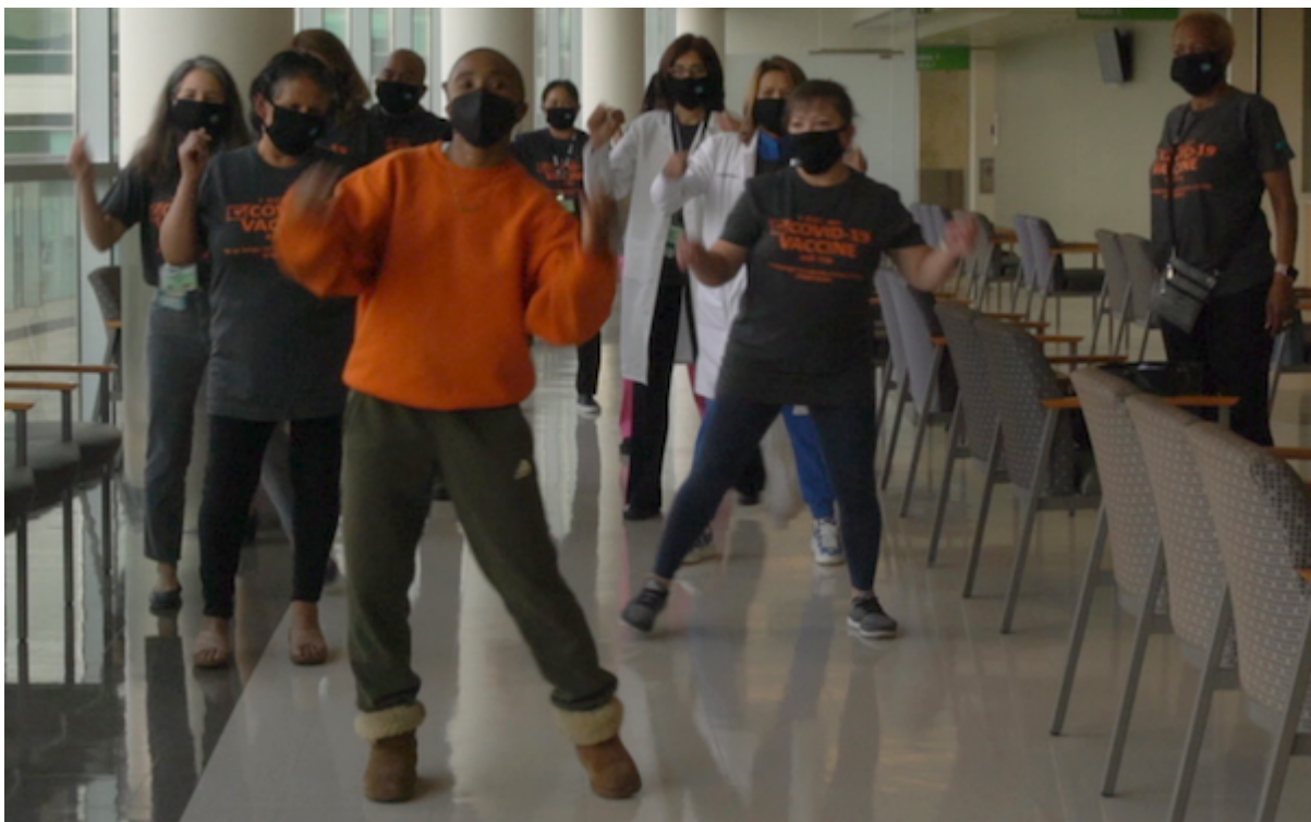
Heidi Duckler Dance.