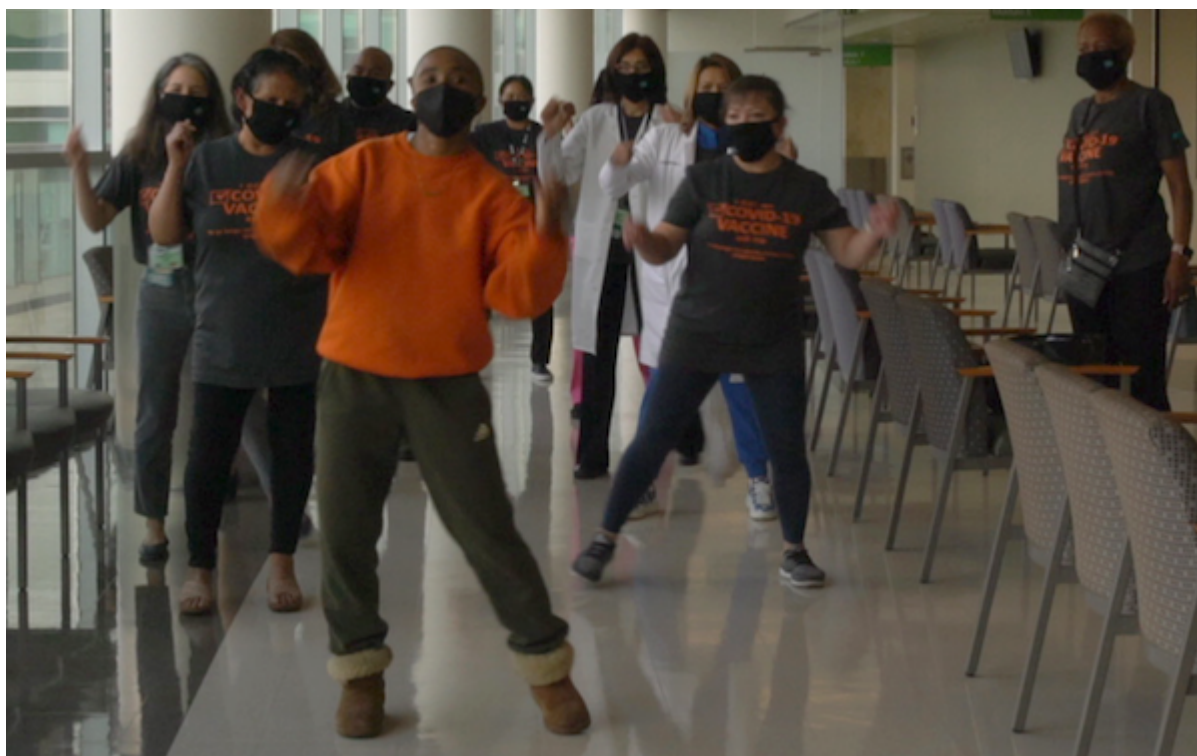
Heidi Duckler Dance.

Among the innovative Covid-19 vaccination efforts, Martin Luther King, Jr. Community Hospital Campus (MLK) teamed with site specific dance company Heidi Duckler Dance to create a short, public service announcement film Ages Take Action: Give the Vaccine a Shot . The film includes a score produced by the Young Producers Group comprised of LAUSD students enrolled in music production classes. The video continues HDD's ongoing partnership with MLK and its Watts/Willowbrook neighborhood. The video will be part of community outreach efforts by hospital personnel and other health professionals to disseminate information about the vaccination effort and address the disproportionate pandemic toll on BIPOC communities. The film receives its debut public screening along with a panel discussion with medical professionals. At the Watts Labor Community Action Committee, 10950 S Central Ave, Watts-Willowbrook; Thurs., July 29, 7 p.m. free with reservation at Heidi Duckler and continues online on Vimeo .