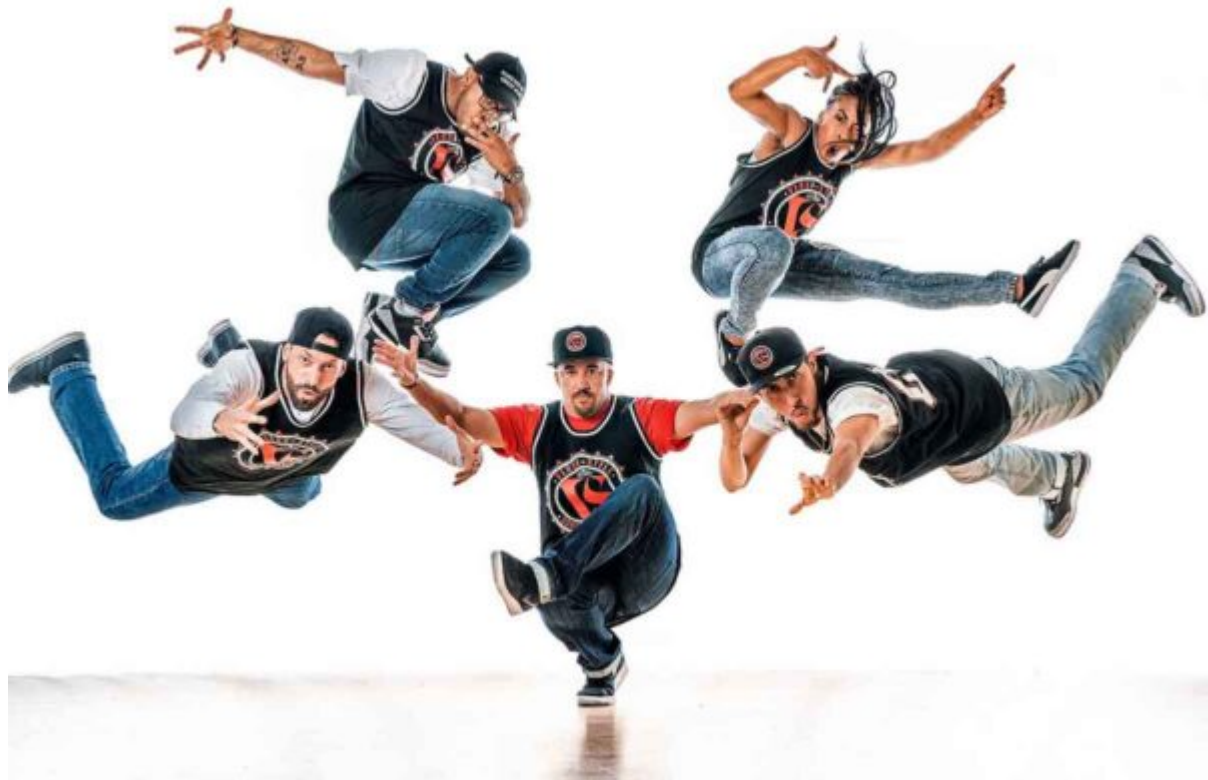
Versa Style Dance Company.

An al fresco stage and music from the Motor City fuel Box of Hope , the high-energy hip-hop dance theater production from Versa-Style Dance Company . The aplomb and enthusiasm of these accomplished dancers bring new life to familiar Motown hits and at the same time deftly underscore issues of economic and racial oppression that Motown artists often included as subtext, and sadly remain topical. Kudos to the Wallis as it continues to present important LA dance troupes in this major venue. Outdoor Stage at the Wallis Annenberg Center for the Performing Arts, 9390 N. Santa Monica Blvd., Beverly Hills; Thurs.-Sat., Aug. 19-21, 8 p.m., $35. Details on Covid-19 safety protocols and tickets at The Wallis .