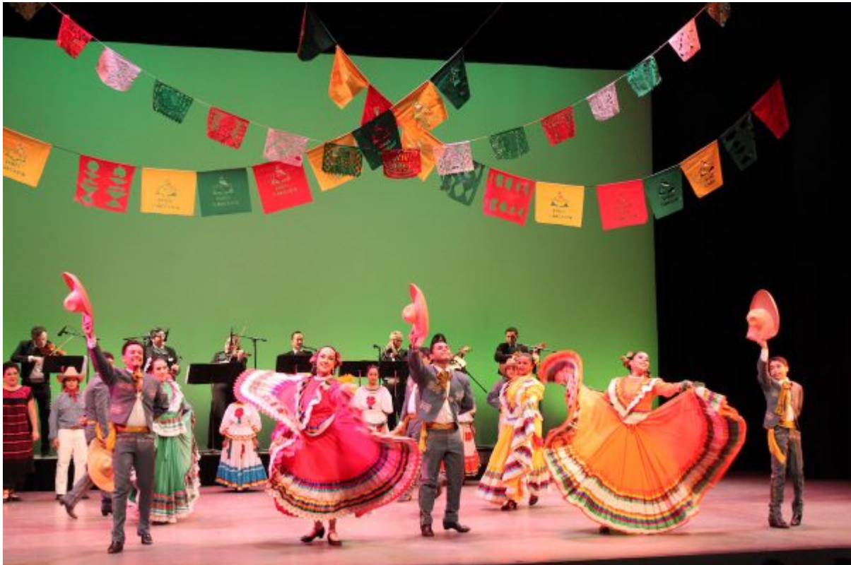
Danza Floricanto/USA. Photo by Frank Sandoval

Danza Floricanto/USA Navidad en el Barrio . Casa del Mexicano, E.L.A; Sat., Dec. 18, Danza Floricanto or 213-466-2611.