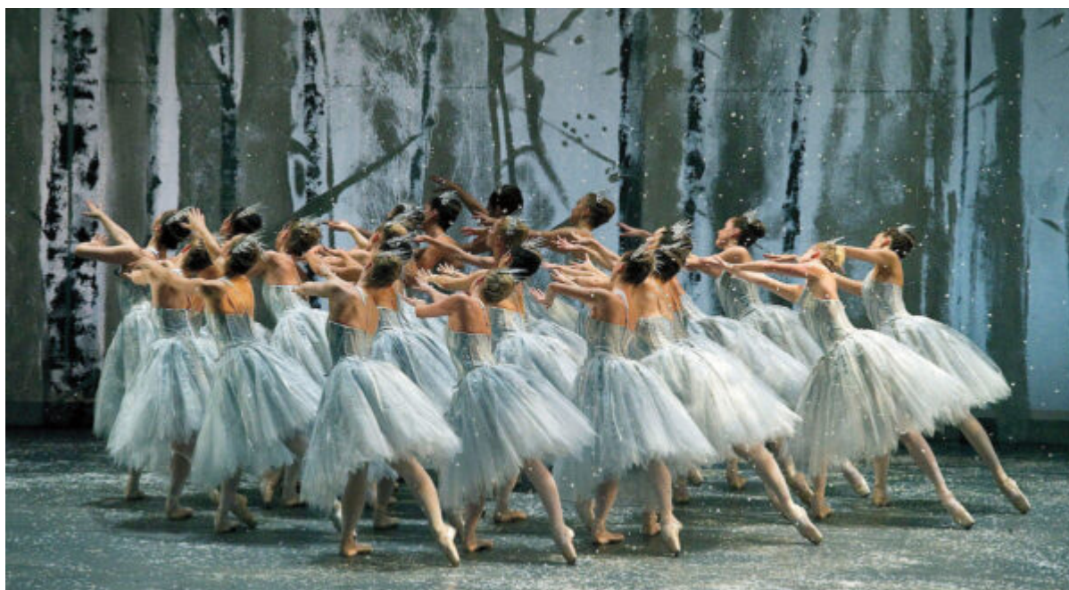
American Ballet Theatre.