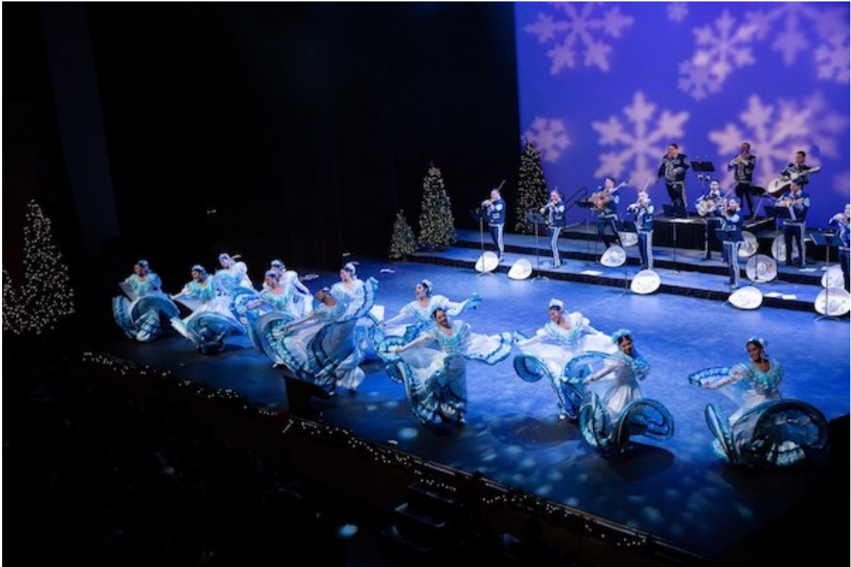
Ballet Folklórico de Los Ángeles.