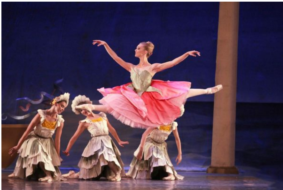
Los Angeles Ballet's "Nutcracker".