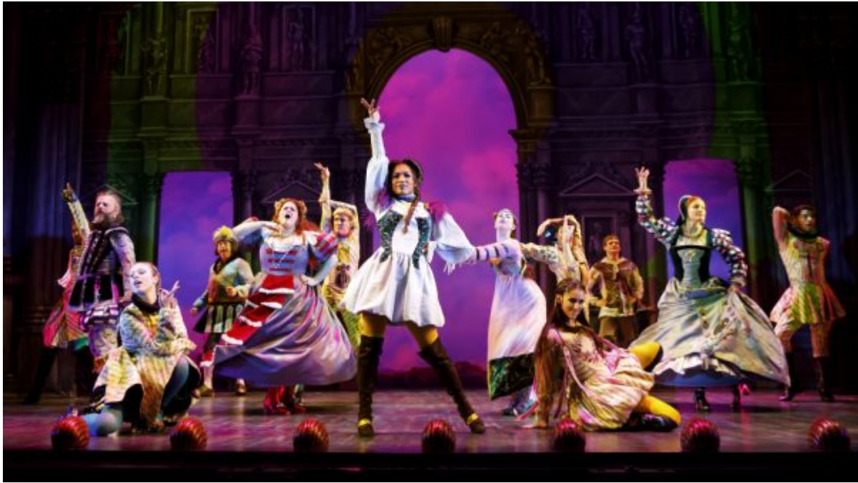
Head Over Heels.

Music of the 1980's LA band The Go-Gos fuels Head Over Heels , a jukebox musical loosely based on The Arcadia by Sir Philip Sidney. The venue reopened with its first live performance filled with dancing on more than just the stage. The theater has been reconfigured to afford the audience a choice of onstage or theater seating as well as a general admission ticket to an open floor area inviting an audience-fueled dance party as part of the performance. Just a few more shows live at Pasadena Playhouse, 39 S. El Molino, Pasadena. Tues.-Sat., 8 pm, Sun., 7 pm, Sat. & Sun., 2 pm, thru Sun., Dec. 12, $30-$106. Info, tickets, and Covid protocols at Pasadena Playhouse .