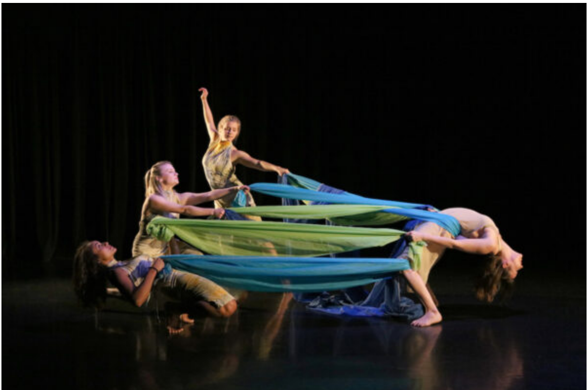
Lineage Dance.

Actors, musicians, and the dancers of Lineage Dance Company take the stage in the Third Annual Lineage Follies . Performers include individuals with neurological diseases and the evening includes a panel with several neurology experts. Lineage Studios, 920 E. Mountain St., Pasadena; Sun., Dec. 12, 5 pm, $10. Info, tickets & Covid protocols at Lineage Dance Company .