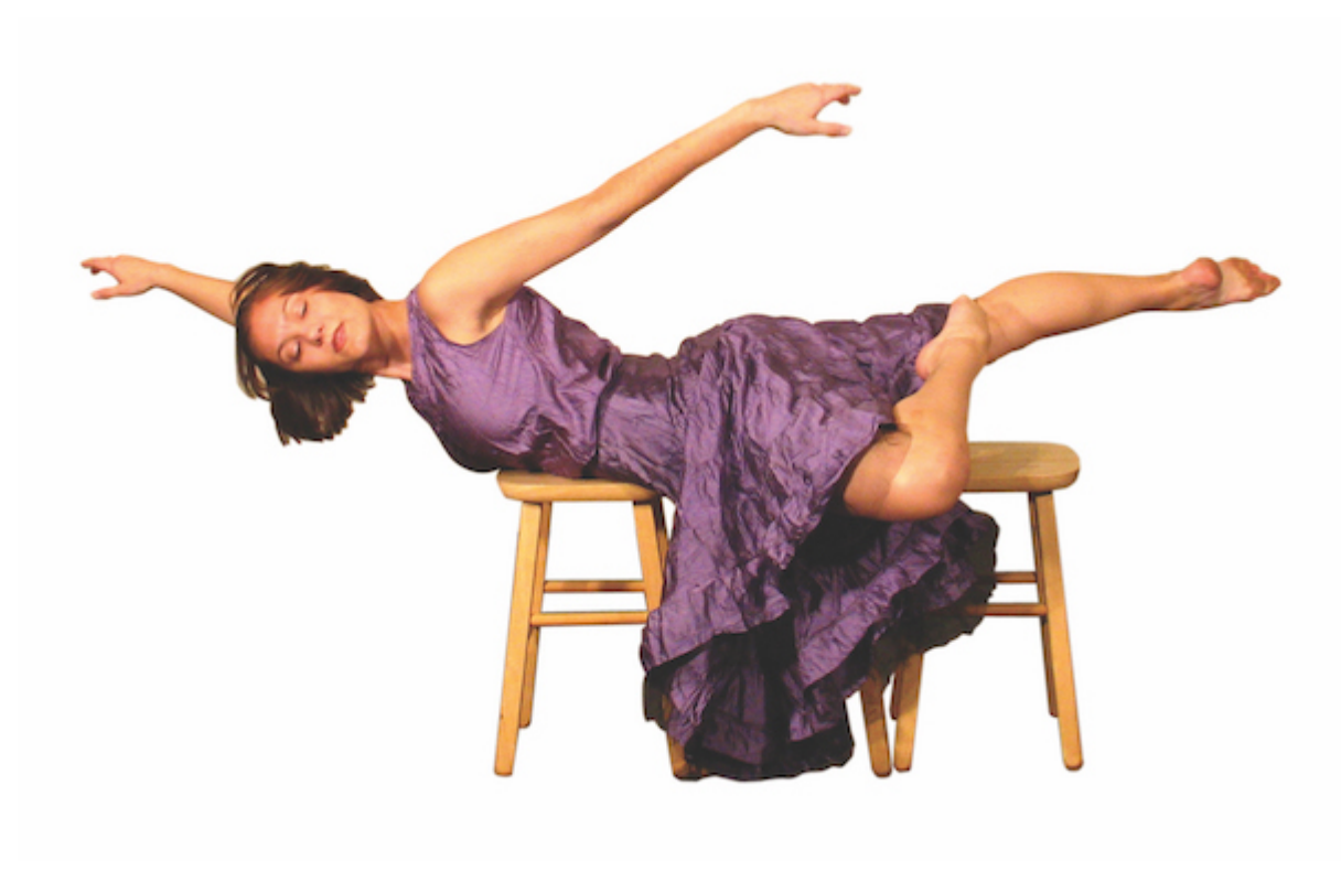
Benita Bike's DanceArt.