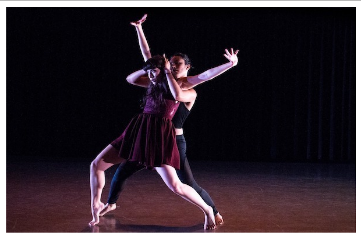
BlakTinx 2022.