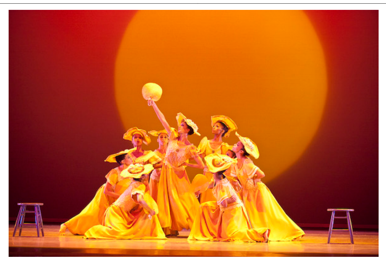
Alvin Ailey American Dance Theater in "Revelations."