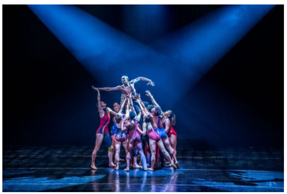
Complexions Contemporary Ballet in "Stardust".

two venues. The initial shows offer the west coast premiere of Rhoden's Snatched Back From the Edges along with Stardust , the choreographer's tribute to pop star David Bowie. The opening show includes a post-performance discussion with the artists. Later this month, the company moves to Orange County with a program that includes Stardust and a work set to Bach's music. At Wallis Annenberg Center for the Performing Arts, Bram Goldsmith Theater, 9390 N. Santa Monica Blvd., Beverly Hills; Thurs.-Sat., April 14-16, 7:30pm, $39-$99. The Wallis. Also at Irvine Barclay Theatre, 4242 Campus Dr., Irvine; Fri., April 29, 8 pm, $30-$130. The Barclay.