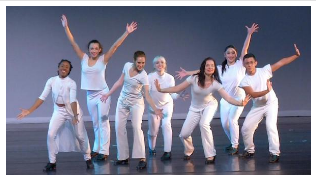
Tap Dance Widows Club. Photo courtesy of Louise Reichlin