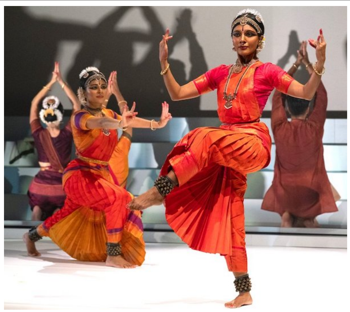
Ragamala Dance Company.