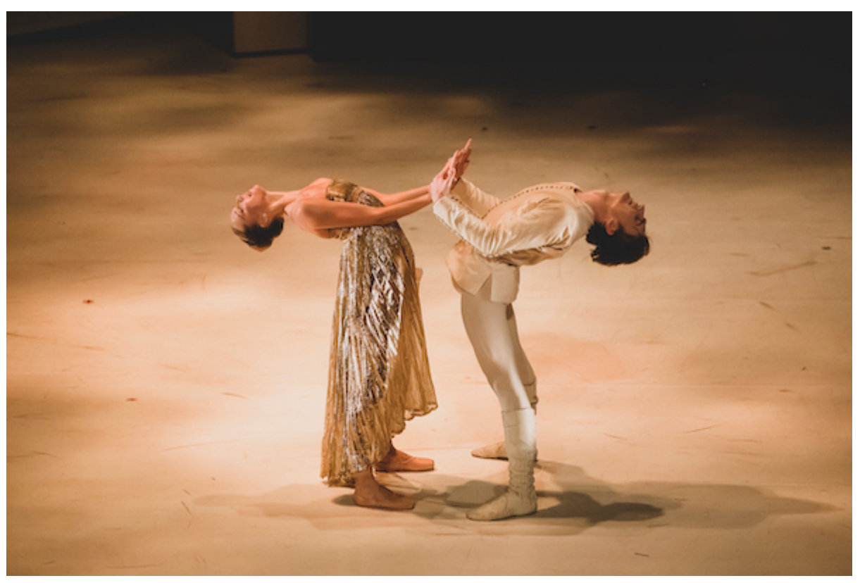
Les Ballets de Monte-Carlo.

Les Ballets de Monte-Carlo – Romeo & Juliet at Segerstrom Center for the Arts, 600 Town Center Dr., Costa Mesa; Fri., April 15, 7:30pm, Sat., April 16, 2 & 7:30pm, Sun., April 17, 1pm, $29-$99. SCFTA.