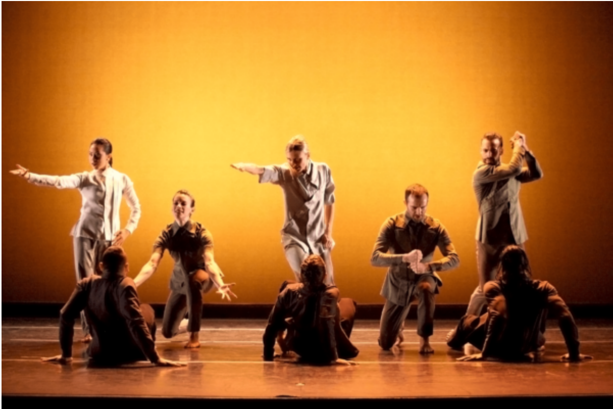
BODYTRAFFIC. Photo courtesy of the artists