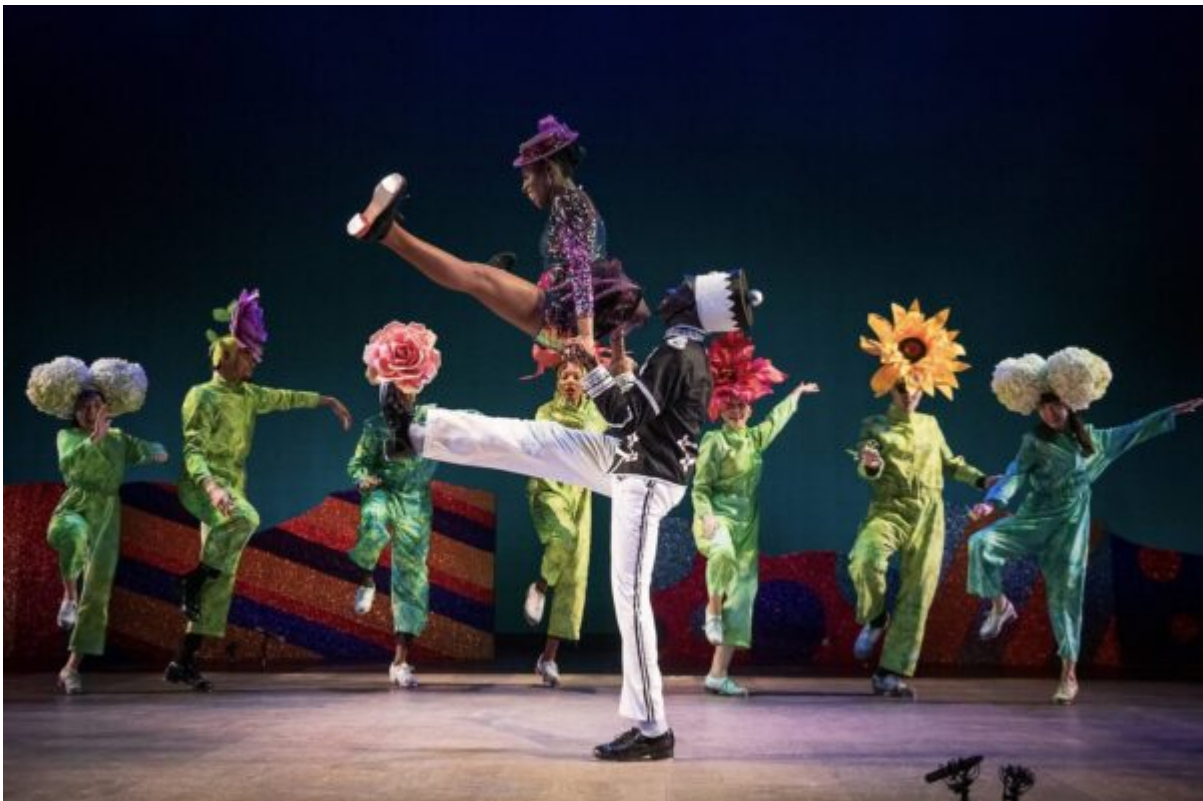
Dorrance Dance.

Bringing a tap dance version, Dorrance Dance employs the Duke Ellington/Billy Strayhorn arrangement of the familiar Tchaikovsky tunes in The Nutcracker Suite . The Soraya, Cal State University Northridge, 18111 Nordhoff St., Northridge; Thurs., Dec. 12, 8 pm, $48-$118. The Soraya .