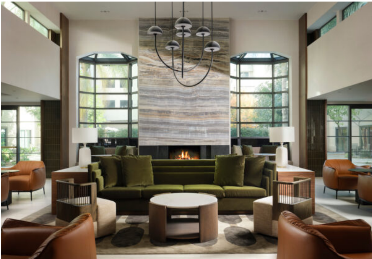
The lobby of Courtyard by Marriott in Old Town Pasadena.

After checking in to the newly remodeled Courtyard by Marriott , a few blocks north of Colorado Boulevard, I took a short orientation walk. The architecture of late 19 th and early 20 th century buildings line every block: Beaux-Arts, Art Deco, Mission Revival, and Italianate. Each building tells a story.