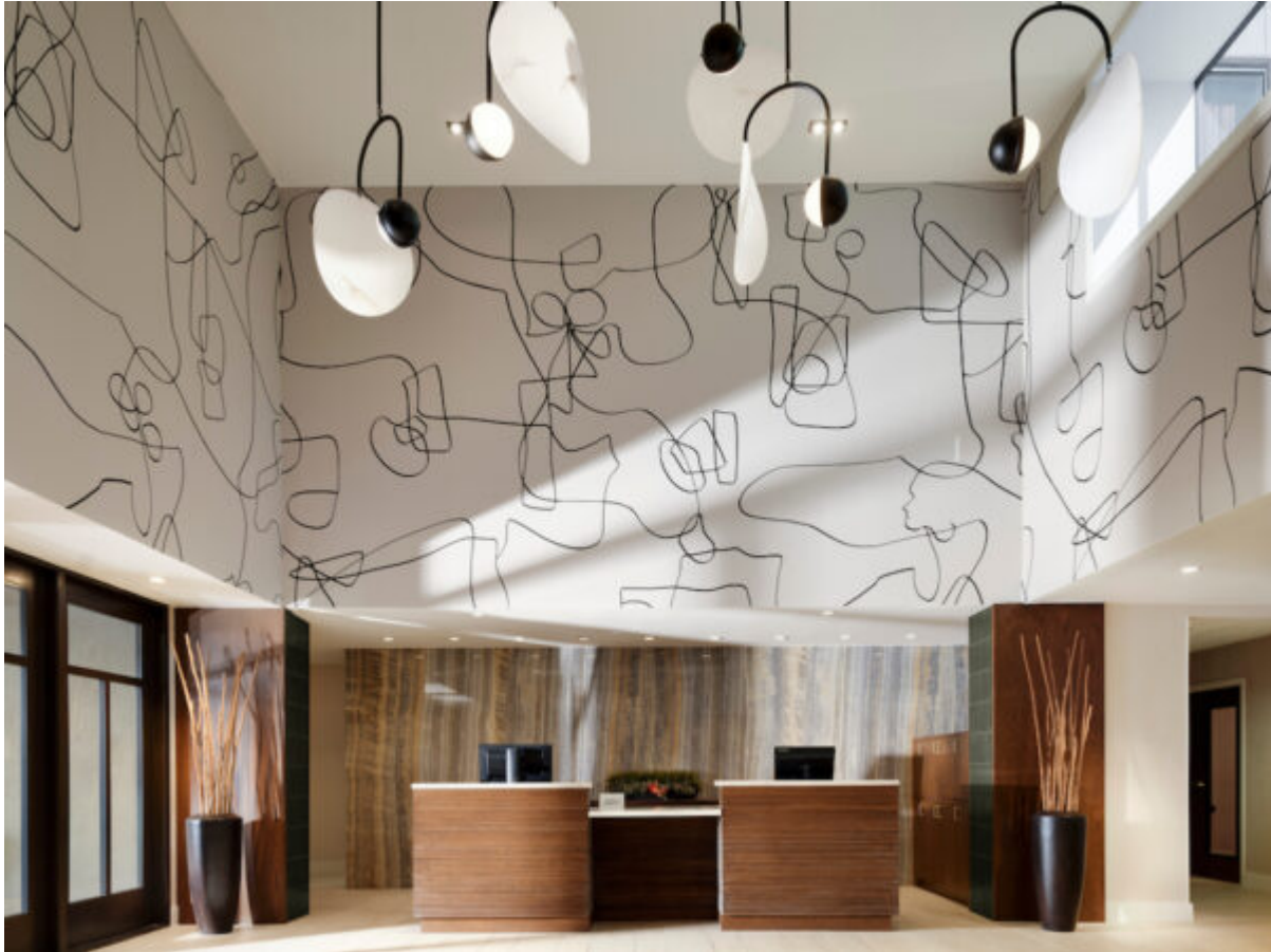
The modernist lobby in Pasadena's Courtyard by Marriott.

Upon entering, the Marriott front desk lobby hits you like a modernist art installation. Abstract art covers the upper walls—a maze of black scribbles, no doubt inspired by artist Cy Twombly who created calligraphic works drawing on graffiti traditions. Black and white lights are suspended from the ceiling like mobiles, a nod to Alexander Calder's kinetic mobile sculptures.