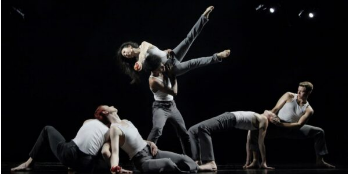
Invertigo Dance Theatre.