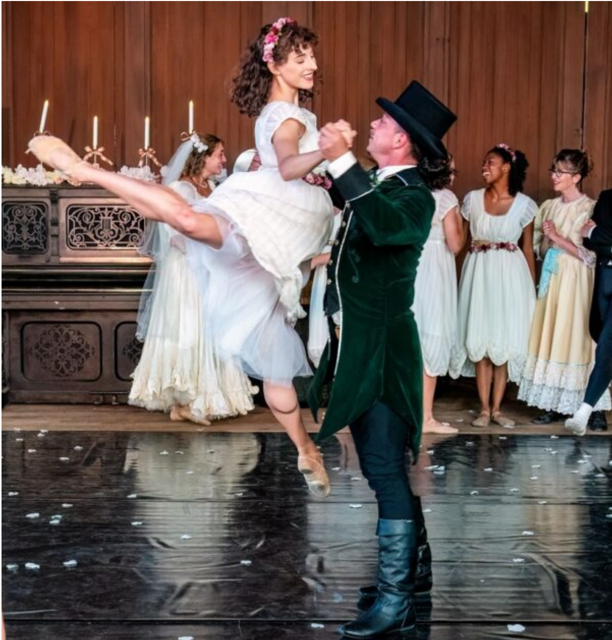
Little Women Ballet.