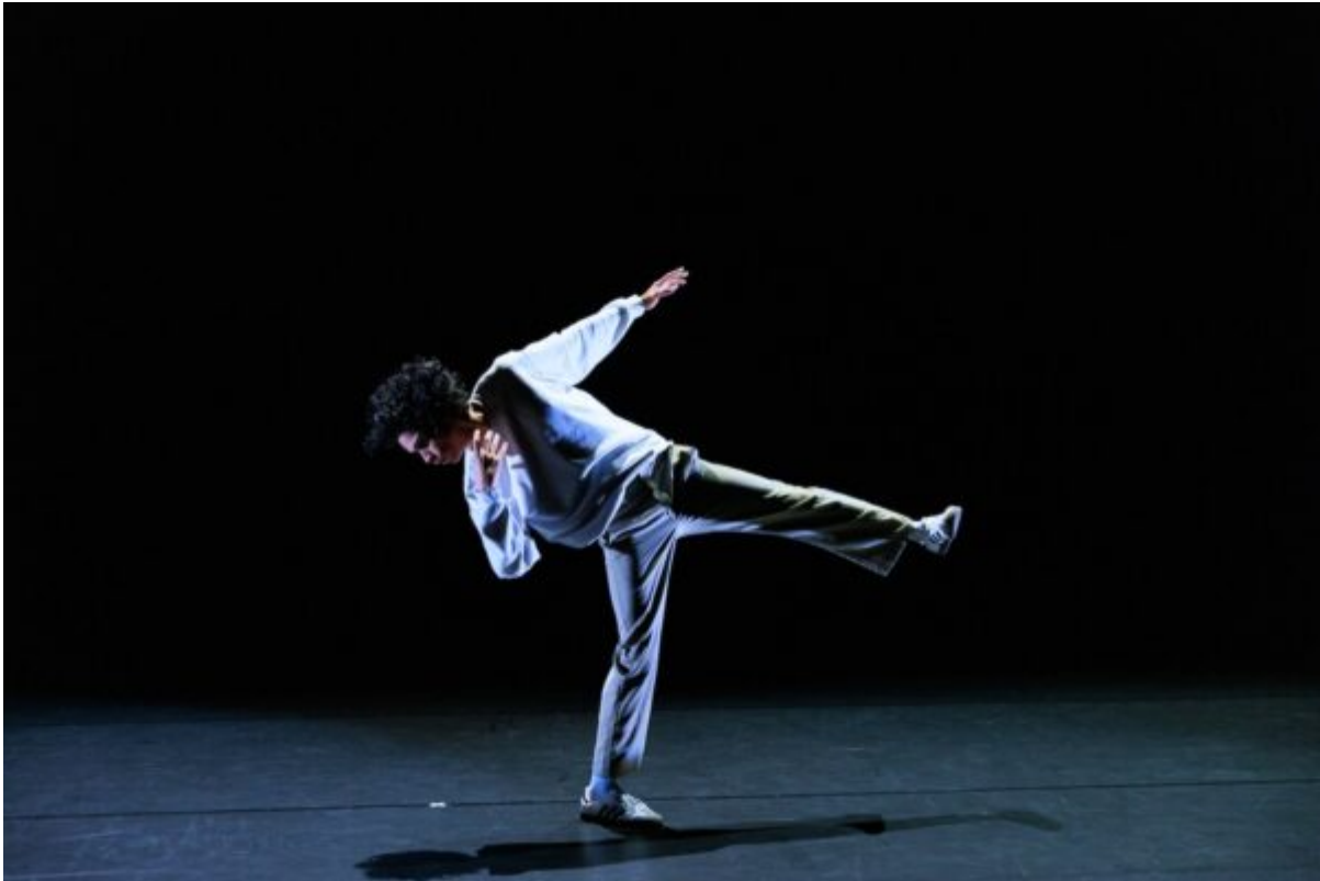
CalArts Sharon Disney Lund School of Dance.