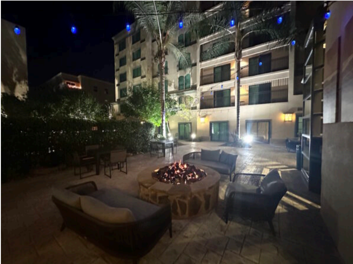
The Courtyard by Marriott indeed has a courtyard—with a fire pit, pool, sitting areas, and a Jacuzzi.

The U-shaped Marriott has a modest gym, about 6,000 square feet of meeting space, and an outdoor courtyard with sitting areas. The courtyard includes a fire pit, pool, and Jacuzzi. I recommend rooms around the first-level pool, which opens into the courtyard. If you stay on an upper north-facing floor, however, you'll get a terrific view of one of the oldest churches in Los Angeles County: St. Andrew's Catholic Church . Its striking Romanesque Revival campanile bell tower, built in 1927, was modeled after the Basilica of St. Sabina in Rome.