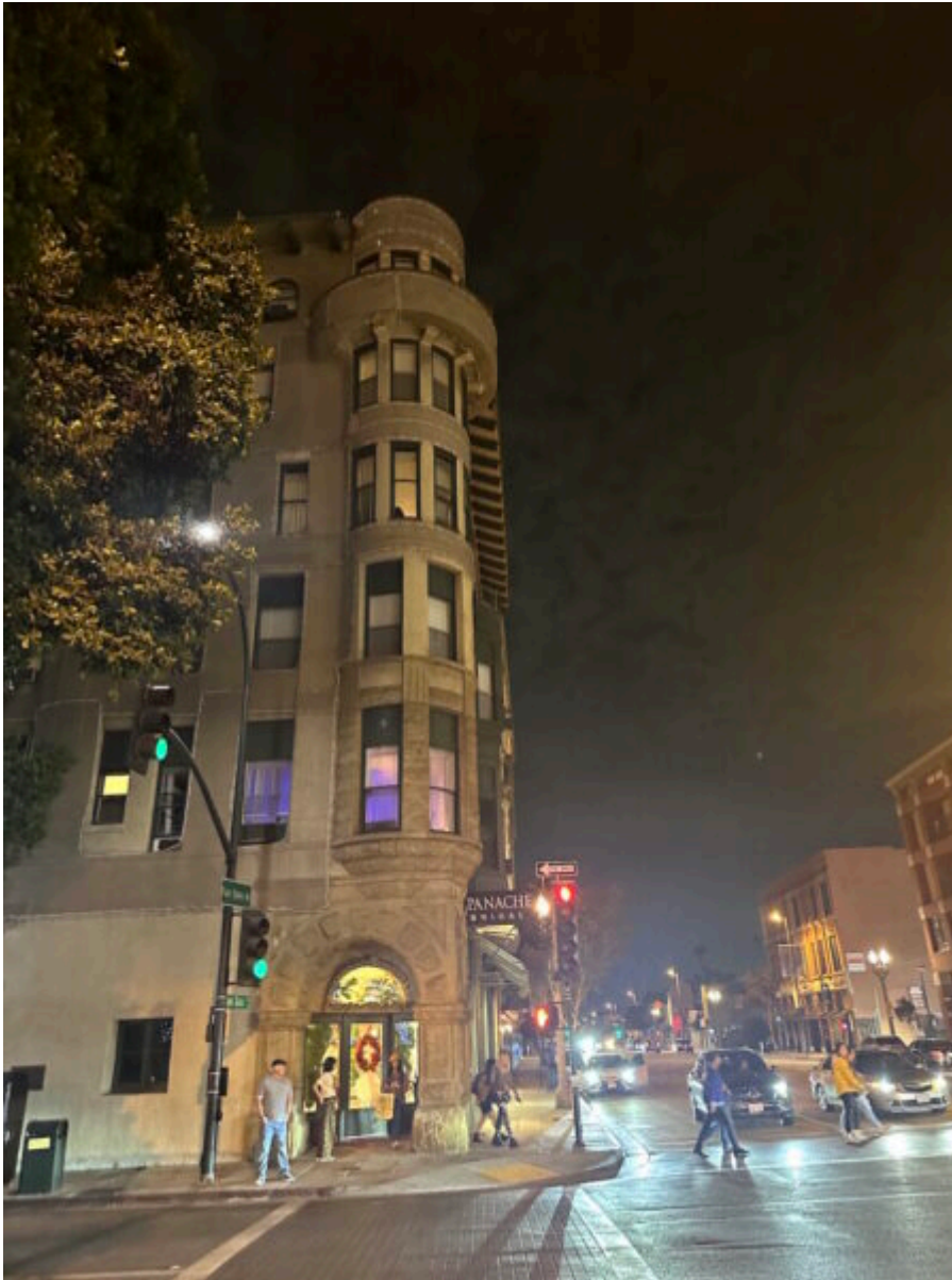
Old Town Pasadena's Wooster Building.

Nearby, on Colorado Boulevard, I happened on the Dodsworth Building constructed in 1902. Designed by Joseph Blick, the building's upper scrollwork and inset medallions are striking. When Colorado was widened around 1930, Walter Folland redesigned it, according to one account . He also altered the Bear Building nearby—its ornate arches and carved heads soaring above modern shops.