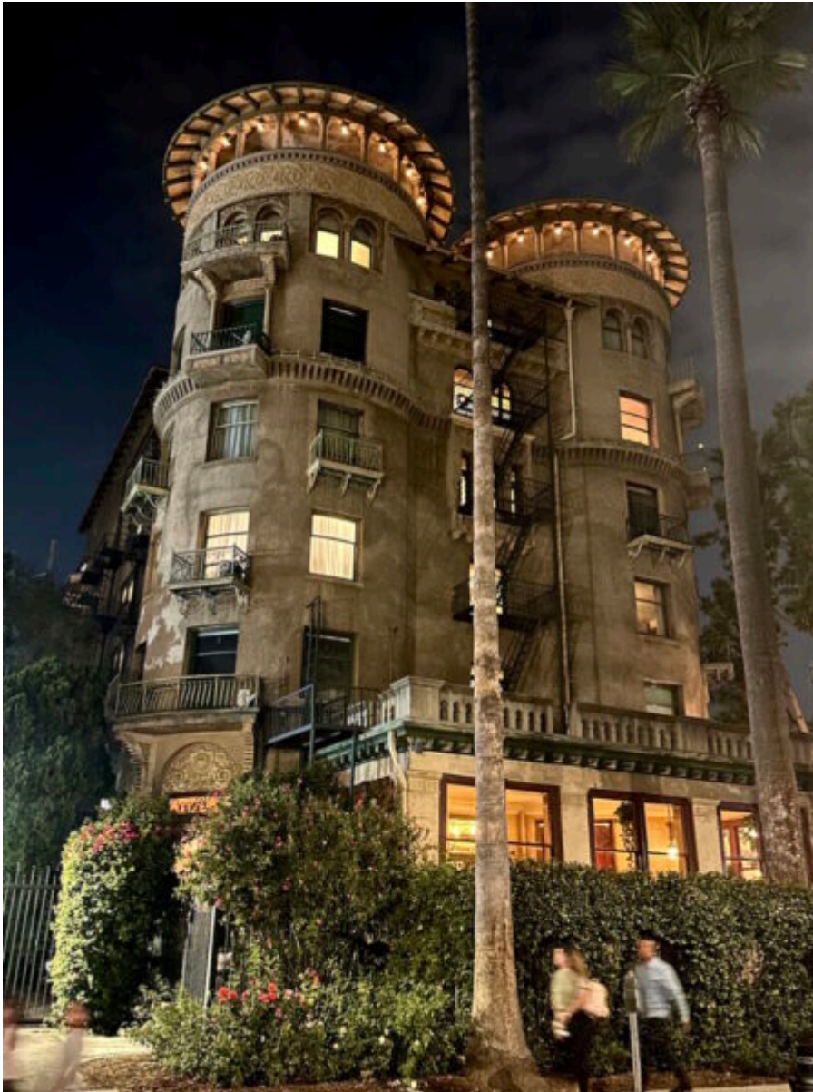
The towers of Old Town Pasadena's Castle Green.

Walking a block east, I discovered a building that has since been incorporated into the Castle Green complex: the Wooster Building on the corner of Fair Oaks Avenue and Green Street. The 1887 building was built as the home of Throop University , which later became Caltech. The upper stories and roof have been altered, but much of the look from street level remains intact.