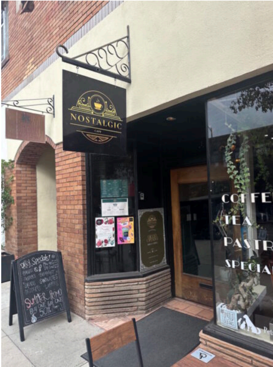
Old Town Pasadena's Nostalgic Cafe.