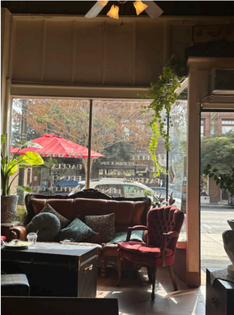
The cozy Nostalgic Cafe interior.