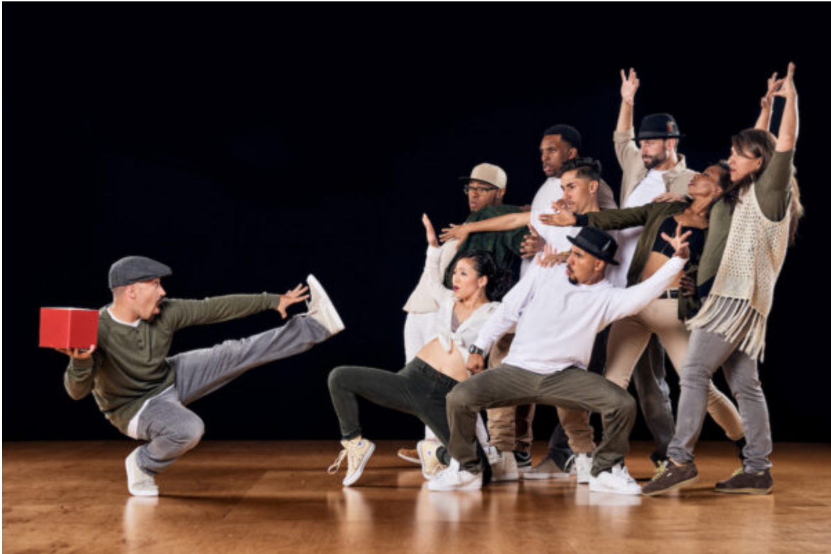
Versa Style Dance Company.

For 20 years, Versa Style Street Dance Company has been a bastion for hip hop and street dance culture, performance, preservation, and educating generations of youth. Dancing Our Legacy , the 20th anniversary performance and gala, benefits the company's Hip Hop Dance Festival coming on May 23 to 25. Join the party. Inner City Arts, 720 Kohler St., downtown Arts District; Sat., Dec. 7, 1-3 pm, $50 and up. Versa Style .