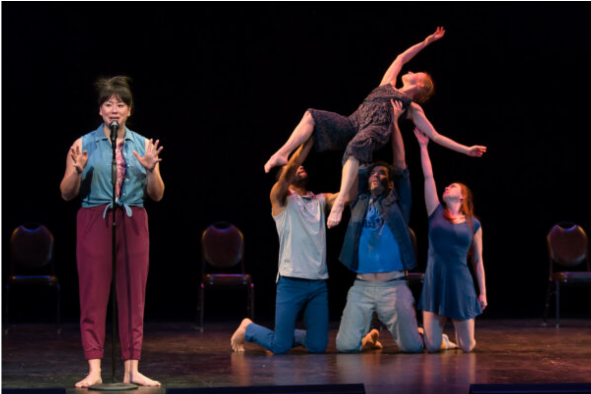
Mixed eMotion Theatrix (MeMT).