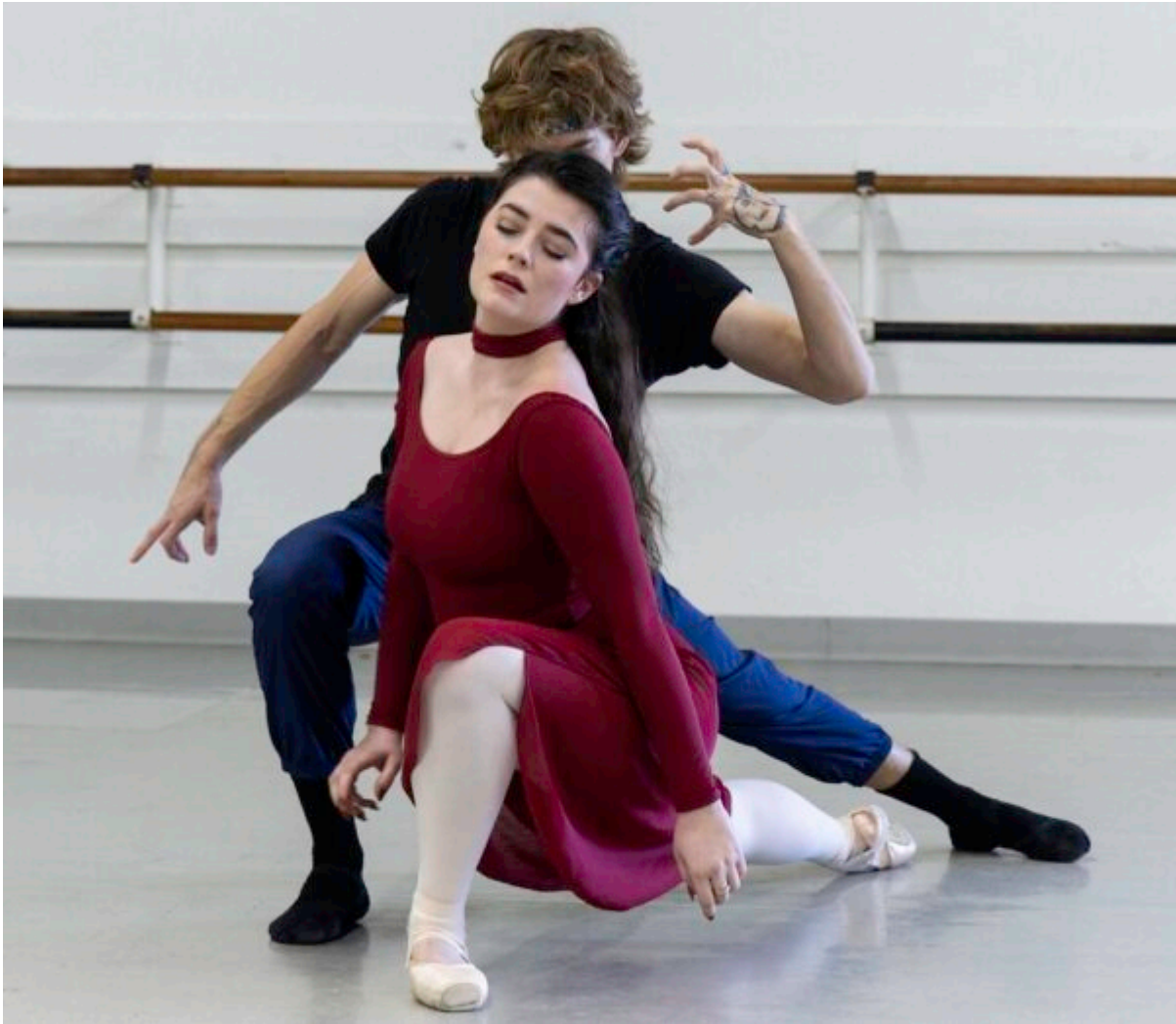
The Realm Company. Photo courtesy of the artists